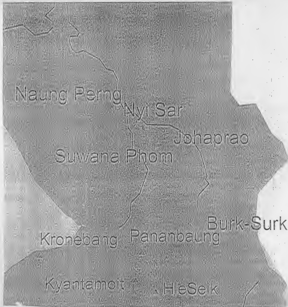
Map of Ye River Resettlement Site (Feb, 2008)