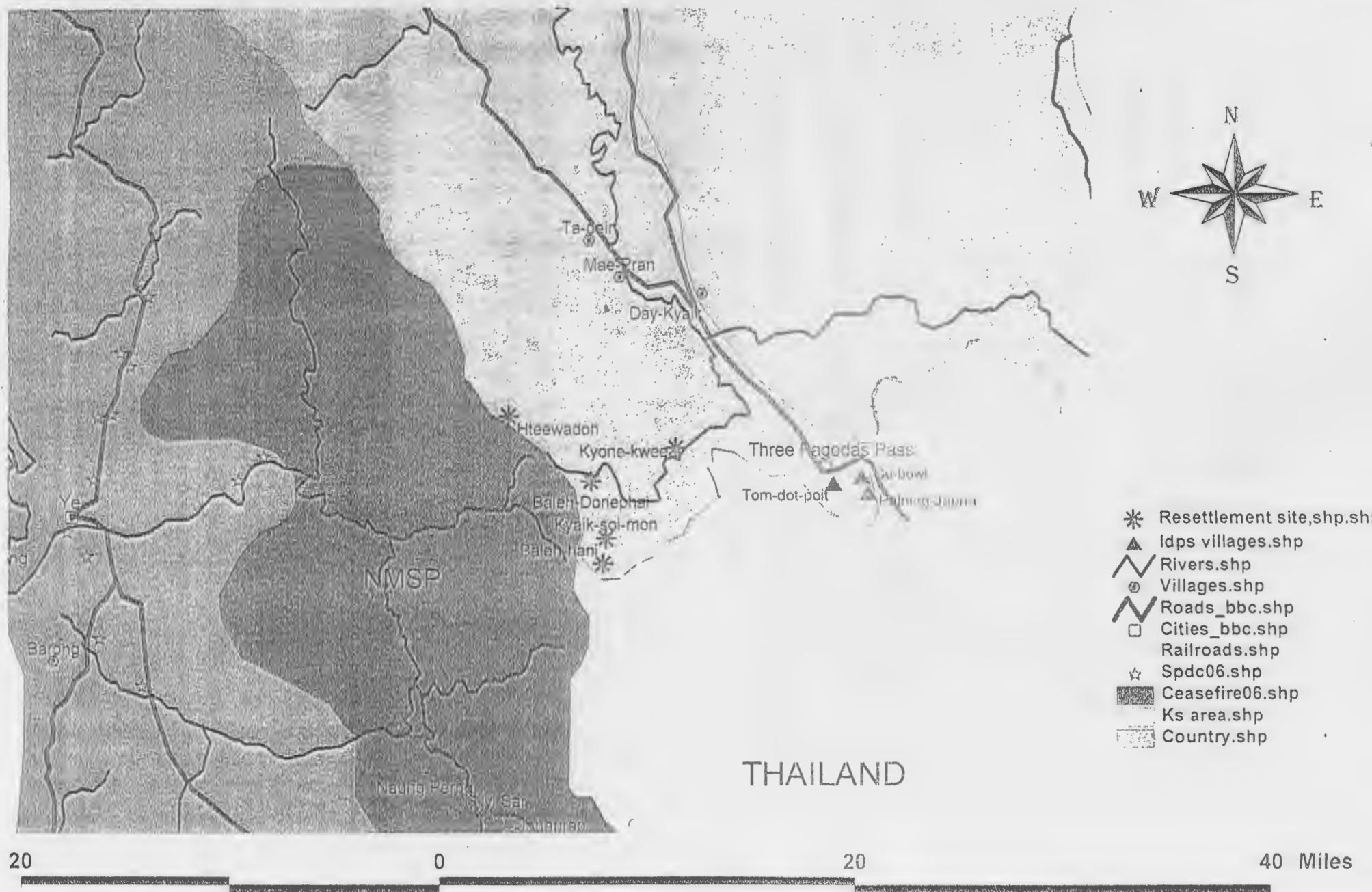
Map of Three Pagoda Pass and Halockhani Resettlement Site (Feb,2008)