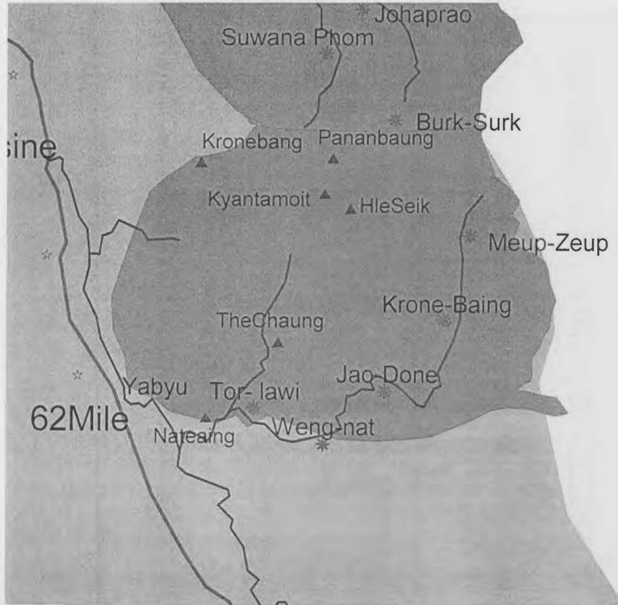
Map of Tavoy District and Tavoy Resettlement Site (Feb, 2008)