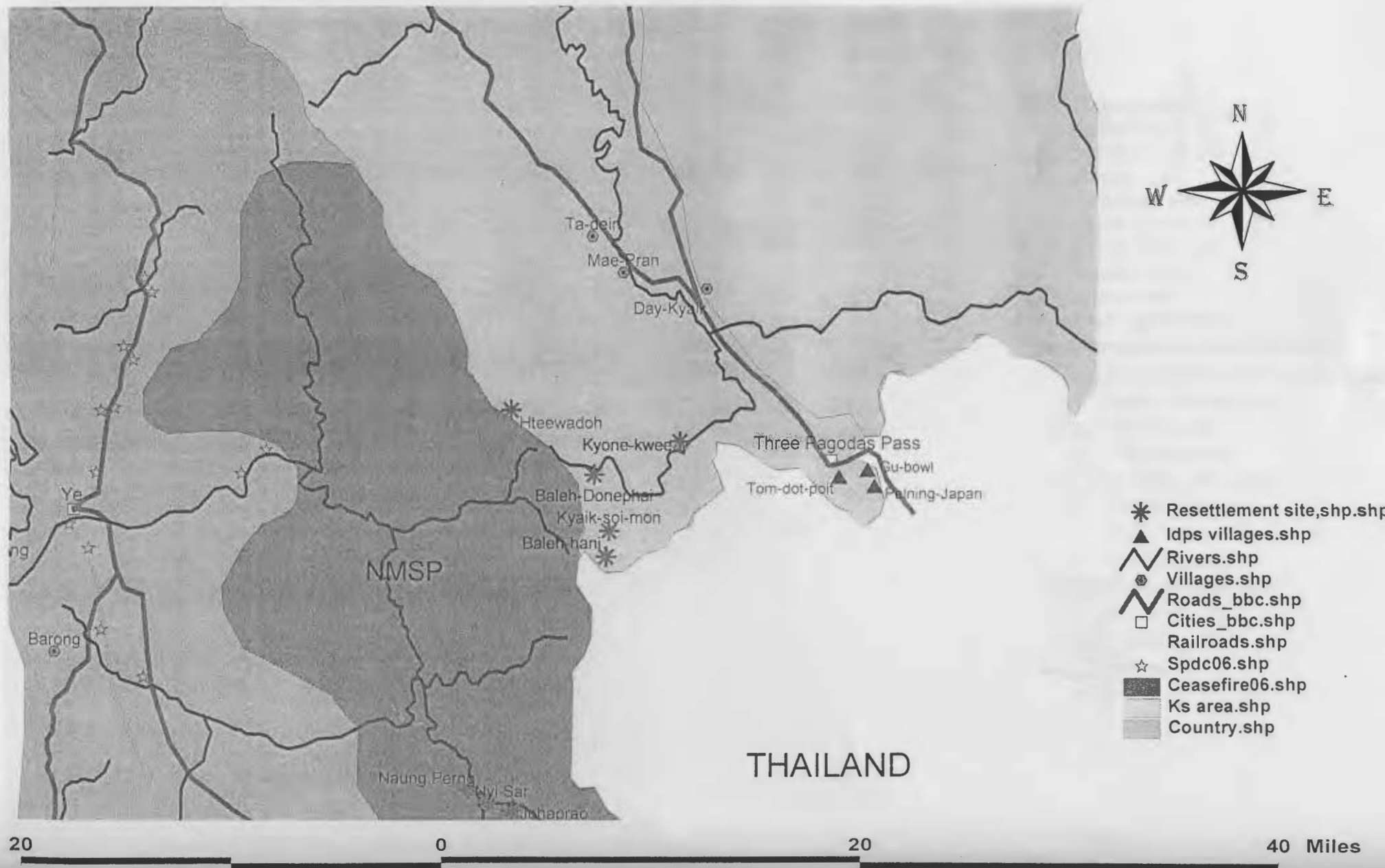
Map of Three Pagoda Pass and Halockhani Resettlement Site (Feb,2008)