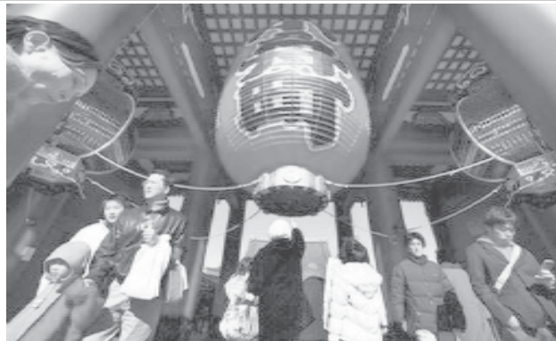
Worshippers walk past the gate of the Asakusa Sensoji temple in downtown Tokyo, Japan, on 28 Dec, 2008.

No. 87/88, Bahosi Complex, Bogyoke Aung San Road, Lanmadaw Township, Yangon, Myanmar. Tel: +95(1) 229791~2, 229794~7 Fax: +95(1) 229753 Mobile: +95 (0)9 5067442, +95 (0)9 80 30 821