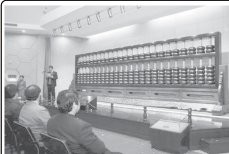
A huge abacus made of sandalwood is displayed at China Abacuses Museum in Nantong, east China’s Jiangsu Province. The abacus, 781 centimetres in length and 1.81 centimetres in height, has been on display here since Saturday.