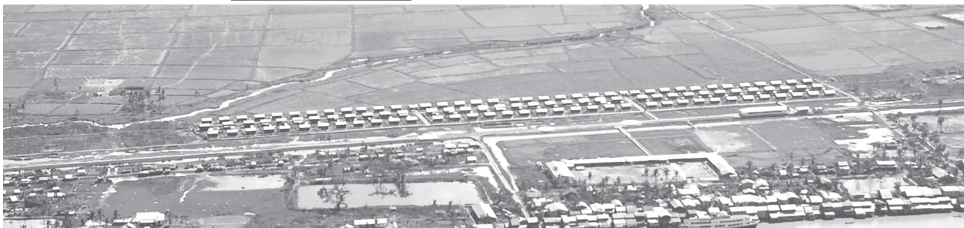
A bird's eye view of houses built in Setsan Village, Bogale Township.