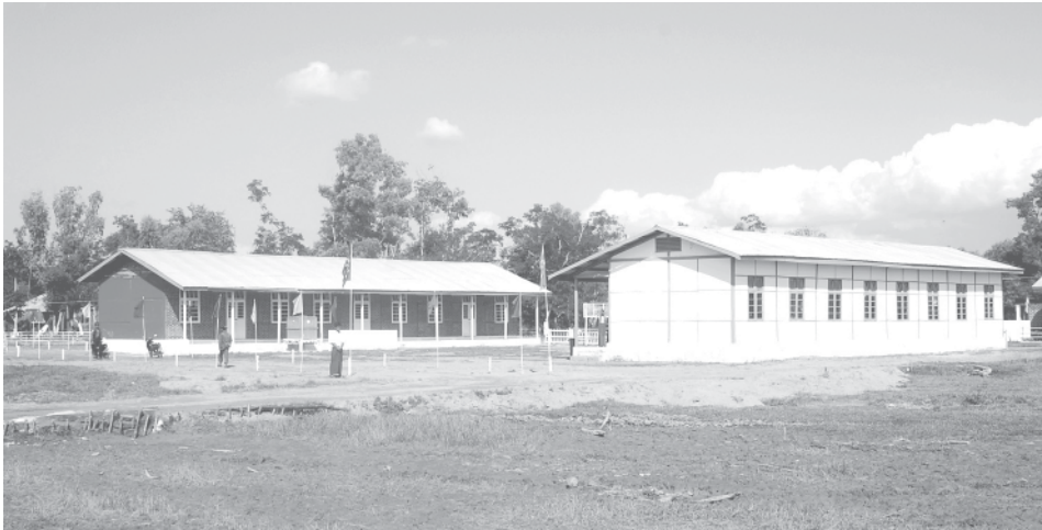
New buildings of primary school in Kadonkani Village, Bogale Township.