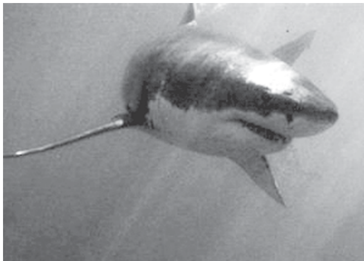
File photo shows a White Pointer shark. Australian authorities have said they will not attempt to hunt down a shark believed to have killed a swimmer, as reports said the victim would not have wanted the predator to die.