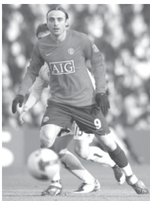
Dimitar Berbatov Germany, he did help to lead Bayer to the Champions League final. After five years, the forward tried his luck in the Premiership where he joined Tottenham Hotspur. With 27 goals in 70 games, he eventually attracted the interest of Manchester United this summer.