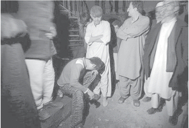
A young Afghan man (C) cries after a rocket was fired into his house in Kabul. A suicide car bomber killed five people at a police checkpoint in southern Afghanistan Saturday and a rocket attack in the capital killed three civilians, officials said.—INTERNET

The Tamil Tigers have been fighting for an independent state for ethnic minority Tamils since 1983, after suffering decades of marginalization by successive governments controlled by the Sinhalese majority. The conflict has killed more than 70,000 people.—Internet