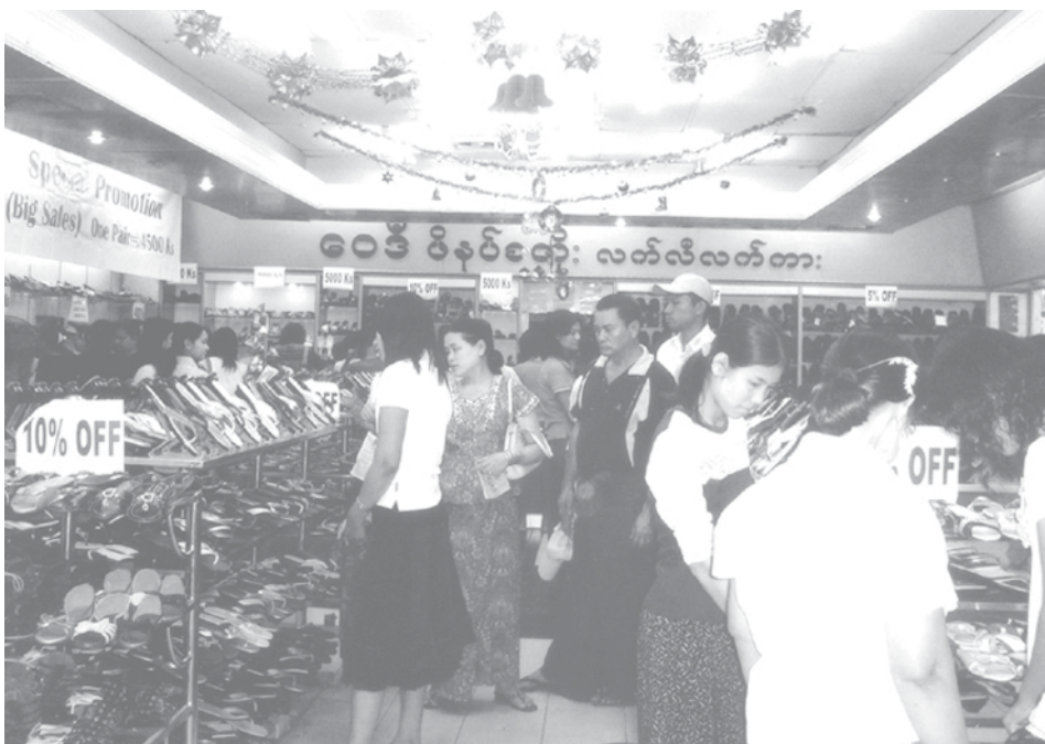
Sales promotion of Wai Di shoe store in progress.