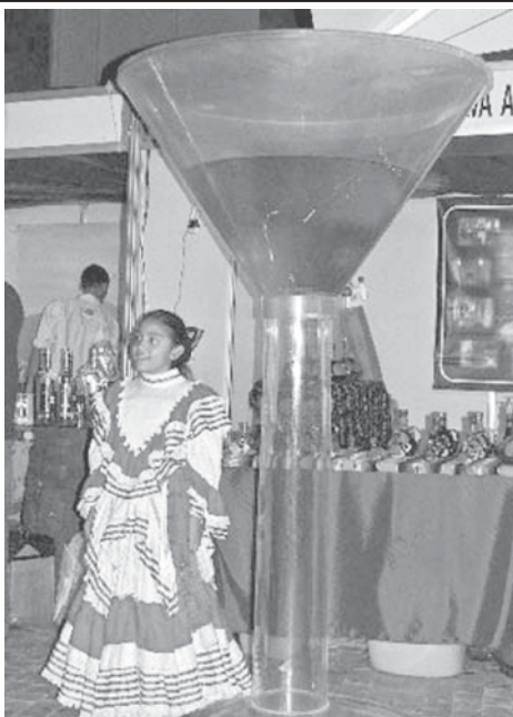
A girl in a typical dress stands next to a giant cup containing the typical Mexican cocktail “margarita”, made with 200 liters of tequila, lemon and sugar, in Los Cabos, Baja California state, northern Mexico, during an attempt to break a Guinness record of the biggest margarita in the world.