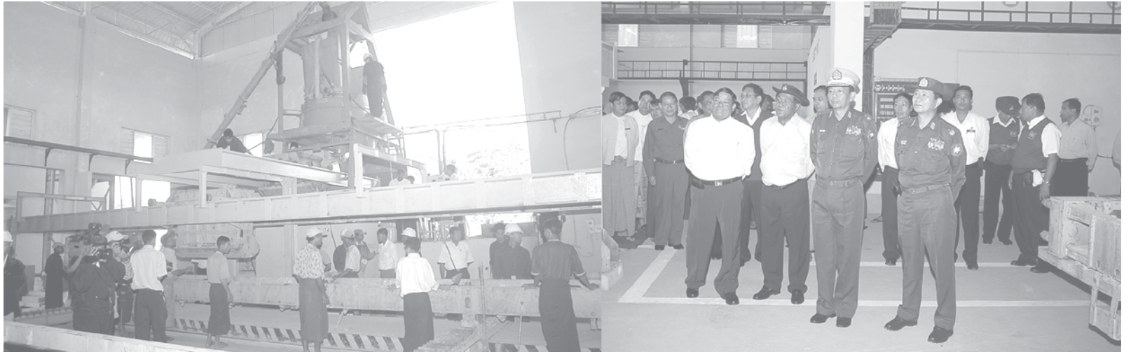
Commander Maj-Gen Thet Naing Win and Minister Maj-Gen Aung Min view production process of concrete sleeper factory.—MNA

Also present on the occasion were Deputy Ministers for Rail Transportation Thura U