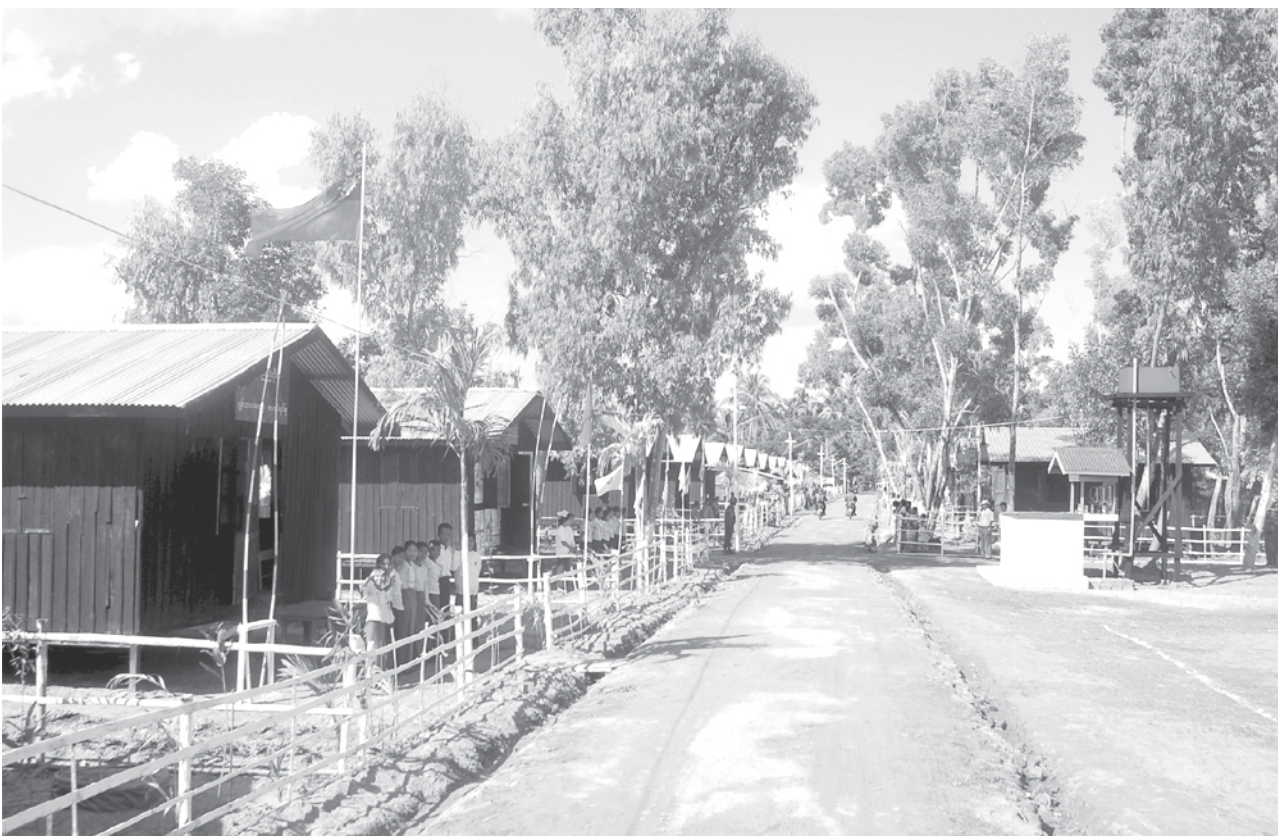
Houses at Kadonkani Village.

clone shelters, establishment of road networks in time in the open season. Storm-hit regional businesses such as agriculture, fishery and salt industry have resumed and the businesses are in the positions that it should be. Therefore, efforts are to be made for business conditions to return to normal, he said. Continuing, he said, the objective is that the storm-hit areas must develop more than the condition before the storm. Rehabilitation and construction and preparedness of natural disaster are the national project and systematic arrangements are to be made, he added. (See page 9)