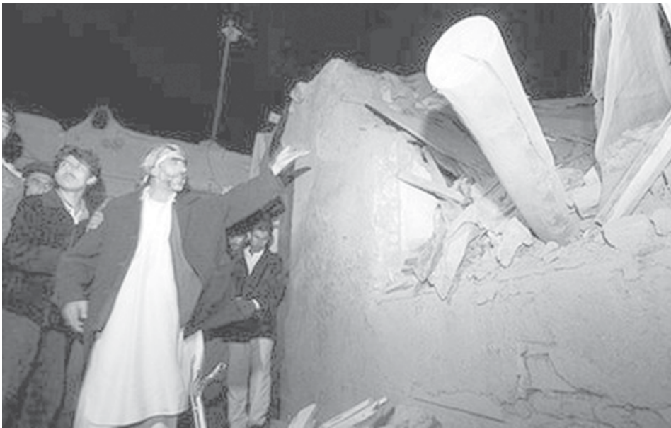
An Afghan man talks in front of the media representative after a rocket was fired into a house in Kabul. A suicide car bomber killed five people at a police checkpoint in southern Afghanistan on Saturday and a rocket attack in the capital killed three civilians, officials said.