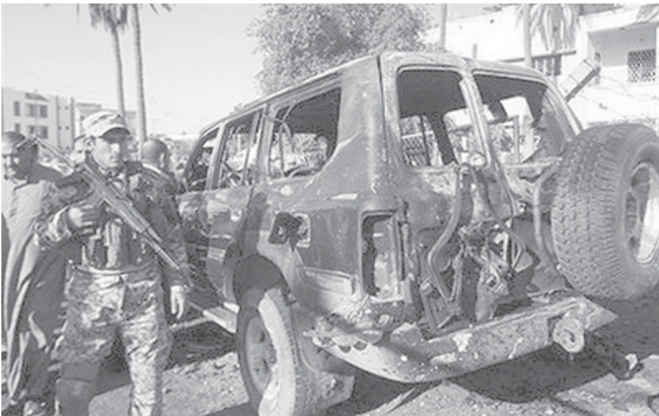
An Iraqi policeman secures the site of a car bomb attack in the Shi'ite neighbourhood of Kadhimiyah in Baghdad. A massive bomb tore through a crowd gathered near a bus station in a Shi'ite neighbourhood of Baghdad on Saturday, killing at least 22 people and wounding 54, security officials said.