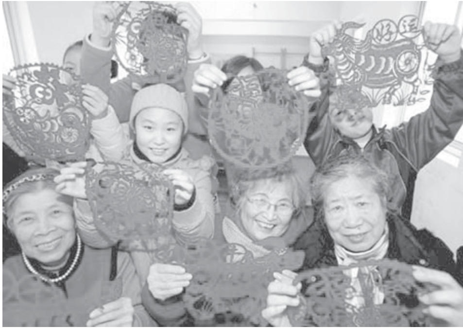
Residents show paper-cuts made by themselves to mark the coming Year of Ox in Chinese lunar calendar, at Siping Street Community in Shenyang, capital of northeast China's Liaoning Province, on 27 Dec, 2008.