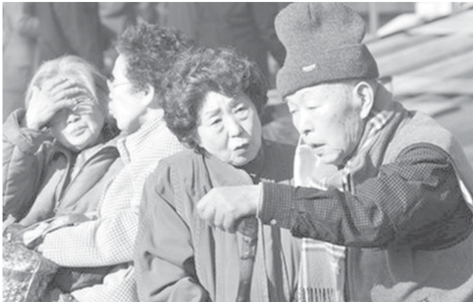
Elderly people chat in Tokyo's Sugamo district. The area's retailers are focusing on the interests and needs of the elderly with shops aimed at an increasingly ageing population where one in five of Japan's 127 million people is 65 or older.—INTERNET