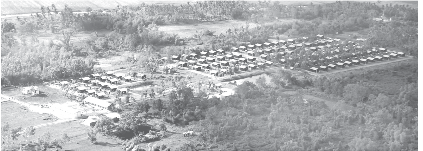
A bird's eye view of houses in Kadonkani Village in Bogale Township.

All-out efforts are to be made for boosting production and improving economy with the combination of natural resources and workforce and harmonious cooperation of the government, the people and