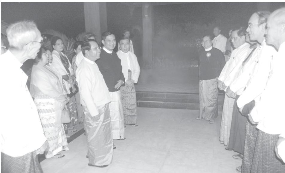
Minister Brig-Gen Kyaw Hsan greets literary award winners at the dinner.

NAY PYI TAW, 28 Dec—Minister for Information Brig-Gen Kyaw Hsan hosted a dinner in honour of life-time achievement literary award and Sarpay Beikman manuscript award winners for 2007 and members of