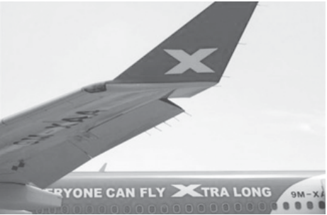
An AirAsia X aircraft at Kuala Lumpur’s international airport. The Malaysian budget airline has said it can weather the storm of a sharply deteriorating global economy and is hiring pilots to expand its routes across Asia.

expand its routes in 2009 into northern India including New Delhi, Amritsar and Mumbai, and to Beijing.