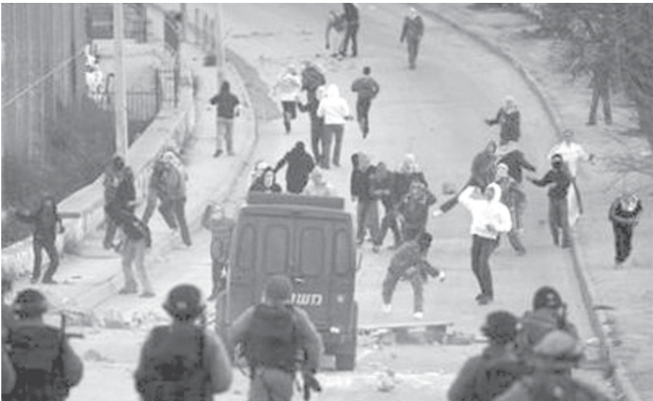
Palestinian youths throw stones towards Israeli border police officers in the village of Issawiya in Arab East Jerusalem in Gaza on 27 Dec, 2008.

treatment at six oncology clinics. Patients were asked about their perceived need for five hospice services and their preferences for continuing cancer treatment, and they were followed for six months or until death. Casarett’s team found that African-American patients had stronger preferences for continuing their cancer treatments as well as greater perceived needs for hospice services — poorer patients wanted more services.—Internet