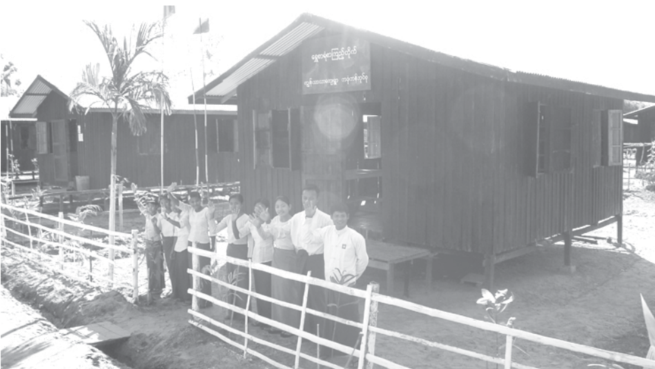
A library in Kadonkani Village.

the Tatmadaw as Ayeyawady Division is rich in land and water resources. He said after the storm, the people from all parts of the country including entrepreneurs provided assistance in relief and resettlement tasks with goodwill, humanitarian spirit and patriotism.