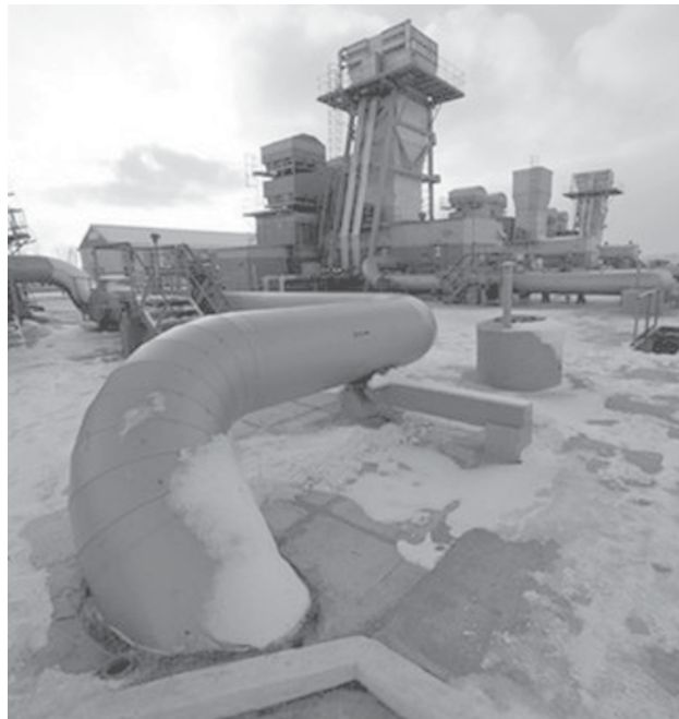
The newly built Bobrovnytska gas compressor and holding station near Kiev on 16 Dec, 2008. There is a “50-50” chance that Russia will cut off gas supplies to Ukraine on January 1 over Kiev’s failure to pay its debts, Russian energy giant Gazprom said on Saturday.—INTERNET