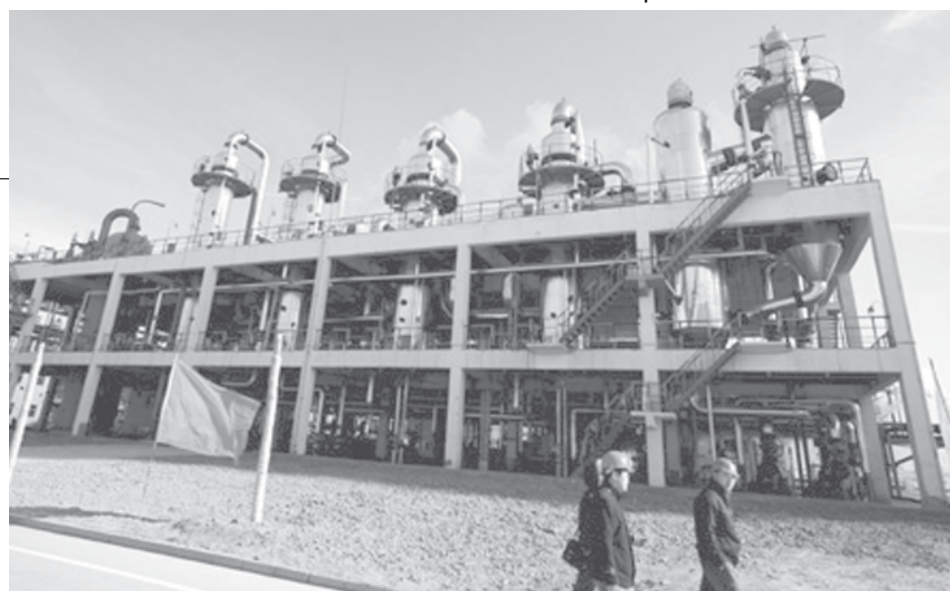
Photo taken on 22 Dec, 2008 shows the plant of Shanxi Lu'an Group in Tunliu county, north China's Shanxi Province. China is forecast to produce 189 million tonnes of crude oil in 2008, a growth of 1.61 percent over the 186 million tonnes last year.