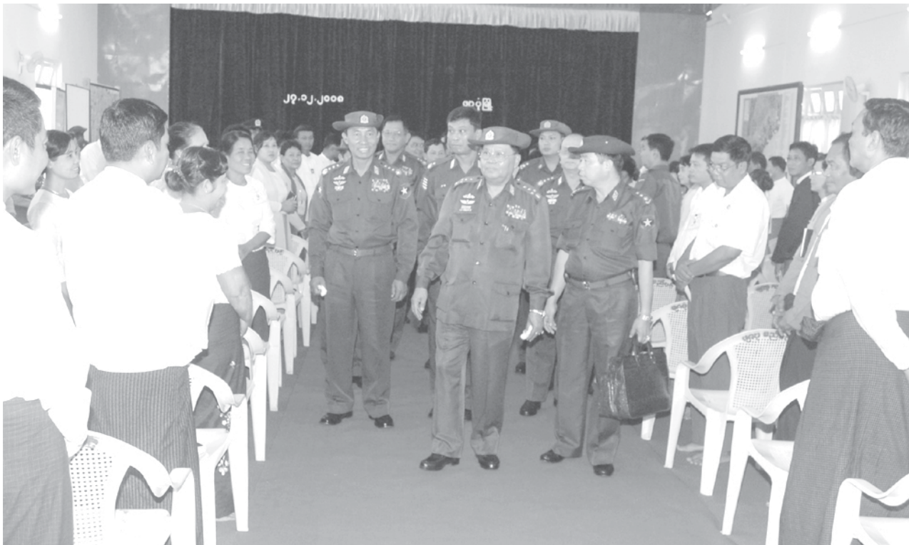
Senior General Than Shwe greets local people at Thiri Annawa Hall in Pyapon Township.

In his guidance, Senior General Than Shwe said the storm-hit areas have now much improved. Achievements have been made in relief and resettlement and care services with the efforts of all the national people. Measures could be taken to prevent the outbreak of infectious diseases. Moreover, resettlement tasks are being carried out with greater momentum. He spoke of the need to complete the construction of schools, hospitals, dispensaries, houses, cy-