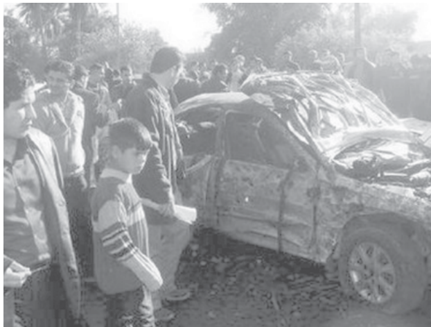
Residents look at a destroyed vehicle after a bomb attack in Kadhimiya district of northwestern Baghdad on 27 Dec, 2008.

Forecast for Mandalay and neighbouring area for 29-12-2008: Partly cloudy.