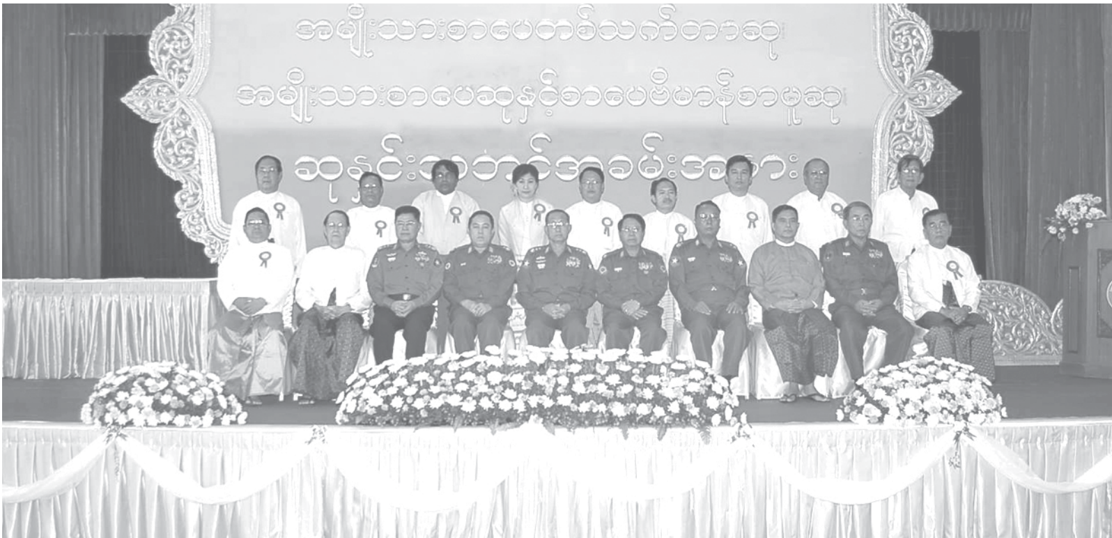
Secretary-1 Lt-Gen Thiha Thura Tin Aung Myint Oo poses for documentary photos together with winners.

world. And this is a significant characteristic of Myanmar among the world's nations. He said such a ceremony to award the literati has been held annually, adding that he was very pleased to have the opportunity to award the literati. The literati are national forces striving for Myanmar to be able to stand tall among the international community by preserving the national literature that is the lifeblood of the country and the people. The aims of awarding the brilliant literati yearly are to praise the goodwill of the literati, who have been maintaining and preserving the national literature, to promote the standards of the national literature and literary world and to turn out the literati of new generations. (See page 10)