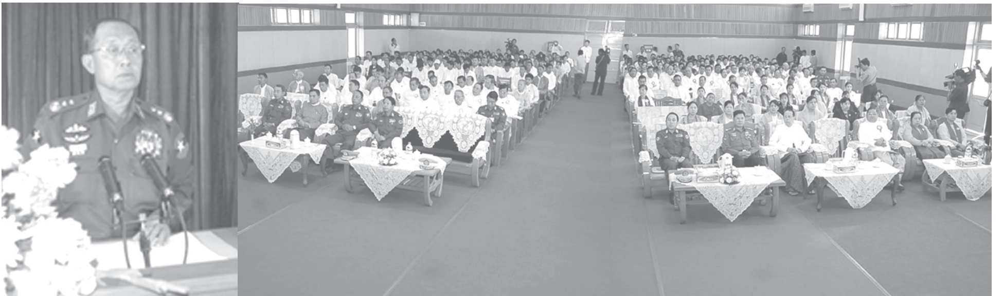
Secretary-1 Lt-Gen Thiha Thura Tin Aung Myint Oo delivers an address at presentation ceremony of Life-time Achievement National Literary Award, National Literary Award and Sarpay Beikman Manuscript Award.

Throughout history, Myanmar has existed in the world with her own literature, culture, customs and traditions