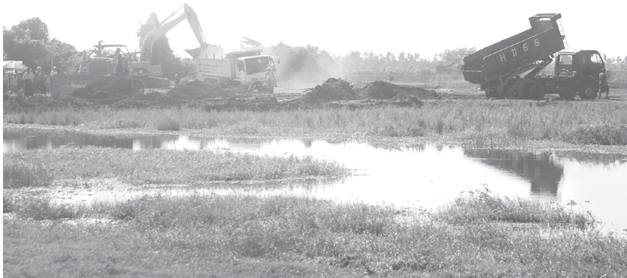
Machinery at work at construction project of Cyclone Shelters at Kadonkani Village in Bogale.

Storm-hit areas must develop more than the condition before the storm. Rehabilitation and construction and preparedness of natural disaster are the national project and systematic arrangements are to be made.