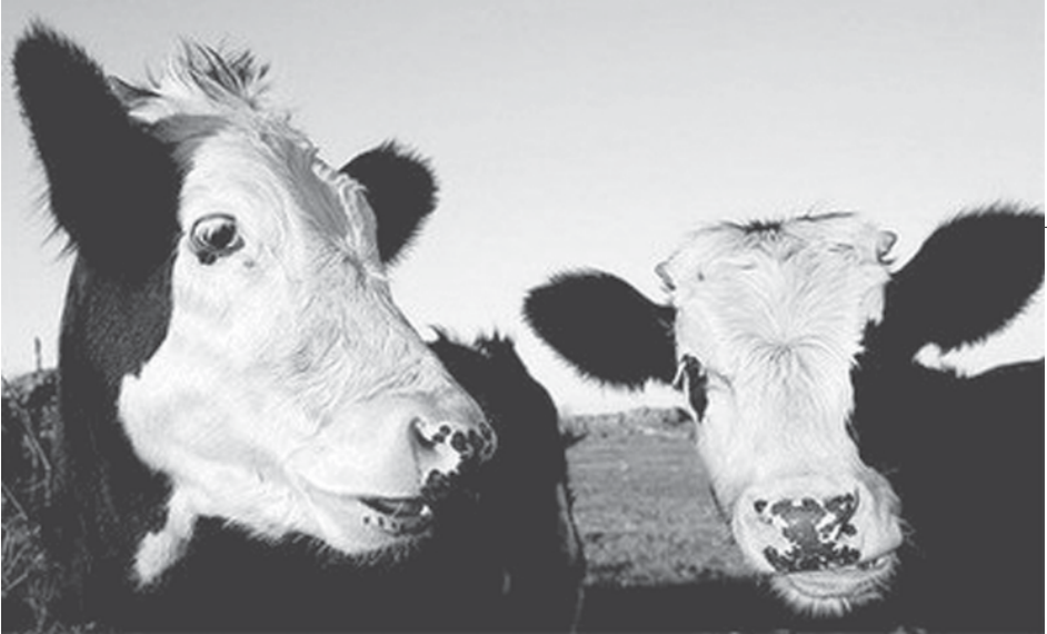
Cows in a field. The European Union on Monday launched a fresh challenge at the WTO against sanctions imposed by the United States and Canada on the EU for its ban on hormone-treated beef from the two countries.

Tuanku Jaafar, who took over the state throne after his brother Tuanku Munawir’s death in 1967, leaves behind his wife, consort Tuanku Najihah Tunku Besar Burhanuddin, three sons and three daughters.—Internet