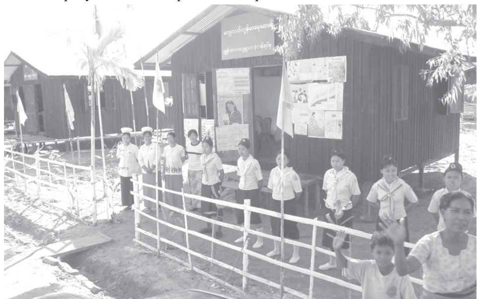
A clinic in Kadonkani Village.