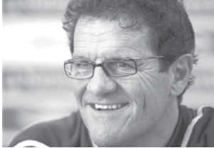
Fabio Capello, insisted on Saturday that he does not yet deserve to be compared to Sir Alf Ramsey, the man he hopes to emulate by transforming England into world-beaters.

"Someone spoke to me about this big manager (Ramsey) but we have to wait. He's up here - I'm still down here," said Capello. "It's a very long way to arrive at the level of Sir Alf Ramsey — it is difficult and very, very long."