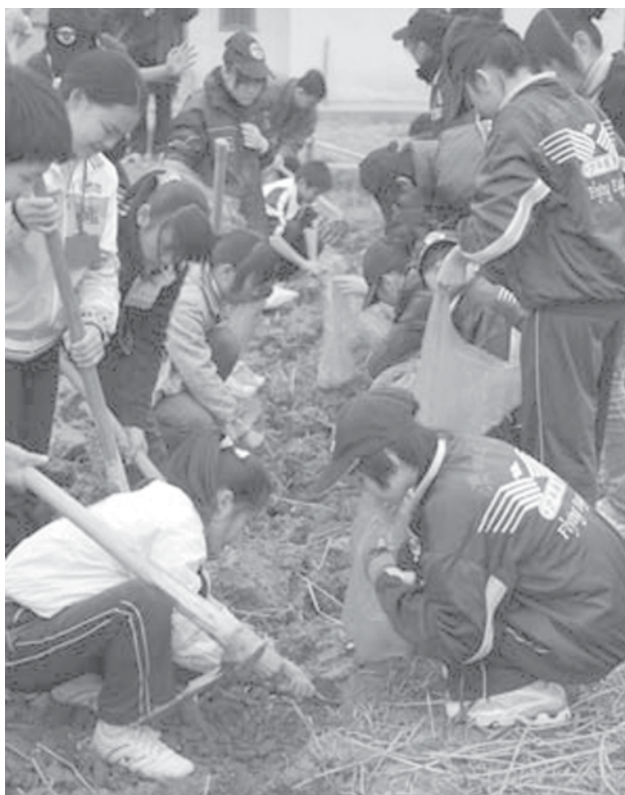
Members of the Macau Flying Eagle Association work on the field with the local students at Shatian Township of Hezhou City, southwest China's Guangxi Zhuang Autonomous Region, on 26 Dec, 2008. More than 30 members of the association came to Hezhou to experience the farm life.

In a statement issued by his spokesperson, Ban said that he is “deeply alarmed” by the heavy violence and bloodshed in Gaza, and the continuation of violence in southern Israel, and called for “an immediate halt to all violence.”—Xinhua