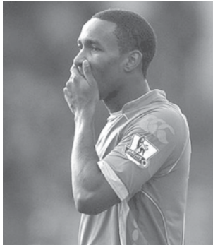
Tottenham coach Harry Redknapp said on Saturday that he will not be forced to pay an inflated transfer fee to bring England striker Jermain Defoe, back to White Hart Lane from Premier League rivals Portsmouth.