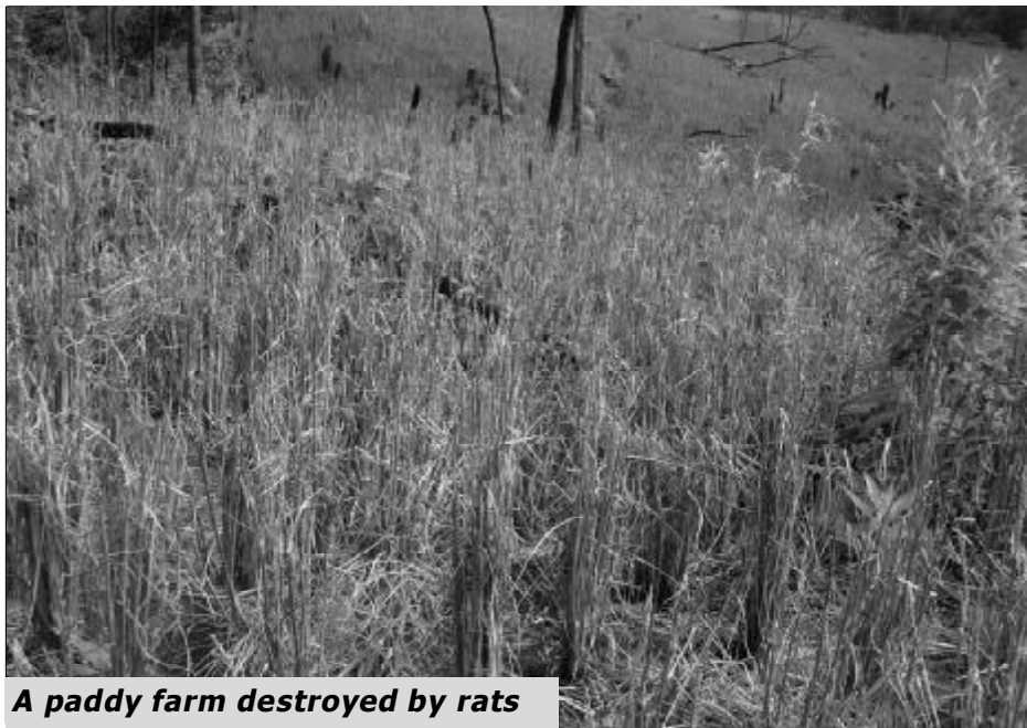
A paddy farm destroyed by rats

As SPDC troops increase their activities inside many of the villages, villagers are faced with more difficulties such as travel restrictions, forced labor and extortion. There are three more SPDC outposts based in Kler Lwee Htoo this year. This also restricts the movement of the villagers, and makes it easier for