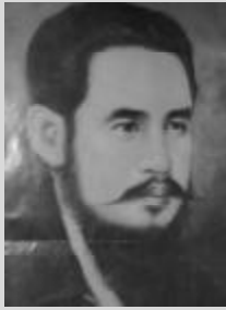
Saw Ba Oo Gyi, father of Karen resistance