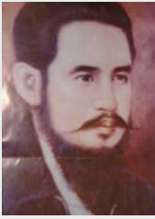
Saw Ba Oo Gyi The father of the Karen resistance