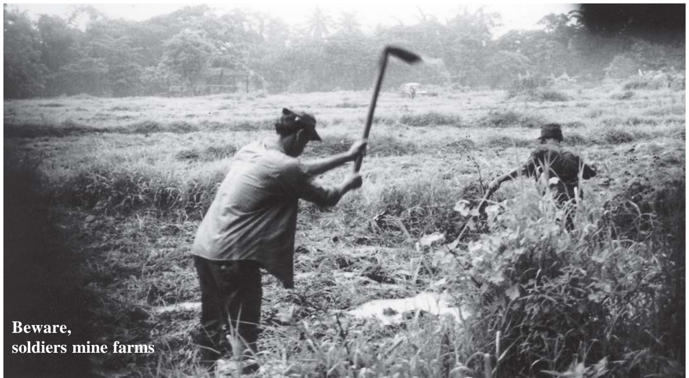
Beware, soldiers mine farms