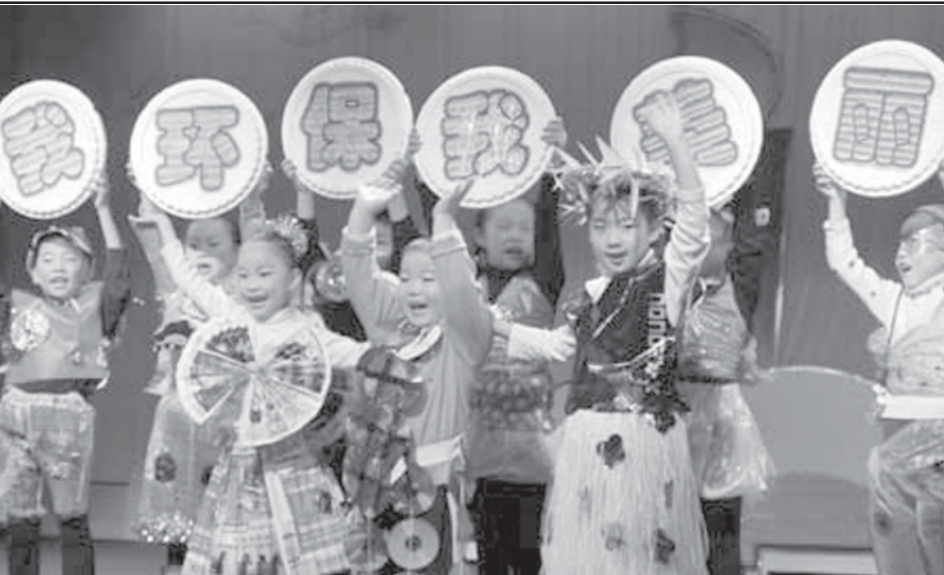
Children present fashion creations during an environment-friendly fashion show in Wuhu, east China’s Anhui Province, on 30 Oct, 2008. Fashion creations made of newspapers, packaging bags, plastic bottles and leaves designed by 280 students were displayed here on 30 Oct.