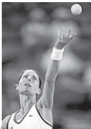
France's Nathalie Dechy.

QUEBEC, 31 Oct — France's Nathalie Dechy advanced to the quarter-finals of the 175,000-dollar WTA Quebec Chal-