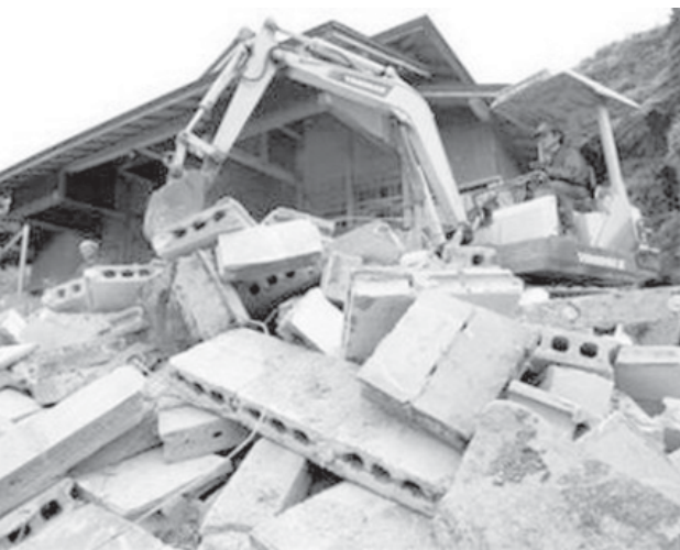
Residents try to remove a wall that collapsed due to an earthquake in Kurihara, northern Japan.