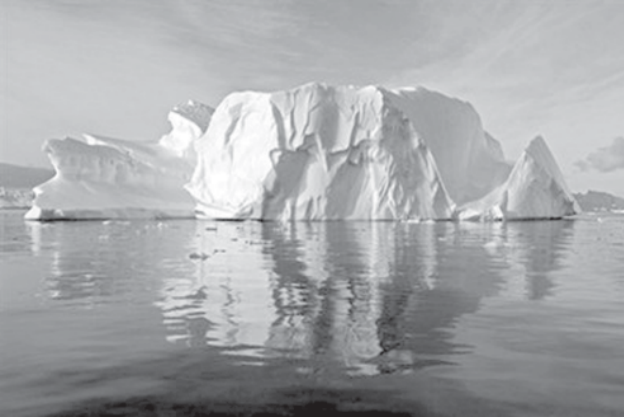
File photo of an iceberg in North Bay, Rothera Point, Adelaide Island, Antarctica. Antarctica, which seemed to have largely escaped the global warming affecting the rest of the planet, is melting too, according to a study.

OSLO, 31 Oct—A giant bat with a wingspan up to 5.5 feet has made a comeback from the brink of extinction in Tanzania in a rare conservation success, an environmental group said on Friday. Numbers of the Pemba flying fox, a type of fruit bat, have risen to 22,000 since it was rated critically endangered two decades ago when "only a scant few individual fruit bats could be observed," British-based Fauna and Flora International said. In a release coinciding with Halloween, it said that the bat's maximum wingspan was "greater than the height of the average British woman." A conservation drive helped the species recover, an exception to mounting losses of animals and plant species caused by destruction of habitats linked to rising human populations.—Internet