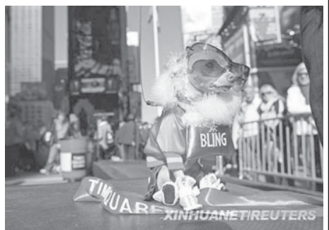
Peanut, a pet chihuahua, poses after winning the Dog Day Masquerade, an annual costume contest, in Times Square, New York.