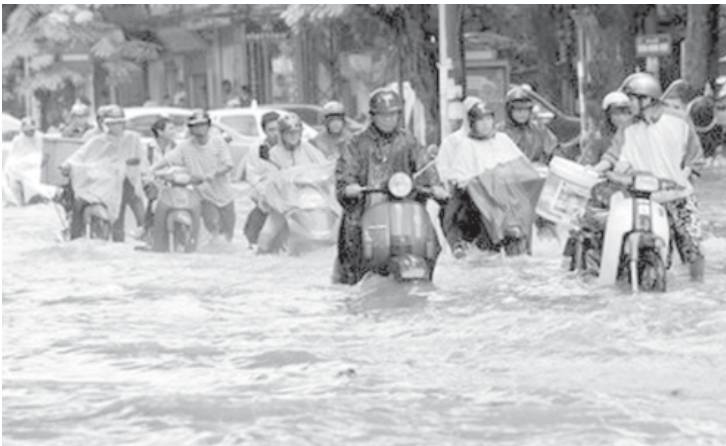
People make their way through a flooded street in downtown Hanoi following heavy rains, on 31 October.