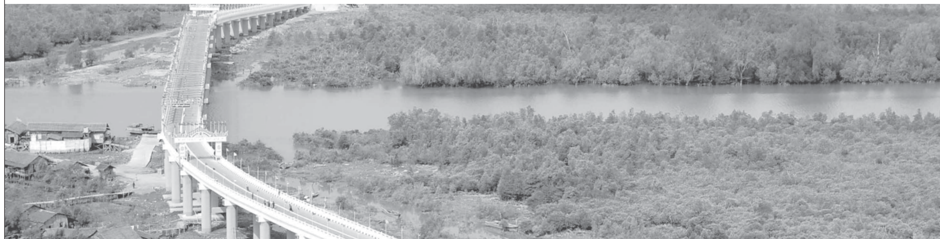
Photo shows an aerial view of Minkyaung Creek Bridge on Yangon-Kyaukpyu Road in Rakhine State.—(Byline on page 11)

Article: Nu Nu Yi & Aye Thanda Thein, Photo: Myanma Alin