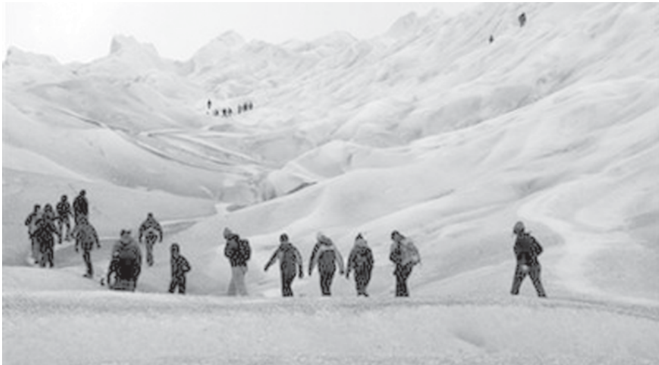
Tourists trek on the Perito Moreno Glacier at the Los Glaciares National Park in the Patagonia region, Southern Argentina, on 30 Oct, 2008. The park was declared by the UNESCO as a Natural World Heritage Site.

"Buffers in bank and public balance sheets, the flexible exchange rate and greater diversification of export markets have increased Turkey's ability to cope with shocks. However, its dependence on external financing exposes the economy to the effects of the global credit crunch," Giorgianni was quoted as saying by the semi-official Anatolia news agency.— Internet