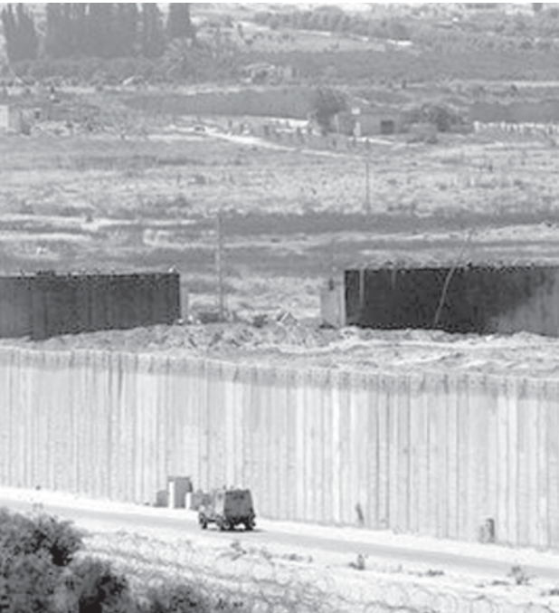
File photo shows an Israeli army vehicle driving near the cement fence separating Israel and the Gaza Strip. Militants in the Gaza Strip on Friday fired two anti-tank rockets at an Israeli army patrol along Gaza’s security fence, causing no damage, the army said, but again shaking a fragile truce.

US helicopters reportedly launched an attack on a building in Al-Sukkariah village in Abu Kamal town near the Syrian border with Iraq on 26 Oct, killing eight civilians.