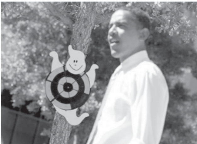
US Democratic presidential nominee Senator Barack Obama is pictured alongside an image of a ghost as he tries to purchase a pumpkin for Halloween at the United Methodist Church Pumpkin Patch in Sarasota, Florida, on 30 Oct, 2008.

WASHINGTON, 31 Oct—Democrat Barack Obama's lead over Republican rival John McCain held steady at 7 points as the race for the White House entered its final four days, according to a Reuters/C-SPAN/Zogby poll released on Friday. Obama leads McCain by 50 percent to 43 percent among