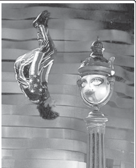
Wintuk preview : A performer flies through the air during a preview of Cirque du Soleil's Wintuk at Madison Square Garden in New York.