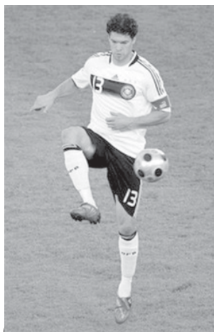
Germany captain Michael Ballack, flew from London to Frankfurt, Germany, on Thursday to apologize directly to Joachim Loew for comments he made last week criticising the national coach.