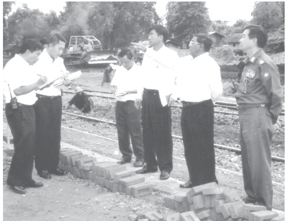
Minister Maj-Gen Aung Min inspects extended building of Phaya Ngasu station yard. — RAILWAY

Next, the minister and party went to Phaya Ngasu