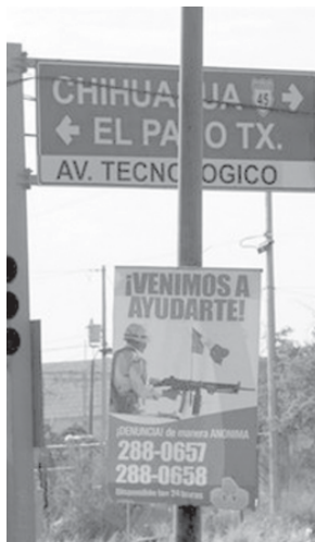
A sign reading “We come to help you”, in allusion to the Mexican Army reinforcement operation, hangs in Ciudad Juarez, state of Chihuahua, north Mexico.

CICUDAD JUAREZ, 31 Oct—Suspected drug-related violence left 13 dead, including two women, in separate incidents in Mexico's violent northern Chihuahua state, local authorities said. Heavily-armed men attacked a man and a woman as they got out of a car in the border city of Ciudad Juarez, forcing them up against a wall and shooting them at least 15 times, including a coup de grace typically used by drug gangs, local police said. In a separate incident, police found a young woman's body, also in the city across from El Paso, Texas, in which more than 1,000 have been killed so far this year.— Internet