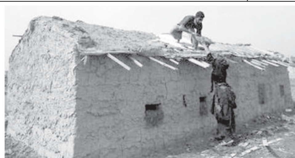
Displaced residents renovate their mud house after it was damaged by the rain in Baghdad's Doura district, southern Baghdad, on 29 Oct, 2008. Picture taken on 29 Oct, 2008.

The study, by scientists at University College London, examined the brain areas that correlate with the sentiment of hate and shows that the “hate circuit” is distinct from those related to emotions such as fear, threat and danger — although it shares a part of the brain associated with aggression.—Internet