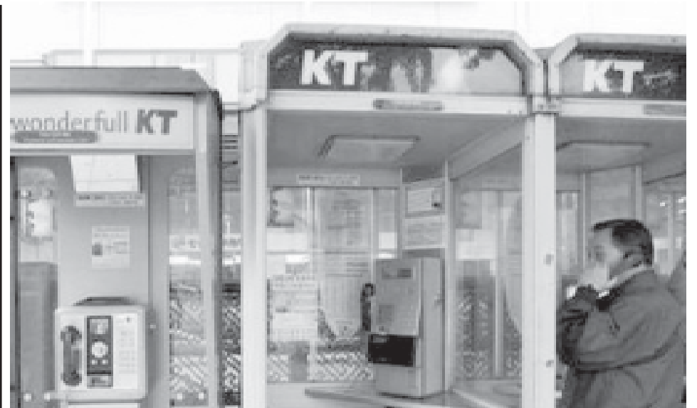
A man uses a payphone near a main office of KT in Seoul on 31 Oct 2008. KT, South Korea's top fixed-line and broadband firm, reported a wider-than-expected fall in quarterly net profit due to losses from a weaker won, but its operating profit beat forecasts as marketing costs dropped.