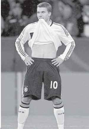
Germany's striker Lukas Podolski.

MUNICH, 31 Oct — Germany striker Lukas Podolski faces another stint on Bayern Munich's bench after a further ticking off from manager Uli Hoeness and his departure from the German giants looks increasingly likely.