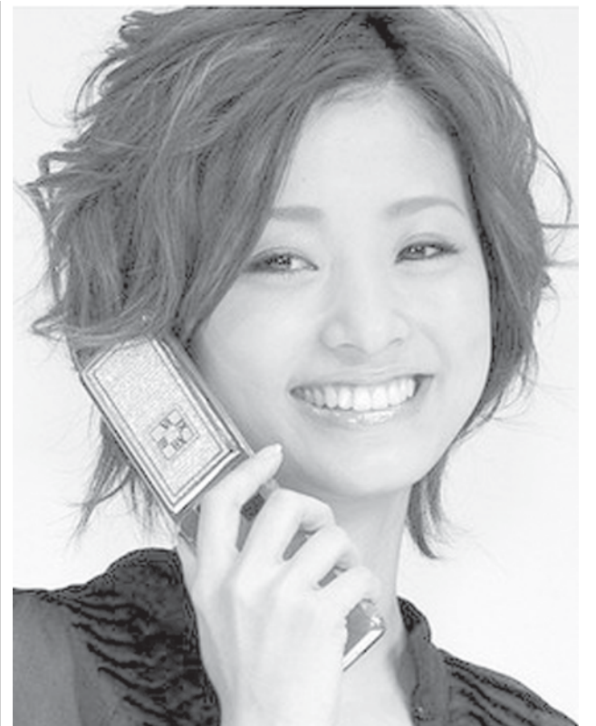
Japanese actress Aya Ueto displays Japanese mobile operator Softbank's "Tiffany mobile phone", studded with 537-piece, a total of 18.34 carats diamonds, produced by US jeweller Tiffany and Japanese electronics giant Sharp as Softbank announced the new line up. Tiffany mobile phones will go on sale only ten pieces with a price of 12.98 million yen (130,000 USD).

The construction is expected to encounter a series of technical difficulties, including the paving of the pipeline going through the bottom of the Amur (Heilong Jiang) River, but the current technologies can ensure the smooth running of the project, he said.— Internet