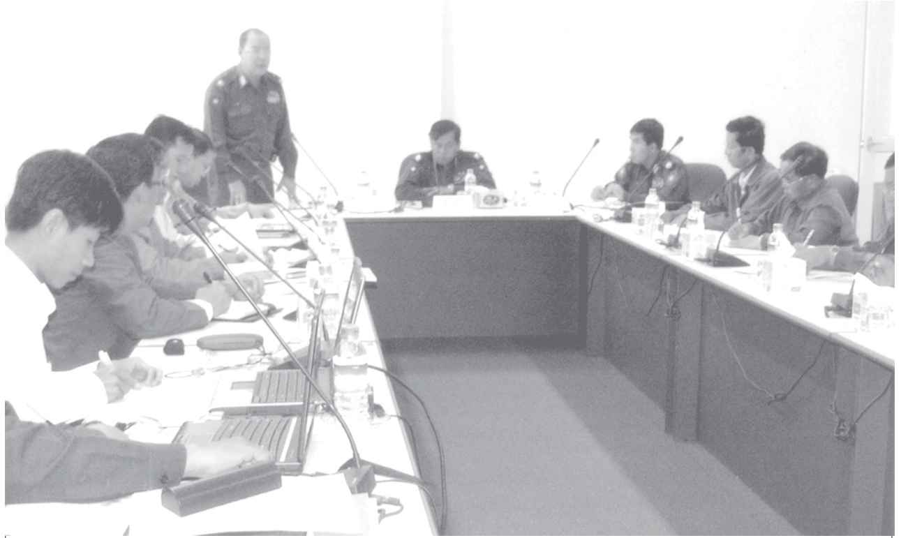
Minister Brig-Gen Thein Zaw addresses coordination meeting for construction of Yadanabon Myothit. — COMMUNICATIONS

Departmental officials and entrepreneurs reported on necessities and the commander and the minister fulfilled the requirements.—MNA