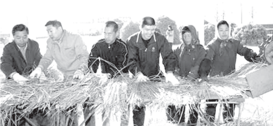
Diplomats of Chinese Embassy to the Democratic People’s Republic of Korea (DPRK) and local farmers work together at a farm in DPRK on 30 Oct, 2008. About 20 diplomats and personnel of Chinese Embassy participated in harvest work with local farmers at a farm in DPRK on Thursday.