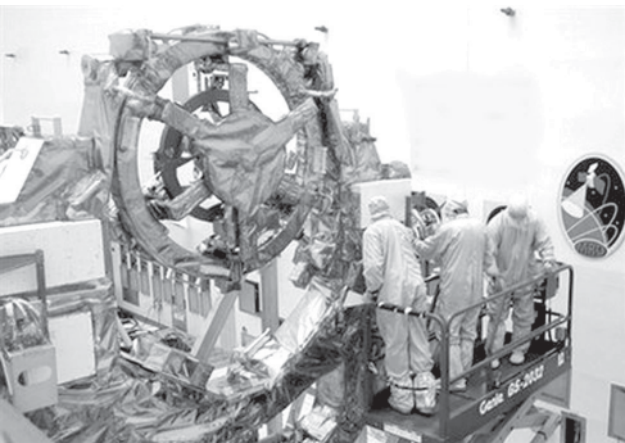
Technicians make final checks to Hubble servicing equipment in September in the Payload Hazardous Servicing facility at Kennedy Space Centre, Florida. Several large pallets of equipment and parts will be loaded aboard the US space shuttle Atlantis for its planned launch to the Hubble.