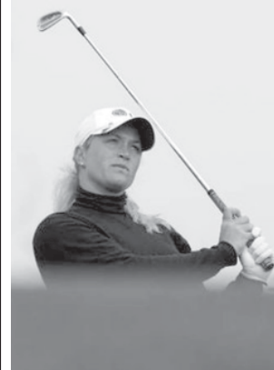
Suzann Pettersen of Norway looks at her tee shot at the eighth hole during the first round of the LPGA Hana Bank-Kolon Championship golf tournament at the Sky72 Golf Club Ocean course in Incheon, west of Seoul, on 31 Oct, 2008.