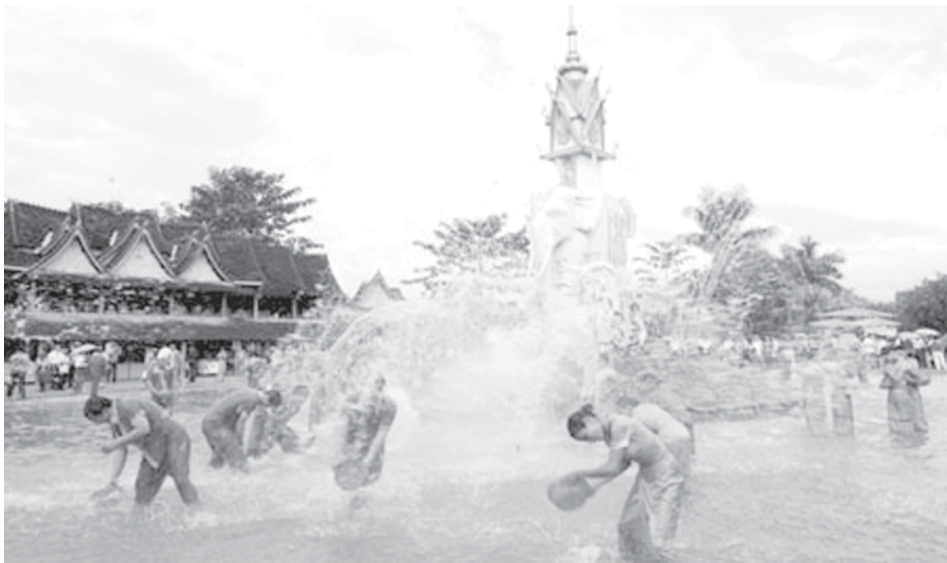
Dai ethnic girls and tourists play during a water-splashing festival in Dai Autonomous Prefecture of Xishuangbanna, southwest China’s Yunnan Province on 30 Oct, 2008.