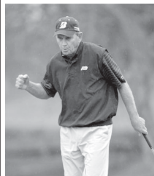
Nick Price reacts after making a birdie putt on the 18th green of Sonoma Golf Club during the first round of the Charles Schwab Cup Championship golf tournament in Sonoma, Calif, 30 Oct, 2008.