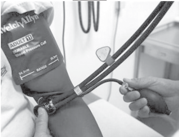
A doctor checks blood pressure in a file photo.

The report, based on data from 33 states, also detailed regional variations, showing — as other studies also have — that the problem is most acute in the southern United States.—Internet