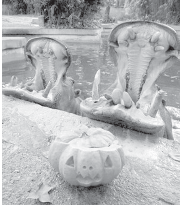
In this photo provided by Rome's Bioparco zoo, Mimi', left, and Carlo, two hippos in their thirties, approach carved pumpkins for Halloween, fed to them as a Halloween treat, on 30 Oct, 2008.