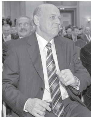
Ex-Poland international Grzegorz Lato reacts in Warsaw, after being elected head of Poland's corruption-ridden PZPN football federation.

UEFA and FIFA rules stipulate government interfere is unacceptable