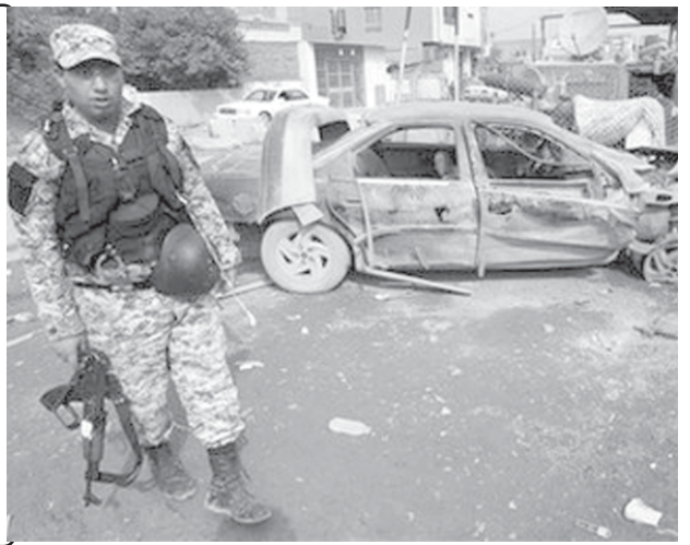
An Iraqi policeman walks in front of a damaged car from a roadside bomb in Palestine Street east-ern Baghdad, Iraq, on 30 Oct, 2008.