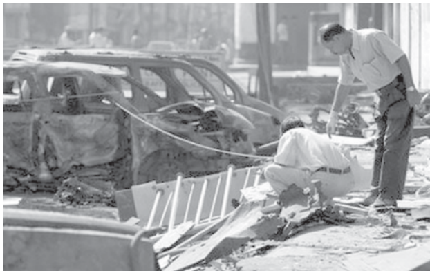
Indian forensic officials collect evidence from wreckage at Pan Bazaar, one of the blast sites in Guwahati. Police on Friday were interrogating about a dozen people over suspected links to serial bombings that killed at least 71 people in India's insurgency-hit state of Assam.

Spanish Interior Minister Alfredo Perez Rubalcaba said a telephone call in the name of ETA an hour before the blast had warned of a car bomb left in the university, but “the one who put the bomb did not warn correctly or wanted to mislead,” making it impossible to deactivate the device.