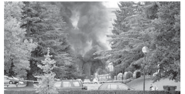
A column of smoke rises above the University of Navarre building following a car bomb blast in Pamplona, on 30 Oct, 2008.

MADRID, 31 Oct — A car bomb exploded Thursday in the parking lot of the University of Navarre in northern Spain, injuring 21 and setting many vehicles ablaze.