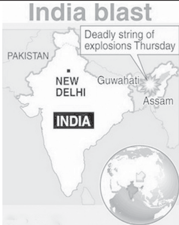
Police on Friday were interrogating about a dozen people over suspected links to serial bombings that killed at least 71 people in India's insurgency-hit state of Assam.

A senior official said Friday detectives were making headway in their investigation.