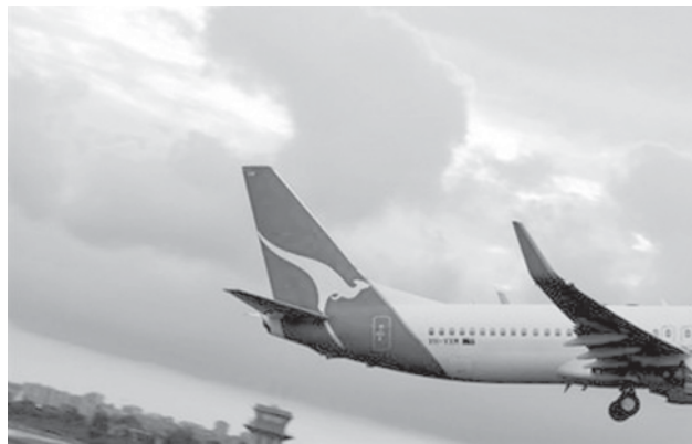
A Qantas jumbo jet flying from Los Angeles to Australia was guided into New Zealand by another airliner after its weather radar failed over the Pacific Ocean, the airline said on 30 Oct, 2008.