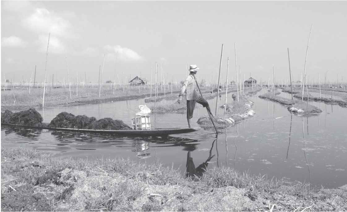
A farmer rows a boat past floating islands in Inle Lake on 12 October, 2008.