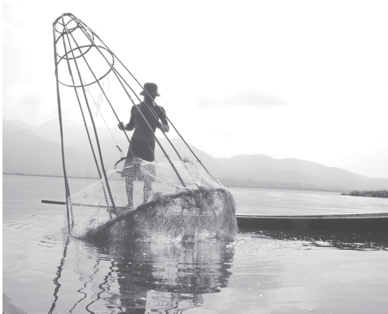
A fisherman at work in Inle Lake on 13 October 2008.

I had planned to visit Inle Lake in Shan State to study its unique ecosystem consisting numerous floating gardens, wetlands, canals, villages, floating markets and fishing boats.