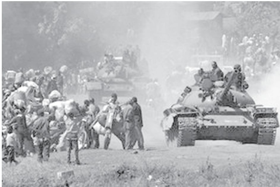
Congolese tanks and thousands of displaced people stream into Goma in eastern Congo, on 29 Oct, 2008. Thousands of refugees started streaming into the eastern provincial capital of Goma in the afternoon, impeded by army tanks, trucks and jeeps pulling back from the battle front.