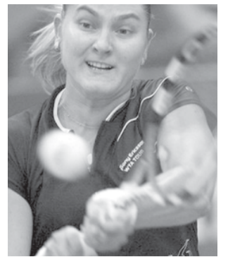
Top-seeded Russian Nadia Petrova (seen here on 10 October) advanced to the quarter-finals of the 175,000-dollar Bell Challenge WTA tennis tournament on Wednesday with a straight-sets win over Varvara.

She next faces Hungarian Melinda Czink, who defeated 2007 semi-finalist Julie Ditty of the United States 6-1, 6-1.