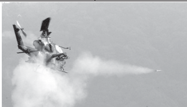
A South Korean AH-1S Cobra helicopter fires missiles during a drill at an army firing range in Yangpyeong, on 28 Oct.