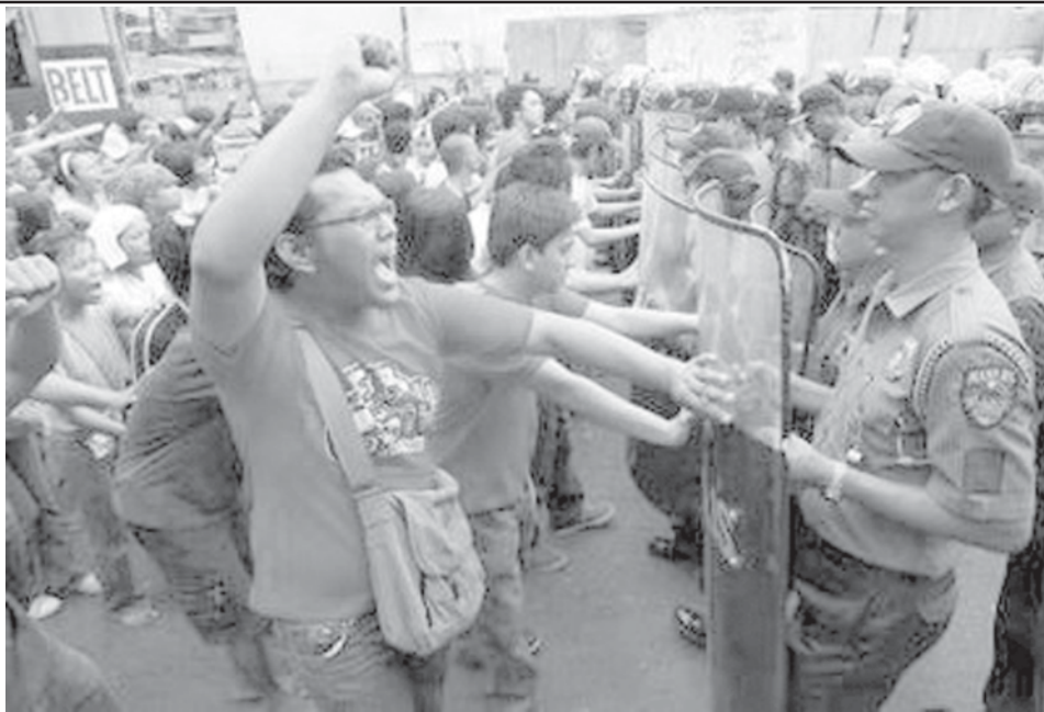
Protesters push against the shields of anti-riot policemen during a rally outside the US embassy in Manila on 30 Oct, 2008.

OTTAWA ,30 Oct— A Canadian man who admired Osama Bin Laden and who was the first to be charged under a tough new anti-terror law was