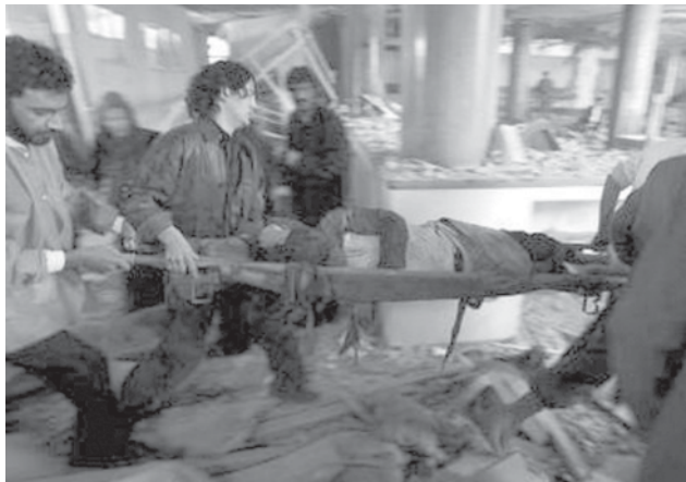
Afghans carry an injured woman after a suicide attack in Kabul on 30 Oct, 2008. An explosion in a crowded area outside Afghanistan's information ministry in the heart of the capital on Thursday caused some casualties, residents and a ministry official said.

Ministry workers were helped out of the building by security personnel and ambulances carried the wounded to hospitals.— Internet