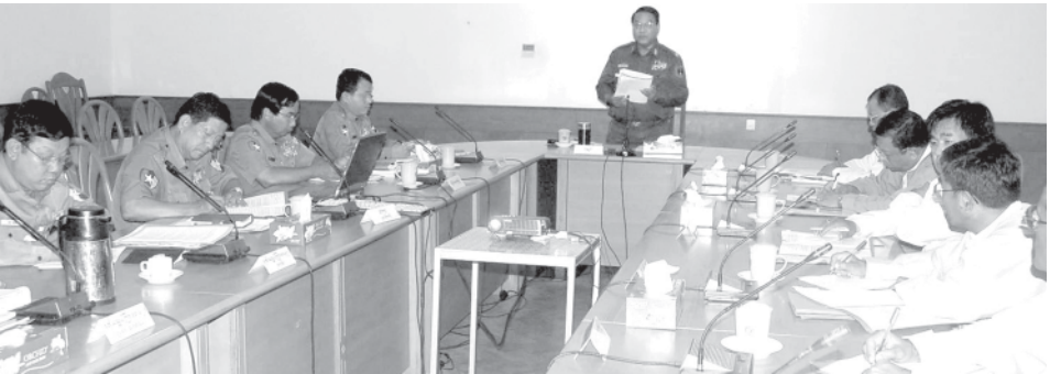
Director-General of MPF Brig-Gen Khin Yi speaks at the meeting.

in Mandalay. The minister inspected distribution and storage of fuel and gave instructions on preventive measures against fire. The minister also oversaw condition of bowsers. – MNA