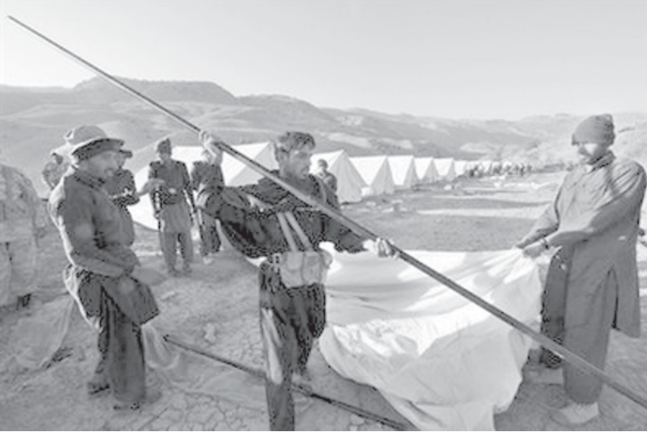
Pakistani soldiers prepare tents for earthquake survivors in Wam on 30 Oct, 2008. Rescuers on 30 Oct struggled to deliver aid to villagers in remote parts of southwest Pakistan after a powerful earthquake destroyed thousands of homes and killed at least 215 people.

BEIJING ,30 Oct— China sent a team of officials to Sudan on Thursday to seek the release of kidnapped oil workers in the disputed aftermath of rescue efforts after four Chinese hostages were killed.