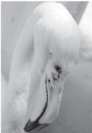
An Adelaide Zoo photo shows the injured almost blind greater flamingo, estimated to be more than 75 years old, which was attacked at the zoo on 29 Oct.—

The zoo's website describes the bird as "undoubtedly the oldest flamingo in the world," adding that despite its great