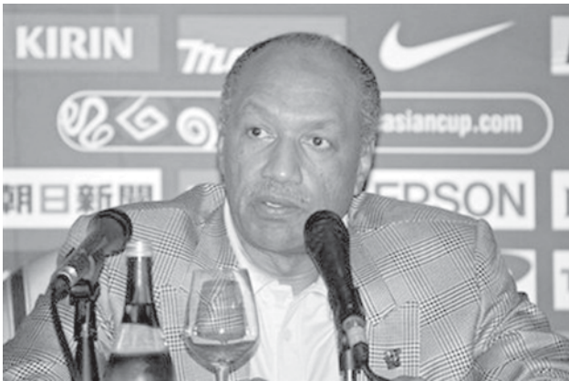
AFC president Mohamed bin Hammam (seen in this file photo) has implored teams in Asia to embrace a new era of professionalism and become commercially viable to ensure the future of football in the region.

KUALA LUMPUR, 30 Oct — AFC president Mohamed bin Hammam has implored teams in Asia to embrace a new era of professionalism and become commercially viable to ensure the future of football in the region.