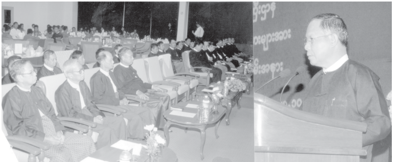
Minister Brig-Gen Thein Aung extends greetings at the ceremony to honour the outstanding athletes.—FORESTRY

In 2007-2008 fiscal year, athletes of the ministry won three gold, nine silver and 15 bronze in international sports events, and 47 gold, 42 silver and 50 silver in local sports events.—MNA