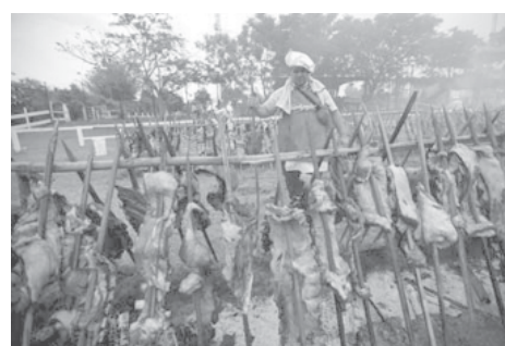
Paraguayans barbeque beef during an attempt to create the world's biggest barbecue in Mariano Roque Alonso near Asuncion. In the attempt to get the Guinness World Record for the "Biggest barbeque in the World", more than 30,000 people grilled 28,000 kilograms of beef on fires covering an area 60 m wide by 100 m long.