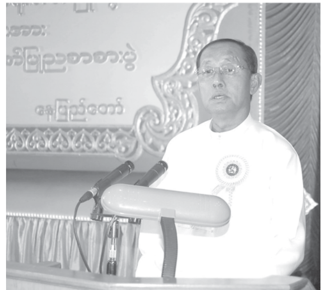
Secretary-1 Lt-Gen Thiha Thura Tin Aung Myint Oo delivers a speech at the ceremony to present certificates of honour to panel of judges of 16th Myanmar Traditional Cultural Performing Arts Competitions.