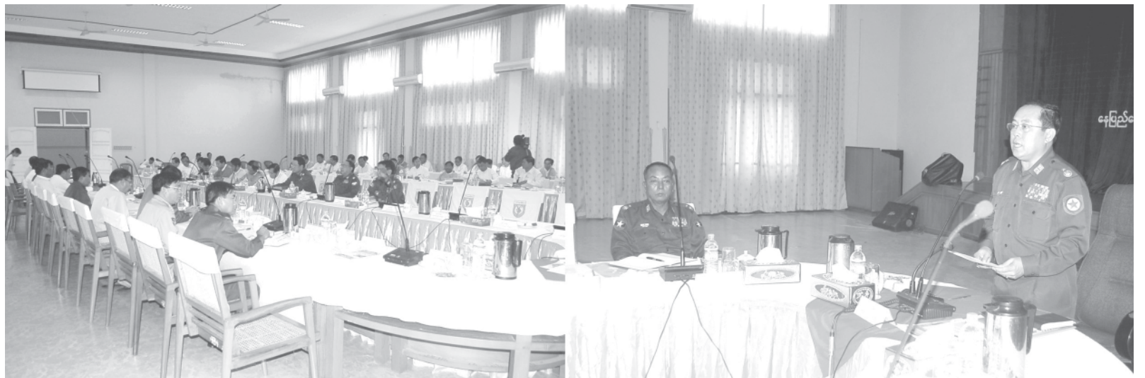
Maj-Gen Wai Lwin makes a speech at the meeting to review the 16 th Performing Arts Competitions.—MNA

Present also were Vice-Chairman of the Leading Committee Chairman of the Work Committee Minister for Culture Maj-Gen Khin Aung Myint, members of the leading and work committees the deputy minister, departmental heads, of-