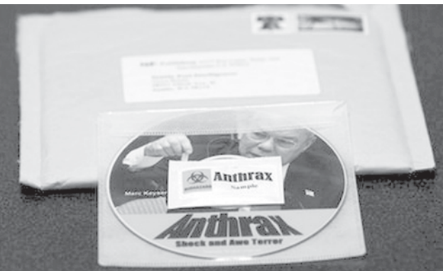
A package labelled ‘anthrax’ sits on a counter at the photo desk of the Seattle Post-Intelligencer on 29 Oct, 2008.

SAN FRANCISCO, 30 Oct—A California man was arrested Wednesday on suspicion of sending hoax letters labelled “anthrax” to scores of media outlets, the FBI said Wednesday, warning that