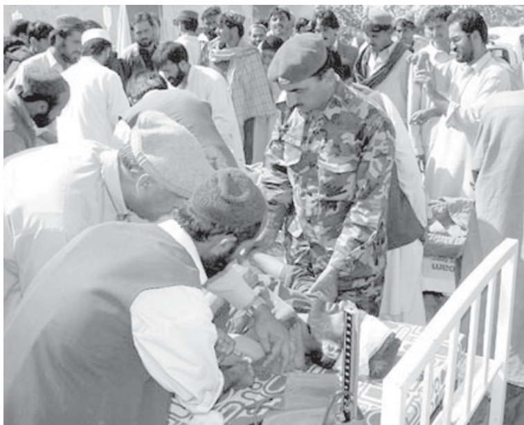
Survivors receive medical treatment in the worst-hit Ziarat area in southwestern Pakistan's Balochistan province, on 29 Oct, 2008.