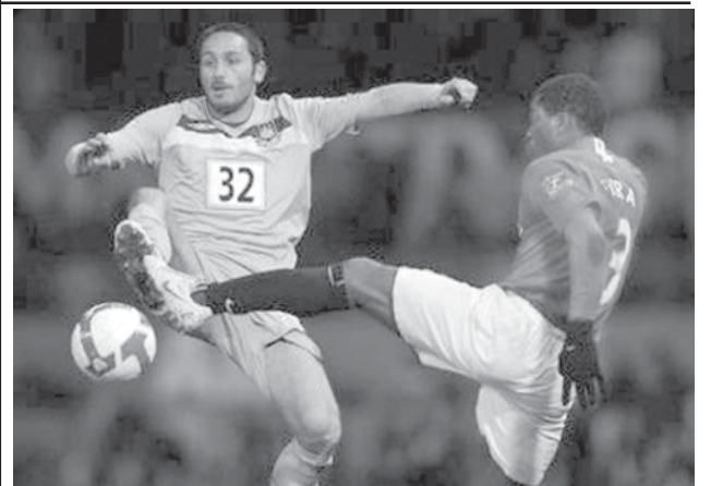
Manchester United's Patrice Evra (R) is challenged for the ball by West Ham's David di Michele (L) during their English Premier League soccer match at Old Trafford in Manchester on 29 Oct, 2008.—INTERNET

American Melanie Oudin, who ousted second-seeded Austrian Sybille Bammer in the first round, kept up her winning ways with a 6-1, 7-6 (7/3) victory over 2006 Quebec runner-up Olga Puchkova of Russia.— Internet