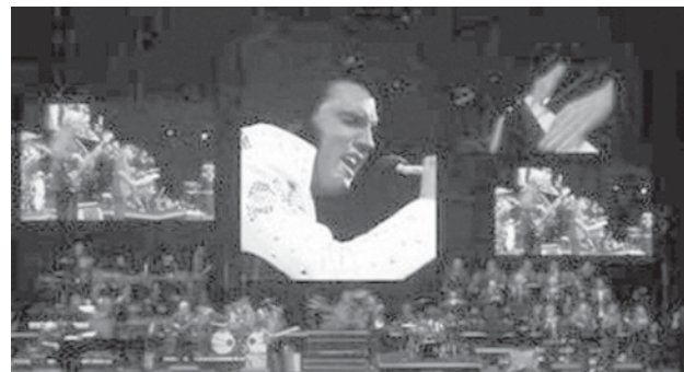
A live band backs up a virtual Elvis during a memorial concert of Elvis footage in Memphis, Tennessee, on 16 August, 2007.