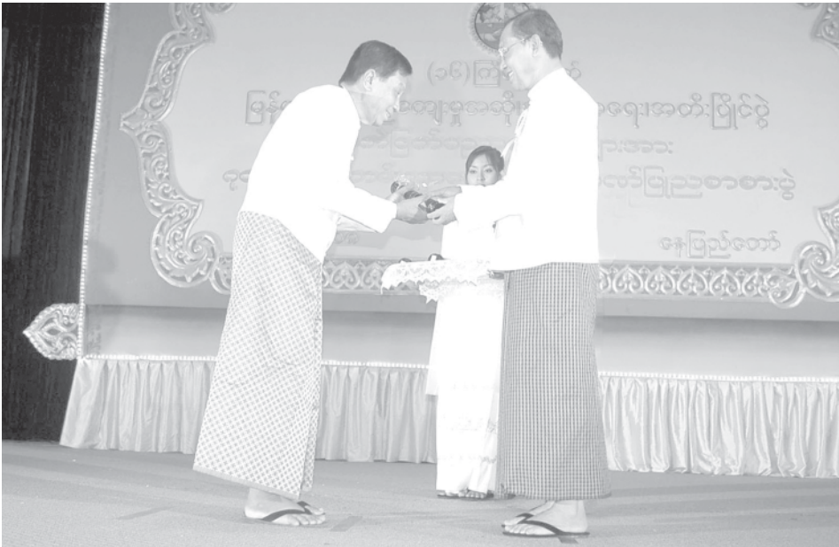
Secretary-1 Lt-Gen Thiha Thura Tin Aung Myint Oo honours U Yi Nwe, on behalf of judges.—MNA

(from page 1) This is why every time one event of cultural performing arts competitions concludes, a grand dinner is hosted to honour and recognize the efforts of maestros. For the development of a nation, efforts need to be made to ensure that the country harmoniously develops not only economically and physically but also culturally and socio-economically. The Secretary-1 said although science and technology can actually bring about national development, striving for the nation to be able to stand in dignity among the international community is the might of national culture. So it is necessary to thwart the penetration of alien cultures and make a flourishing and ever-lasting own national culture with national outlook at a time when the nation is trying to develop by strengthening its relations with the international community. As most of the people including artistes have conscientiously safeguarded their own national culture, Myanmar's traditional arts and culture have firmly existed till today. Therefore, the maestros are to get today's youth to know the essence of preserving their own national culture and inculcate them with the spirit of cherishing their national culture through the might of performing arts. As Myanmar tradi-