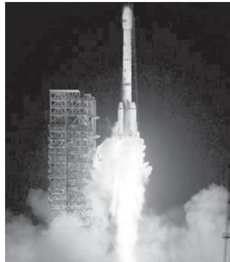
A Long March 3II rocket carrying a Venezuelan telecommunication satellite blasts off from the launch pad at the Xichang Satellite Launch Centre, southwest China's Sichuan Province, on 30 Oct, 2008.

XICHANG, 30 Oct—China successfully sent a Venezuelan telecommunication satellite into space on the early morning of Thursday. It is China's first contract of manufacture and launching service for a Latin American country.