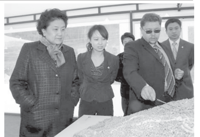
Chinese State Councilor Liu Yandong (L) reviews the preparation work for the Winter Olympic Games in 2014 in Sochi, Russia, on 29 Oct, 2008. XINHUA

Sochi is the second leg of Liu's visit to Russia after her stay in Moscow.—Xinhua