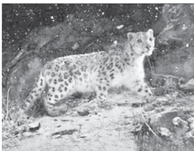
A picture of an elusive snow leopard on a night-time prow has won the prestigious Wildlife Photographer of the Year 2008 award.