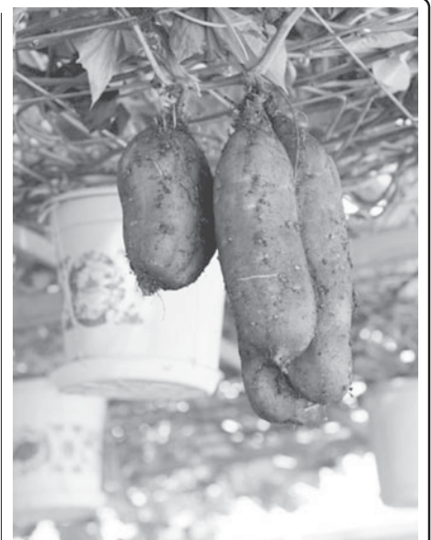
Photo shows sweet potatoes growing on a shelf in an intelligent greenhouse in Xiqing District in Tianjin, north China. The greenhouse is built to show new agricultural technologies, such as soilless culture and drip irrigation etc, as a model of modern sightseeing agriculture.

Justice was born in 1920 in Sparta, but eventually moved to Buffalo, NY, where she died in 1978. She is buried in Milledgeville.