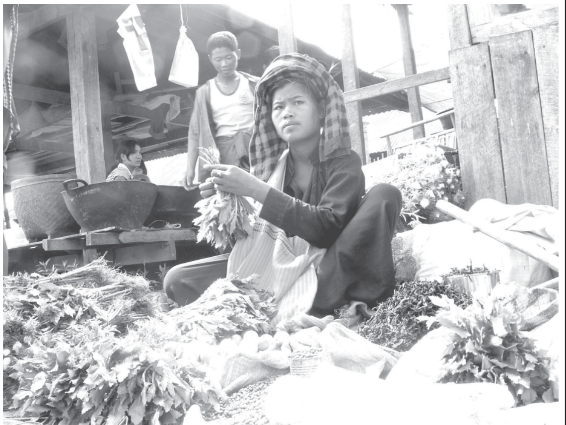
A Pa-O woman prepares vegetables as she waits for customers in Namppan Village on 13 October, 2008.

“We hope that the natural environment of Inle Lake can be conserved with the cooperation of local people, NGOs and ministries concerned,” said Mya Than Tint of BANCA.