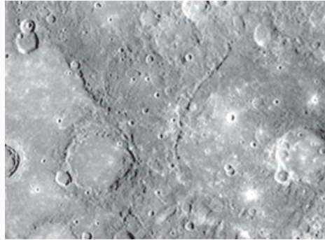
This undated handout photo provided by NASA, taken earlier this month by the Messenger space probe, shows a portion of Mercury.