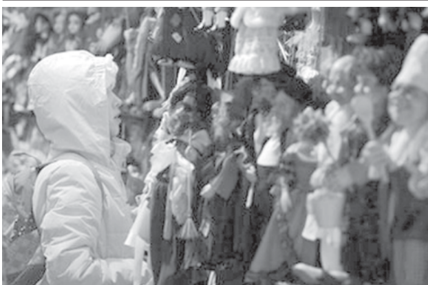
A girl looks at marionettes in downtown Prague, Czech Republic, Sunday, 26 Oct., 2008.—INTERNET

"With the 'The Dark Knight' grossing $991 million in box office revenue worldwide, we estimate his earnings at $20 million," the website said. —Internet