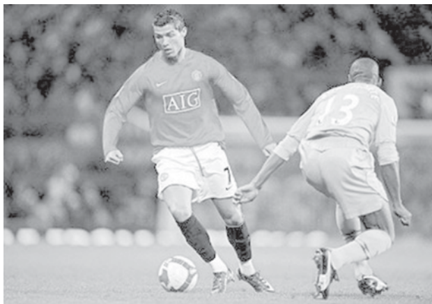
Manchester United's Portuguese midfielder Cristiano Ronaldo (left) vies with West Ham United's Portuguese forward Luis Boa Morte during the English Premier league football match at Old Trafford, Manchester.

MANCHESTER, 30 Oct — Manchester United manager Sir Alex Ferguson has challenged Cristiano Ronaldo to repeat last season's remarkable feat of scoring more than 40 goals.