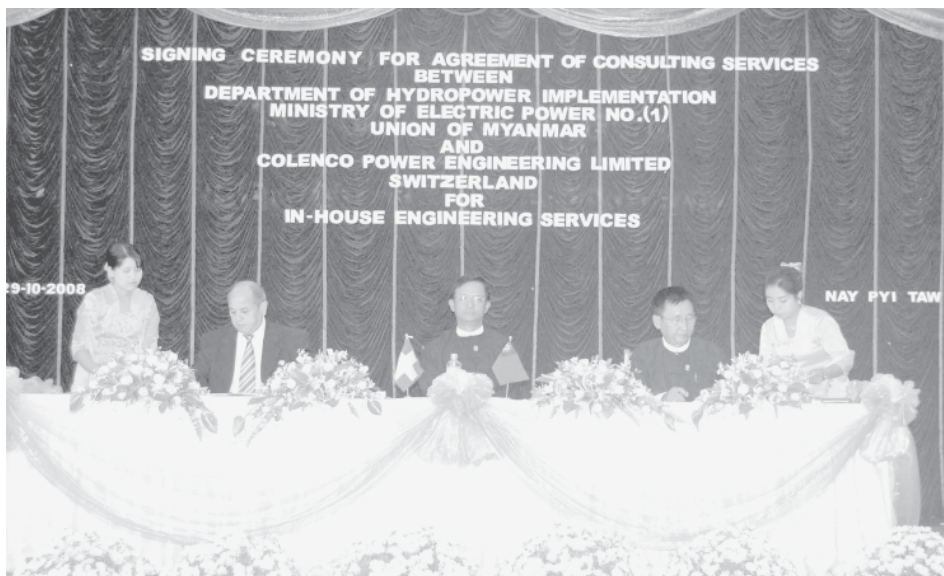
Department of Hydropower Implementation and Colenco Power Engineering Limited of Switzerland hold the signing ceremony for agreement of consulting services.—MNA

The commander gave necessary instructions and made concluding remarks. MNA