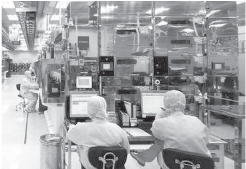
The prototype of a fully implantable artificial heart is seen at the biomedical firm Carmat in Suresnes, west of Paris, on 27 Oct, 2008.

WASHINGTON, 30 Oct—Someone in your house have the sniffles? Watch out for the refrigerator door handle. The TV remote, too. A new study finds that cold sufferers often leave their germs there, where they can live for two days or longer.