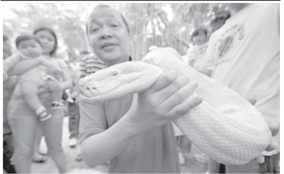
A zoo owner holds a 10-year-old albino python in suburban Manila. Demand among US and European consumers for exotic Asian luxuries such as snakes and coral has nosedived since the onset of the global financial crisis, raising fears of a surge in smuggling.

The converter equipment is provided by Neue Maschinenbau Halberstadt GmbH (NMBH), a global biofuel engines producer based in Germany.— Internet