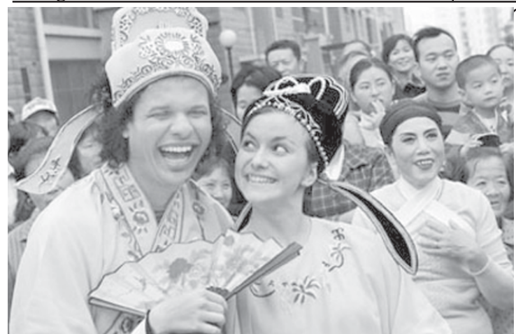
Foreign artists in traditional Chinese costume interact with locals in Nicheng Town of Lingang New City, Nanhai District, during the Shanghai International Arts Festival.

Hong Kong's benchmark Hang Seng Index opened at 13,280.44 on Thursday, up 578.37 points, or 4.55 percent. South Korean benchmark Korea Composite Stock Price Index (KOSPI) stocks opened more than 7 percent higher Thursday while Tokyo stocks opened higher with the key Nikkei index up 2.42 percent. Wall Street tradings mixed Wednesday after the Fed cut a key interest rate by half a percentage point to 1.0 percent to prevent the economy from slipping into deep recession.—Xinhua