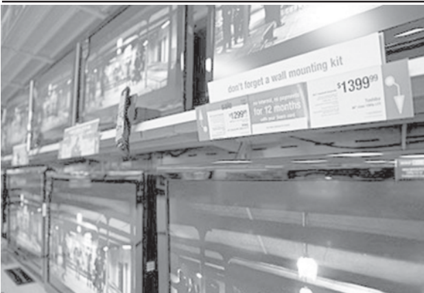
A row of flat panel televisions sit on sale at a store in Annapolis, Maryland. US consumer confidence plunged to a record low in October as consumers felt the bite of the credit crisis, a private firm said on Tuesday, sounding alarms over the year-end holiday shopping season.

The developing countries, while developing their economies and fighting poverty, should actively adopt measures to adapt to climate change, reduce their emissions to the lowest degree and fulfill their duties in addressing climate change, according to the white paper.