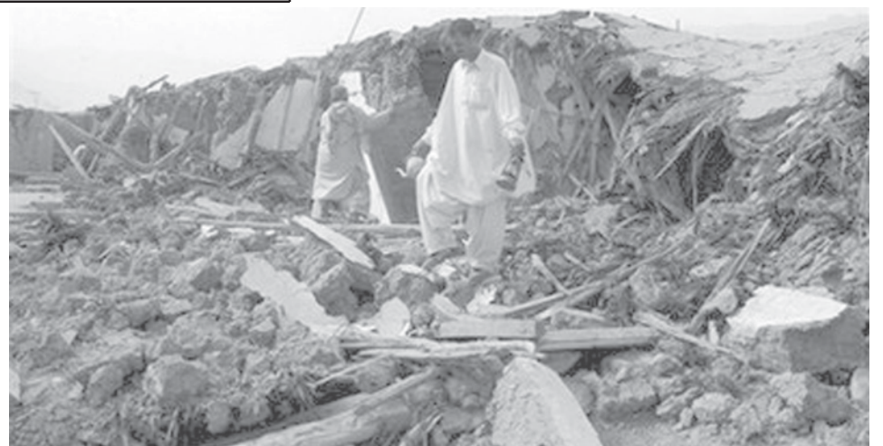
A Pakistani villager walks through the debris of his house damaged by earthquake in Ziarat, about 130 kilometers (81 miles) south of Quetta, Pakistan on Wednesday, on 29 Oct, 2008.—INTERNET

Another quake measuring magnitude 6.2 struck southwest Pakistan on Wednesday, hours after the initial jolt, according to the US Geological Survey.—Internet