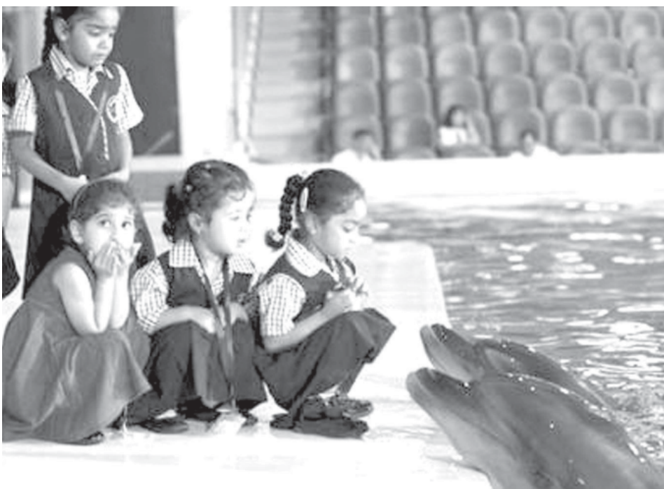
Schoolchildren mingle with dolphins after a show at the Dolphinarium in Dubai Creek Park, on 28 October, 2008.