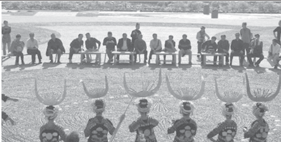
People watch performance at the village of Xijiang Miao ethnic group in Leishan county, southwest China's Guizhou Province, on 28 Oct, 2008. The village of Xijiang Miao ethnic group, featuring its folk culture characters, attracts many visitors at home and abroad.