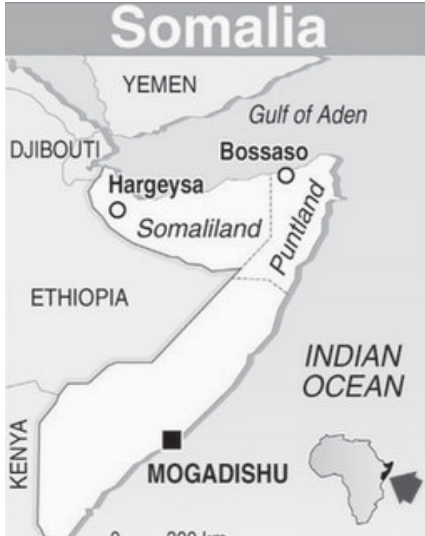
Map of Somalia locating attacks in Hargeysa and Bossaso. At least 25 people in addition to the bombers were killed in five suicide car bomb attacks in two northern Somali breakaway states.

MOGADISHU, 29 Oct—Suicide bombers struck a U.N. compound, the Ethiopian consulate and three other targets in northern Somalia on Wednesday, killing at least 22 people in attacks that coincided with international talks in neighboring Kenya about Somalia's political crisis.