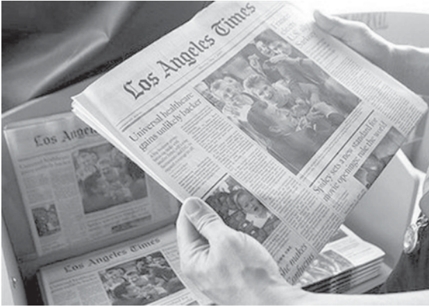
A man reads the Los Angeles Times in Los Angeles, California.

NEW YORK, 29 Oct—The Los Angeles Times plans to cut 75 jobs, or 10 percent of its news staff, a response to the world financial crisis that is exacerbating already painful advertising declines at US newspapers.