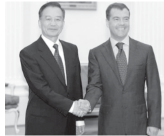
Russian President Dmitry Medvedev (R) meets with visiting Chinese Premier Wen Jiabao in Moscow, capital of Russia, on 28 Oct, 2008.

The communique was signed by visiting Chinese Premier Wen Jiabao and