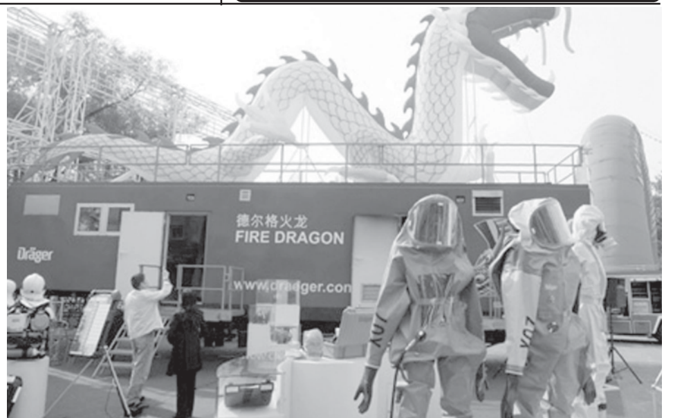
Photo taken on 28 Oct, 2008 shows an unique show stand on an international fire protection exposition in Beijing, China.