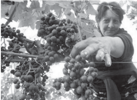
A woman cuts a bunch of grapes during a harvest near the Georgian town of Sagarejo, some 50 km (31 miles) east of Tbilisi.

CHICAGO, 29 Oct — Grapes helped lower blood pressure and improve heart function in lab rats fed an otherwise salty diet, US researchers said on Wednesday.