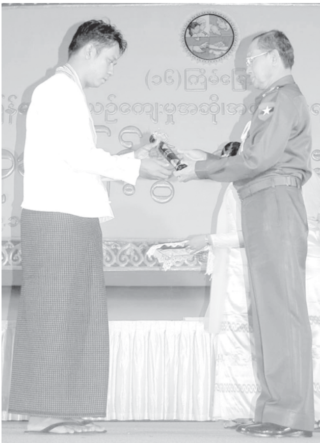
Secretary-1 Lt-Gen Thiha Thura Tin Aung Myint Oo presents supporting orchestra award to Pyi Myanmar Hein Yaza of Yangon Division.