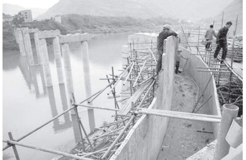
Workers build the new Nanxi bridge in Yunyang county, southwest China’s Chongqing Municipality, on 28 Oct, 2008.

closing price since 15 May, 2007.