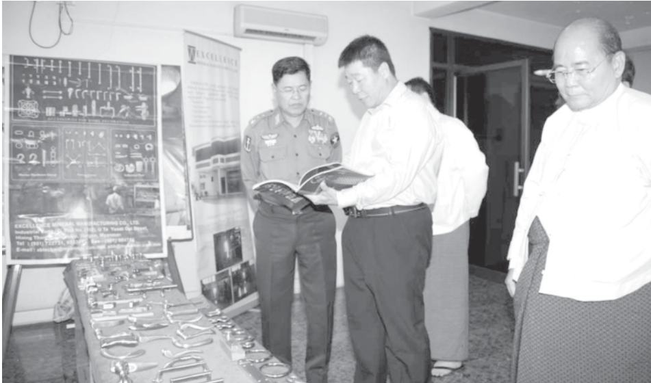
Minister Vice-Admiral Soe Thein inspects Excellence steel forging factory in Hlinethaya Industrial Zone.

In meeting with industrialists, the minister gave a speech, saying that the Government is placing emphasis on development of industrial sector in its efforts for building an industrialized nation. Private entrepreneurs, industrialists and government departments are to strive for realizing the goal through technology transfer and cooperative works. The minister also urged them