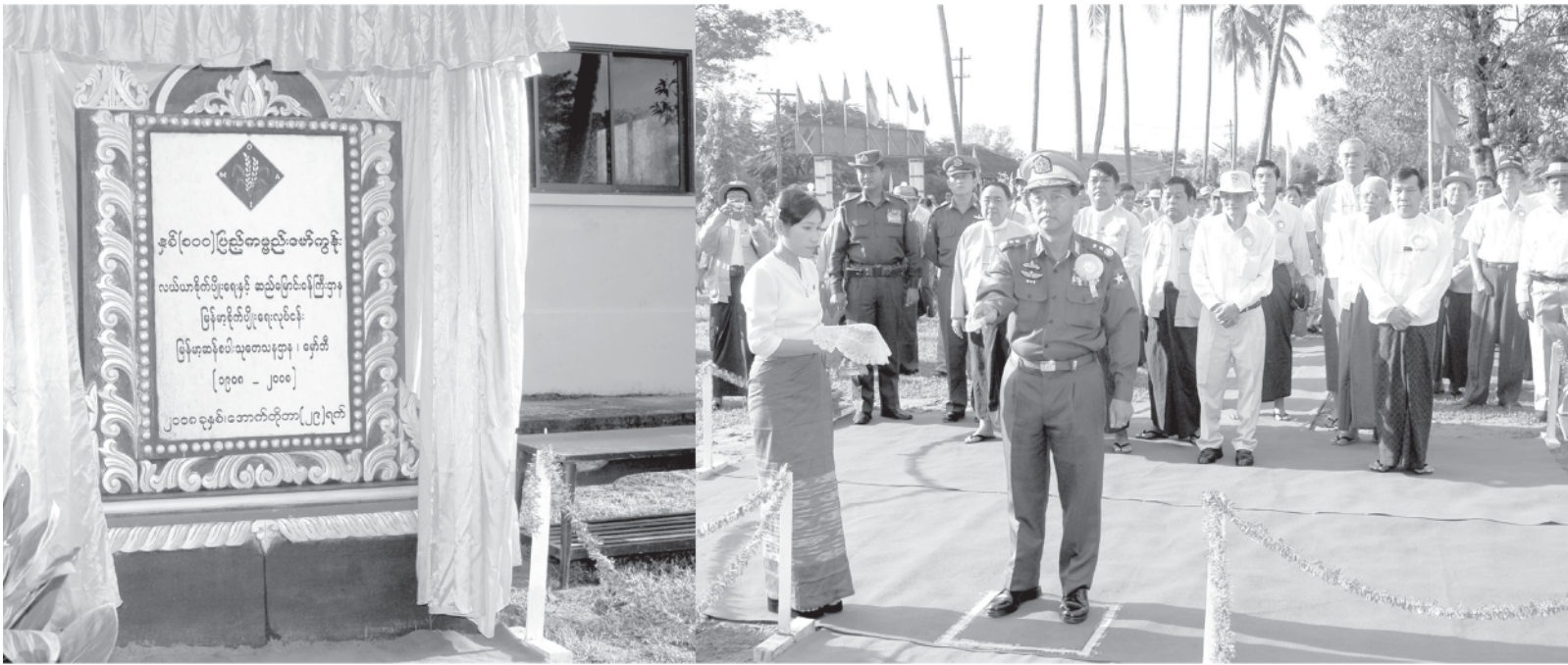
Lt-Gen Myint Swe unveils stone plaque to mark the centenary of Myanmar Rice Research Institute (Hmawby).

After the opening ceremony, Lt-Gen Myint Swe and party visited