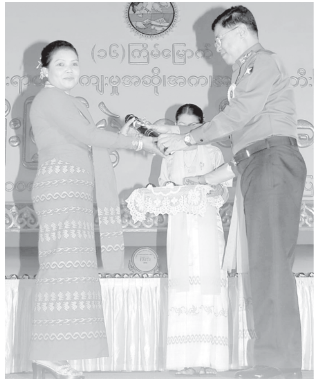
Vice-Admiral Soe Thein gives away first prize to Daw Swe Swe Aung of Mandalay Division in amateur level (first class) women's old/modern song contest. —MNA