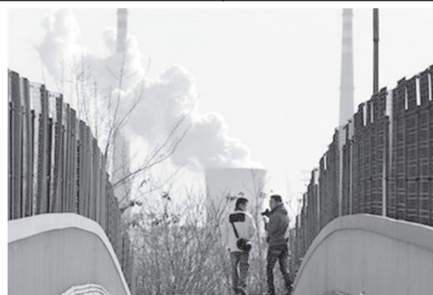
A file photo shows a water cooling tower at a Beijing power plant. China warned on Wednesday its heavy dependence on coal made it difficult to control greenhouse gas emissions.