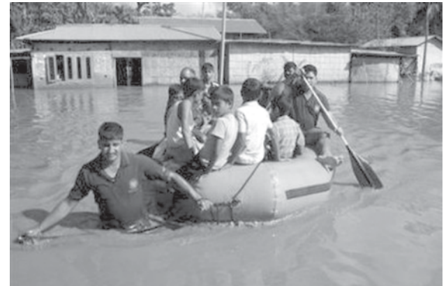
Rescuers from National Disaster Relief Force evacuate flood-affected children to safer grounds after heavy rains in Puthimari village, about 80 km (50 miles) from the northeastern Indian city of Guwahati, on 28 Oct, 2008.