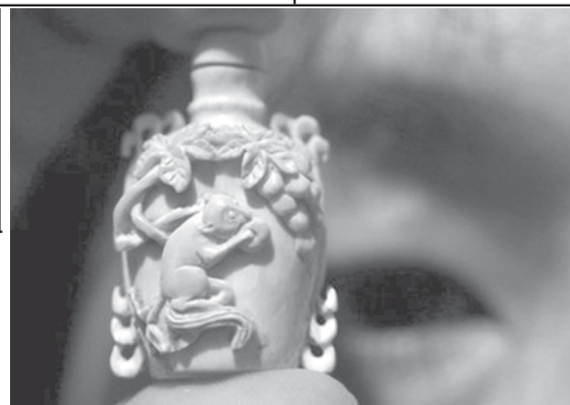
A man displays an ivory snuff bottle at an exhibition in Taipei in August. Namibia has sold more than seven tonnes of ivory for $1.1m in the first legal auction of elephant tusks in nearly a decade — exclusively for Chinese and Japanese buyers.—INTERNET

most of its sales, around Android, while business-focused devices will be based on Microsoft Corp’s (MSFT.O) Windows Mobile.—Internet