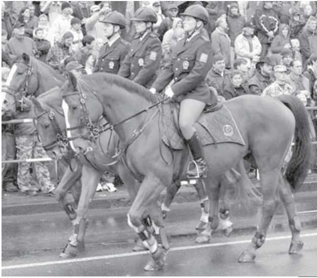
Police rangers take part in a military parade for the celebration of Czech's National Day in Prague, capital of the Czech Republic, on 28 Oct, 2008.