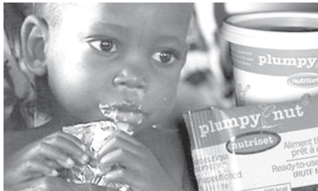
Every year, 5 million children die worldwide from malnutrition. That's one child every six seconds. Now, the relief group Doctors Without Borders says it has something that can save millions of these children. It's called "Plumpy'nut" - a ready to eat and cheap to produce food.

Officials from the Defense Ministry said the Liberation Tigers of Tamil Eelam (LTTE) launched an air attack at the Kelani-Tissa power plant late Tuesday night and "caused minor damages to the premises." Local media quoted military sources as saying that the Colombo bombing came shortly after LTTE aircraft attacked Taladdi military base in the northern Mannar district around 11 p.m (1730 GMT).