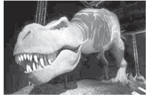
A full scale model of a ‘Tyrannosaurus rex’ is put on display at a new exhibit ‘The feast of dinosaurs’ at Palais de la Decouverte museum in Paris.

The researchers performed CT scans and measured fossilized skulls of meat-eating dinosaurs, known as theropods, including huge predators, smaller raptors