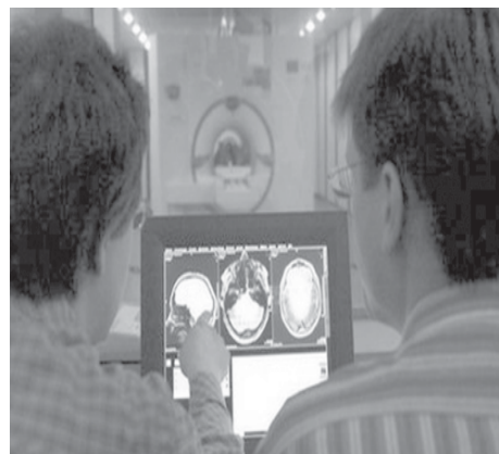
Researchers at the University of Cambridge said they have found that alemtuzumab, a drug originally developed to treat leukaemia, can halt and even reverse the debilitating effects of multiple sclerosis (MS).