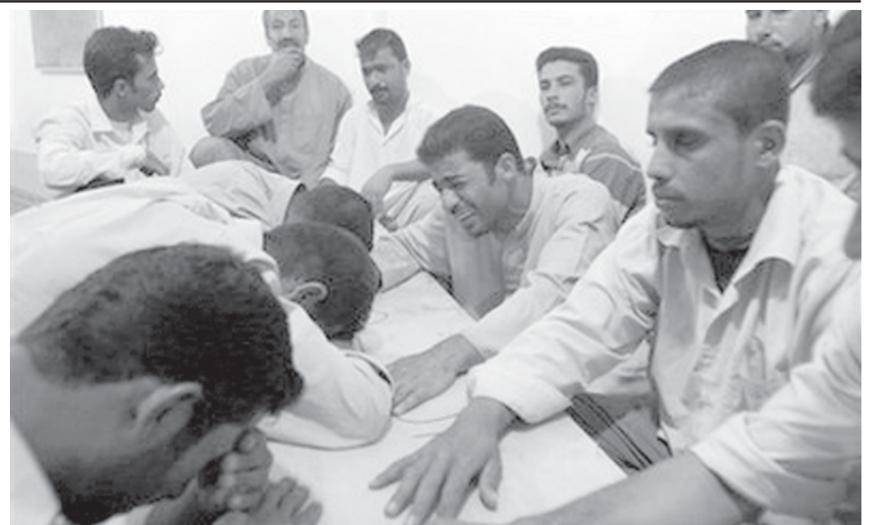
Iraqi men mourn over the coffin of a relative in a mosque, in Karbala, 80 kilometres (50 miles) south of Baghdad, Iraq, on 22 Oct, 2008. Iraqi officials Wednesday reported finding mass graves with the remains of 34 people, most believed to have been Iraqi Army recruits waylaid three years ago by al-Qaeda gunmen as they travelled to a training base near the Syrian border.