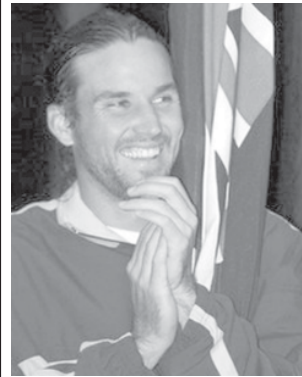
Two-time US Open champion Pat Rafter.

BRISBANE (Australia), 23 Oct —Brisbane's new 82 million Australian dollar ($55 million US) tennis centre has been named after two-time US Open champion Pat Rafter.