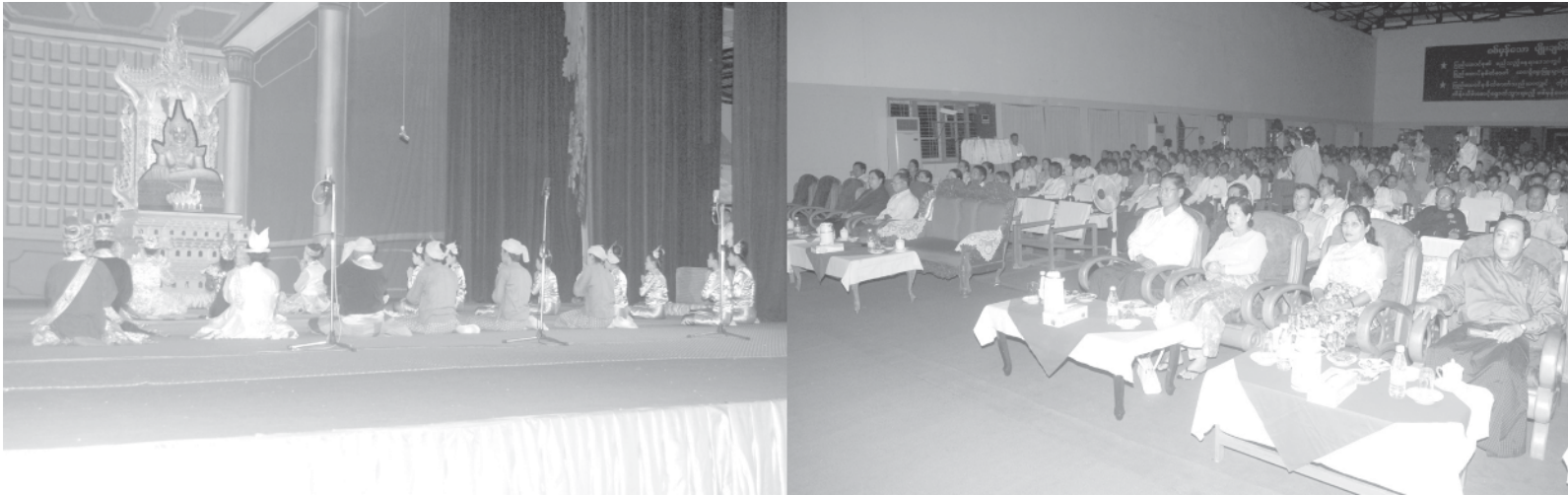
Drama troupe representing Mandalay Division stages Buridat Drama.

NAY PYI TAW, 23 Oct — The Buridat Drama Contest of the 16 th Myanmar Traditional Cultural Performing Arts Competitions continued at the Convocation Hall of the University of Veterinary Science here this evening.