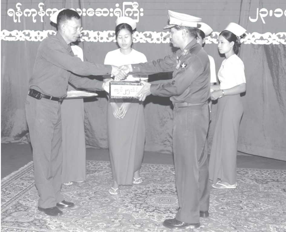
Lt-Gen Myint Swe accepts cash donation from a wellwisher for construction of annexe of Yangon Children’s Hospital.

Afterwards, Lt-Gen Myint Swe attended a ceremony to donate cash to the construction of the annexe presented by 92 donors for the third time.