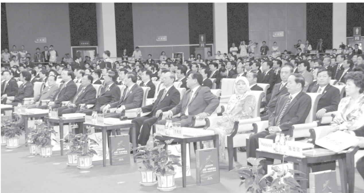
Prime Minister General Thein Sein attending opening of 5 th China-ASEAN Expo.

ASEAN is taking effective measures for greater economic cooperation in the region with an object of forming an ASEAN economic community.