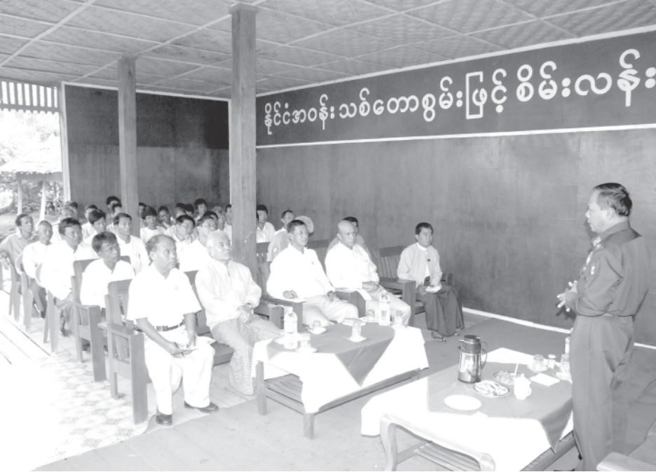
Minister for Forestry Brig-Gen Thein Aung meets local people at Natkanle forest camp in eastern Mount Popa of Kyaukpadaung Township. — FOREST

At the briefing hall, the minister heard reports on establishment of the factory and investment presented by officials.