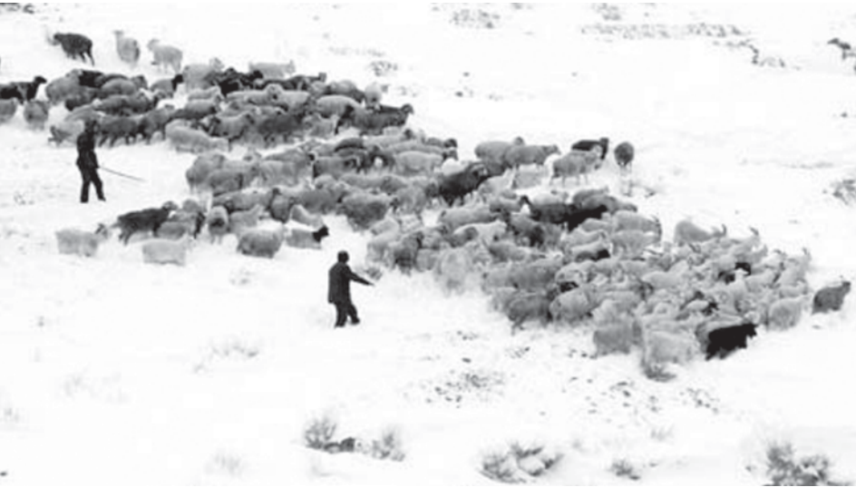
Herdsmen herd sheep in snow in Hami, northwest China’s Xinjiang Uygur Autonomous Region, on 21 Oct, 2008. A heavy snow hit the north of Hami from Monday to Tuesday, causing some inconvenience to the local stockbreeding industry and transportation. — XINHUA

The accident prompted a temporary close of Runway No 16 at Zurich Airport. The rescue service has yet to release more information about the staff abroad the plane.—Xinhua