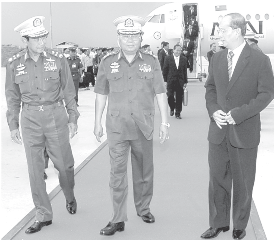
Senior General Than Shwe welcomes back Prime Minister General Thein Sein at Nay Pyi Taw Airport in Nay Pyi Taw.