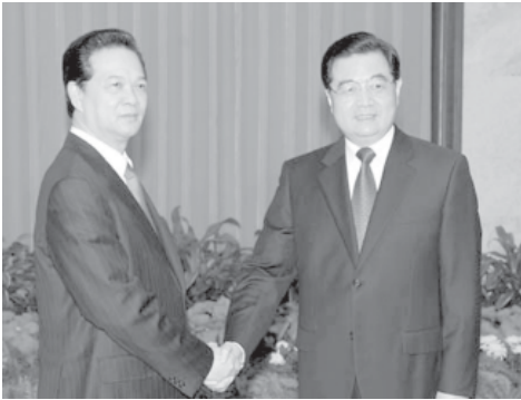
Chinese President Hu Jintao (R) meets with visiting Vietnamese Prime Minister Nguyen Tan Dung.

Vietnam was willing to resolve disputes with China concerning the issue in a spirit of cooperation and brotherhood