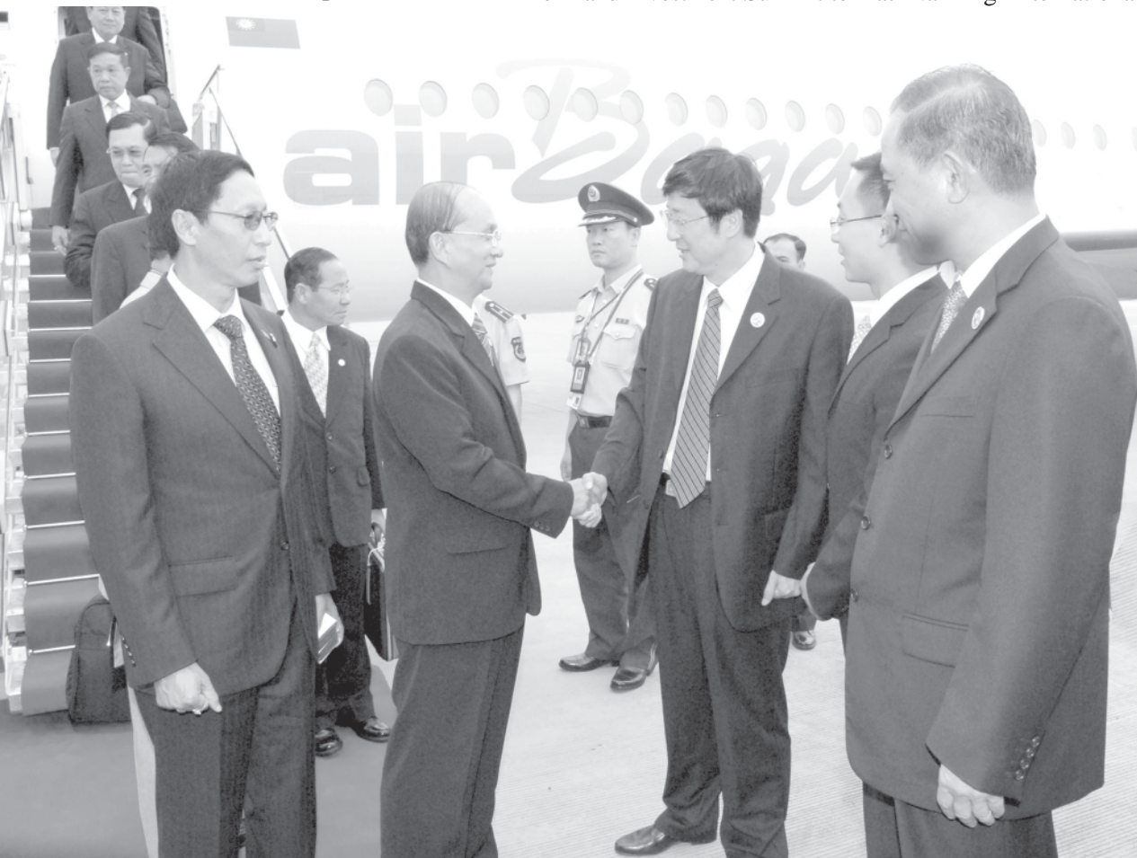
Prime Minister General Thein Sein being welcomed by Permanent Committee Member of Guangxi Zhuang Autonomous Region Mr Shen Bei Hai.