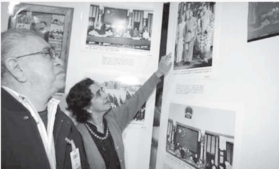
Visitors view the picture exhibition titled “Tibet of China” in Mexico City, on 21 Oct, 2008. The exhibition, initiated by the Chinese Embassy in Mexico, the China-Mexico Friendship Group of the Chamber of Deputies, the Cultural Commission of the Chamber of Deputies and Xinhua News Agency, was inaugurated in the Mexican Chamber of Deputies on Tuesday, where 195 images documenting Tibetan history, cultural and religious protection, and socio-economic development are exhibited.