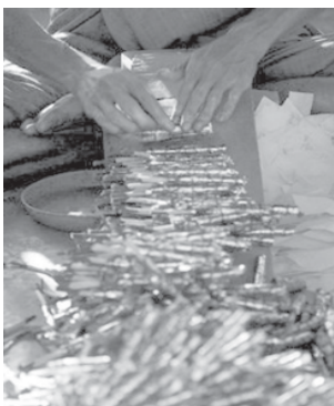
An Indian worker hand-rolls fireworks in Ahmedabad on 14 October. Eighteen people have been killed, many of them children, when an illegal fireworks factory exploded in northern India, police have said.