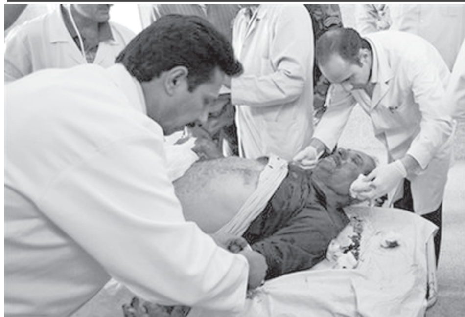
A medic treats a wounded man in al Kindi hospital, Baghdad, Iraq, on 22 Oct, 2008. A roadside bomb struck an ambulance in al Nidhal Street, in central Baghdad.