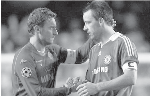
Chelsea's John Terry (R) shakes hands with AS Roma's Francesco Totti after their Champions League soccer match at Stamford Bridge in London on 22 Oct, 2008.

Until the goal Roma, who had been thrashed 4-0 by Inter Milan in Serie A at the weekend, held out with few problems against a team who had been scoring for fun in the Premier League.— Internet