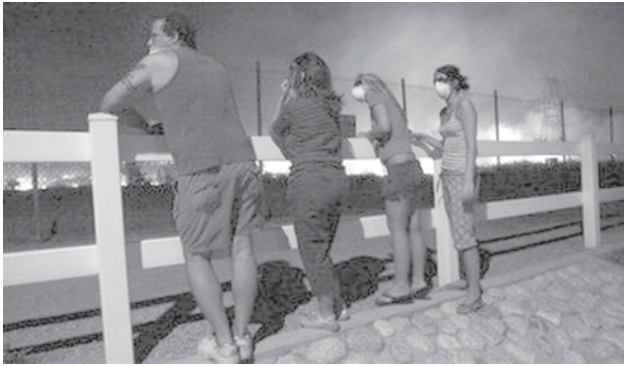
Residents watch as a brush fire fanned by Santa Ana winds burns out of control in Fontana, California on 22 Oct, 2008.

RANCHO CUCAMONGA, 23 Oct—Hot, dry Santa Ana winds — and a high risk of wildfires — returned to Southern California on Wednesday, but firefighters quickly jumped on the small brush blazes that erupted.