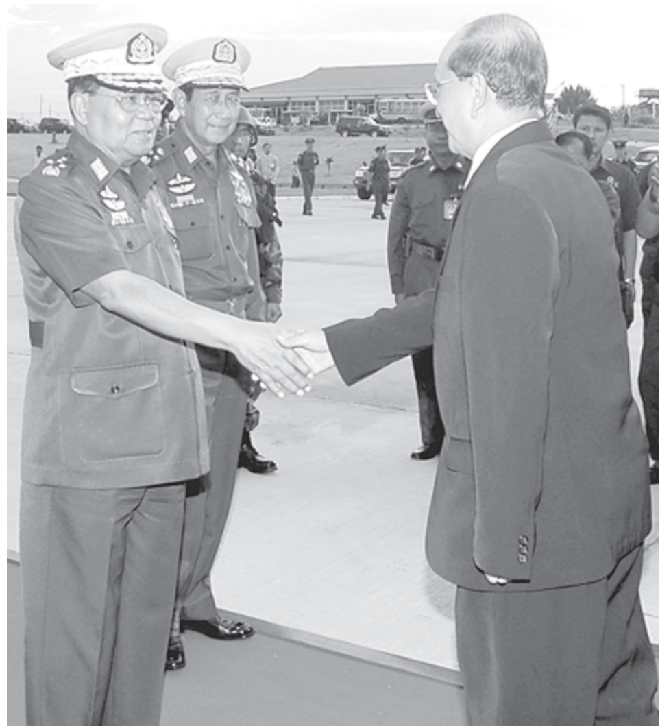
Senior General Than Shwe greets Prime Minister General Thein Sein at Nay Pyi Taw Airport in Nay Pyi Taw.