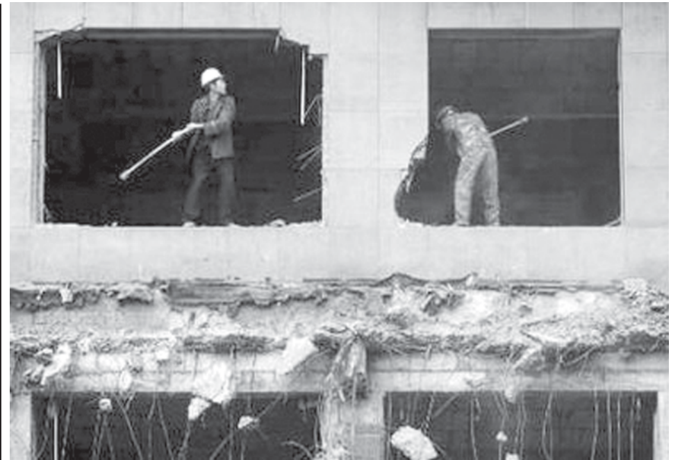
Workers demolish a building in Suining, Sichuan Province on 23 Oct, 2008. China's Ministry of Finance on Wednesday announced a series of policy changes that will make it easier for people to buy their first homes, fleshing out a directive approved last week by the cabinet.

Dalian Hanovo Foods was not immediately available for comment. A woman in the quality supervision department at Dalian Greensnow said she knew nothing about the recall.