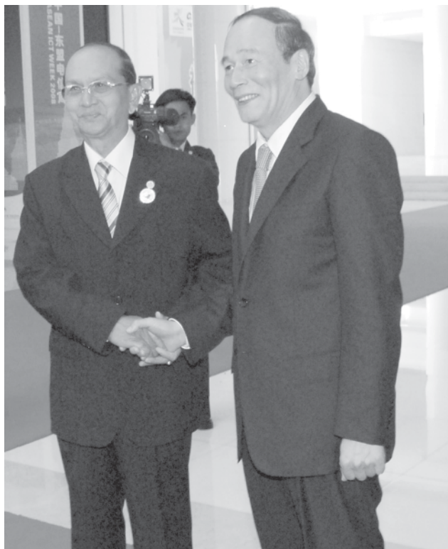
Prime Minister General Thein Sein shakes hands with Chinese Vice-Premier Mr Wang Qishan at International Convention Center in Nanning.

In accordance with the motto of 5 th China-ASEAN Expo and 5th China-ASEAN Business & Investment Summit "Broader Vision, Move Action", efforts for cooperation in various areas are to be stepped up effectively.