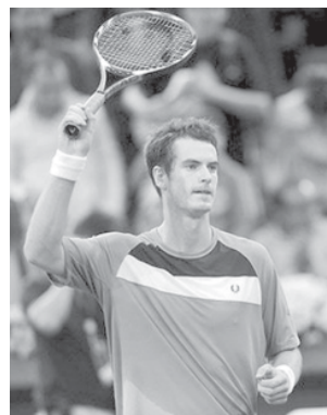
Britain's Andy Murray.

Third-seed and last year's runner-up Fernando Verdasco needed