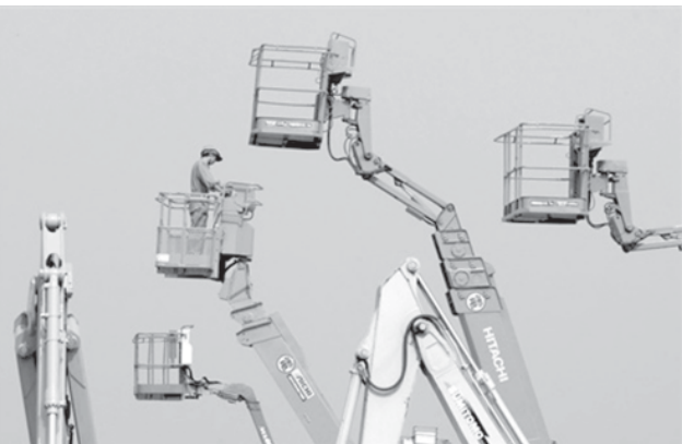
A worker stands on a crane which is parked at a construction site at Keihin industrial zone in Kawasaki, south of Tokyo on 22 Oct, 2008.

SHIPPING AGENCY DEPARTMENT MYANMA PORT AUTHORITY AGENT FOR: M/S ADVANCE CONTAINER LINES PTE LTD Phone No: 256908/378316/376797