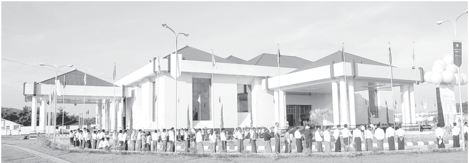
Myawaddy Bank in Nay Pyi Taw. (News on page 16)