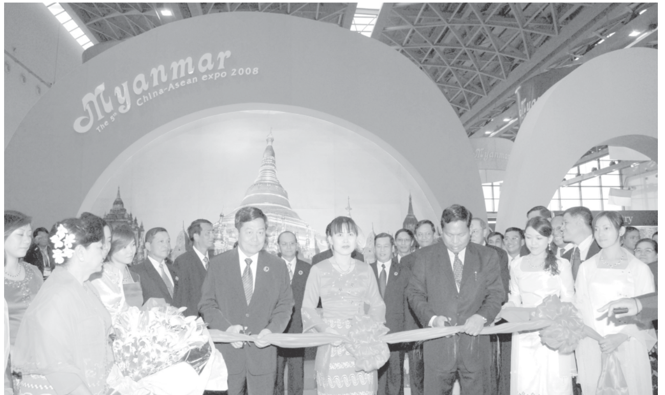
Prime Minister General Thein Sein attends opening of Myanmar booths by Minister for Commerce Brig-Gen Tin Naing Thein and UMFCCI President U Win Myint at 5th China-ASEAN Expo.—MNA

NAY PYI TAW, 23 Oct—Prime Minister General Thein Sein attended the opening ceremony of the Myanmar pavilions to be exhibited in the 5 th China-ASEAN Expo at Nanning International Convention and Exhibition Centre in Nanning, Guangxi Zhuang Autonomous Region of the People's Republic of China on 21 October.