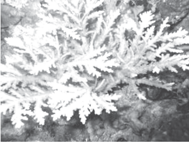
Acropora pichoni from Kimbe Bay.