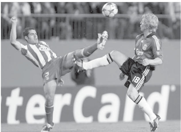
Atletico Madrid's Antonio Lopez (L) and Liverpool's Dirk Kuyt try to control the ball during their Champions League soccer match at Vicente Calderon stadium in Madrid on 22 Oct, 2008.

MADRID, 23 Oct —Simao Sabrosa scored a late equaliser to cancel out Robbie Keane's first-half strike as Atletico Madrid and Liverpool shared an entertaining 1-1 draw in their Champions League Group D match on Wednesday.