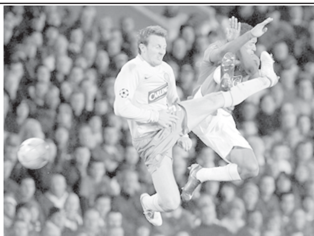
Celtic's Scott Brown (L) challenges Manchester United's Nani during their Champions League Group E soccer match in Manchester, northern England on 21 Oct, 2008.