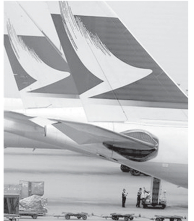
File photo shows Cathay Pacific aircraft at Hong Kong International Airport. Cathay Pacific on 23 Oct denied market rumours that it was planning a takeover of British Airways.

of BA rose on Wednesday on speculation that the firm was a takeover target.