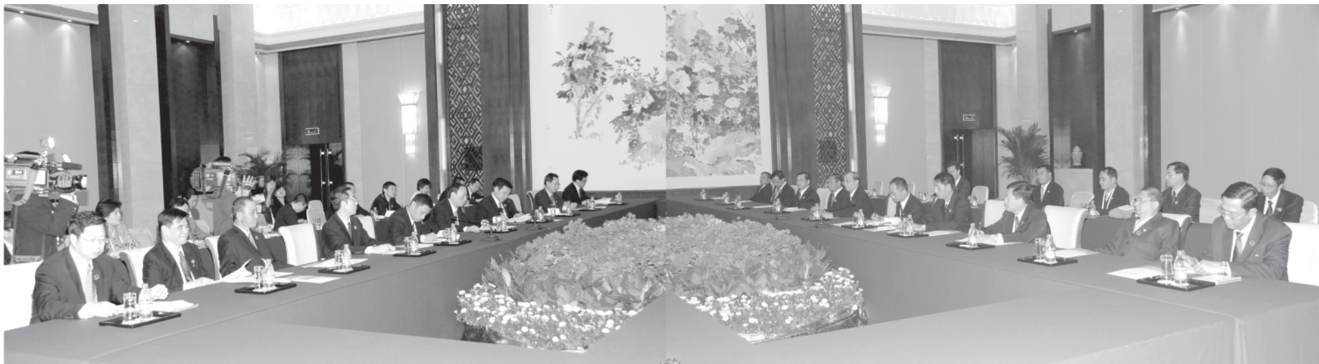
Prime Minister General Thein Sein and Chinese Vice-Premier Mr Wang Qishan hold discussions on bilateral cooperation in Nanning.