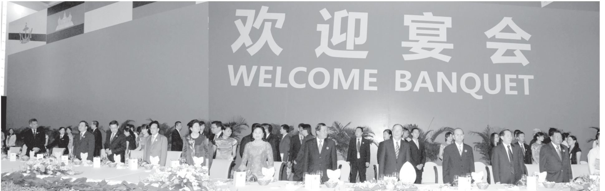
Prime Minister General Thein Sein attends banquet hosted in honour of 5th China-ASEAN Expo and 5th China-ASEAN Business and Investment Summit.— MNA

NAY PYI TAW, 23 Oct — Prime Minister of the Union of Myanmar General Thein Sein attended a banquet hosted by the Government of the People's Republic of China at International Conference Centre at Li Yun Hotel in Guangxi Zhuang Autonomous Region, Nanning on 21 October, to mark the 5th