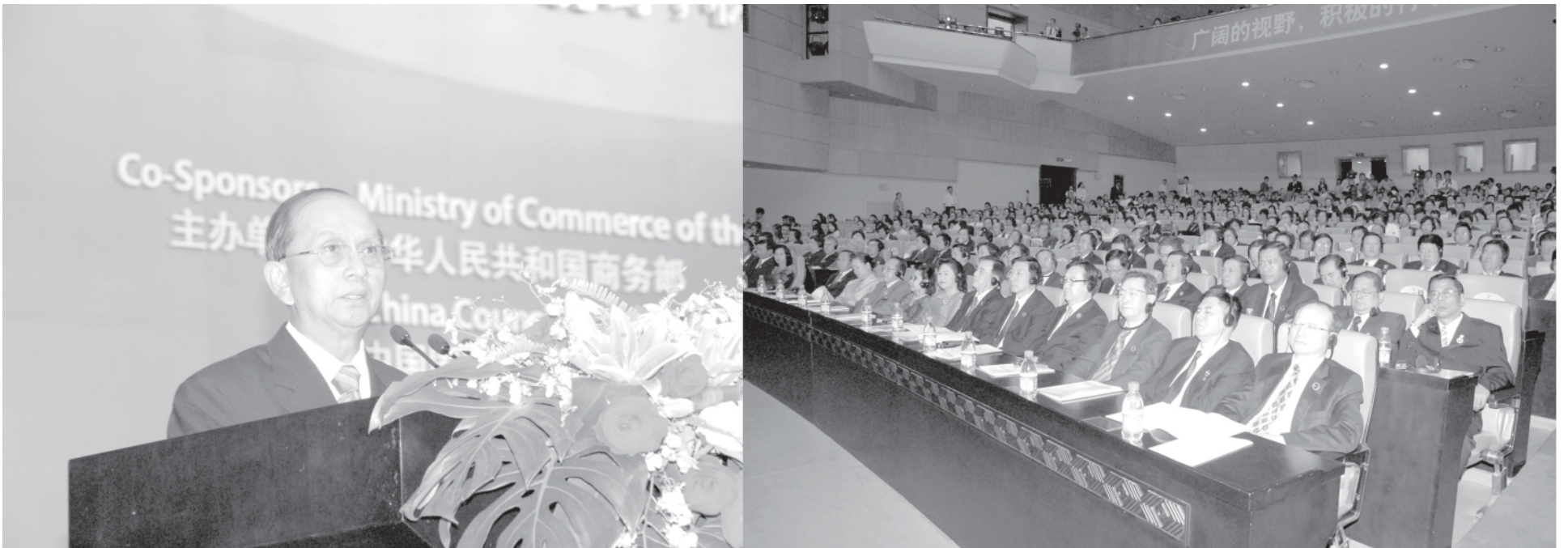
Prime Minister General Thein Sein delivers an address at 5 th China-ASEAN Business & Investment Summit. —MNA

NAY PYI TAW, 23 Oct —Prime Minister of the Union of Myanmar General Thein Sein delivered an address at the 5 th China-ASEAN Business and Investment Summit at the People's Hall of Guangxi in Nanning, Guangxi Zhuang Autonomous Region of the People's Republic of China yesterday.