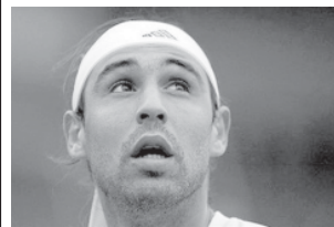
Cypriot Marcos Baghdatis.

BASEL, 23 Oct —Former finalist Marcos Baghdatis lost 6-2, 4-6, 6-2 to Marcel Granollers at the Swiss Indoors Wednesday, but emerged smiling after finally completing a match following injury.