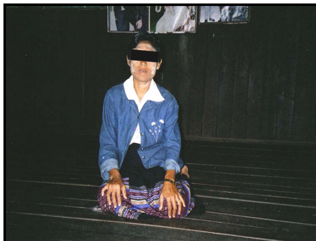
This 44 year old village headwoman in Pa'an Township of Thaton District was detained by local DKBA Brigade #333 forces in February 2006. They slapped her in the face, extorted 100,000 Kyat in cash from her, and ordered her to show them the houses of people connected to the KNU. [Photo and caption: KHRG]

It is the belief of the WLB that the historical traditions of gender inequality are so entrenched in Burmese cultural belief that the establishment of legal equality will be a nominal triumph only, and carry little weight in ensuring that women assume their rightful place as equal citizens. Only through a campaign of positive discrimination and affirmative action can women be quickly advanced to the higher levels of policy-making, where they can make the necessary changes to ensure true equality, and a state of genuine democracy in Burma. 22