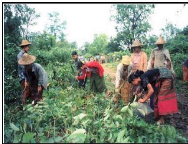
Women from Bilin township, Thaton District doing forced labour cutting back the scrub from beside the Bilin – Papun vehicle road. Landmines are a constant threat in this work.

Traditionally men have been required to carry out the more physically demanding forced labour tasks, while women have been required for lighter tasks, such as collecting water or cooking. However, women are increasingly being called upon to conduct more arduous tasks, including clearing brush, portering the military's equipment, or working as messengers. One such role in which women are increasingly being employed is in the removal of landmines, including acting as human minesweepers walking in front of military patrols. 41