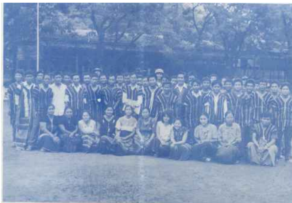
The KYO leaders and delegates attending annual central committee meeting