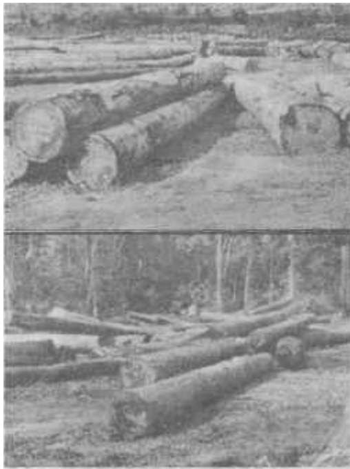
These logs await export from border area to Thailand by Saw Maung Military Junta.

to be poor is no disgrace. To squander the abundant natural resources of a once great and respected Asian Nations in pursuit of absolute power is less excusable. To conspire in the production and exportation of the seeds of death and destruction in order to maintain that power demonstrates spiritual bankruptcy of the lowest order. If there is the saving grace to be found in the Ne Win-Saw Maung catalogue of crimes against humanity, it is hard to know where to look for it.