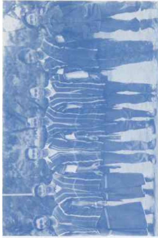
Karen youth organization central executive committee