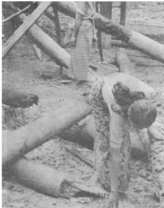
What she could collect from the ashes of her burnt house