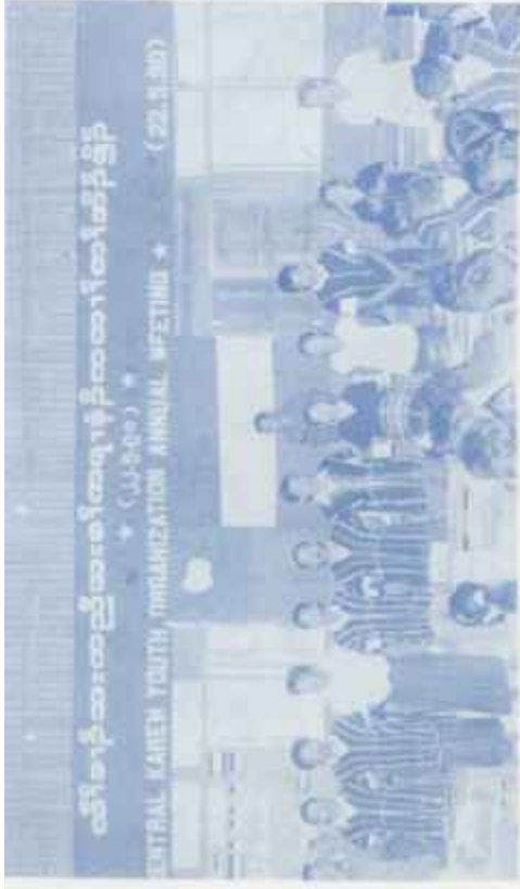
Some of K.Y.O central committee members at the annual meeting.