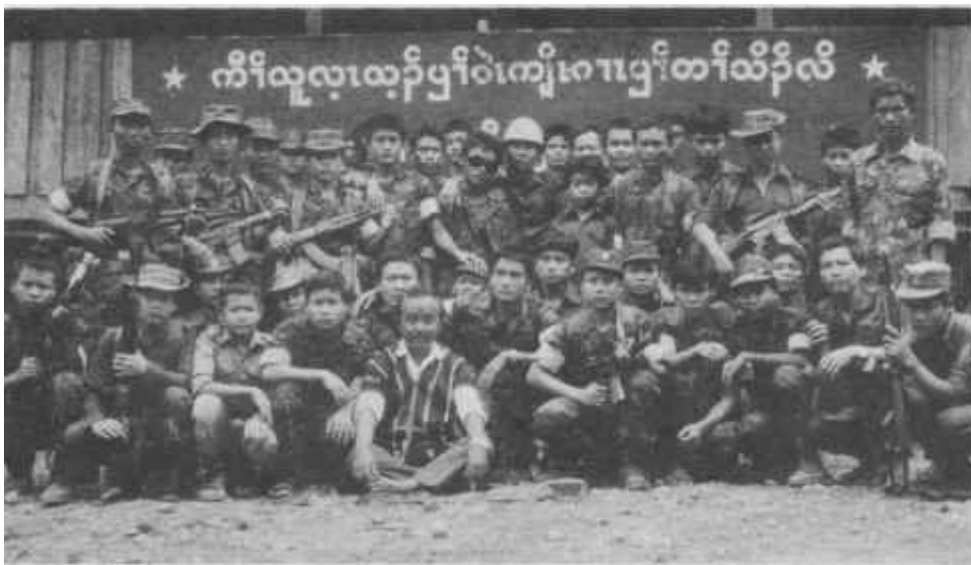
Head of the Forest department p'doh Aung San and some of the forest guards.