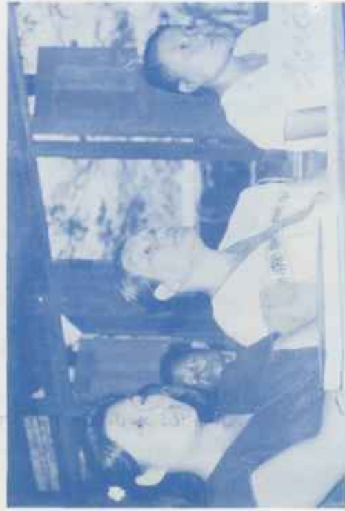
Youth delegates from Mergui/Tayoy District