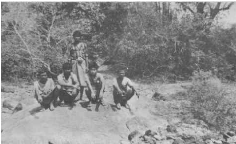
Escaped enemy porters at KNU area.

How high up the ghastly pecking order within that regime the conspiracy extends is anybody's guess but, given the tight control of all activities inside Burma it is reasonable to assume that it almost certainly goes right to the top. To corroborate this assumption it is reliably reported that one such military convoy passed through Rangoon on its way to the docks during a carefully-timed power cut. Such a diversion could hardly have been orchestrated wihtout approval at the highest level.