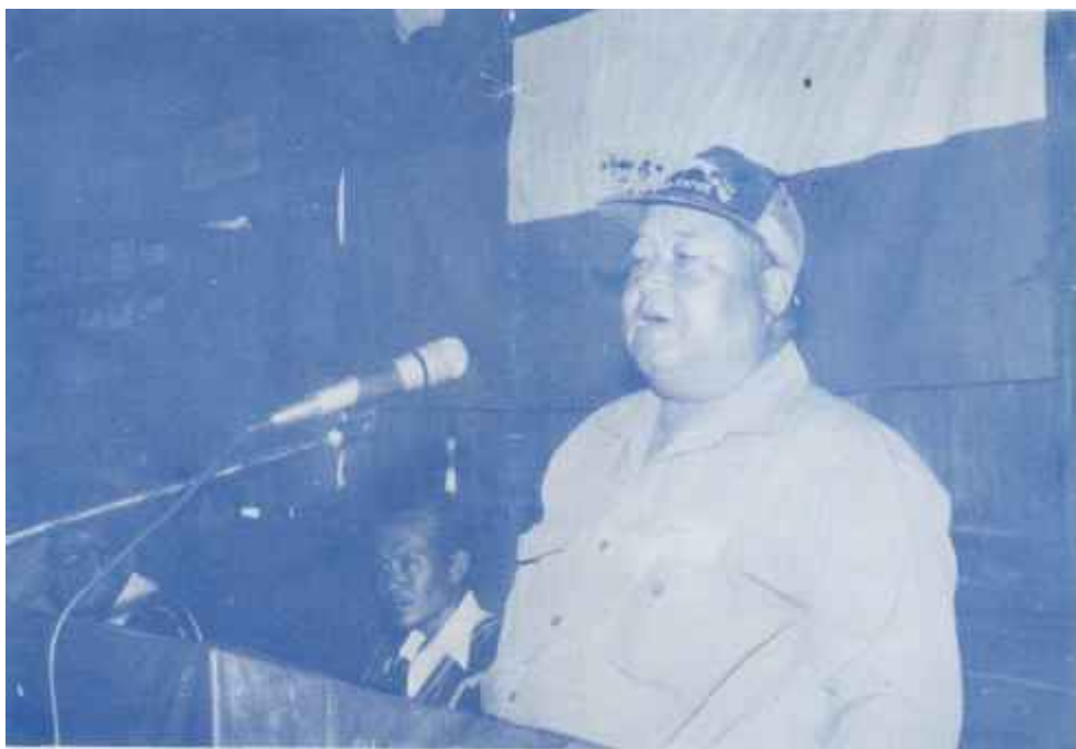
President General Bo Mya delivering a speech at KYO day.