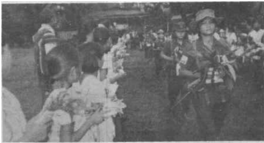
School girls awaiting to present bouquet of flowers to (DAB) soldiers returning from front line.

On 4.5.90, DAB column attacked Bi Lin, all enemy fled. In that battle (4) enemy killed including one Coy. commander and (10) wounded from No. (8) Light Infantry Bn. and (3) killed, (5) wounded from No. 96 Light Infantry Bn. and captured assorted ammos and some military equipments.