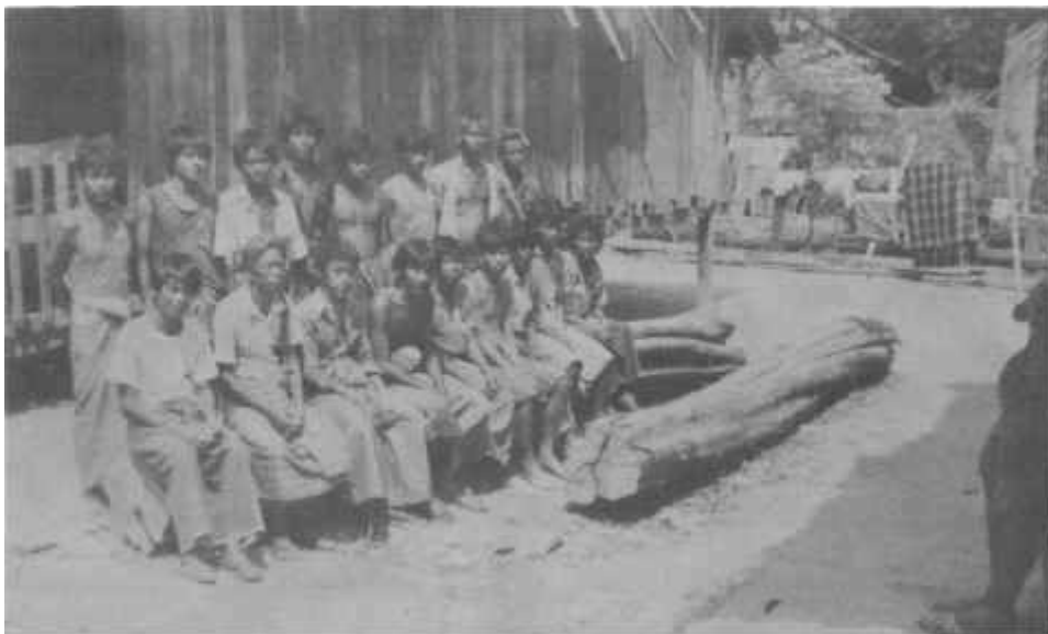
Enemy porters arrived at KNLA No. 20 regiment Head quarters

one escapee sighed and expressed in deep sorrow, "We have no enough time to eat, to sleep or even to ease ourselves in the remote jungle. We were behaved brutally by every soldier.