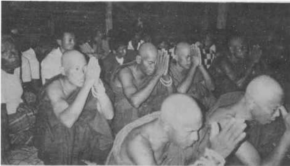
Some of The ABSDF students hearing the sacred Buddhist prayers after receiving Ordination.

Who can abolish the practice of such portage in Burma? No one can but only by means of reasonable solution to end the civil war which retarded the national unity, realization of peace and prosperity in Burma.