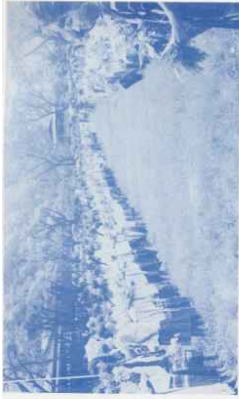
School girls line-up to welcome (DAB) soldiers returning from front line.