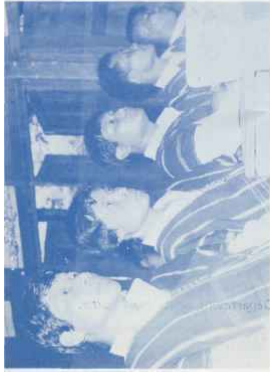
Youth delegates from Pa-an District