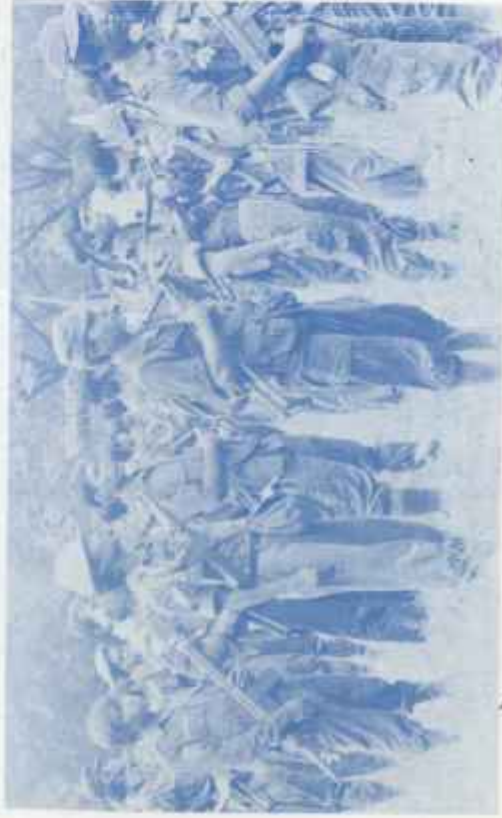
Some ASDF soldiers of DAB column returning from the fronts were warmly honoured.