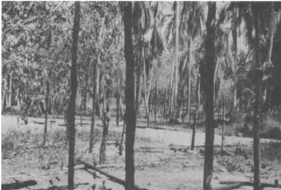
Taquilaw village was burnt down by the Burmese troops