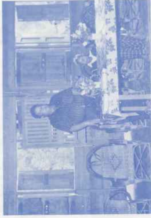
KNU President Saw Bo Mya giving speech.