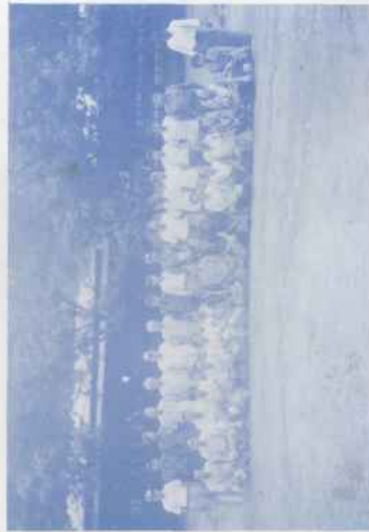
KWO leaders with NDF delegates posing after the dinner.