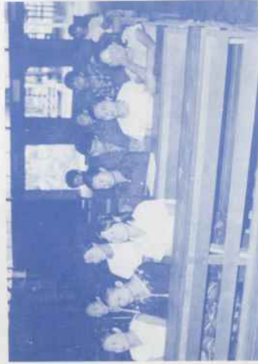
Youth leaders attending youth meeting.