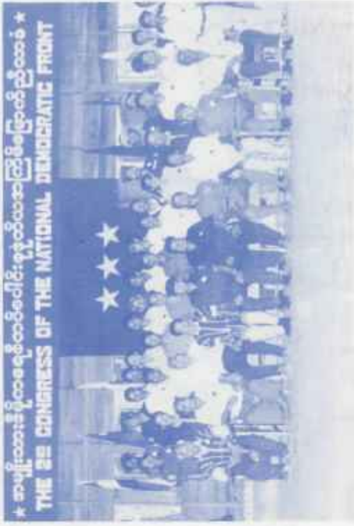
Delegates at the second NDF Congress.