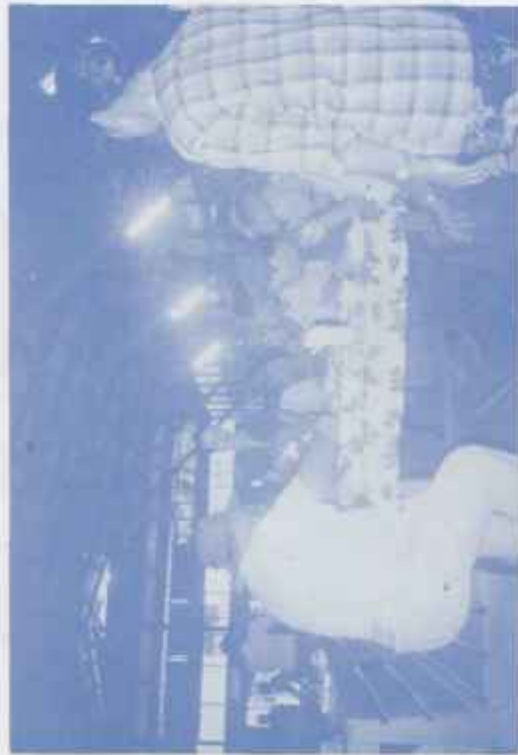
Dinner after the NDF meeting.