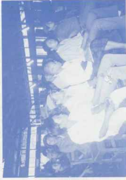
NDF Delegates attending a meeting.