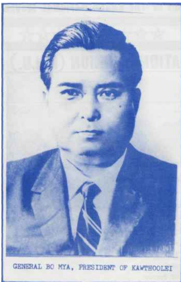
GENERAL BO MYA, PRESIDENT OF KAWTHOOLEI