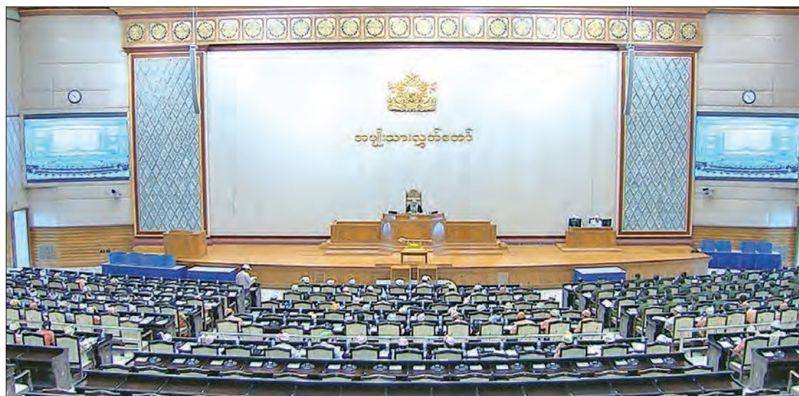
The twelfth-day meeting of the Second Amyotha Hluttaw's ninth regular session being convened in Nay Pyi Taw yesterday.