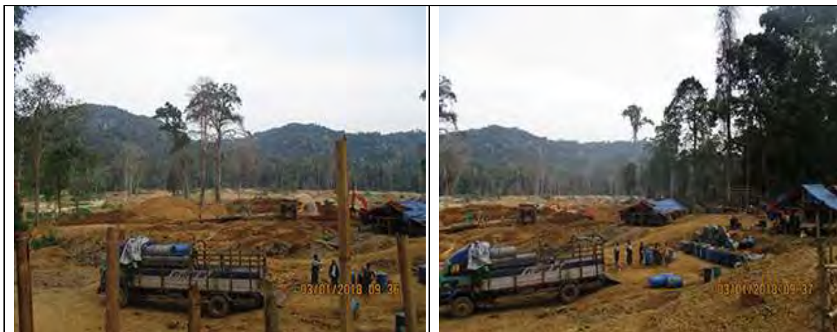
The first two photos were taken in Kay Hkee village, Kay Hkee village tract, Tanintharyi Township in January 2018. The top left photo shows lead processing. The top right photo shows lead miners excavating the land. The remaining two photos show a truck that transports gasoline to the mining area.