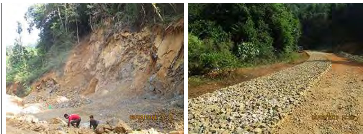
These photos were taken on March 3 rd 2018 in T’Pah village, K’Tah Kloh village tract, Tanintharyi Township. They show the road being built by Shway Kyun Aa Man Company. The company did not consult with the villagers or provide compensation for damages that it caused.