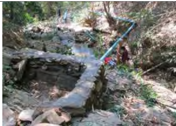
This photo was taken on March 2 nd 2014 in Kyaw Pah village, Meh Kaw village tract, Bu Tho Township, Hpapun District. The photo shows villagers setting up a water pipe at the river's mouth to transfer water to the village so that villagers can access water more effortlessly. The project is funded by the Myanmar government. 943