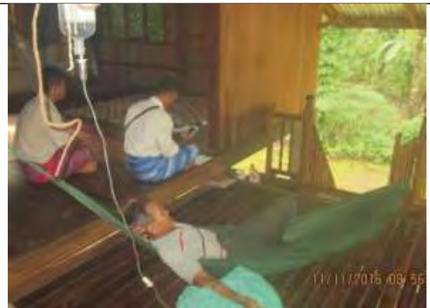
This photo was taken on November 11 th 2016 in Tha Main Dwut village, Tha Main Dwut village tract, Kawkareik Township, Dooplaya District. It shows members of the Backpack Health Worker Team (BPHWT) trying to help sick villagers by giving them medical treatment for free in Tha Main Dut village. 596