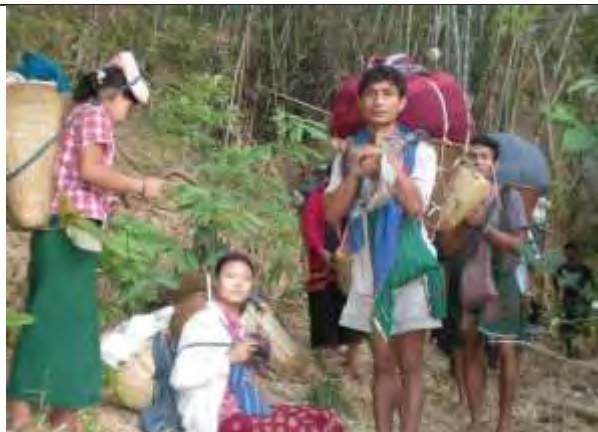
This photo was taken in April 2008, in Htantabin Township, Toungoo District. The photo shows villagers from M--- village of Htantabin Township fleeing a Tatmadaw attack. They fled through the forest to a hiding site on April 13 th 2008, loaded up with as many belongings as they could carry. 1085