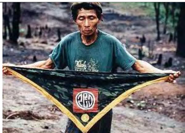
The above photo was taken between Hpapun and Thaton districts and is from a 1997 KHRG report. It shows the head of one village located in the hills between the Yunzalin and Bilin Rivers as he stands among the burned ruins of his village. In his hands he is displaying the Tatmadaw unit scarf accidentally left behind by one of the soldiers who burned the village. The scarf is marked '391/4', for SLORC (Tatmadaw) #391 Light Infantry Battalion, Company #4. 233