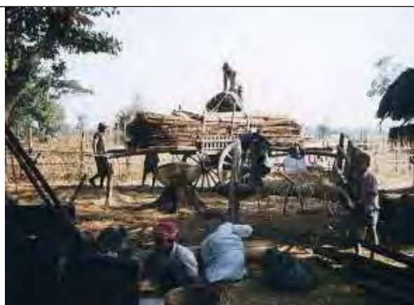
This photo was taken in January 1999 in Kyaukkyi Township, Nyaunglebin District. The photo shows villagers in the plains of Kyaukkyi Township preparing the roofing, which they were forced to strip from their own houses, to transport to the relocation site after they were ordered by Tatmadaw to move in January 1999. 1088