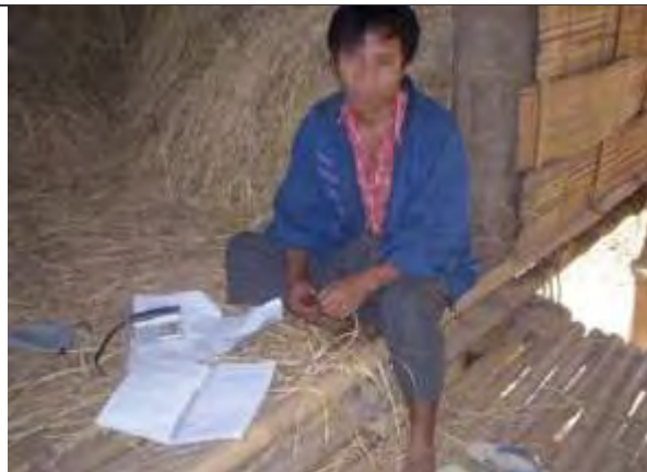
This photo was taken on February 24 th 2009. It shows Saw P---, the 39 years old head of B--- village in Bu Tho Township, Hpapun District. Saw P--- told KHRG that local DKBA [Buddhist] forces had regularly demanded 'porter fees' from the residents of his village. On December 16 th 2008, January 16 th 2009 and February 16 th 2009 the villagers had to give payments of 10,000 kyat (US$ 10.00). Furthermore, on December 25 th 2009 the villagers had to give 400 thatch shingles to the DKBA. 746