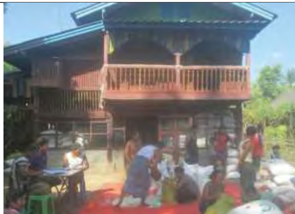
This photo was taken in December 2014 in Paingkyon Township, Hpa-an Township. The photo shows some of the rice bags that were provided by the Nippon Foundation to the villagers in conflict areas. The foundation also distributed aid in many other areas across Karen State, in both Myanmar government and KNU controlled areas. 944