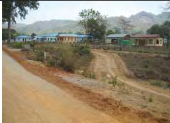
This photo was taken in April 2015 in A--- Town, Hlaingbwe Township, Hpa-an District. The new town was constructed by the Myanmar government between 2011 and 2015 on lands left behind by fleeing villagers, who left for refugee camps along the Thai-Myanmar border between 1981 and 1982. 1081