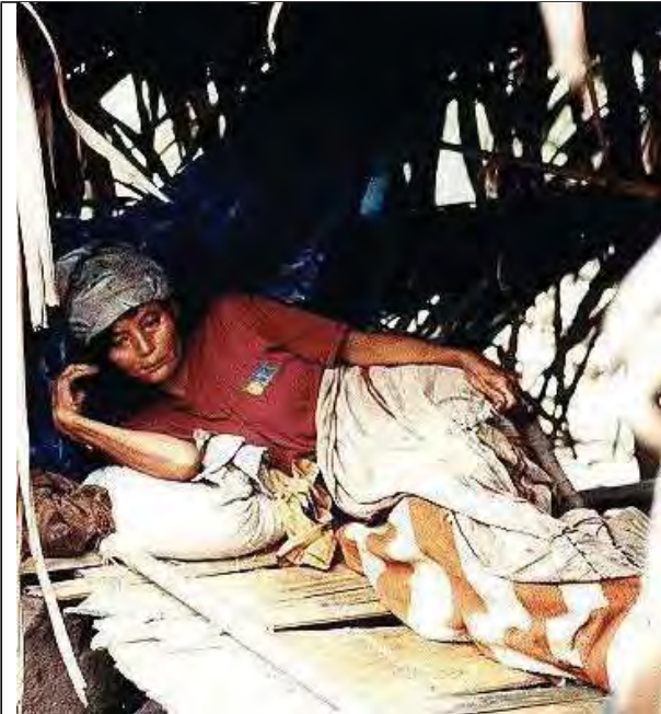
This photo, taken in eastern Nyaunglebin/Hpapun District, shows a woman who had fled her hill village due to Tatmadaw attacks in 1997. The woman is hiding in a forest shelter and had been down with serious dysentery for several days. She had no medicine, and could die from this illness. 608