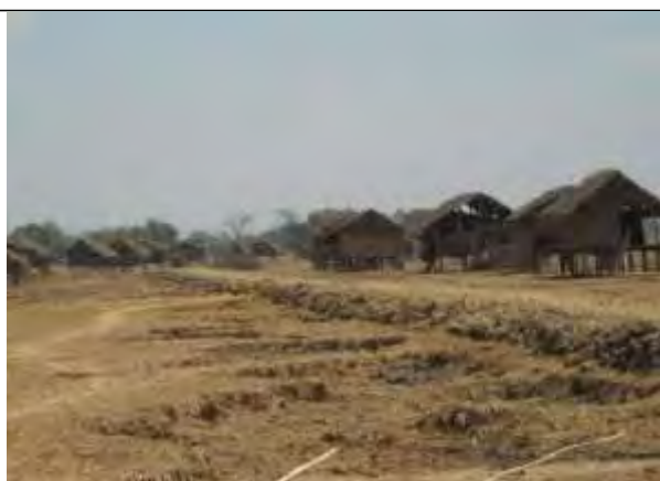
This photo of a relocation site was taken in 2006, in Kyaukkyi Township, Nyaunglebin District. Amongst those forcibly relocated to Htaik Htoo relocation site by Tatmadaw in 2006 were the residents of multiple villages in Bpa Ta Lah village tract of Kyaukkyi Township. However, on December 22 nd 2008, Tatmadaw authorities ordered the former residents of Bpa Ta Law village tract to relocate again. This time residents of three of the previously relocated villages were moved to a new site with no irrigation and located in an open area between Bpa Ta Lah and Taw Koh village. 1087