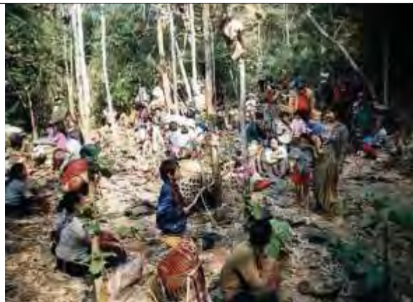
This photo was taken in January 1999 in Kyaukkyi Township, Nyaunglebin District. The photo shows a large group of villagers from the eastern hills of Kyaukkyi Township taking a rest in the forest en route to Thailand. This group of 28 families crossed the border in mid-January 1999. Ten days later they arrived at a refugee camp in northern Thailand. This group had walked for over 10 days through Tatmadaw free-fire zones to reach the border. 1086