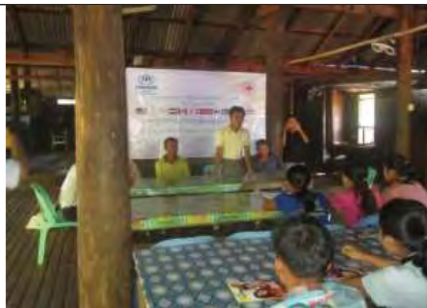
This photo was taken on October 24 th 2014 in Lay Kay village, P'Ya Raw village tract, Bilin Township, Thaton District. The photo shows the community health workers attending a three-day health care training at Lay Kay monastery in Lay Kay village provided by Red Cross Society. The training focused on the prevention of disease and Mine Risk Education (MRE). There were 15 trainees who attended the training and the host organisation provided them with 2,000 kyats per day (US$2.00). 945