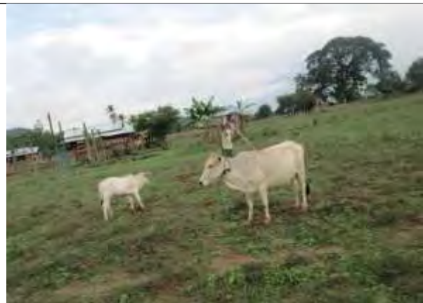
This photo was taken on June 6 th 2014 at Way Naung village, Meh Klaw village tract, Bu Tho Township, Hpapun District. A villager had tied his cow in the field, which was located in front of a plantation claimed by Tatmadaw. An unnamed Tatmadaw soldier captured the cow and demanded 10,000 kyat (US$10.00) from him the villager in return for the cow. 745