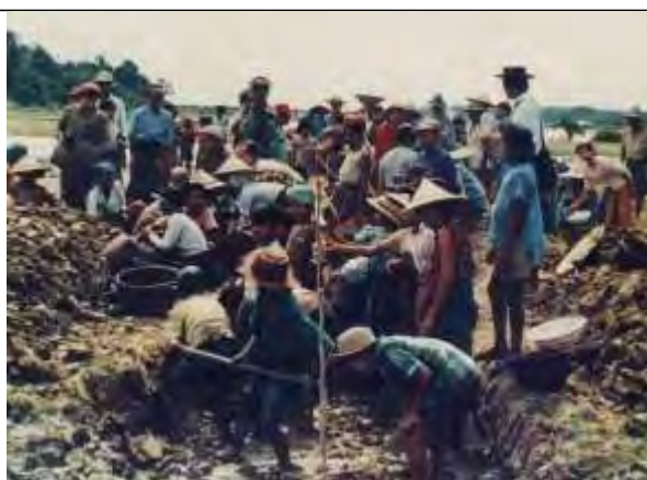
The above photo was taken in Mergui-Tavoy District, July/August 1995. It shows local Mon villagers being forced to labour by Tatmadaw on the construction of the Ye-Tavoy railway in rainy season. The photo shows the futility of forcing villagers to build embankments in rainy season. It also shows that most of the workers are women and children. The armed Tatmadaw guard can be seen in the middle of the group, centre left wearing a green camouflage uniform and hat, guarding them when they are working. 236