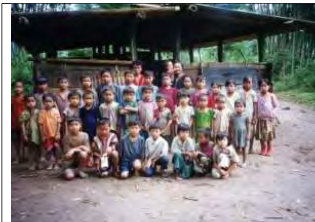
This photo was taken in July 2002. It shows students and teachers of the school at L--- hiding site in Lu Thaw Township, Hpapun District. This school only teaches classes from Kindergarten to Third Standard (Grade Three). Very few IDP schools are able to teach beyond primary school (Standard four) level because most of the teachers never had a chance themselves to study beyond Standard Four. 506