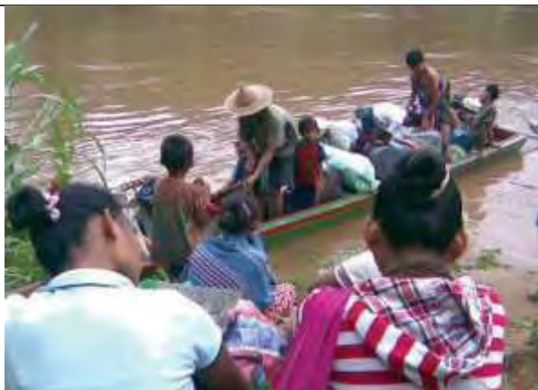
This photo was taken in June 2009, in Hlaingbwe Township, Hpa-an District. The photo shows displaced villagers from Ler Per Her IDP camp who wait to leave the area by boat as they flee to Thailand on June 5 th 2009 to avoid the joint SPDC/DKBA attacks. The IDPs made it in to Noh Boh village, Tha Song Yang District, Tak Province, Thailand in June 2009. Following their arrival in Thailand, local and international aid organisations including the Karen Refugee Committee (KRC), the Thailand Burma Border Consortium (TBBC) (The Border Consortium) and the United Nations High Commission for Refugees (UNHCR) came to provide assistance. 1083