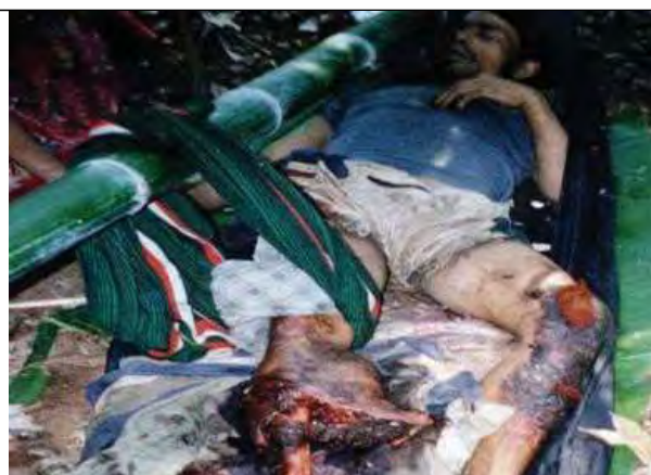
The above photo was taken in 2003, Htantabin Township, Toungoo District. It shows a 37 years old villager from Htantabin Township who stepped on a landmine planted by Tatmadaw IB #53 while going to his plantation in March 2003. In this photo his left leg is seriously injured and his right foot and lower leg have been blown off. Villagers constructed a stretcher from a bamboo pole and longyi for the injured villager, although it is unconfirmed if he survived his injuries. 235