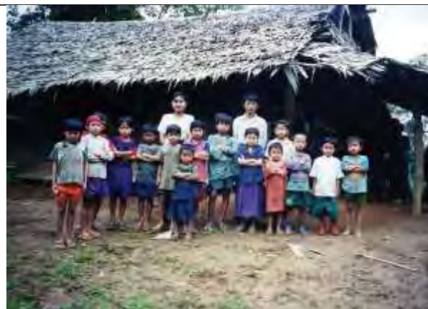
This photo was taken in July 2002. Students and teachers at a school set up by internally displaced villagers at T--- in Lu Thaw township, Hpapun District. Whenever the villagers hear an approaching Tatmadaw column, they must close the school and flee deeper into the mountains. 507