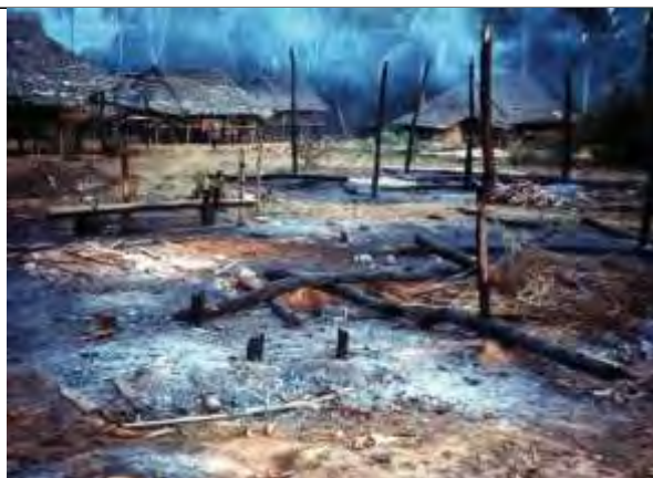
The above photo was taken on January 18 th 2002, Hpa-an District. It shows Day Law Pya village as it was burnt by DKBA soldiers from DKBA #999 Brigade. Villagers' paddy supplies were also destroyed in Day Law Pya village, Hpa-an District. 234