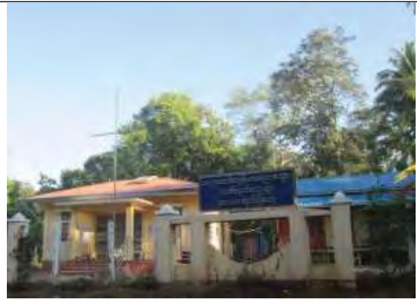
This photo was taken on November 29 th 2015 in Tha Main Dwut village, Tha Main Dwut Village Tract, Kawkareik Township, Dooplaya District. It shows a clinic constructed by the Myanmar government health department. However, since the clinic was constructed there have been no health workers or medicines. For these reasons, villagers couldn't use it. 594