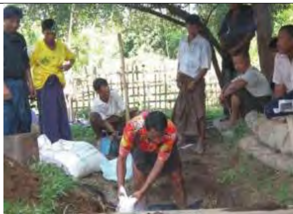
This photo was taken on November 24 th 2014 in Hway Hsan Village, Meh Klaw village tract in Bu Tho Township, Hpapun District. The photo shows villagers preparing to make natural fertilizer during the short-term two-day training course that was conducted by Shwe Yaung Lwin Pyin (Golden Land) association and Help Age International in Hway Hsan village. The training focused on making and processing natural fertilizer which aims to support agriculture for villagers. 946