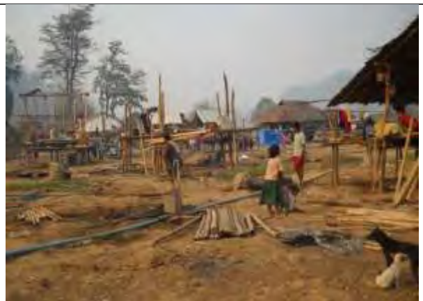
This photo was taken in March 2010, in Mae U Su refugee site, Tha Song Yang District, Tak Province. The photo shows refugees from Ler Per Her dismantling their huts and burning trash in preparation for their departure from Mae U Su refugee site. Refugees interviewed by KHRG and other community-based organisations stated that they did not yet feel secure to return to their villages, but that the Thai authorities had made it clear to them that they would not be permitted to remain in the site and Thai authorities had set the end of March as the deadline for refugees to depart. Some returning refugees told a KHRG field researcher that they worried about food shortages because they would not dare to work in their farm fields because they feared landmine contamination. 1084