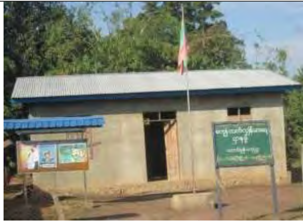
This photo was taken on January 18 th 2017 in Taung Soe village, Si Pyay village tract, Win Yay Township, Dooplaya District. This photo shows a local clinic in Taung Soe village. According to villagers, there are not enough health workers at this clinic and the health workers do not always stay at the clinic so villagers continue to face troubles when they are sick. 593