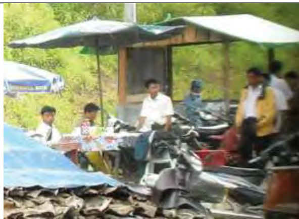
These photos were taken on August 27 th 2009. The photo on the left shows a truck stopped outside a checkpoint along Asia Highway 1, at the Special Industrial Zone in the Thin Gan Nyi Naung area, which is outside Myawaddy Town on the road from Myawaddy to Kawkaeik in Dooplaya District. The photo on the right shows officials operating the checkpoint, including another checkpoint near Thin Gan Nyi Naung. This checkpoint is manned by Tatmadaw soldiers, immigration officials, Na Sa Ka (Tatmadaw immigration officers) and soldiers from the DKBA (Buddhist) and KPF (Karen Peace Force). The Asia Highway 1 is one of the major routes linking overland trade between Thailand and Myanmar. It is also home to an extensive network of checkpoints and tollgates, which must be paid by travellers and traders if they wish to pass. 747