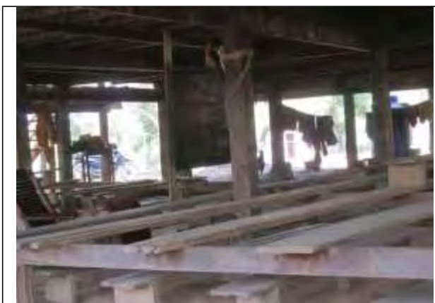
This photo was taken on December 31 st 2014. It shows a temporary teaching place in A'pa Lon village, Win Yin Township, Dooplaya District, which is under a monastery as there is no school in this village. In total there are 65 students from Kindergarten to Sixth Standard. The students are divided into two groups to be taught as they don't have enough space for more classes. One group is taught under the monastery, the other group of students is taught outside. 508