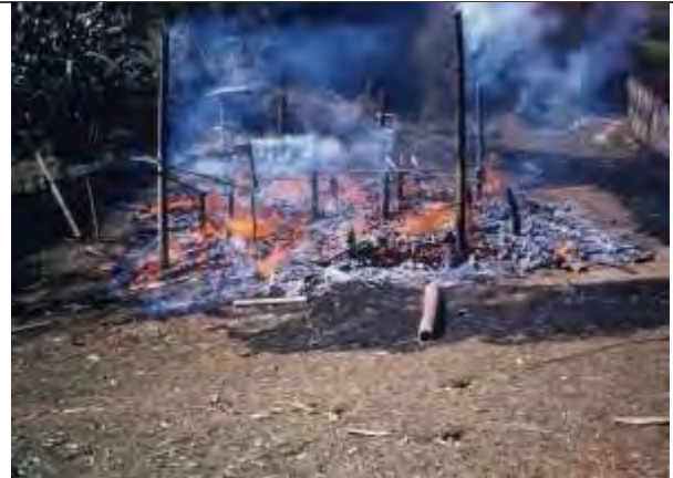
This photo was taken in January 2000, in Lu Thaw Township, Hpapun District. On January 16 th 2000 at 7:30 am, SPDC troops came to drive the villagers out of Tee Ler Kee village in Hpapun District. The villagers fled, and the troops shot up the village and burned some of the houses, then left. This picture was taken just after the troops had left the village. 1082