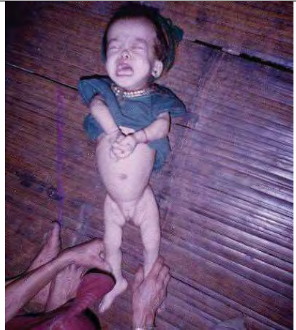
This photo from a 1994 KHRG report shows a sick and malnourished baby Karen girl in Thaton district. Infant mortality in these areas was extremely high due to Tatmadaw offensives, looting, extortion, and the Tatmadaw blockade against any medicines entering this 'insurgent' area. 609