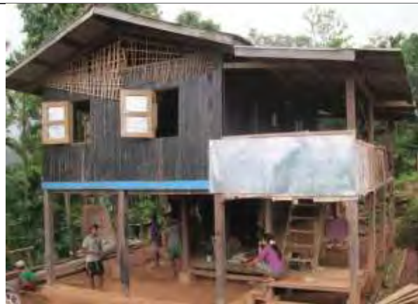
This photo was taken on June 6 th 2016, in Cow Thaw Cow village, Hon Thaw Plo village tract, Thandaunggyi Township, Toungoo District. It shows a KDHW clinic with health administrators who operate under the KNU health department. The health workers do not have enough medicines however they try to take care of local villagers as much as they can. 595