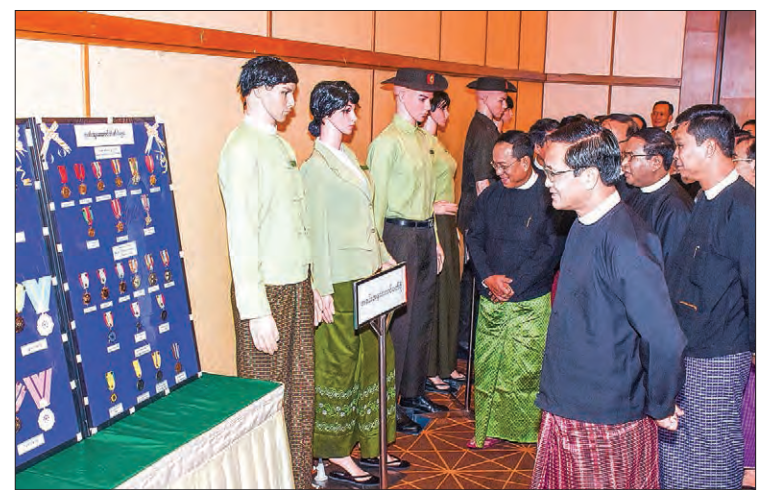
Vice President U Henry Van Thio visits the booth set up at anniversary of the General Administration Department.

After delivering the speech, the vice president presented prizes