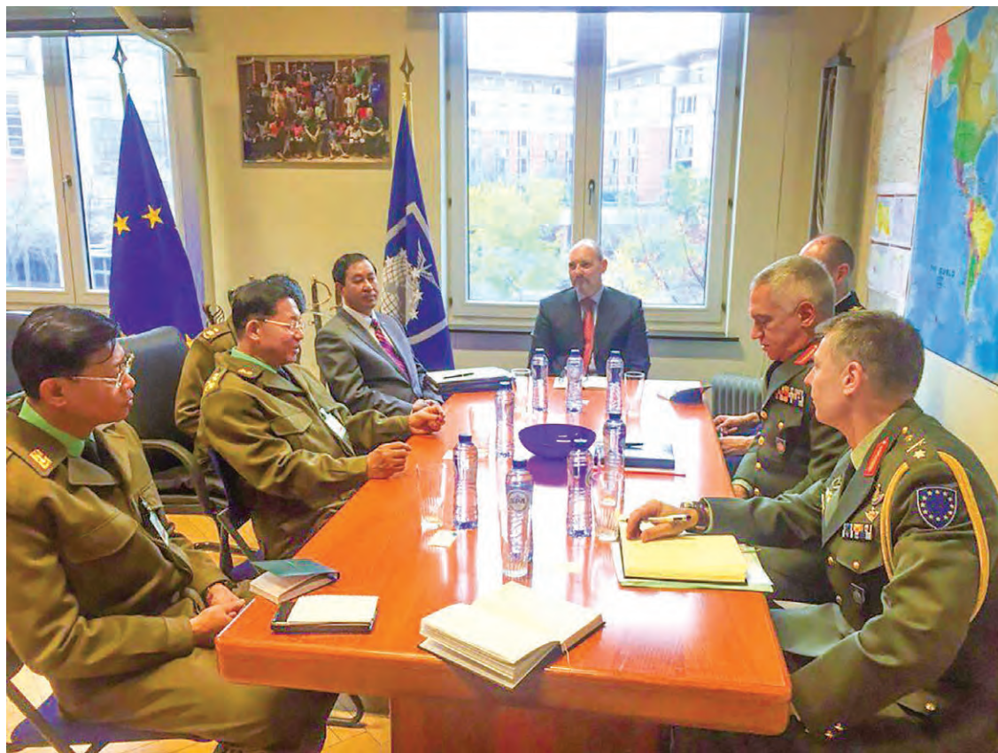
Senior General Min Aung Hlaing, Commander-in-Chief of the Defence Services, meeting with General Mikhail Kostarakos, Chairman of the European Military Council General Mikhail Kostarakos, in Brussels, Belgium.

Senior General Min Aung Hlaing, Commander-in-Chief of the Defence Services, met with General Mikhail Kostarakos, Chairman of the European Military Council General Mikhail Kostarakos, in Brussels, Belgium, at 2.45 pm local time yesterday.