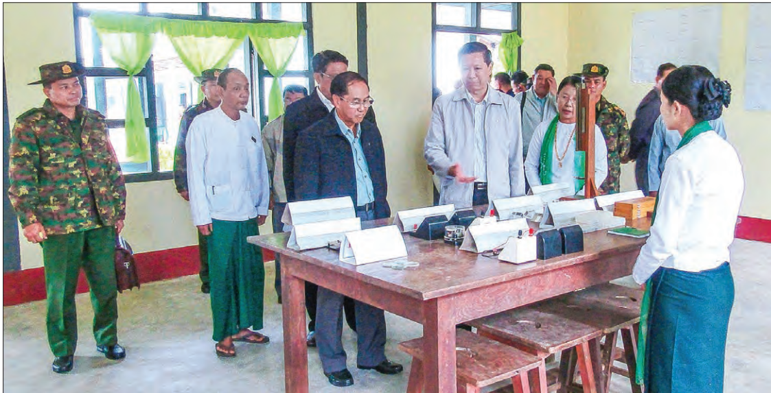
Vice President U Myint Swe inspects teaching aids at Khanti Basic Education High School.

VICE President U Myint Swe called on students at the Development Training School for Ethnic Youths from Border Areas to study hard for the development of the nation and their respective regions yesterday.