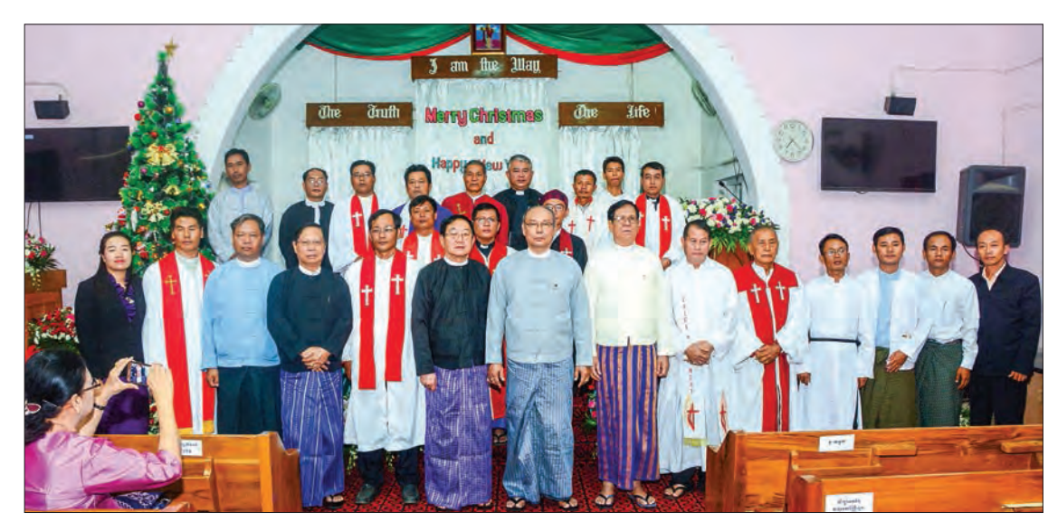
Attendees to the Pre-Christmas Celebration pose for documentary photo.

Afterwards, Sayar Hat pi Than Lwin from the Anglican Church read verses from the Bible about the Nativity. —Myanmar News Agency ■