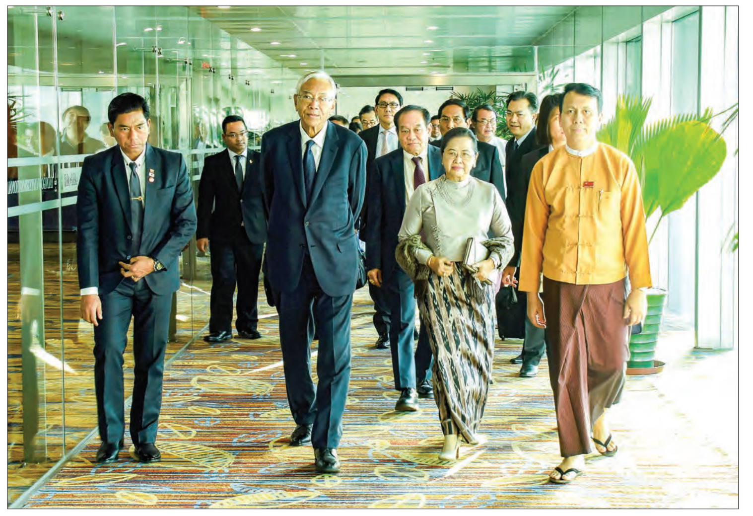
President U Htin Kyaw and wife Daw Su Su Lwin being welcomed back at the Yangon International airport by officials.