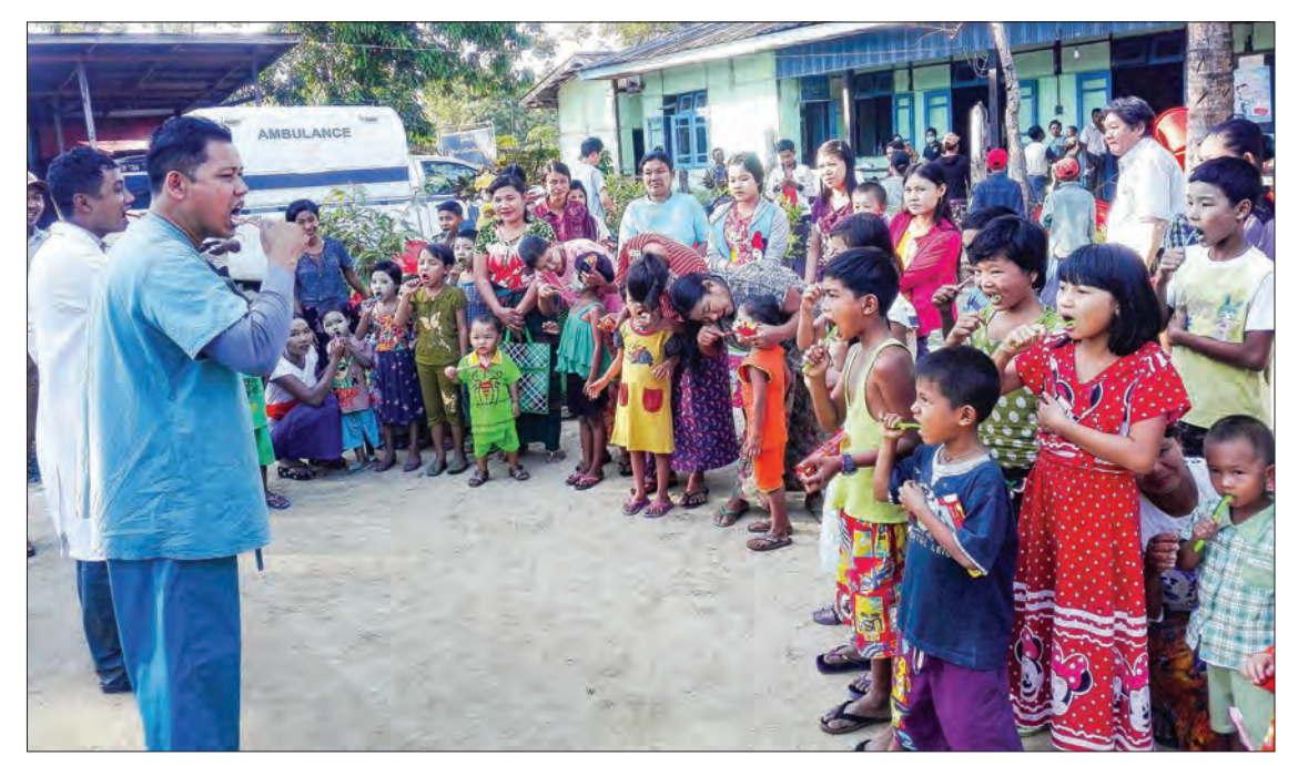
Volunteering Doctors greeting children in Rakhine State.

At the clinic of No 2 border guard force at 4th mile, the team gave health awareness talks and provided toothbrushes and toothpastes free of charge to about 70 families. On 16 December, it carried out knowledge dissemination and medical treatments at Dapyuchaung village in Buth-