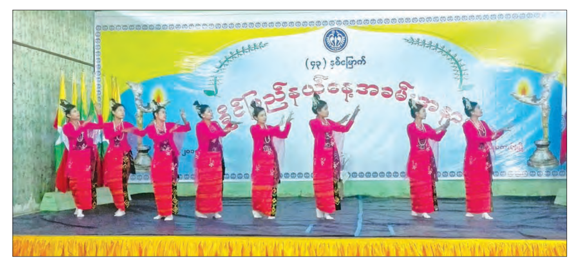
Rakhine ethnic women perform traditional dance at the ceremony to celebrate the 43rd Anniversary Rakhine State Day in Maungtaw, Rakhine State.