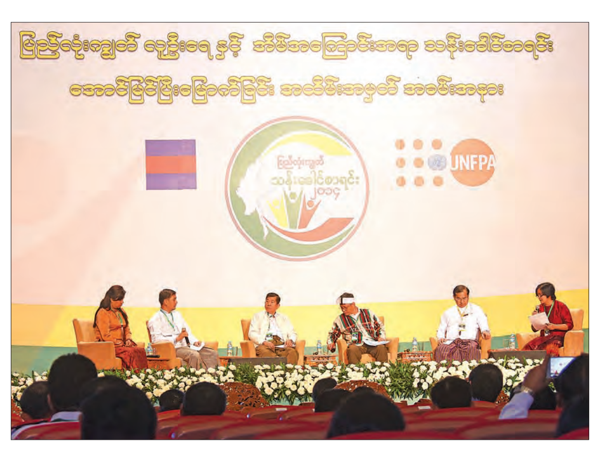
The group discussion is held to mark the successful completion of the nationwide population and household census at MICC-2 in Nay Pyi Taw yesterday.

Afterwards, Ministry of Labour, Immigration and Population Permanent Secretary U Myint Kyaing explained future work processes to be conducted based on data and information collected from the census.— Myanmar News Agency