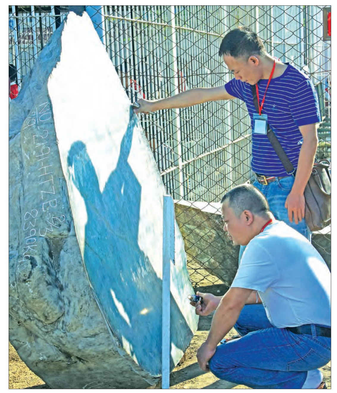
Merchants inspect a large jade stone on the fourth day of the 2017 Mid-Year Myanma Jade and Gems Emporium in Mani Yandana Jade Hall, Nay Pyi Taw yesterday .

The 2017 Mid-Year Myanma Jade and Gems Emporium will sell 6,685 jade lots and 190 gem lots under an open tender system, while high-quality finished jade and gems were also on display and for sale, it is learnt.— Myanmar News Agency ■