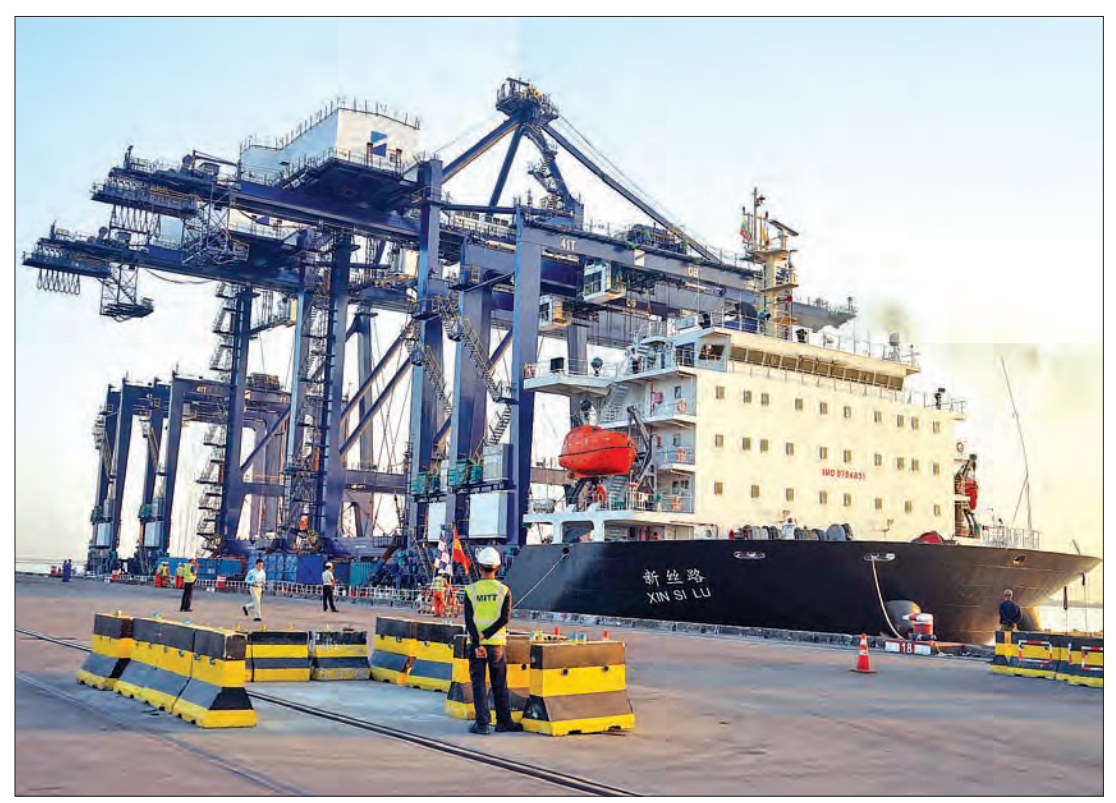
The ship carrying container cranes arrives at the Myanmar International Thilawa Terminal.

On completion of the project in early next year, the MITT would possess the highest capacity for handling containers among the ports in Yangon.—Myanmar News Agency