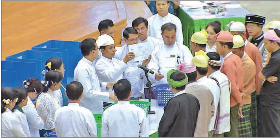
An official shows the voting list to the ethnic representatives of Pyithu Hluttaw.