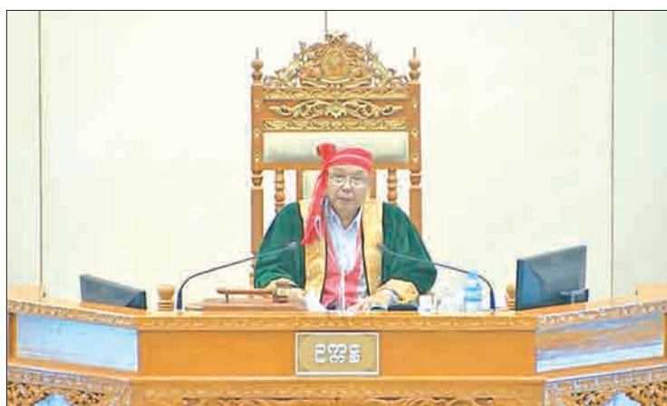
Speaker of Amyotha Hluttaw Mahn Win Khaing Than.

The municipal or development works are distributed among the states and regions, according to the 2008 Constitution, and there is no separate ministry at the union level for development (municipal) affairs. States/regional governments will be contacted and guided to