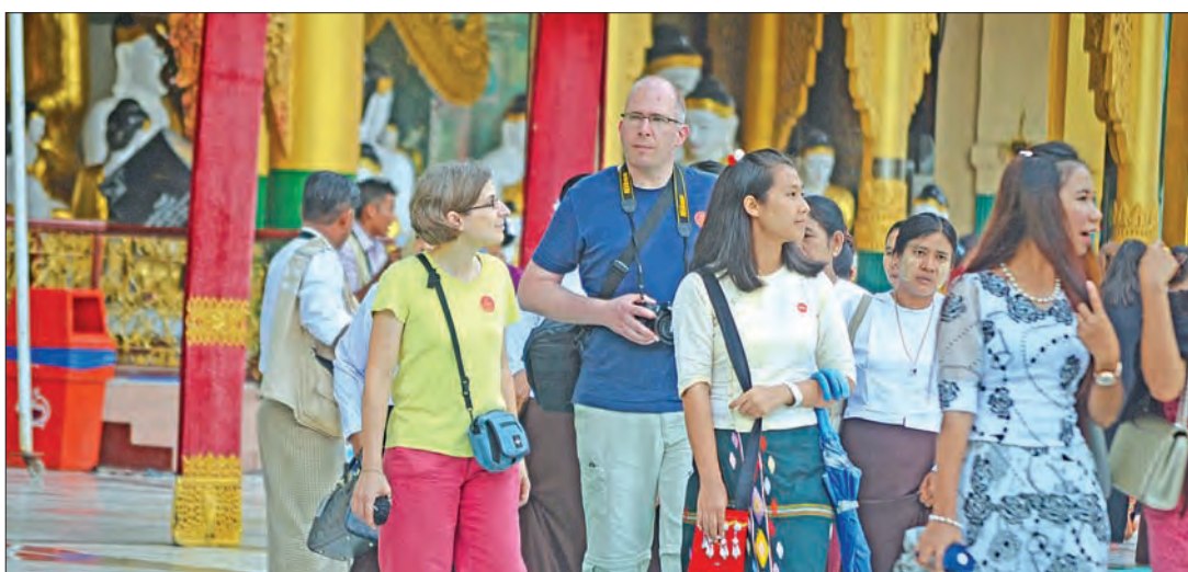
Tourists seen at Shwedagon Pagoda in Yangon.

From 1 April to 21 December, there were 703,419 day trip tourists who entered via the Tachileik border gate, 11,428 visitors of whom traveled to Maing Phat and Kyaing Tong. Tourist arrivals for those with a visa who traveled by air via Tachileik totalled 5,341.—GNLM ■