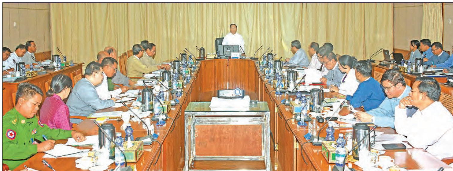
Chairman of the 2018 71st Anniversary of the Union Day Convening Central Committee Vice President U Myint Swe addresses the co-ordination meeting held on 22 December 2017.

Leaders of ethnic nationals led by Bogyoke Aung San met and held the Panglong Conference, signed the Panglong Agreement on 12 February 1947 and achieved independence. The day shows the firm unity of the ethnic nationals and Union Day was celebrated every year to reach the 71st Anniversary this time.