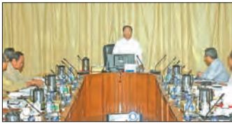
NATIONAL VP U Myint Swe attends coord meeting to hold 2018 Union Day PAGE-2