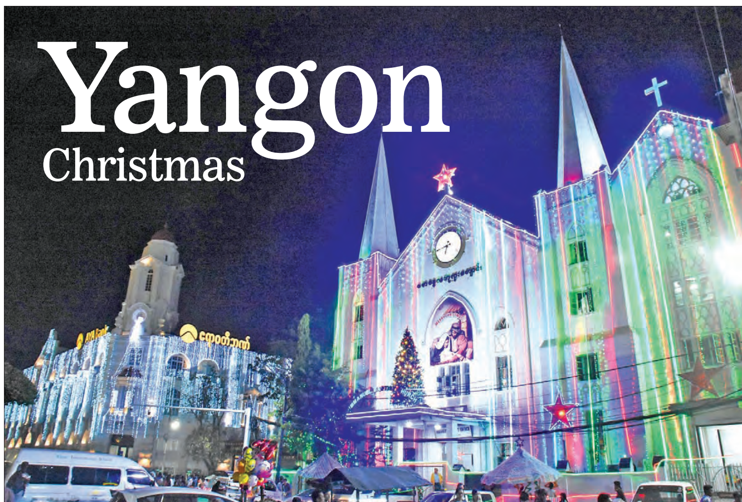
Immanuel Church is illuminated at night before the Christmas in Yangon on 22 December.