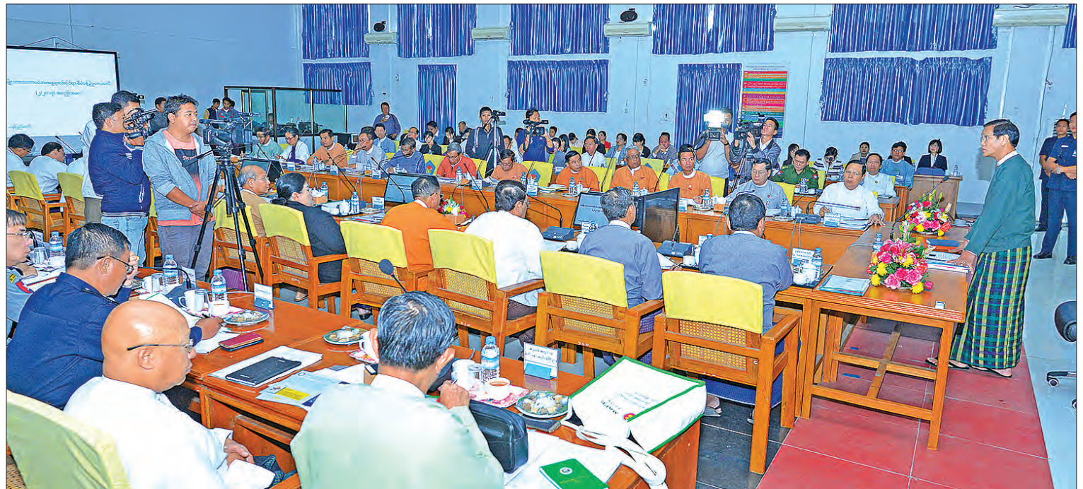
Vice President U Henry Van Thio addresses the Natural Disaster Management Committee meeting in Nay Pyi Taw.

At the national level, the Myanmar Action Plan on Disaster Risk Reduction (MAPDRR) is drawn according to Sustainable Development Goals (SDGs) and