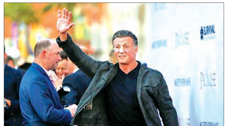
Actor Sylvester Stallone waves at the premiere of "The Promise" in Los Angeles, California, US, on 12 April 2017.

Rodriguez said the accusation could fall within California's complex statute of limitations for criminal prosecutions of sexual abuse. Offences must generally be prosecuted within 10 years. Stallone, 71, skyrocketed to fame in 1976 with his Oscar-winning boxing movie "Rocky" and went on to become one of Hollywood's biggest action stars through the "Rambo" and "Rocky" film franchises.—Reuters ■