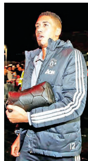
Manchester United's Chris Smalling.

"You know their qualities and their wingers - Demarai Gray is coming into the team and Riyad Mahrez is in form as well," said Smalling. "So those are the players we need to keep quiet and, when we get the ball, we need to make sure that we get at their backline." —Reuters ■