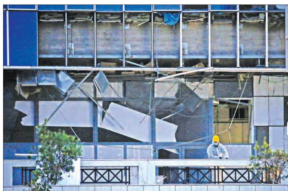
A police officer searches for evidence after a bomb blast at a Court building in Athens, Greece, on 22 December 2017.

Police were also investigating footage from