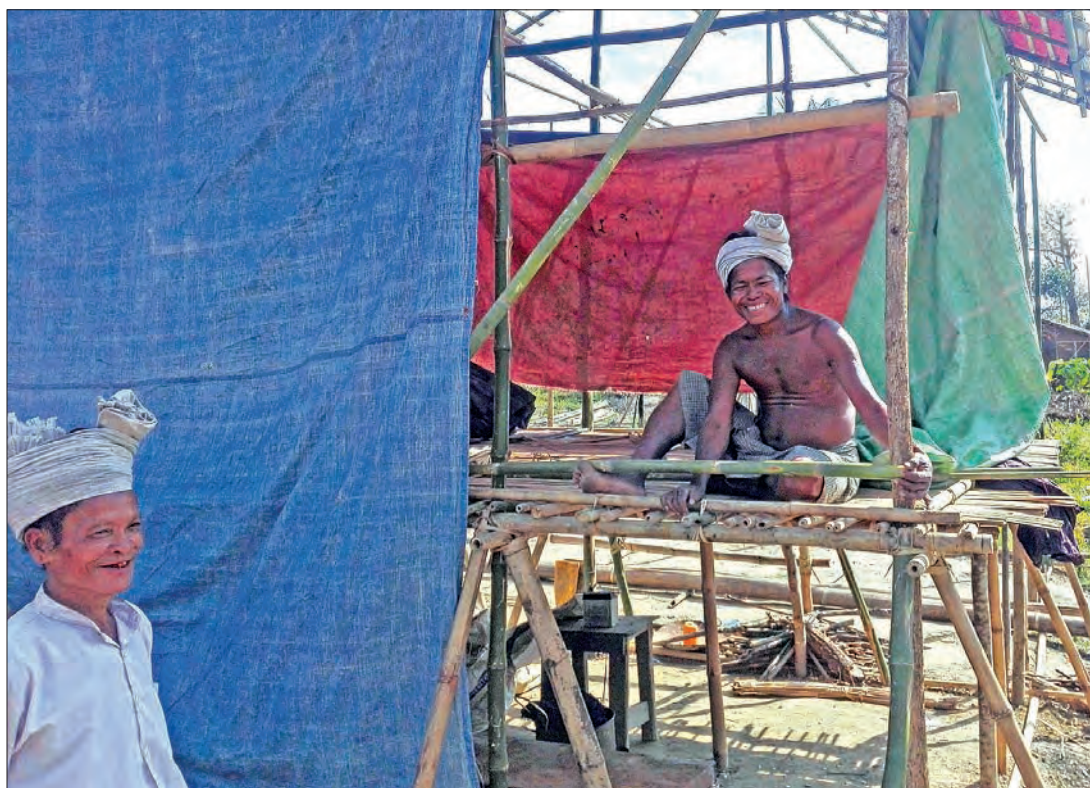
Mro ethnic men build their houses in Thit Tone Nar Kwa Sone Village.