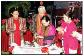
NATIONAL President U Htin Kyaw and First Lady attend Christmas ceremony PAGE-3