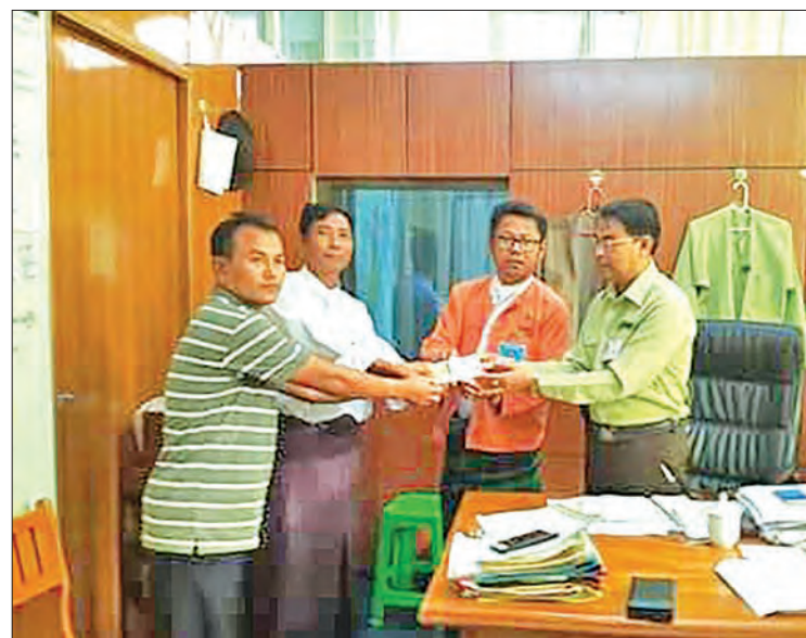
An official receives cash donation from a donor.

Remaining works of earth filling 49.58 acres in the zone, constructing a 1.8 mile hard surfaced road to Maungtaw, upgrading 1.55 miles of road in the zone, constructing 1.18 miles of brick wall to fence the zone, concrete surfacing of the loading/unloading yard and parking area, constructing two buildings for security personnel, rest room for workers and a store, installing a generator, setting up poles for power distribution and laying of distributing wires, and piping work for water distribution are underway.—Myanmar News Agency ■