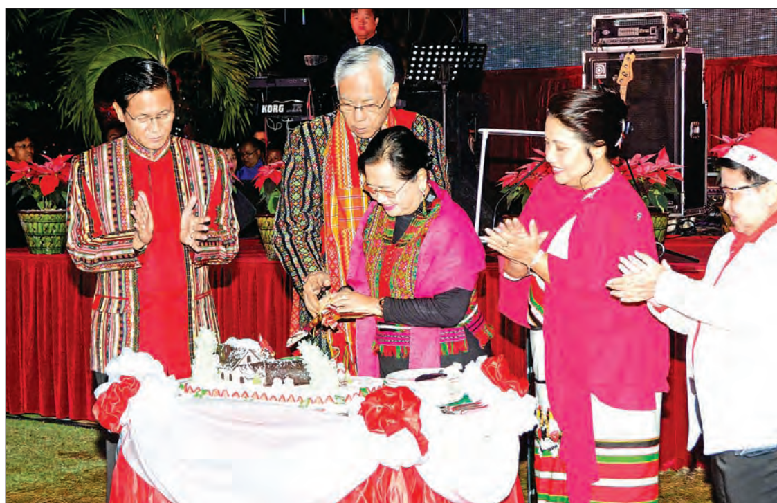
President U Htin Kyaw and First Lady Daw Su Su Lwin slice the cake to mark the Christmas ceremony in Nay Pyi Taw yesterday.