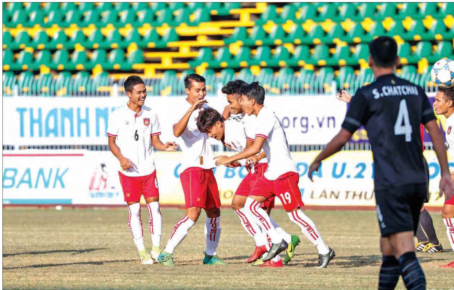
Myanmar U-21 football players celebrating their victory at Can Tho Stadium in Can Tho, Viet Nam yesterday as they secured the bronze medal in international Than Nien Cup.

In the second half, Thailand made some substitutions to strengthen their defence. But