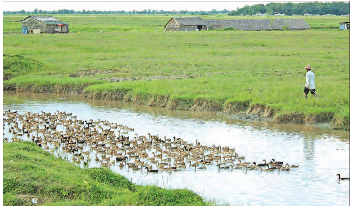
A farmer herding ducks in the creek.

"Ducks bred for eggs are fed broken rice and shrimp powder. Last year, the price for broken rice was Ks11,000 per bag, and