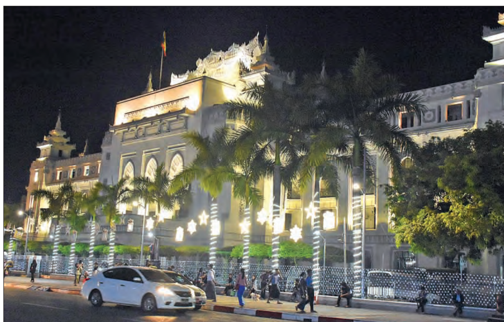
Christmas light installations seen in front of the City Hall in Yangon.