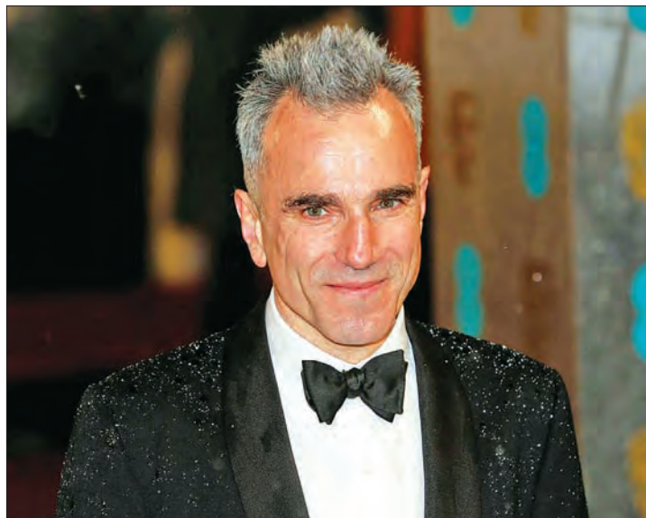
Actor Daniel Day-Lewis poses as he arrives for the British Academy of Film and Arts (BAFTA) awards ceremony at the Royal Opera House in London, Britain, in 2013.

"Everything in the House of Woodcock was so particular