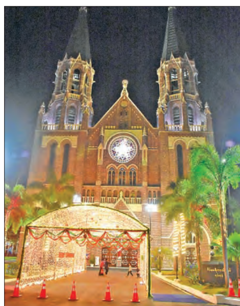
Saint Mary's Cathedral decorated with Christmas light in Bo Aung Kyaw Street, Yangon.