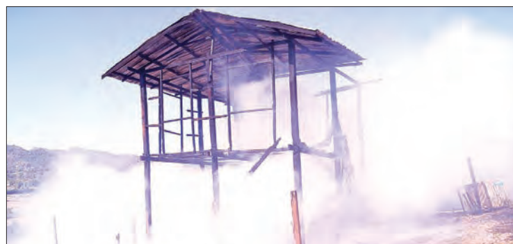
Fire destroys a hut in Hopong Town in Shan State.

Action is being taken against the house owners by township police under the existing Penal Code.—Township IPRD