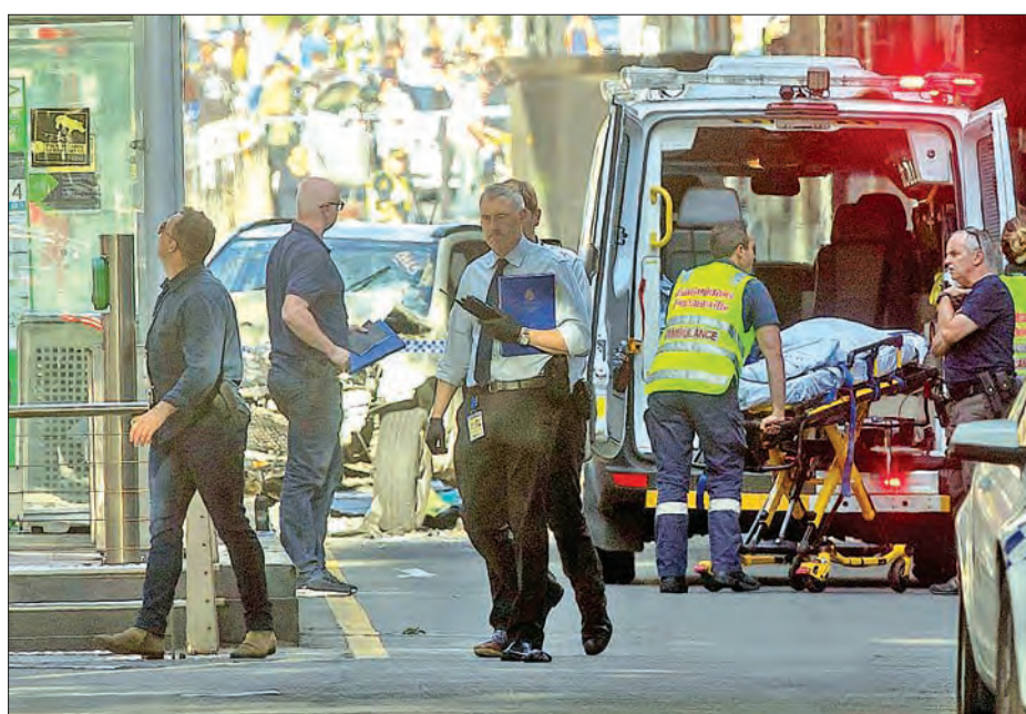
Australian police and paramedics are seen near the place where they arrested the driver of a vehicle that had ploughed into pedestrians at a crowded intersection near the Flinders Street train station, in central Melbourne, Australia, on 21 December 2017.

killed and more than 20 injured in January when a man deliberately drove