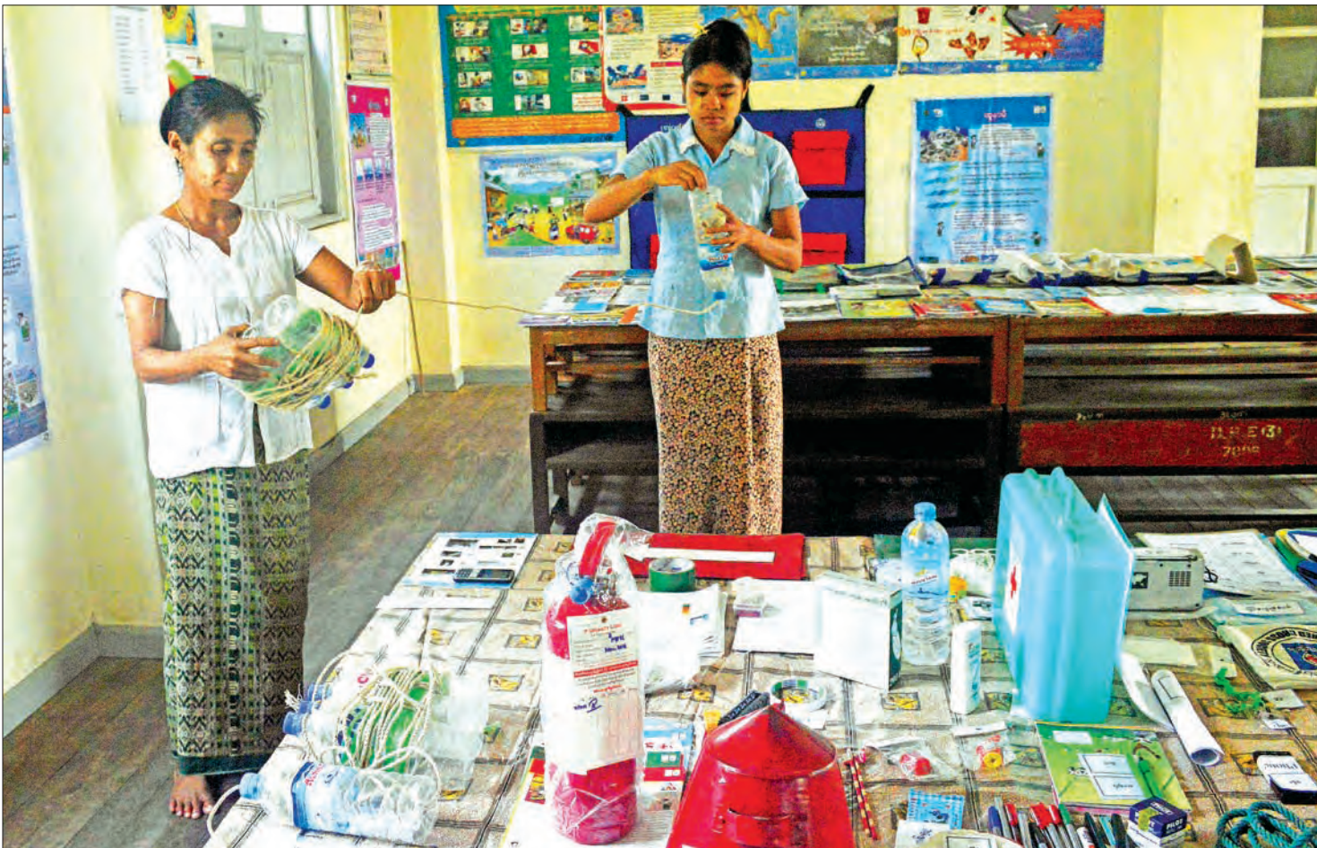
Local women demonstrate making life-saving flotation devices with empty water bottles and string at a ceremony to raise awareness of disaster preparedness in Yangon's southern area of Kungyangon, where Cyclone Nargis struck in 2008.