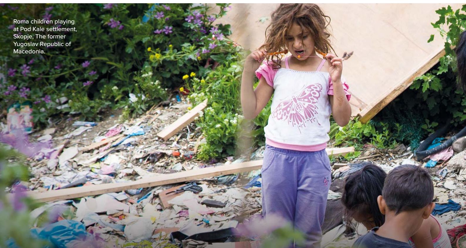
Roma children playing at Pod Kale settlement, Skopje, The former Yugoslav Republic of Macedonia.

The statelessness of the Roma and other ethnic minorities is linked, in part, to the dissolution of the Socialist Federal Republic of Yugoslavia in the early 1990s. The Law on Citizenship of the former Yugoslav Republic of Macedonia, enacted in November 1992, provided that citizens of the predecessor republic automatically became citizens of the newly created state. Those who were legally residing in the