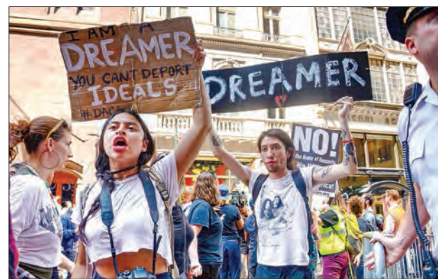
Protesters stage a rally in front of Trump Tower in New York on 5 September, 2017, against President Donald Trump's announcement that his administration will end a program that protects from deportation about 800,000 young immigrants who were brought into the United States illegally as children.

"Because it made no sense to expel talented, driven, patriotic young people from the only country they know solely because of the actions of their parents, my administration acted