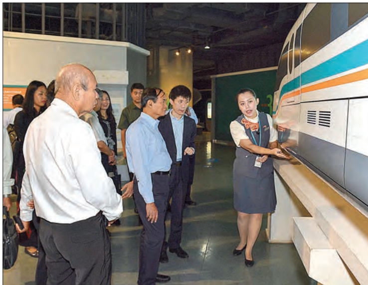
Pyithu Hluttaw Speaker U Win Myint observes Shanghai Maglev train in Shanghai yesterday.

Hluttaw Speaker and party boarded a train and departed from Shanghai Hong Qiao Rail-