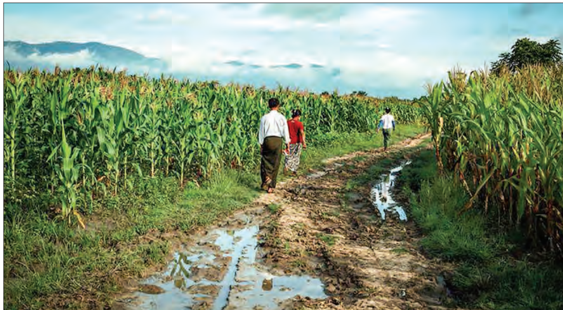
Farmers walk in their farm outside Yebu village in Shwenyaung township, Shan State.