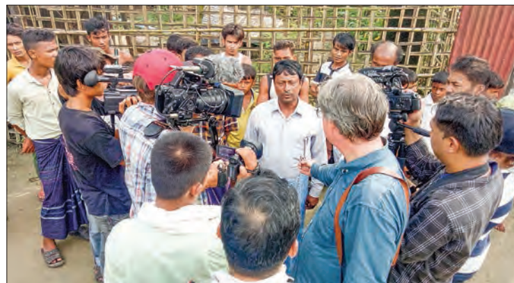
Journalists interviewing local people in Maungtaw.

The media group then proceeded to Shwezar, Kappakaung village tract, and Gonna Village, where they interviewed and photographed some of the 14,000 people of the Islamic faith, who were found to be living in peace and stability, with no extremist terrorists in the village, according to the information department. Daily activities were running