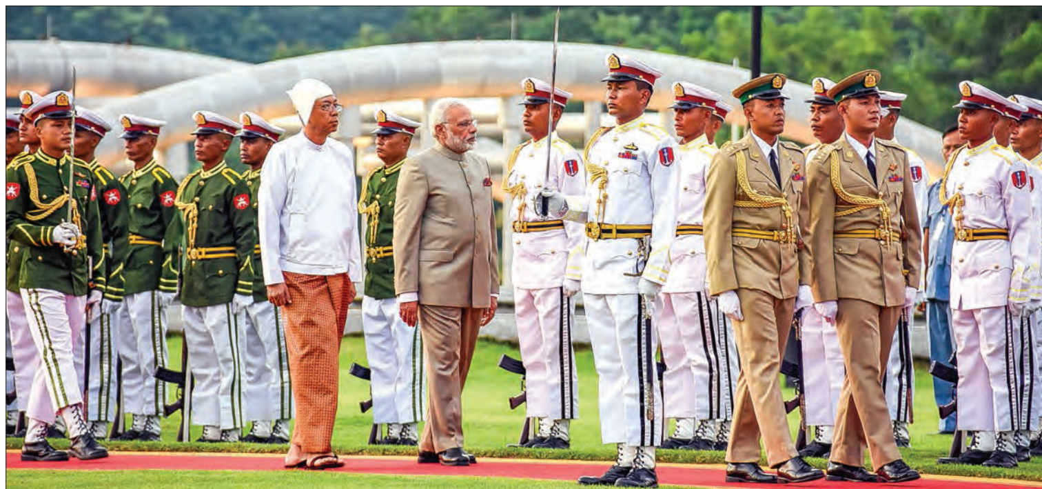
President U Htin Kyaw and Indian Prime Minister Narendra Modi inspect the honour guard at the Presidential Palace in Nay Pyi Taw.

two leaders reviewed developments since the very successful State visits of the President and the State Counsellor of Myanmar to India in August and October 2016 respectively. They reviewed ongoing official exchanges, economic, trade and cultural ties, as well as people-to-people exchanges that reflect the harmony between Myanmar's independent, active and non-aligned foreign policy and India's pragmatic Act East and Neighbourhood First policies. They pledged to pursue new opportunities to further deepen and broaden bilateral relations for the mutual benefit of the people of both countries. They reaffirmed their common aspirations for peace, collective prosperity and development of the region and beyond.