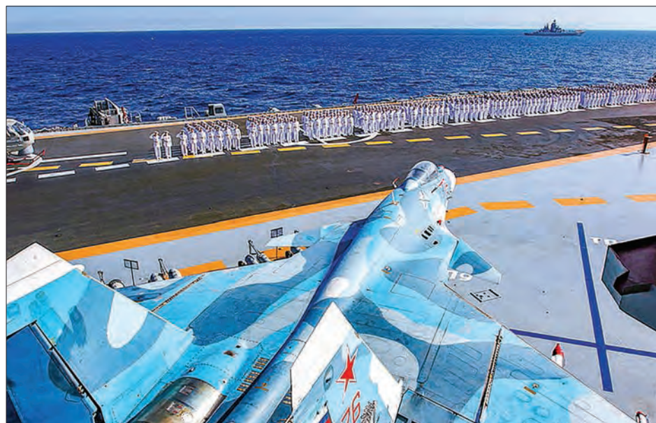
The Russian Navy earlier said the Russian fleet hoped to get a nuclear-powered aircraft carrier by the end of 2030.

MOSCOW — The Russian industry will be able to build aircraft carriers having a displacement of 110,000-115,000 tonnes by 2020, Deputy Prime Minister Dmitry Rogozin said on the Rossiya-24 round-the-clock TV news channel on Tuesday.