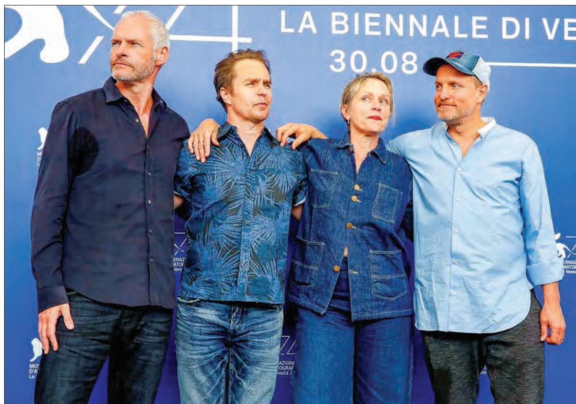
Director Martin McDonagh, actors Sam Rockwell, Frances McDormand and Woody Harrelson pose during a photocall for the movie "Three Billboards Outside Ebbing, Missouri" at the 74th Venice Film Festival in Venice, Italy on 4 September, 2017.

In the movie, director Martin McDonagh said he sought to point to all shades of gray, to see "humanity in everyone and not see anyone as particularly the hero or villain of the piece".