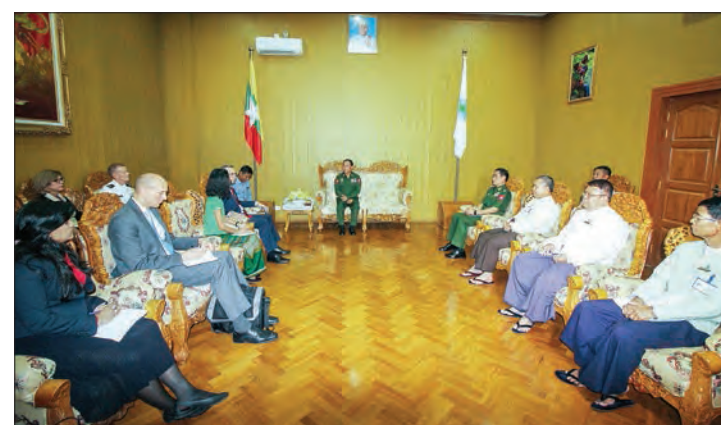
Union Minister for Border Affairs Lt-Gen Ye Aung holds talks with Mr. Scot Marciel, the United States Ambassador to Myanmar, in Nay Pyi Taw.

leased to know the conditions on the ground of terrorist attacks in Maungtau by international countries; the safety, welfare, and healthcare of civilians; supporting urgently needed food and goods for displaced civilians by helicopters and motorboats; the reconstruction of infrastructure buildings destroyed by ARSA extremist terrorists; the bilateral cooperation of the two countries and the ability to involve international organisations to support the displaced civilians and long-term peace and development of Rakhine State. — Myanmar News Agency ■