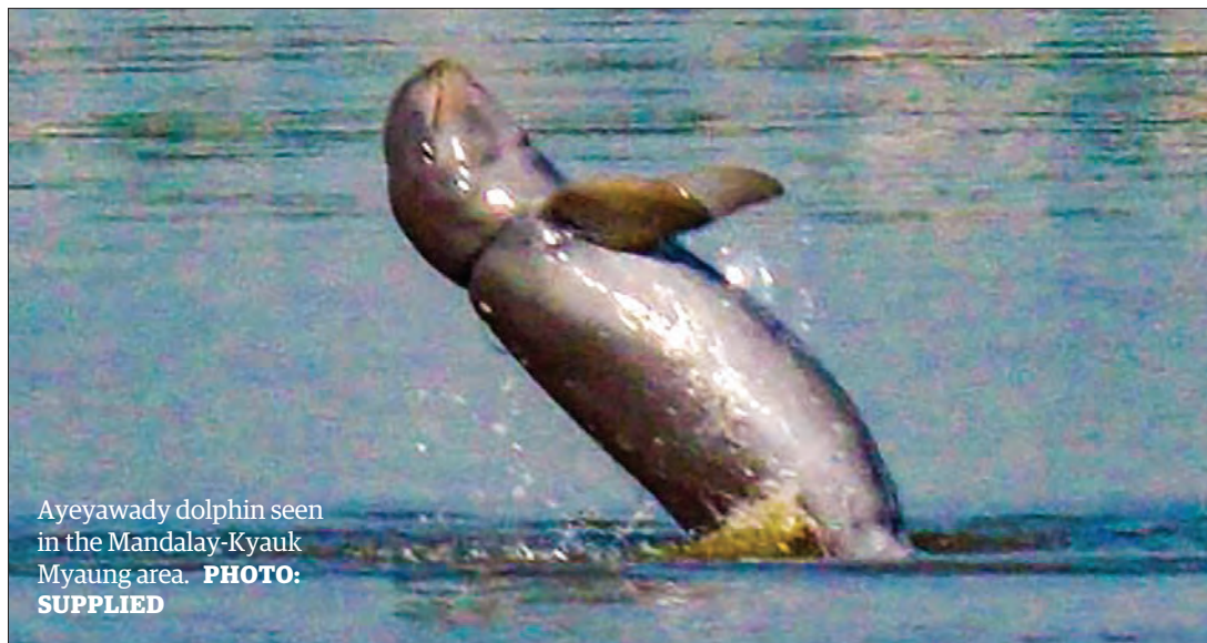
Ayeyawady dolphin seen in the Mandalay-Kyauk Myaung area.

A new Ayeyawady dolphin was born in the Ayeyawady Dolphin Conservation Area in Mandalay Region and Kyauk Myaung, according to U Maung Lay, a fisheries worker from Hsin Kyau village. The