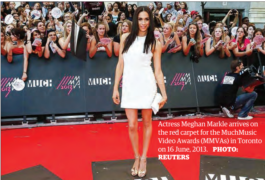
Actress Meghan Markle arrives on the red carpet for the MuchMusic Video Awards (MMVAs) in Toronto on 16 June, 2013.

While observing his parents, he carefully offered flowers and bowed deeply in Nagasaki Peace Park, where the ground zero monument dedicated to victims of the bombing sits. In May, he watched a Summer Grand Sumo Tournament bout at Ryogoku Kokugikan and visited the Sumo Museum as part of an off-school learning program. —Kyodo News ■