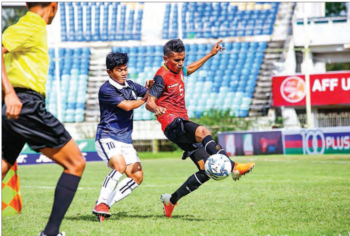
Cambodia and Timor Leste players vying for the ball in yesterday's AFF Group A match at Thuwanna Stadium in Yangon.