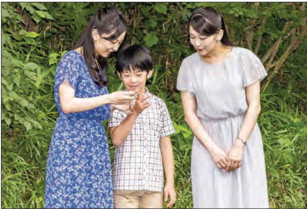
Supplied photo taken on 14 August, 2017, shows Japanese Prince Hisahito (C), Emperor Akihito's grandson, talking with his sisters Princess Mako (R) and Princess Kako. Prince Hisahito, who is third in line to the imperial throne, turned 11 on 6 September.

The interview fuelled speculation among bookmakers that the couple could get engaged soon and comes a day after William revealed that he and his wife Kate were expecting their third child. —Reuters ■