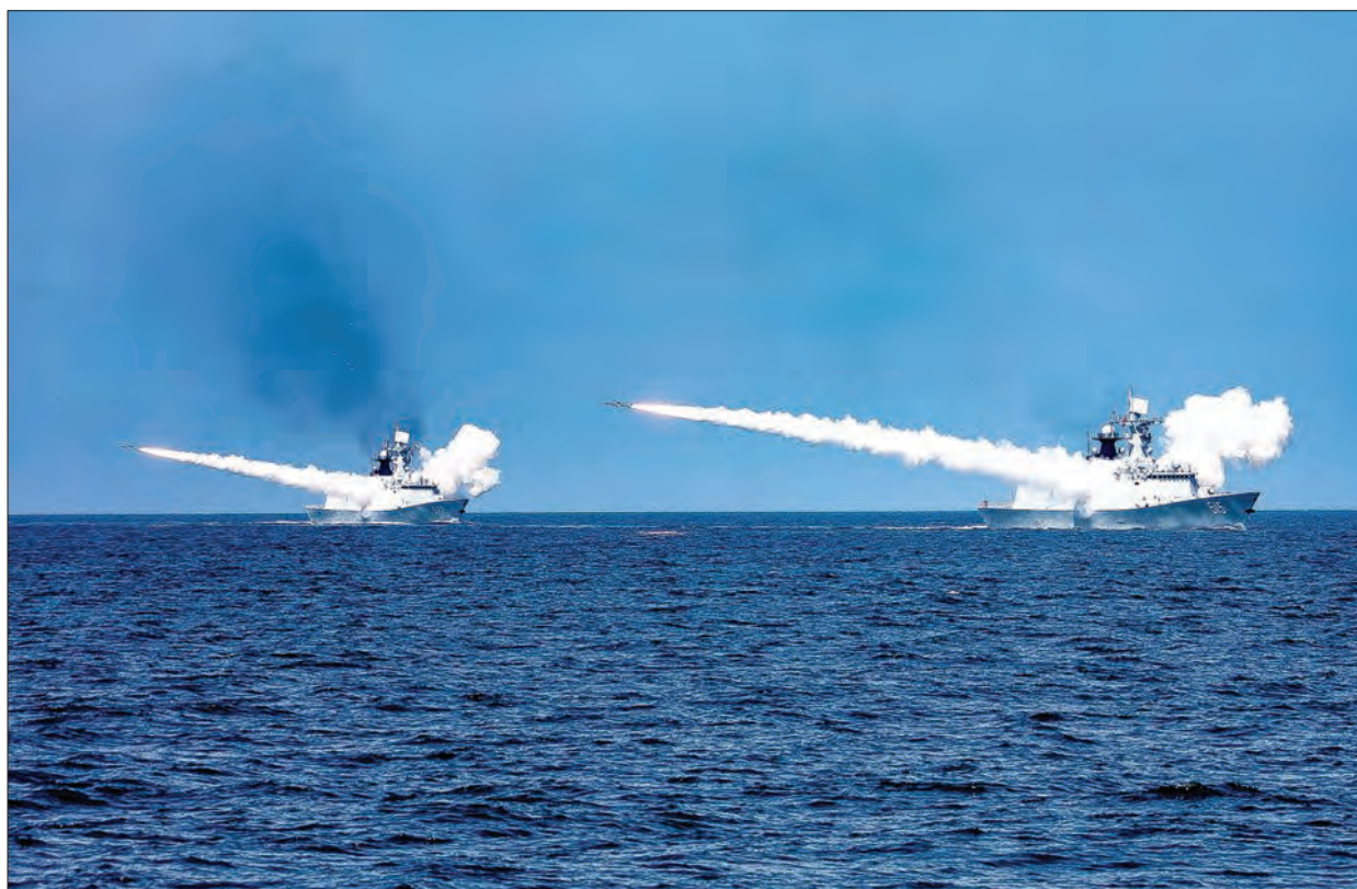
Chinese naval warships fire missiles during a live-fire military drill in the waters of Bohai Sea and Yellow Sea, off China's east coast on 7 August, 2017.