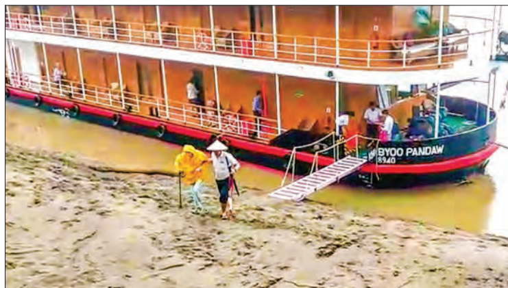
Tourists are visiting along the Chindwin River with a cruise ship.

Among other schools, the programme will be established at the Saunders Weaving Institute located in Amarapura Township, Mandalay Region. The institute was established in 1914. ■