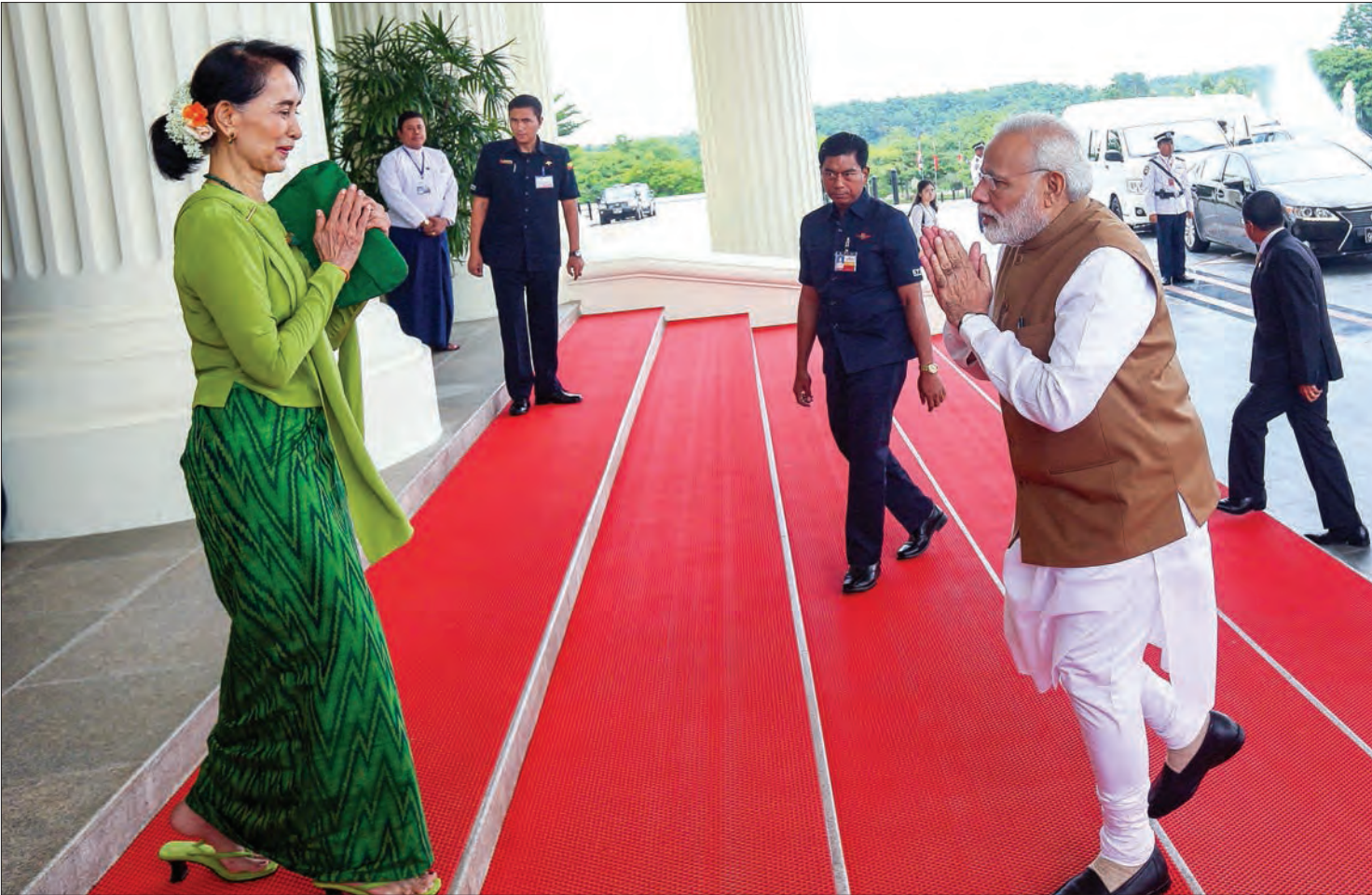
Daw Aung San Suu Kyi (left) welcomes India Prime Minister Mr. Narendra Modi as he arrives in Nay Pyi Taw for a state visit.