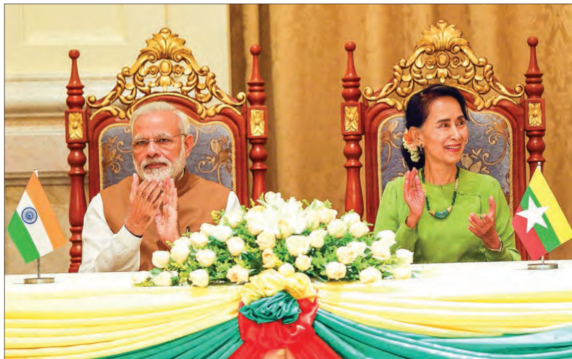
State Counsellor Daw Aung San Suu Kyi and Prime Minister of India Narendra Modi attend a ceremonial welcome at the Presidential Palace in Nay Pyi Taw on 5 September 2017.

26. The two sides welcomed the successful negotiations and finalization of the agreement on border crossing which will help in regulating and harmonizing movement of people across the common land border and thus promote bilateral trade and tourism and directed their senior officials to expeditiously conclude the formalities for its signature. Leaders of both countries agreed