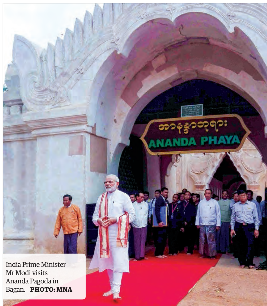
India Prime Minister Mr Modi visits Ananda Pagoda in Bagan.

Mr. Modi then met with the Indians in Myanmar and gave necessary advice. —Myanmar News Agency ■