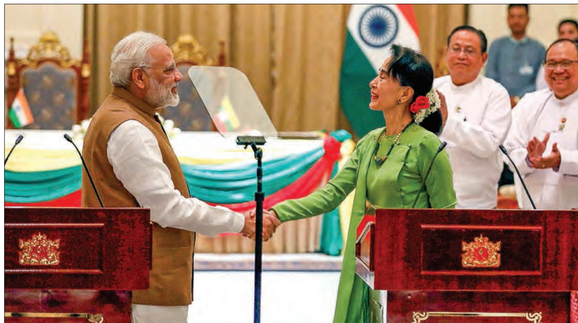
State Counsellor Daw Aung San Suu Kyi and India's Prime Minister Narendra Modi shake hands after their joint press conference in the Presidential Palace in Nay Pyi Taw on 6 September 2017.

14. The two sides noted with satisfaction the cooperation in the field of agricultural research and education, especially through the rapid progress in operationalizing