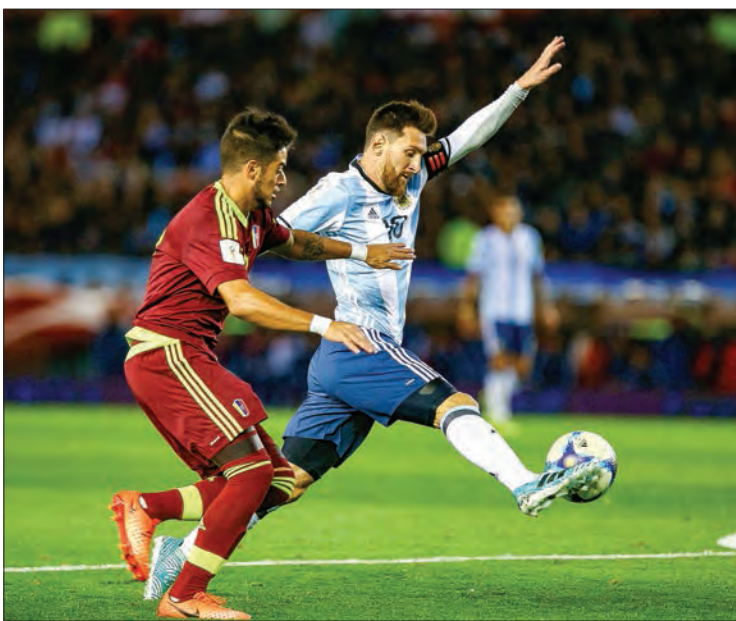
Argentina's Lionel Messi and Venezuela's Junior Moreno at the match of 2018 World Cup Qualifiers at Monumental stadium in Buenos Aires, Argentina on 5 September, 2017.

"Venezuela started to grow when they realised we couldn't finish them off," Argentina