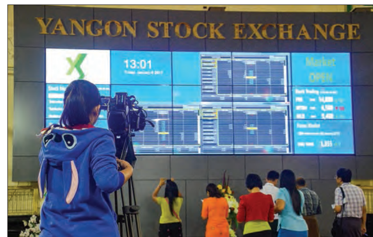
Yangon Stock Exchange in Yangon.

Online trading promises to give the exchange, which has declined in value, more exposure and could encourage more participation. In August, 294,615 shares worth Ks2.29 billion were traded on YSX. And by yesterday, there had been 10,146 shares trades worth an estimated Ks56 million this month. Share prices at the closing time yesterday were Ks14,000 for FMI, Ks3,450 for MTSH, Ks8,800 for MCB and Ks29,000 for FPB. —GNLM ■