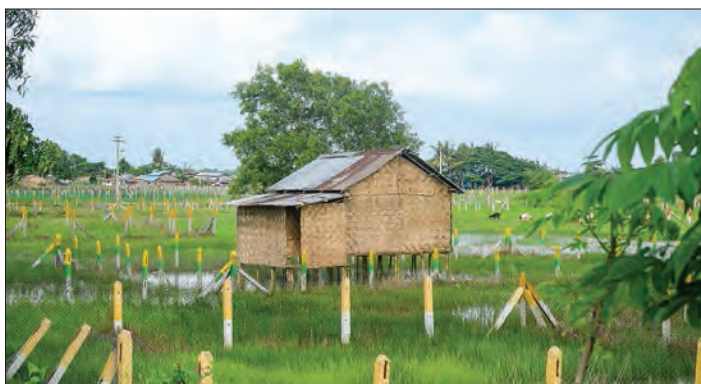
Land market in Dala Township is still cool.