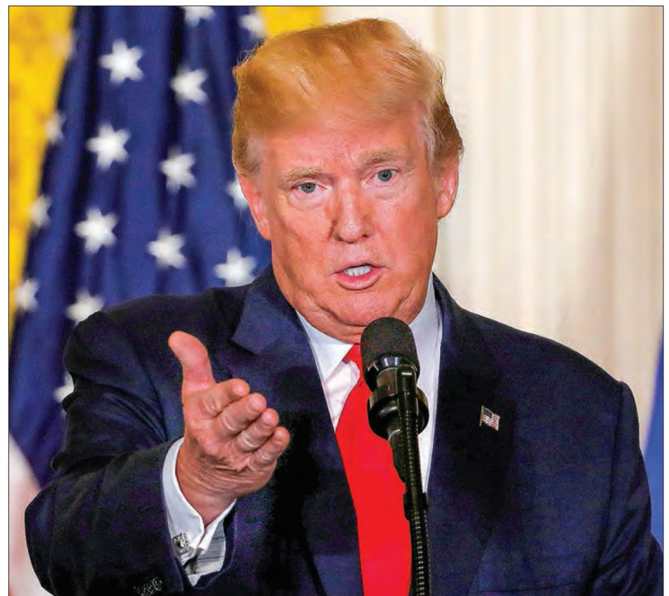
US President Donald Trump.

The missiles would still be bound by a flight range cap of 800 km. No changes to the flight range were mentioned in the Blue