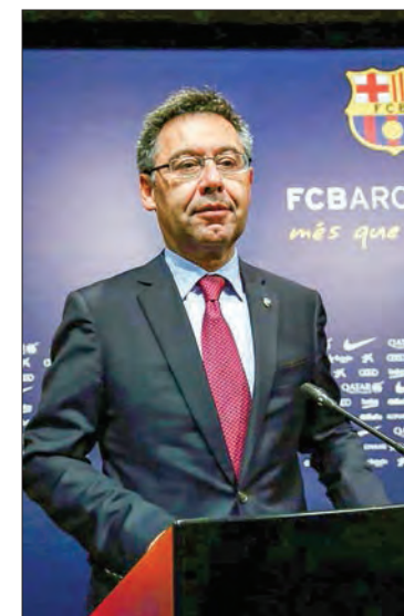
Barcelona President Josep Maria Bartomeu.

MADRID — Barcelona president Josep Maria Bartomeu has reassured his club's supporters that Lionel Messi's new contract has been signed, albeit by the player's father.