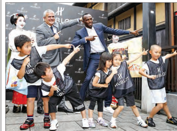
Retired Jamaican sprinter Usain Bolt (3rd from L on back) poses with local children during an event for Swiss luxury watchmaker Hublot in the traditional Gion district of Japan's tourist city of Kyoto on 5 September, 2017.