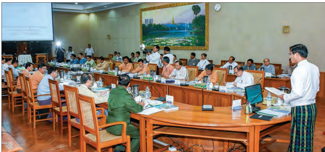
U Henry Van Thio delivers a speech at the third future work programme coordination meeting of the National Water Resources Committee in Nay Pyi Taw yesterday.

In his speech, the Vice President said this is the third future work programme coordination meeting of the National Water Resources Committee as well as a general meeting attended by all committee members. The future work programme coordination meeting was held for nationwide development of water-related sectors and to discuss and coordinate effective management and utilisation of water resources. It was also held for effective coop-