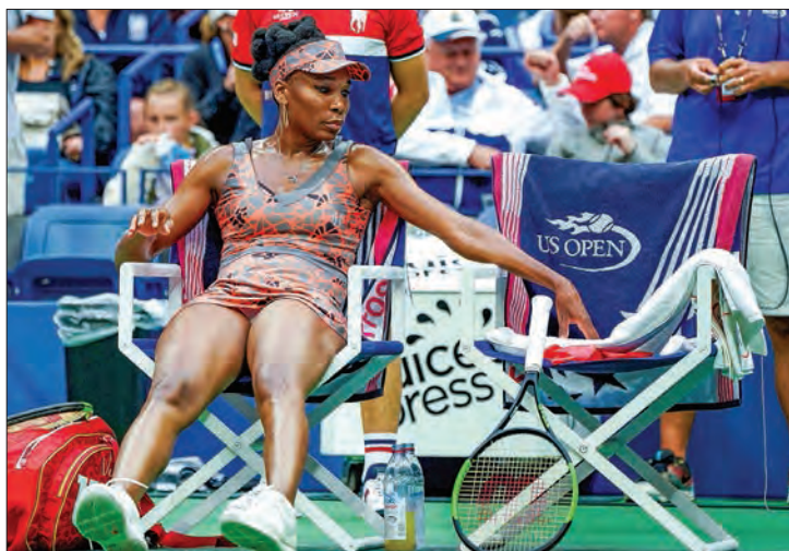
Venus Williams of the US takes a break in her match against Carla Suarez Navarro of Spain during their fourth round match of US Open in New York, US on 3 September, 2017.

American Sloane Stephens, back to her best after a year out because of a foot injury, faces Latvian 16 th seed Anastasiya Sevastova, who beat Maria