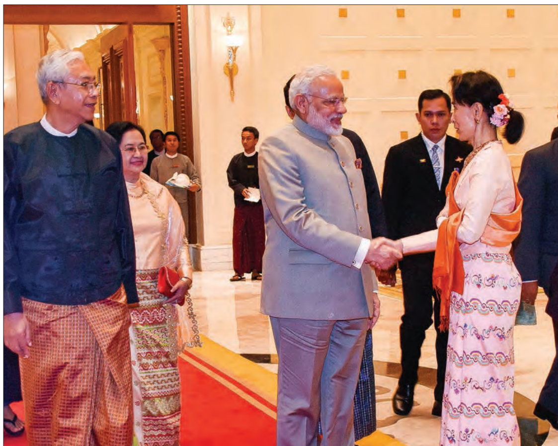
State Counsellor Daw Aung San Suu Kyi (Right) welcomes Indian Prime Minister Mr Narendra Modi (Center) at the dinner hosted by President U Htin Kyaw and First Lady Daw Su Su Lwin in Nay Pyi Taw.