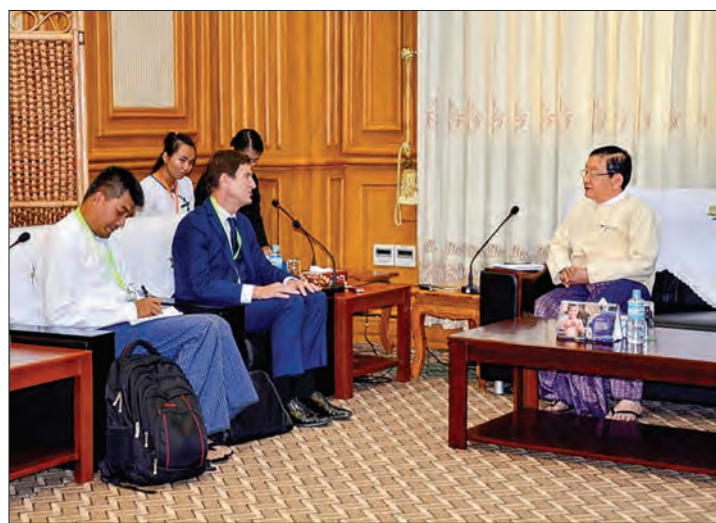
Pyithu Hluttaw Deputy Speaker U T Khun Myat holds talks with UNICEF Myanmar representative in Nay Pyi Taw.

Officials from ministerial departments, state and region governments and municipal committees who were attending the meeting explained water-related works and cooperation. Meeting attendees also suggested future work of the National Water Resources Committee. — Myanmar News Agency ■