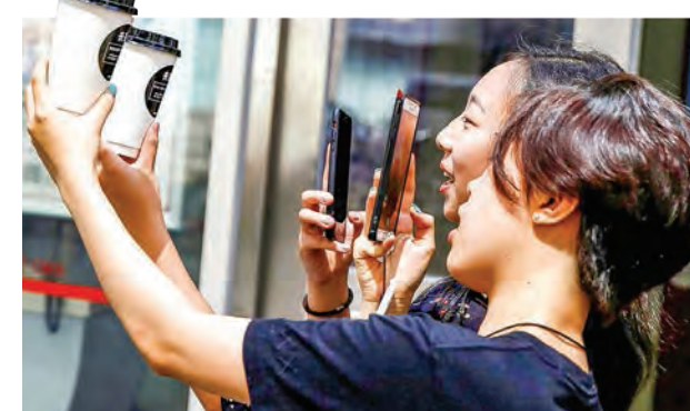
Customers take pictures of cups of tea named in the fashion of the Sang subculture at the Sung Tea shop in Beijing on 24 August, 2017.

competition for good jobs in an economy that isn't as robust as it was a few years ago and when home-ownership — long seen as a near-requirement for marriage in China — is increasingly unattainable in major cities as apartment prices have soared.—Reuters ■