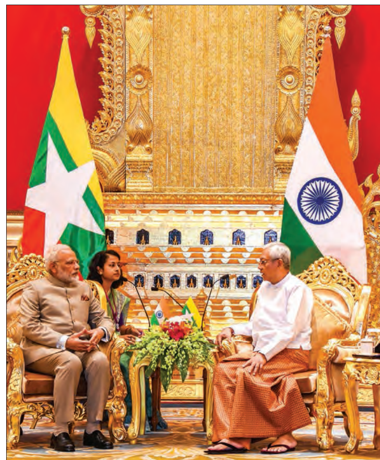
President U Htin Kyaw and Indian Prime Minister Mr Narendra Modi hold talks at Presidential Palace in Nay Pyi Taw yesterday.