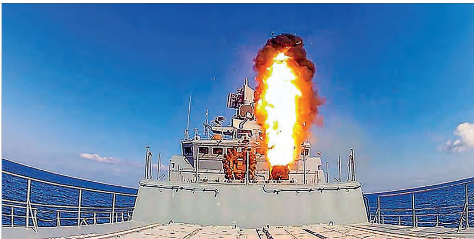
The missile strike also destroyed an armored vehicles repair plant and a large group of militants.