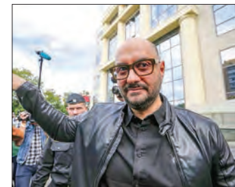
Russian theatre director Kirill Serebrennikov, who was accused of embezzling state funds and placed under house arrest, gestures after a court hearing in Moscow, Russia on 4 September, 2017.

“Others will also be brought to justice if there are any (material) claims to them,” Putin told a news conference after a summit of the BRICS nations in China. —Reuters ■