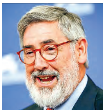
Director John Landis poses during a photocall for the movie “Michael Jackson's Thriller 3D” at the 74 th Venice Film Festival in Venice, Italy on 4 September, 2017.

Asked about his first meeting with Jackson, the child star turned King of Pop who set the world dancing but died in 2009 at the age of 50, Landis said he