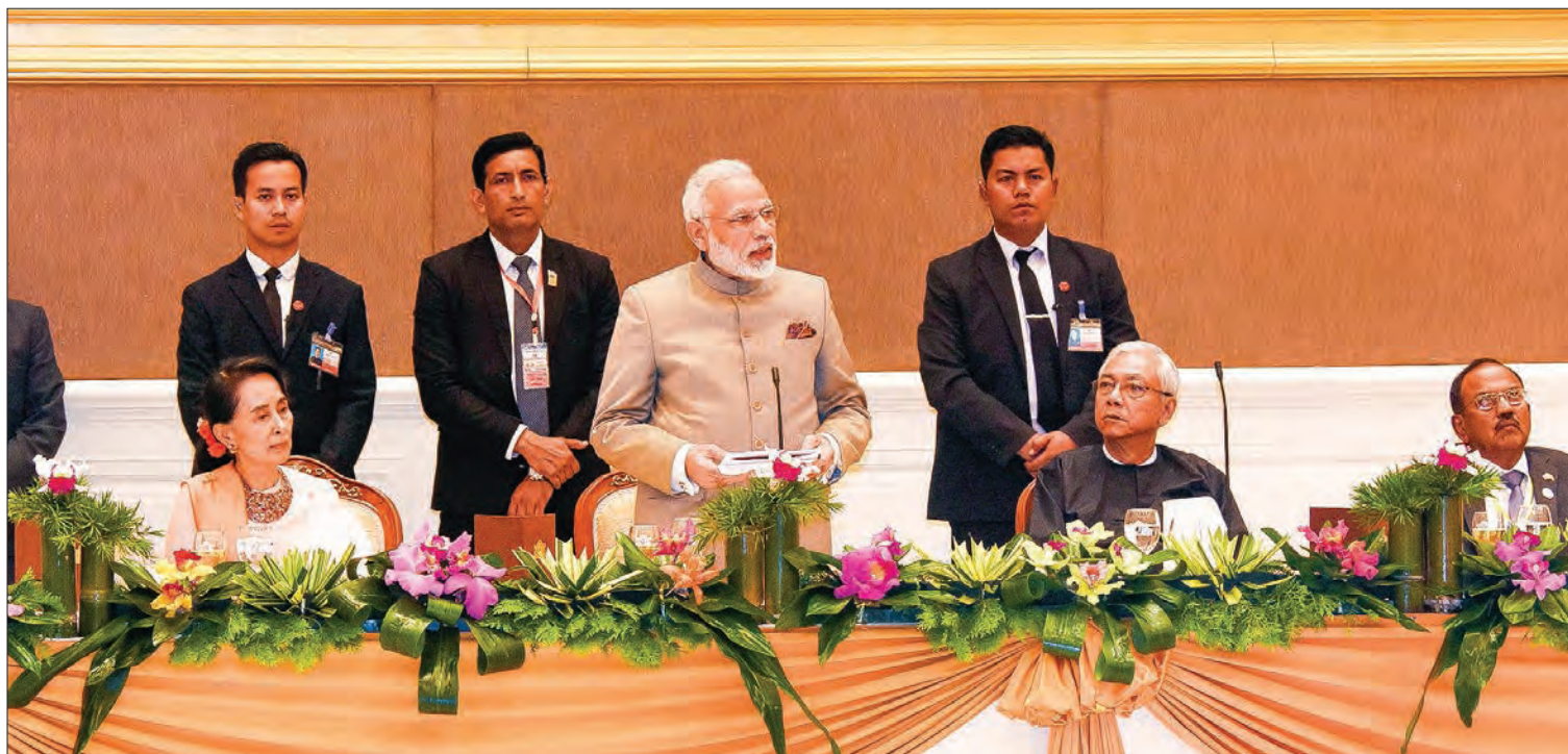
Indian Prime Minister Mr Narendra Modi speaks at the dinner hosted by President U Htin Kyaw in Nay Pyi Taw.

In 2014, the Prime Minister came to Myanmar to attend the ASEAN-India Summit. This is the Prime Minister's first official state visit to Myanmar.—Myanmar News Agency ■