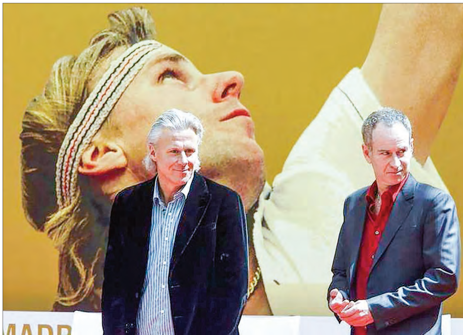
Tennis players Sweden's Bjorn Borg (L) and John McEnroe of the US stand during the presentation ceremony of masters senior tennis tournament in central Madrid on 13 April, 2007.