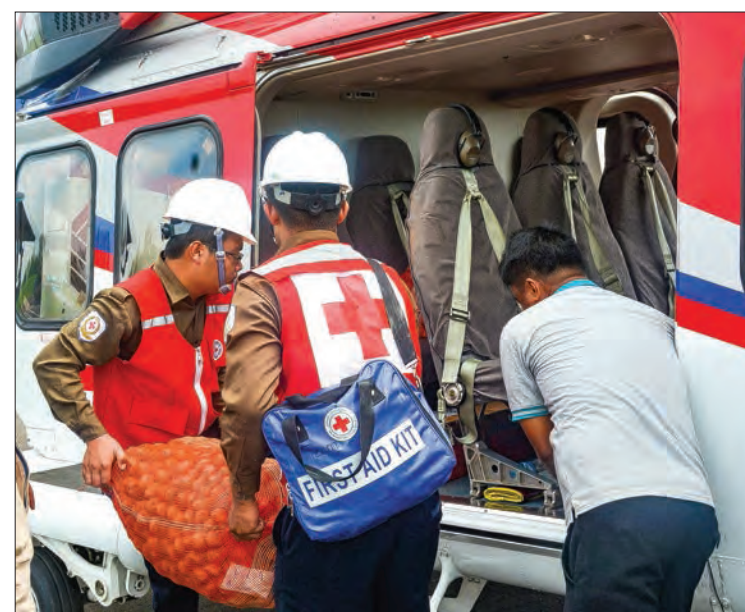
Myanmar Red Cross Society's members loading food aids.

The aid operation was been overseen yesterday by the deputy minister for the Office of the State Counsellor.