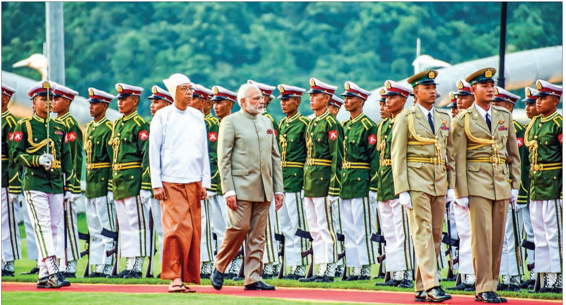
President U Htin Kyaw and Indian Prime Minister Narendra Modi inspect the honour guard at the Presidential Palace in Nay Pyi Taw yesterday.