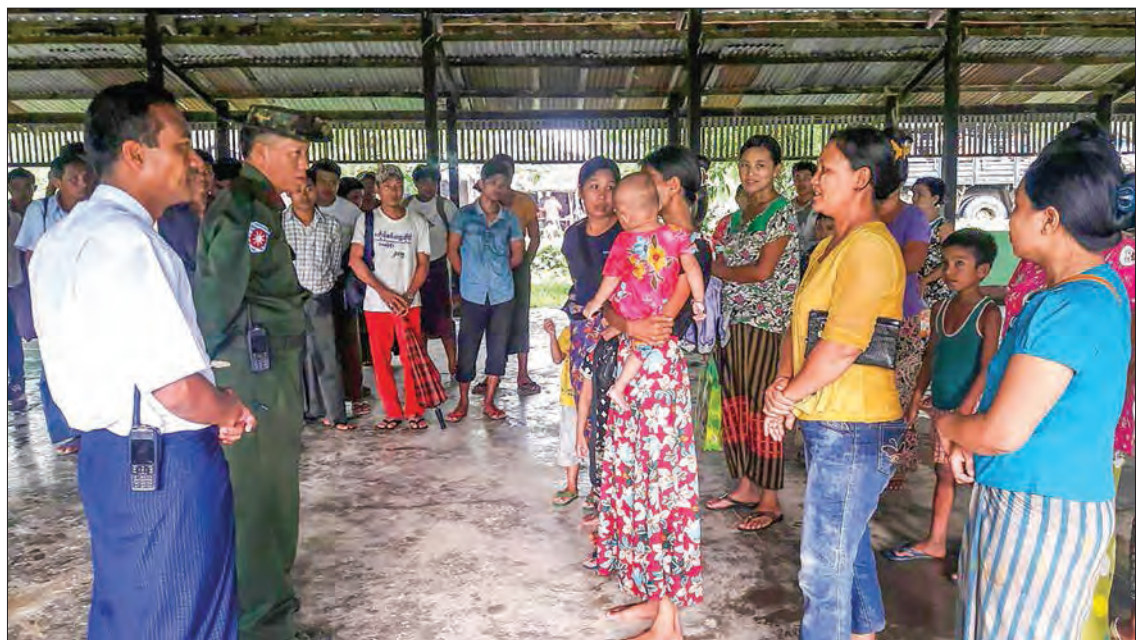
Rakhine State Minister for Security and Border Affairs Col. Phone Tint meets and encourages teachers and local ethnics.

Rakhine State Minister for Security and Border Affairs Col. Phone Tint met and encouraged teachers and local ethnics who are returning to their homes and schools in Rakhine State that