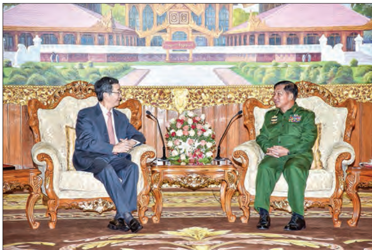
Senior General Min Aung Hlaing meets with Special Envoy of Asian Affairs of the Ministry of Foreign Affairs of China.

At the meeting the Senior General said that during the multi-party democracy era when peace process was started to be implemented, ethnic armed groups were invited to participate in "Our Three Main National Causes" and accept the "multi-party democracy system". The offer was accepted by ethnic armed groups and Nationwide Ceasefire Agreement (NCA) was signed after the government, Tatmadaw and ethnic armed groups discussed repeatedly. Thus the peace process will be implemented along