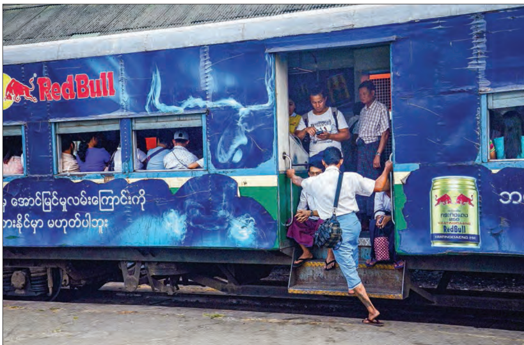
A passenger gets on a circular train at Yangon Central Railway Station.

Due to limitation of space we are only able to publish "Letter to the Editor" that do not exceed 500 words. Should you submit a text longer than 500 words please be aware that your letter will be edited.