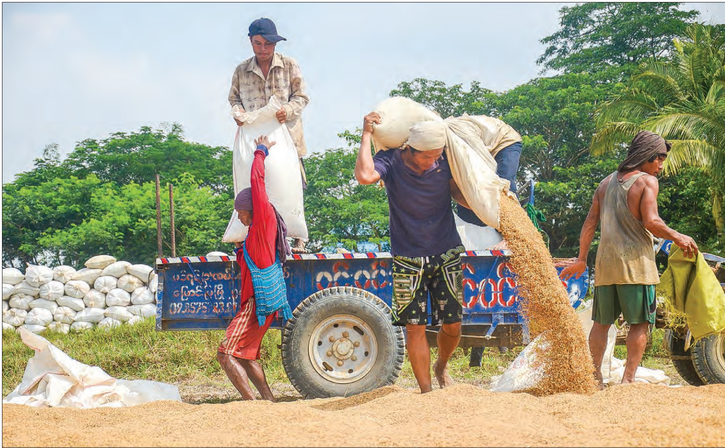
Myanmar farmers harvest rice in Kangyidauk in Ayeyarwady delta.