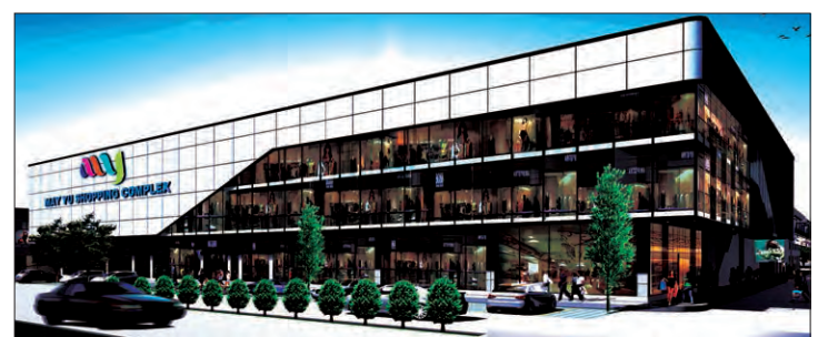
Scale model of Mayyu Market.

The market complex is three-acres wide and will house government and public banks. Shops will also be constructed in the market compound. The