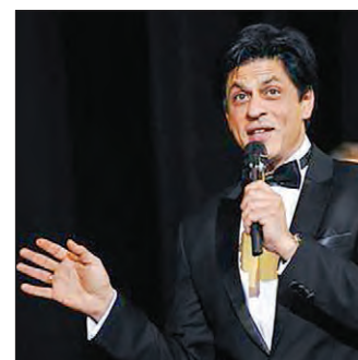
Shah Rukh Khan.

"I put that cat in his hands. It was the studio cat. It was one take," said Coppola.—Reuters ■