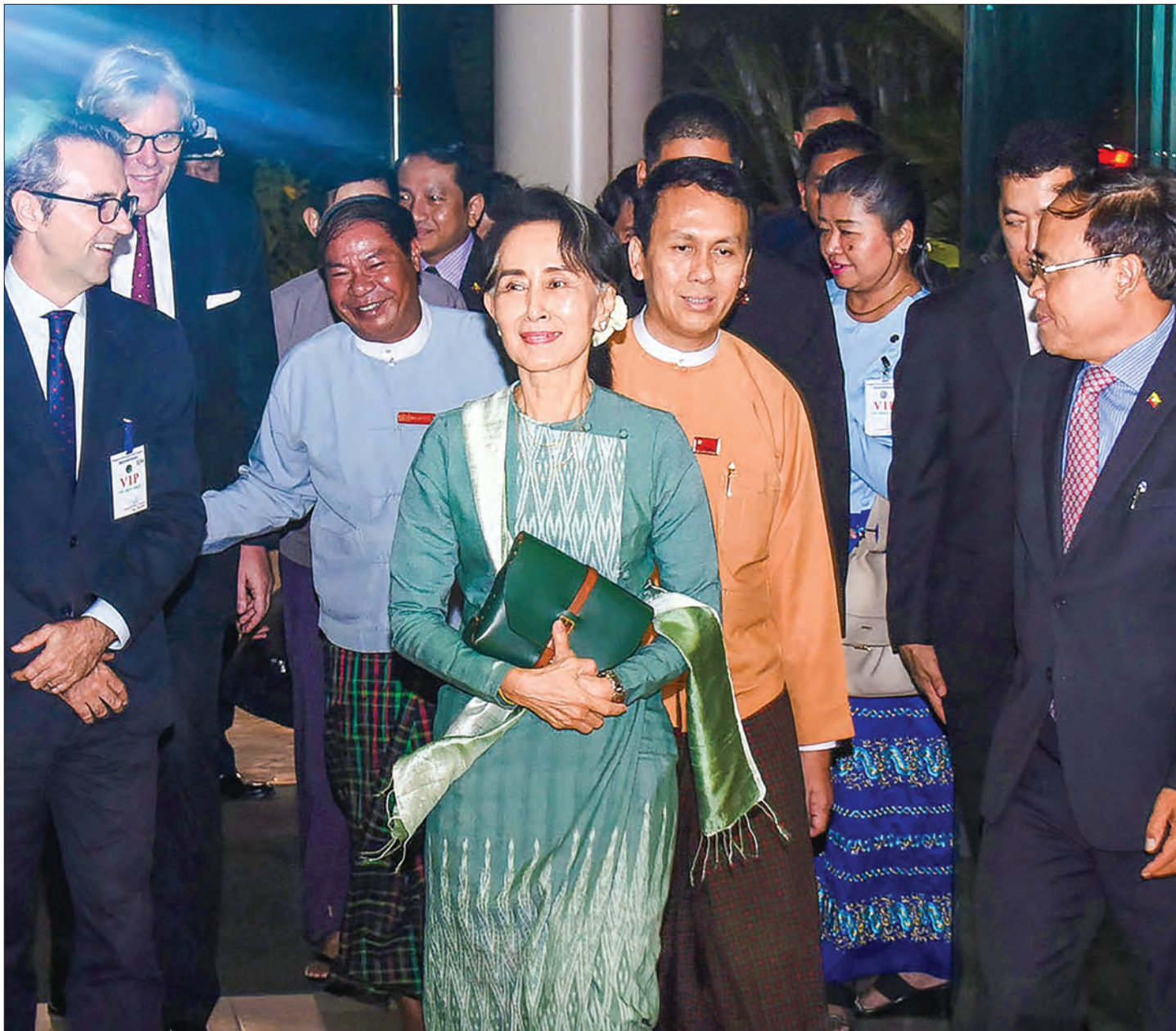
State Counsellor Daw Aung San Suu Kyi is seen off by diplomats and officials at Yangon International Airport.