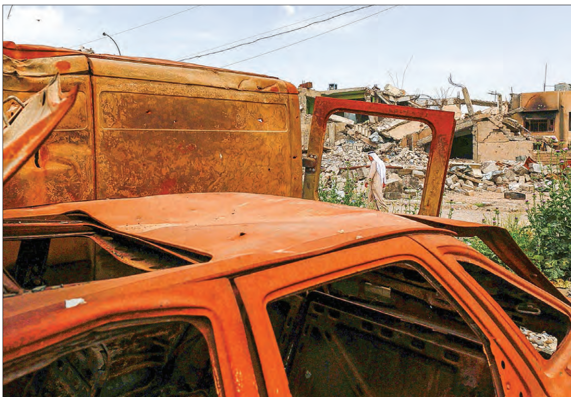
An Iraqi man walks past buildings and cars which were destroyed during fighting between Iraqi forces and Islamic State fighters in eastern Mosul, Iraq on 30 April, 2017.

News of the US casualty came as US President Donald Trump marked his first 100 days in office. During last year's presidential election campaign, Trump vowed to give priority to destroying Islamic State, which operates mostly in Syria and Iraq.—Reuters ■