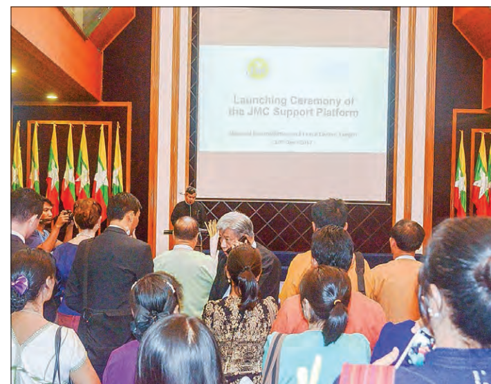
Launching of the JMC Support Platform at the National Reconciliation and Peace Centre in Yangon.

Later in the evening, the Senior General and party flew from Frankfurt International Airport, Germany. —Myanmar News Agency ■