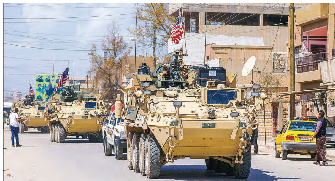
US military vehicles travel in the northeastern city of Qamishli, Syria on 29 April, 2017.

The jihadist group still controls large swathes of Syria's Euphrates basin and its vast eastern deserts near the border with Iraq, but it has lost large tracts of its territory over the past year and many of its leaders have been killed.—Reuters ■