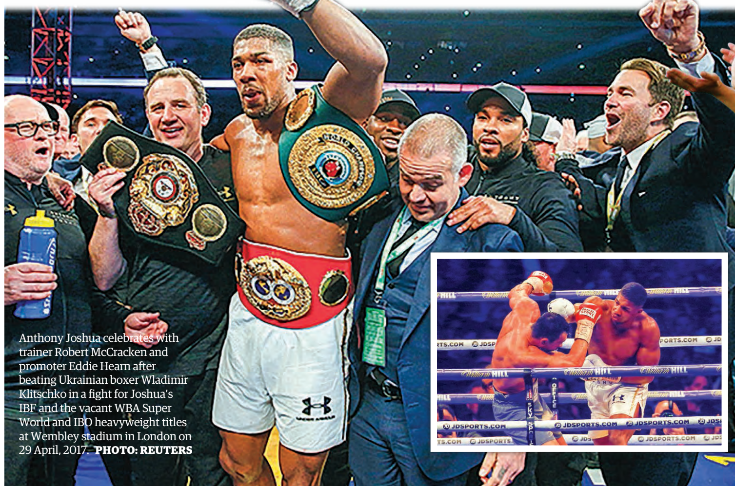
Anthony Joshua celebrates with trainer Robert McCracken and promoter Eddie Hearn after beating Ukrainian boxer Wladimir Klitschko in a fight for Joshua's IBF and the vacant WBA Super World and IBO heavyweight titles at Wembley stadium in London on 29 April, 2017.