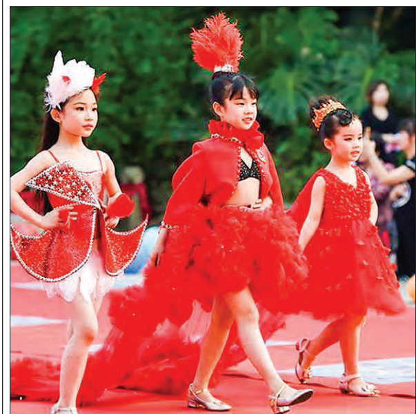
A child presents a creation during a Child Model Show in Fuzhou, capital of southeast China's Fujian Province, on 30 April 2017.

area of the network to explore, while making time to experience the local food and culture along the way. "It took us something like 10 days to do every single line in Hokkaido," Dibben said. "You're up against only a handful of trains a day on some lines, so you have to work around the timetable." To date, they have ridden on around one hundred minor railways. In the early years, the JRS organized trips with tour companies to visit Japan, but certain train lines were not made for big crowds. Smaller railways pose a logistical nightmare. "There are a lot of very small railways in Japan, and taking 30 odd people on a single coach train is probably not a good idea," Dibben pointed out. While the JRS continues to arrange bigger tours to Japan every few years, with a group of enthusiasts dedicated to smaller, local lines, they started informally organizing holidays together. Their first trip was in 2008, with the first focused trip of an area to the Tohoku region coming in 2009. They have since been to the northernmost station in Japan in Wakkanai, Hokkaido, down to Kyushu in southwestern Japan, with journeys to places like the last stop on a local line that is served by just three single carriage services a day. On the day they were traveling, one of the morning trains had been canceled.—Kyodo News ■