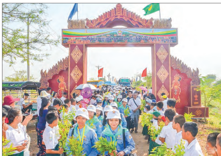
Luyechun students arrive Bagan on 30 April.

At BEHS (1) of Nyaungshwe yesterday morning, two experts gave talks titled “Climate Change and Environmental Conservation” and “Agricultural development and tasks carried out by the department for the long-term preservation of Inle Lake” separately. Old outstanding student (Luyechun) shared their knowledge and experience to the younger students. At the Pale Ngwesaung resort hotel in Ngwesaung, old outstanding