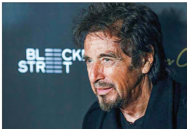
Actor Al Pacino attends the 'Danny Collins' premiere at AMC Lincoln Square Theater in New York on 18 March, 2015.

But the film had a less than auspicious start. Coppola re-