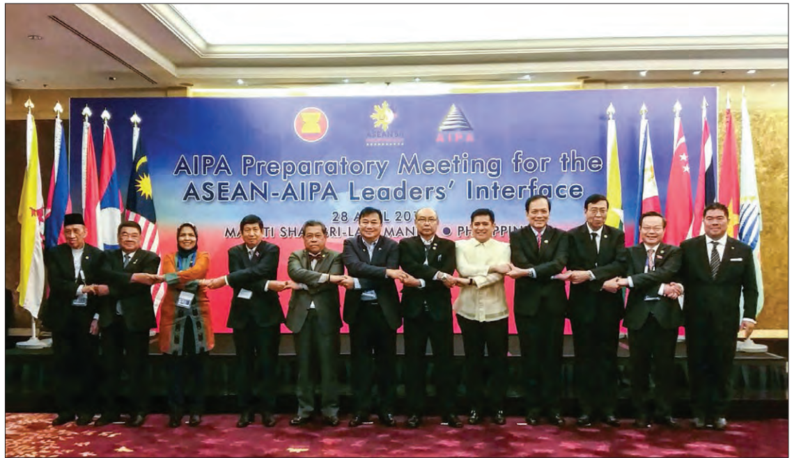
Speakers of parliaments of ASEAN countries join hands as they pose for photo.