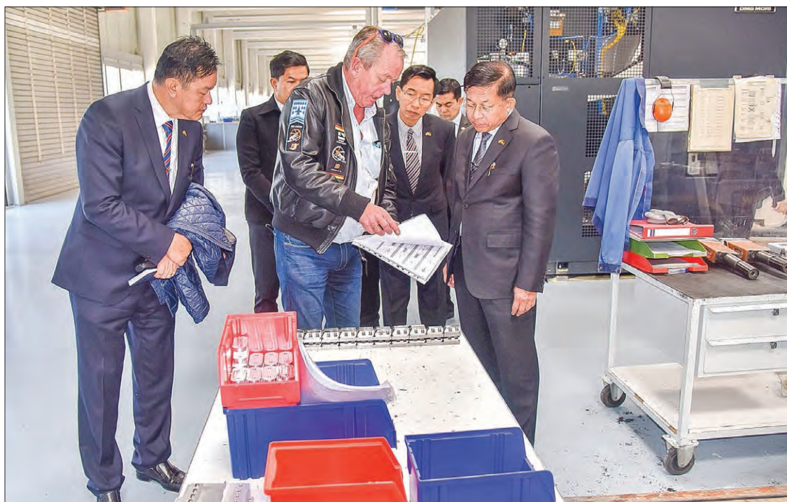
Senior General Min Aung Hlaing visits GROB Aircraft Company in Memmingen.