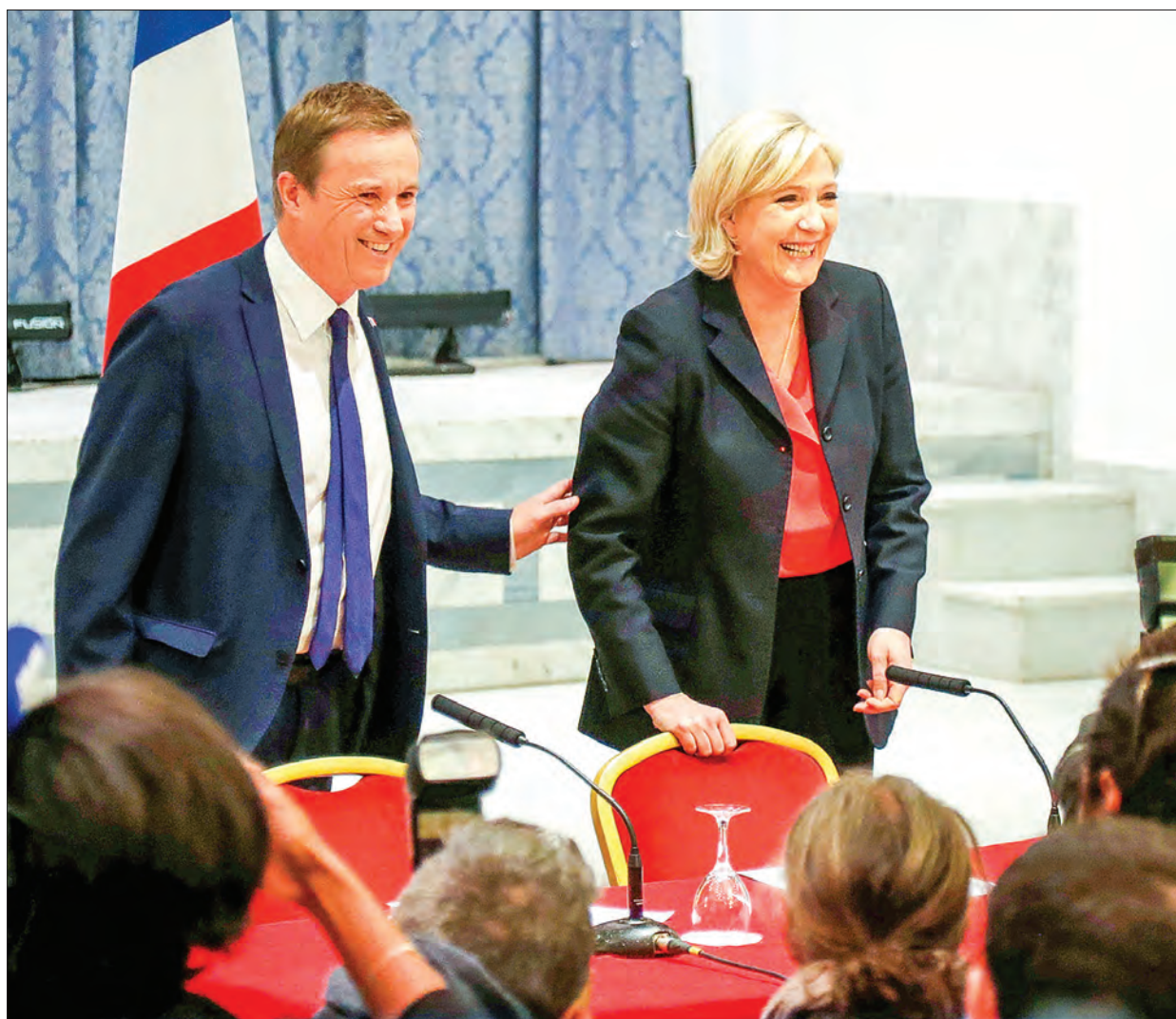
Marine Le Pen French National Front (FN) political party leader and candidate for French 2017 presidential election and Debout La France group former candidate Nicolas Dupont-Aignan attend a news conference in Paris, France, on 29 April, 2017.