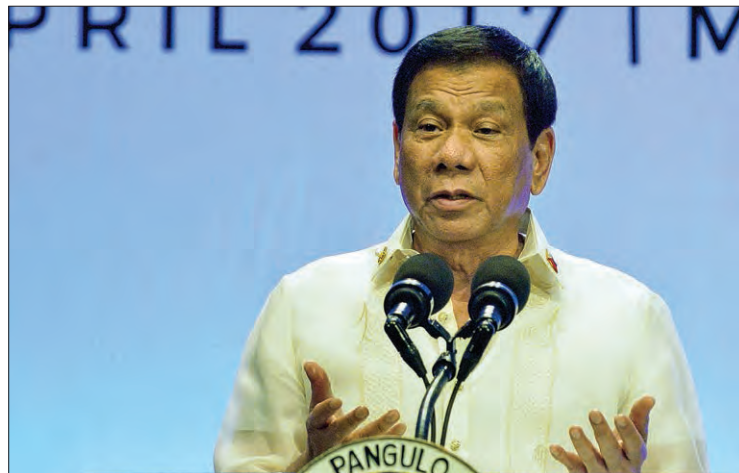
Philippine President Rodrigo Duterte holds a press conference in Manila on 29 April, 2017, following a one-day summit there of the Association of Southeast Asian Nations.

The leaders urged North Korea to "immediately comply fully with its obligations arising from all relevant UN Security Council resolutions and stressed the importance of exercising self-restraint in the interest of maintaining peace, security and stability in the region and the world."