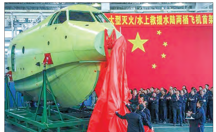
Officials of Aviation Industry Corporation of China (AVIC) unveil the newly-made nose of amphibious aircraft AG600, during a ceremony at a factory in Chengdu, Sichuan province on 17 March, 2015.

The seaplane's maiden flight comes amid China's increasing assertiveness to its territorial claims in the disputed South China Sea where it is building airfields and deploying military equipment, rattling nerves in the Asia-Pacific region and the United States.