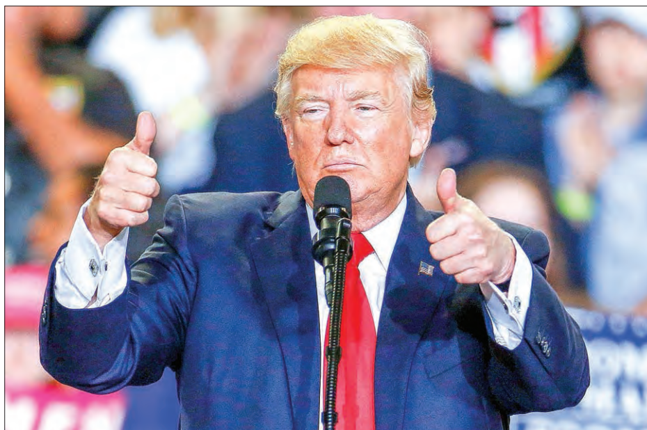
US President Donald Trump appears on stage at a rally in Harrisburg, Pennsylvania, US on 29 April, 2017.

The rally occurred on the same day as a climate march at which thousands of protesters surrounded the White House, and it also coincided with the annual black-tie White House