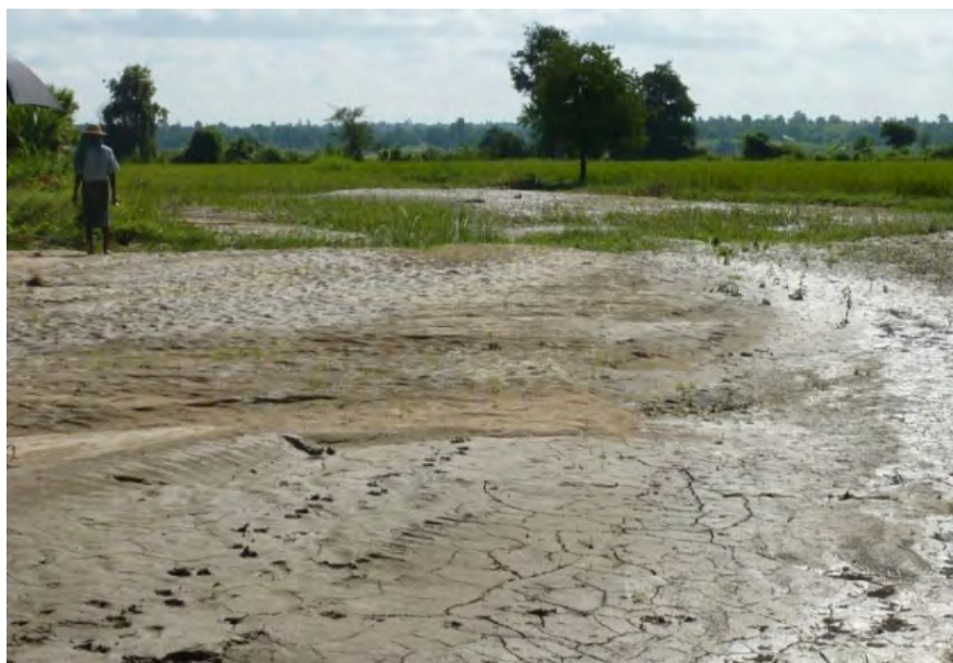
Figure 2.4 Flood in Pakokku Township (sand filled the rice field)