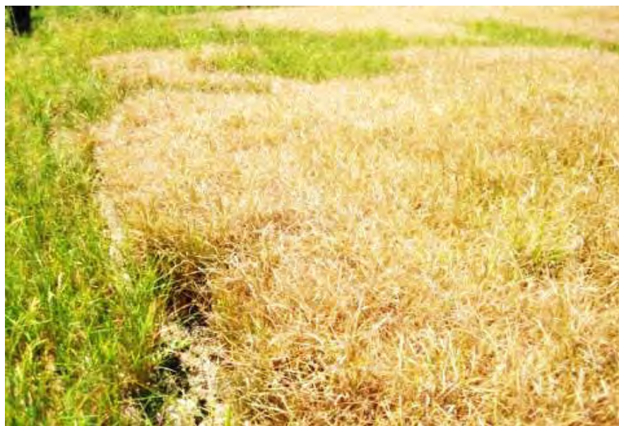
Figure 2.3 Rice field experiencing rain scarcity and lack of irrigation water.