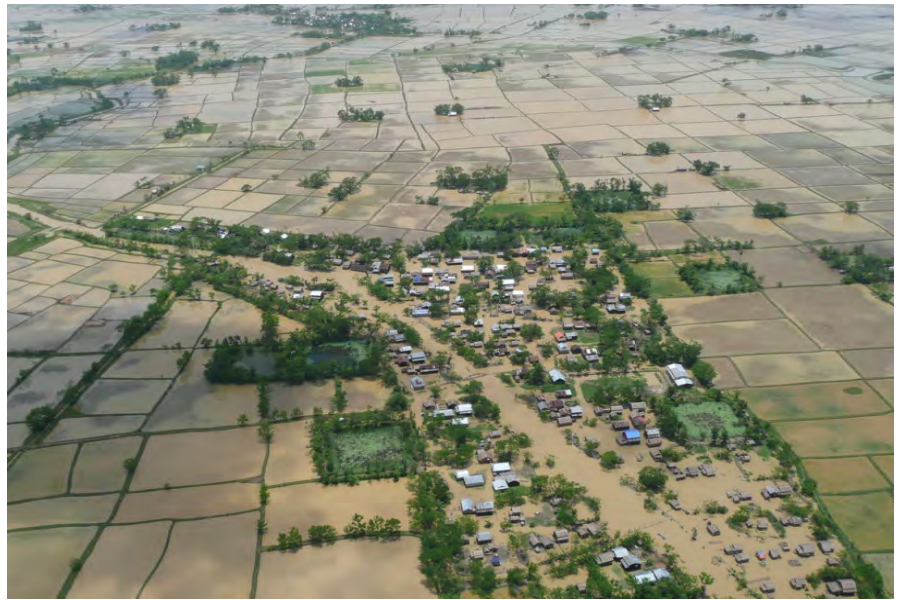
Figure 2.1 Village and livelihoods were destroyed as rice paddies were flooded for months after Cyclone Nargis struck (adopted from www.globaleducation.edu.au )

According to a report of FAO (2008), rural households are supported by small-scale backyard gardens with fruit trees such as banana, mango, jackfruit, guava, cashew nut; vegetables and small-scale livestock such as pigs, ducks and chickens. Nearly one third of the communities surveyed, at least one household had a small home garden before Cyclone Nargis (Figure 2.2).