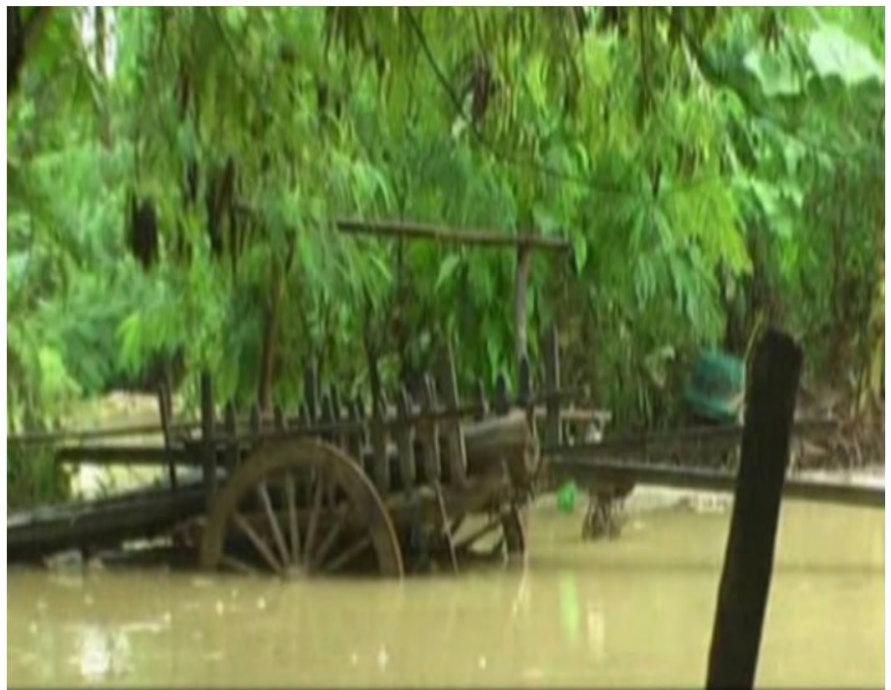
Figure 2.5 Loss of productive assets after Pakokku floods in 2011