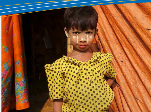
A girl in an IDP camp in Rakhine, Feb 2016.

$ 10 million New contributions reported in 2016. (Includes $6 million for activities in the Humanitarian Response Plan and $4 million for other activities).