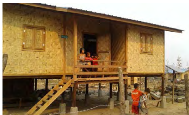
Newly built houses for flood affected people in Kalay, Sagaing, March 2016.

Of the approximately 11,000 people who were staying in flood evacuation sites in Chin State and Sagaing Region at the end of October 2015, over 7,000 people had been relocated as mid-March 2016. People being relocated to new sites or returning to their villages of origin have received new housing or materials from the Government. In many of the relocation sites the state government, MRCS, the UN and national and international NGOs have provided water and sanitation facilities, cash assistance and other support. There is however still a need for improved access to healthcare, schools and other basic services at some sites, as well as for improved roads in villages, and an overall need to help people reestablish their livelihoods to ensure long-term recovery. Some families in Kalay Township also still need support to rebuild their houses.