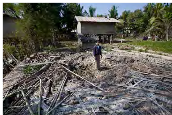
A woman stands amidst debris on her land in Sagaing following the 2015 floods, Dec. 2015.

People in the hardest-hit areas of Chin and Rakhine states – already vulnerable before the 2015 floods – are still suffering from food insecurity