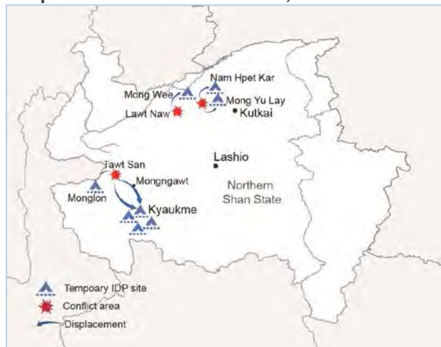
Displacement in northern Shan, Jan – March 2016

Over 7,300 people were newly displaced in northern Shan in 2016. Over 4,700 of these people were able to return home again by the end of March