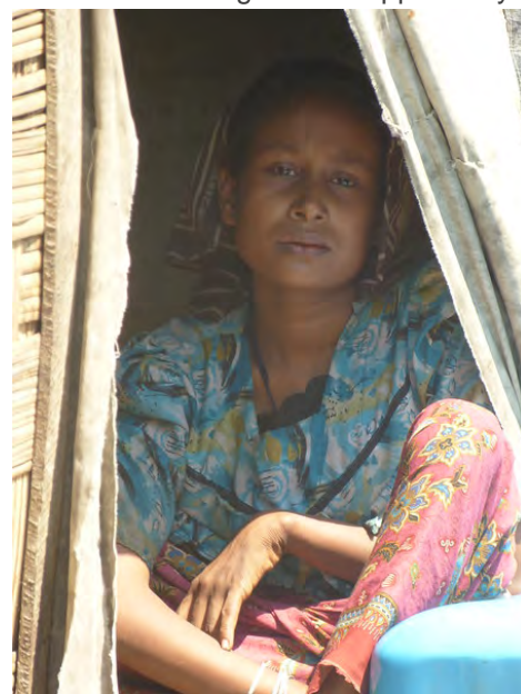
A displaced woman in an IDP camp in Rakhine, March 2015.

In 2016, the humanitarian community in Myanmar continues to further integrate protection into programmes and activities. In March, the Protection Sector conducted a series of consultations, which identified a number of follow-up actions. These include reinforcing the commitment to protection by UN and NGO actors; strengthening analysis, information-sharing, communication and advocacy around protection; and ensuring that protection is integrated into all humanitarian activities.