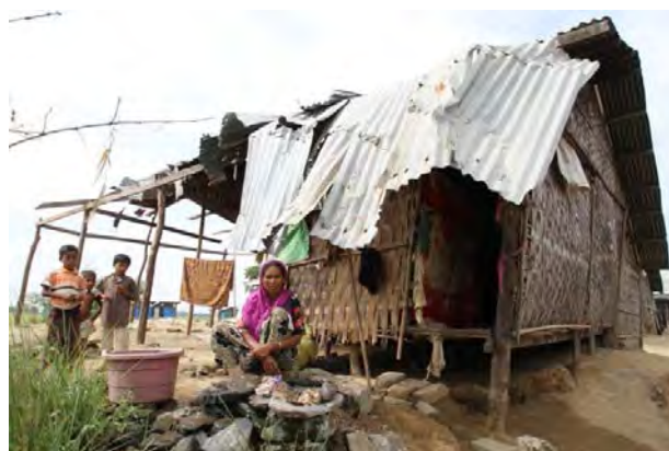
Shelter damaged by Cyclone Komen, Nov 2015.

About 120,000 people remain displaced in 39 camps or camp-like settings across Rakhine State as a result of the inter-communal violence that broke out in 2012. While some repair and maintenance work occurred in 2014 and 2015, many of the long-houses that were built in 2013 as a temporary measure to last for two years are now in very poor condition. They have weathered three monsoon seasons, as well as Cyclone Komen, which made landfall in southern Bangladesh, close to Rakhine State, in July 2015. The next rainy season is two months away. Ensuring that people are protected from the elements and that they are able to live in dignified conditions is an increasingly critical need. This is particularly the case in Pauktaw and Myebon townships, where many shelters will have to be almost entirely rebuilt, with only 5 per cent of the original building structure being salvageable. Water and sanitation infrastructure is also in need of repair and maintenance in many IDP camps.