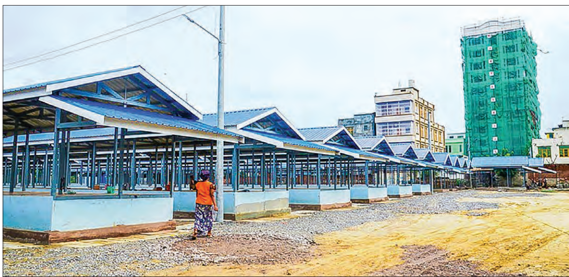
Temporary shops for Mandalay Mingalar market's fire victims are ready to accommodate the shopkeepers.

THE temporary shops for Mandalay Mingalar market's fire victims will be given out through a draw of lots in the second week of September.