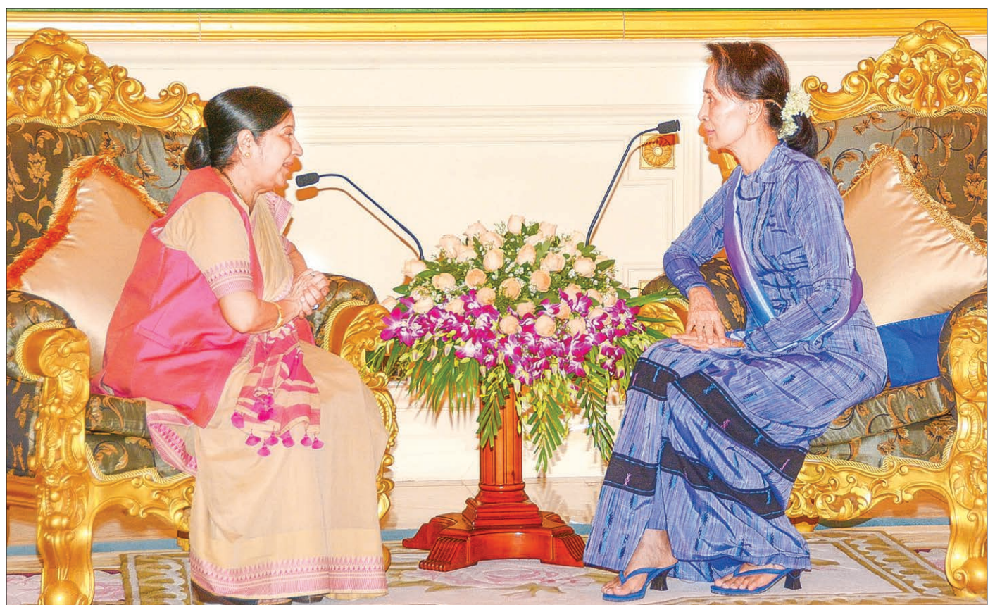
State Counsellor Daw Aung San Suu Kyi holds talks with Indian External Affairs Minister Ms Sushama Swaraj.

Also present at the call were Minister of State for Foreign Affairs U Kyaw Tin and officials.—GNLM with MNA