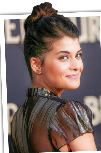
Cast member Sofia Black-D'Elia poses at the premiere for the movie 'Ben-Hur' at TCL Chinese theatre in Hollywood, California US, on 16 August.

the Christian community, doing outreach to pastors and holding taste-maker screenings for religious leaders. The studios also hoped that producers Mark Burnett and Roma Downey, who earned devout points with "Son of God" and the mini-series "The Bible," would help them turn out values audiences. Instead, "Ben-Hur" trailed the $47 million debut of "Noah" and the $24 million launch of "Exodus: Gods and Kings," two recent Biblical epics that lacked a heavenly touch.