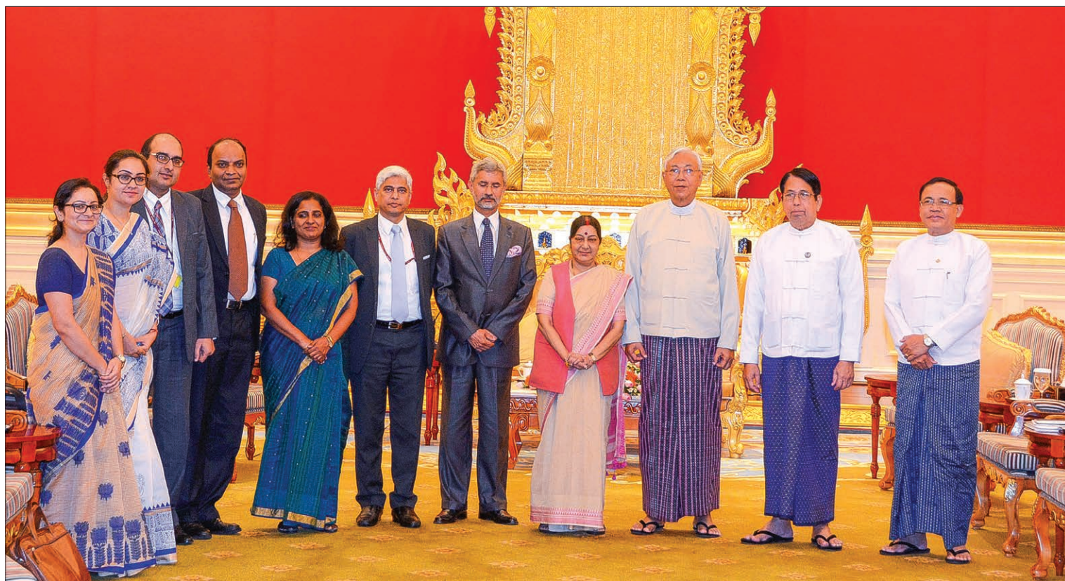
President U Htin Kyaw welcomes the Indian delegation led by External Affairs Minister Ms Sushma Swaraj.

Also present at the call were Union Minister for Information Dr Pe Myint and Minister of State for Foreign Affairs U Kyaw Tin.— Myanmar News Agency