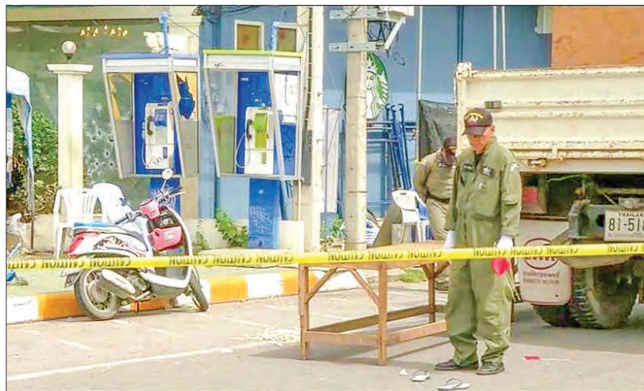
Police Explosive Ordnance Disposal (EOD) official inspects the site of a bomb blast in Hua Hin, south of Bangkok, Thailand, on 12 August 2016.

BANGKOK — Thai police on Monday said at least 20 people were involved in carrying out a wave of deadly bombings in the country's south earlier this month.