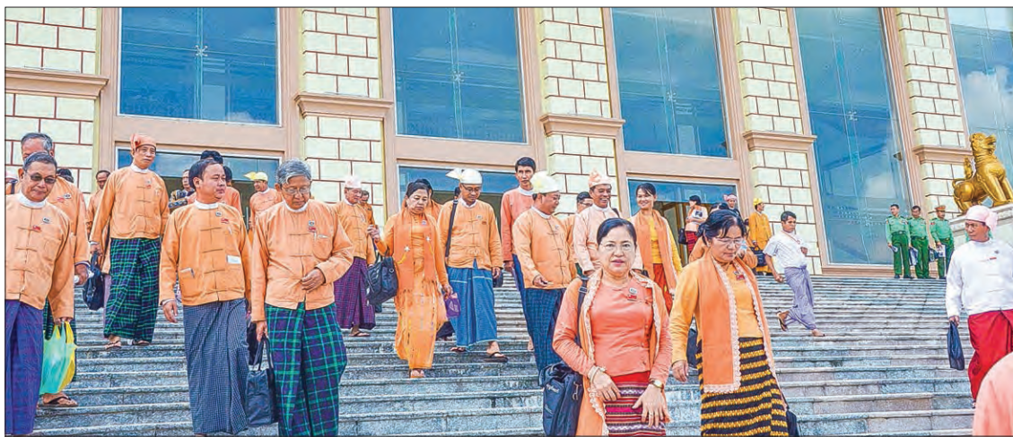
MPs leave Pyithu Hluttaw building after the parliamentary meeting on 22 July.

Despite the proposed fund of K175million for maintenance work of the project, the