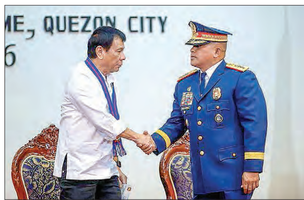
Philippine President Rodrigo Duterte shakes hands with Philippine National Police (PNP) Director General Ronald Dela Rosa (R) upon his arrival to address the 115th Police Service Anniversary at the (PNP) headquarters in Quezon city, metro Manila, Philippines, on 17 August 2016.

MANILA — The number of drug-related killings since President Rodrigo Duterte took power and declared war on drugs in May has doubled to about 1,800, police said on Monday, a day after Duterte lashed out over United Nations criticism of the wave of deaths.