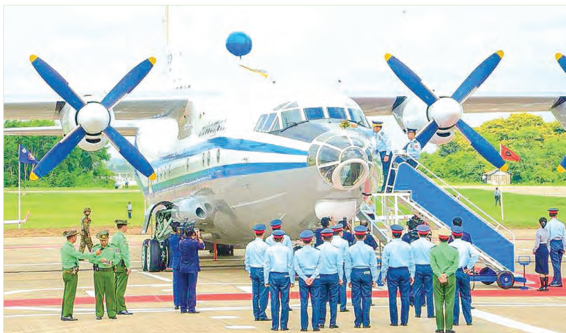
Senior General Min Aung Hlaing sprinkles scented water on the new transport aircraft.

COMMANDER-IN-CHIEF of Defense Services Senior General Min Aung Hlaing attended a ceremony to put new Air Force aircraft into service at the Flying Training Base in Meiktila Station yesterday. In honour of the ceremony, the Command-