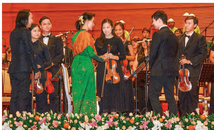
State Counsellor Daw Aung San Suu Kyi extends greetings to musicians in Nay Pyi Taw.