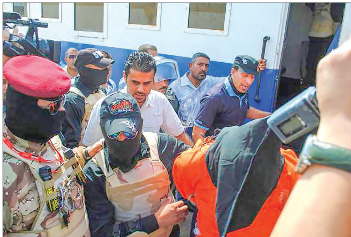
Iraqi security forces escort a man (R), sentenced to death over the mass killing of hundreds of mainly Shi'ite soldiers at a camp north of Baghdad two years ago, at Nasiriya prison in the southern Iraqi city of Nasiriya, on 21 August 2016.

BAGHDAD — Iraq said on Sunday it had hanged 36 militants sentenced to death over the mass killing of hundreds of mainly Shi'ite soldiers at a camp north of Baghdad two years ago.