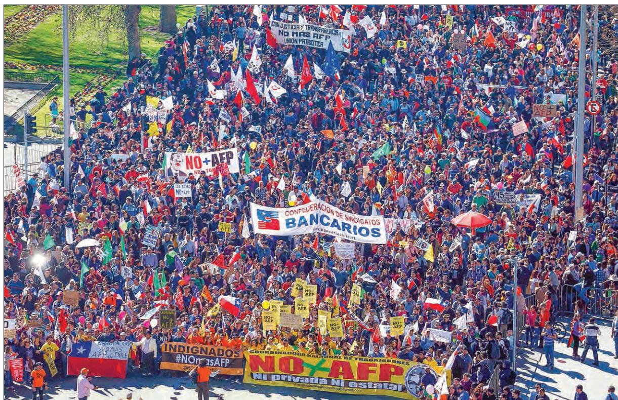
Demonstrators take part in a protest against government to demand changes to the national pension system in Santiago, Chile, on 21 August, 2016. The placards reads: "No more AFP" (Pension Fund Administrators).

Since the coup, more than 17,000 people have been placed under formal arrest, and tens of thousands more suspended from their jobs. Turkish authorities blame the failed putsch on US-based Muslim cleric Fethullah Gulen and his followers. Gulen denies involvement and has condemned the coup attempt.—Reuters