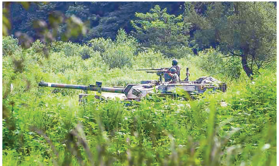
A South Korean army tank takes part in a military exercise near the demilitarized zone separating the two Koreas in Paju, South Korea, on 22 August 2016.

"From this moment, the first-strike combined units of the Ko-