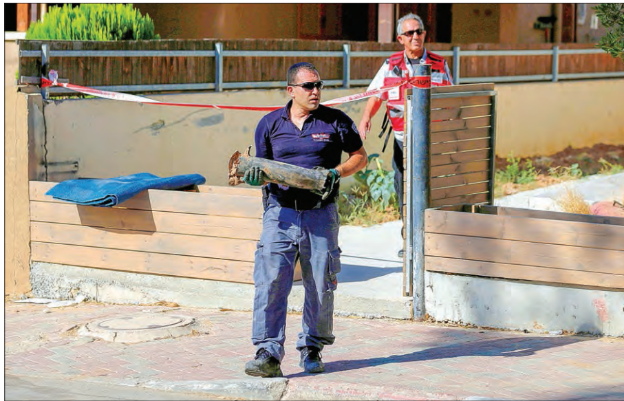
An Israeli policeman carries part of a rocket which the Israeli army and police said was launched from Gaza, landing next to a residential building in the Israeli southern town of Sderot, Israel, on 21 August 2016.

A music festival in Sderot attended by hundreds of Israelis was temporarily disrupted as people sought shelter, television footage showed.