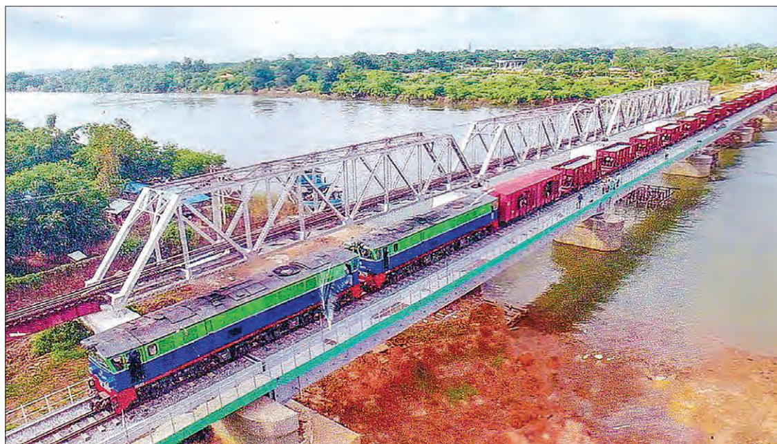
Photo shows a train making the first test run on the new railroad bridge.

The railroad bridge, which is 721 feet long and 12 feet wide, consists of five posts. It was built with the use of a 682 feet long steel frame weighing 800 tonnes. Concrete railway sleepers have been installed at the bridge. — Aung Thant Khaing