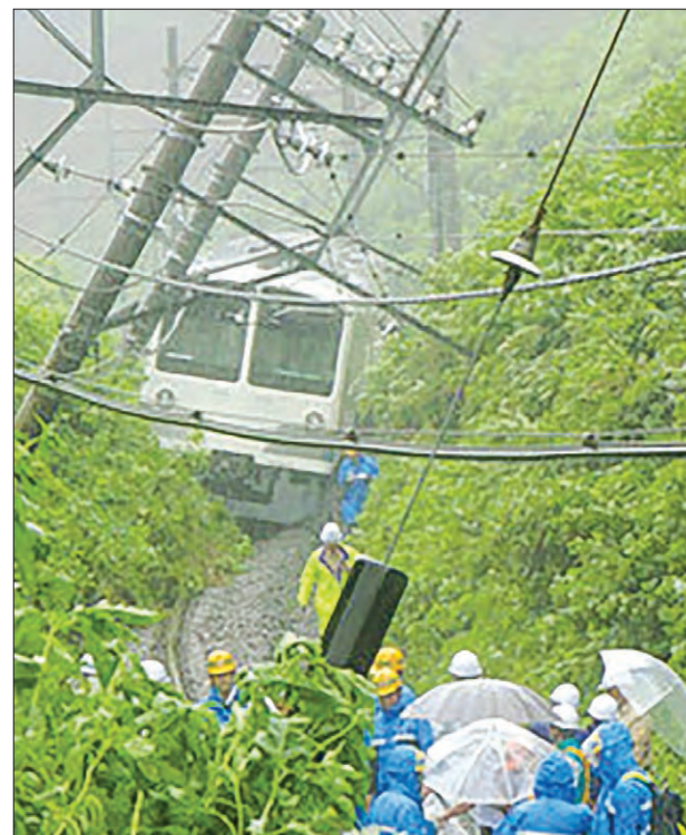
A derailed train on the Seibu Tamako line in Higashimurayama, western Tokyo, on 22 August 2016.

He may have left his vehicle after it became stranded in the middle of the flooded road, the police said.— Kyodo News