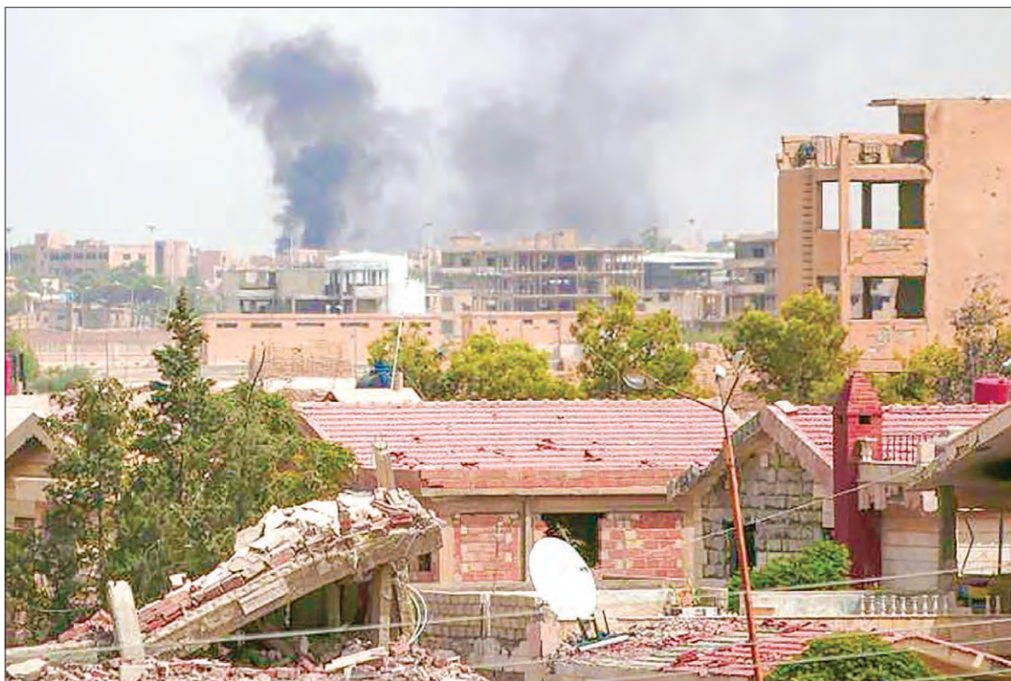
Smoke rises from the northeastern city of Hasaka, Syria, on 21 August, 2016.

The YPG denied it had entered into a truce. It distributed leaflets and made loudspeaker calls across the city asking for