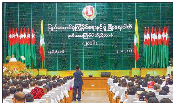
USDP's second conference in progress.

During yesterday's conference, members of the party's central committee, reserve CEC members and members of the central executive committee were re-appointed. — Myanmar News Agency