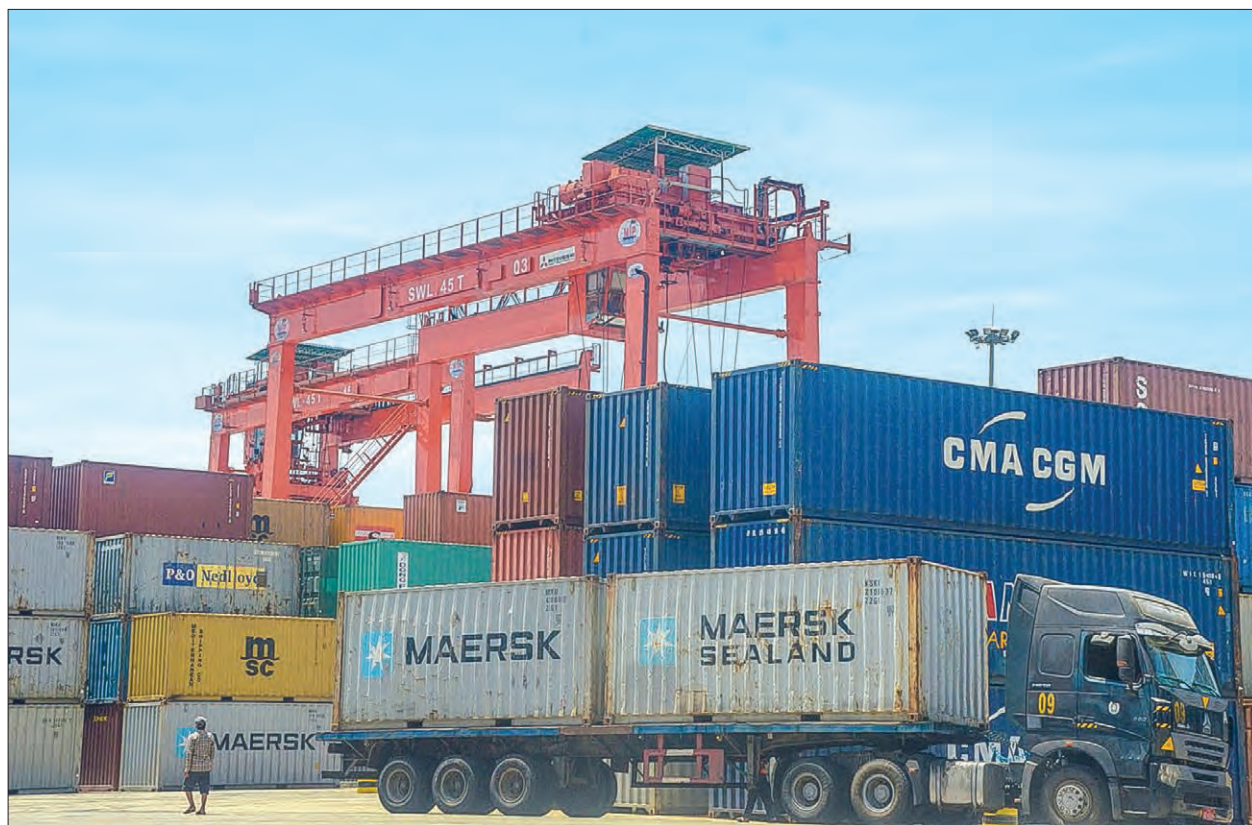
Containers are seen at Asia World Port Terminal in Yangon.

The Yangon port is faced with a struggle to handle the containers arriving at the port when the owners of the goods fail to withdraw their goods in a timely manner. To prevent the ports from being used as godowns, the authorities increased the fines for those who fail to remove their goods on time. This is an attempt for the ports to be able to move cargo quickly and decrease backlogs.—200