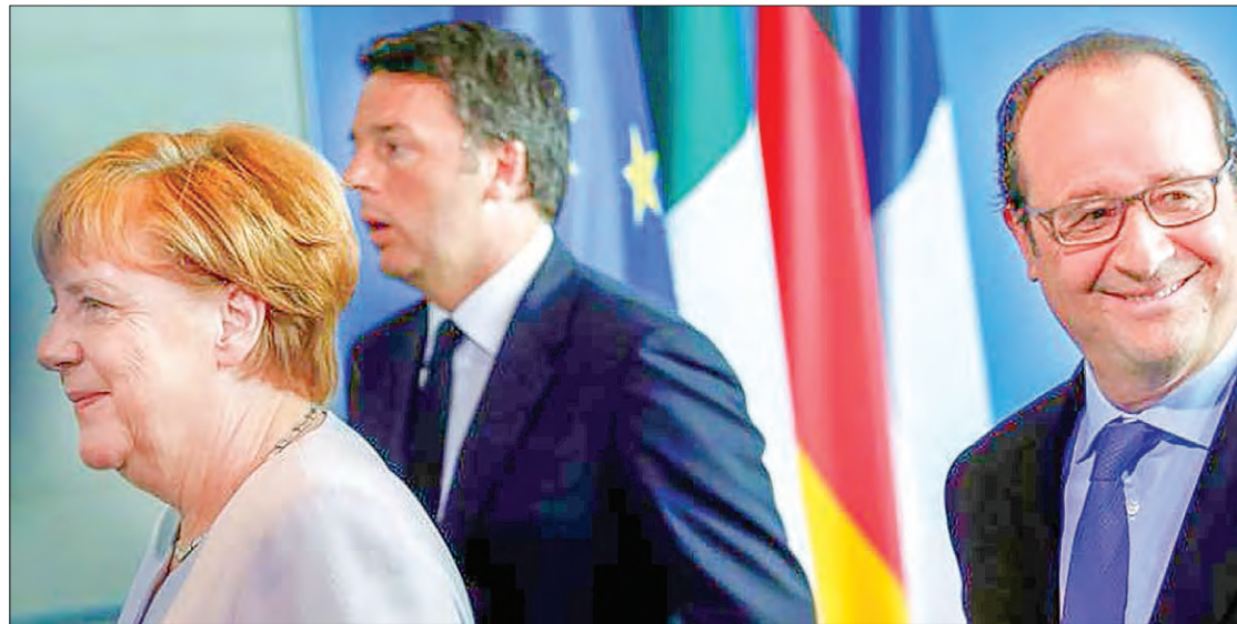
German Chancellor Angela Merkel (L), French President Francois Hollande (R) and Italian Prime Minister Matteo Renzi attend a news conference at the chancellery during discussions on the outcome of the Brexit in Berlin, Germany, on 27 June, 2016.

"He's wrestling with how to do that. People that are here unlawfully, came into the country against our laws, are subject to being removed. That's just plain fact," the Alabama lawmaker said. "He's thinking that through." Trump has also been rebuked by opponents for his proposal to impose a temporary "total and complete shutdown" of Muslims seeking to enter the country, later rolled back to focus on countries with "a proven history of terrorism." —Reuters