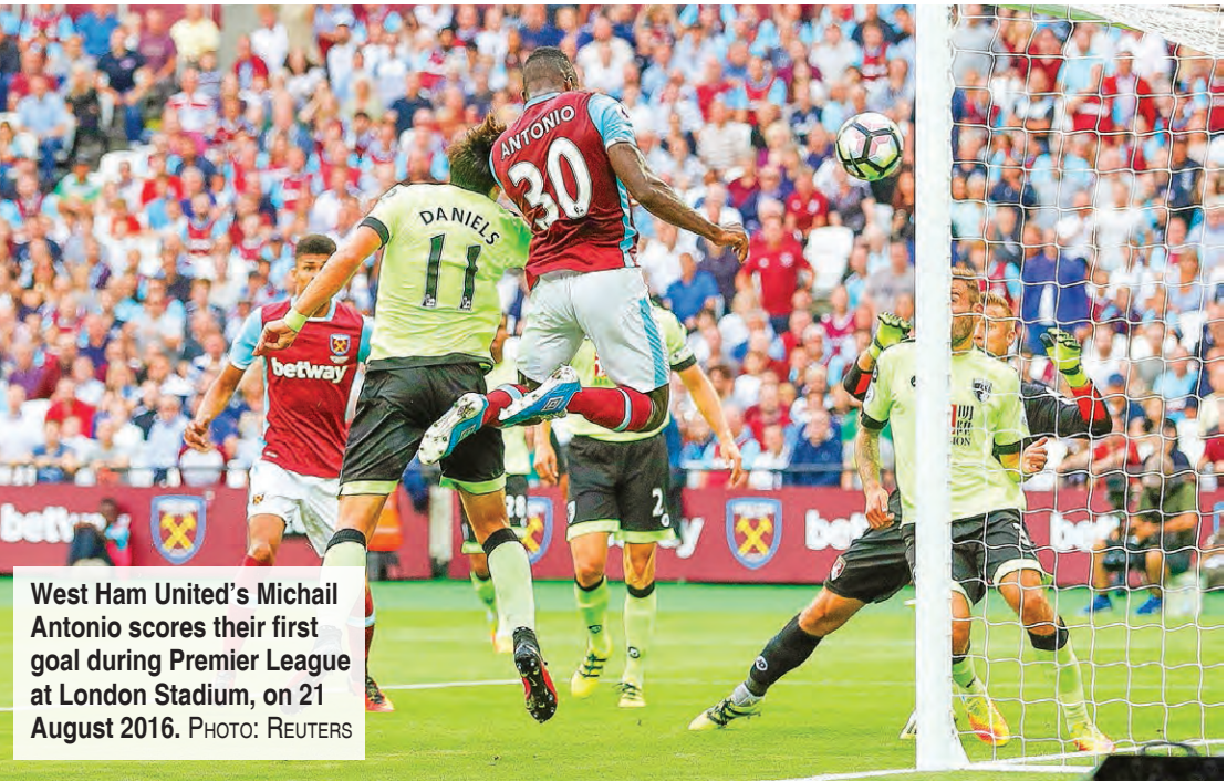
West Ham United's Michail Antonio scores their first goal during Premier League at London Stadium, on 21 August 2016.