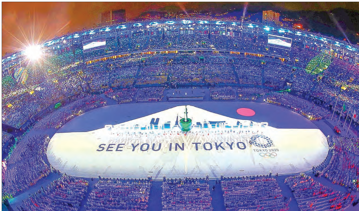
Performers take part in the closing ceremony 2016 Rio Olympics Closing Ceremony at Maracana in Rio de Janeiro, Brazil, on 21 August 2016.

A swampy green diving pool and a bullet whizzing into the equestrian centre were of no