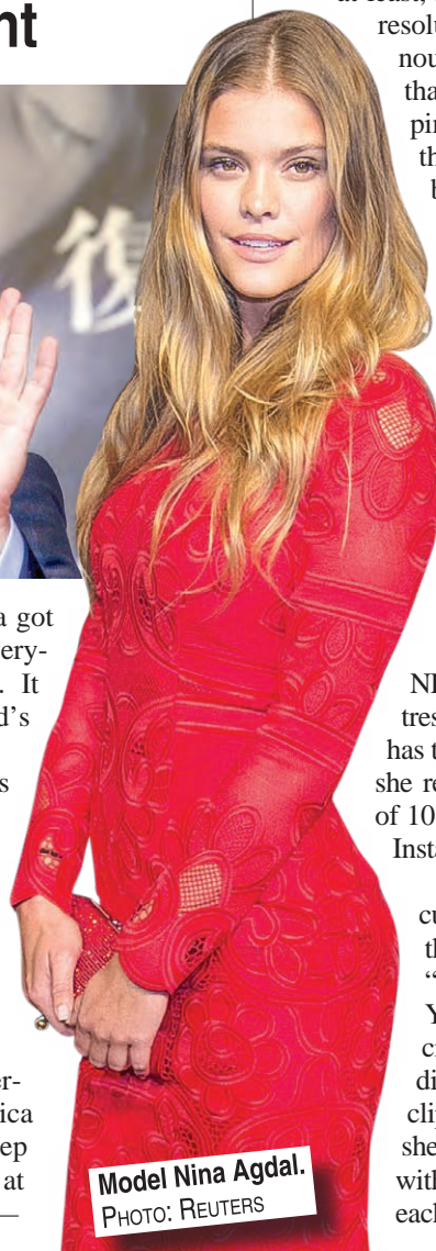
Model Nina Agdal.

Justin Timberlake and wife Jessica Biel eventually step in to host the event at their own house.