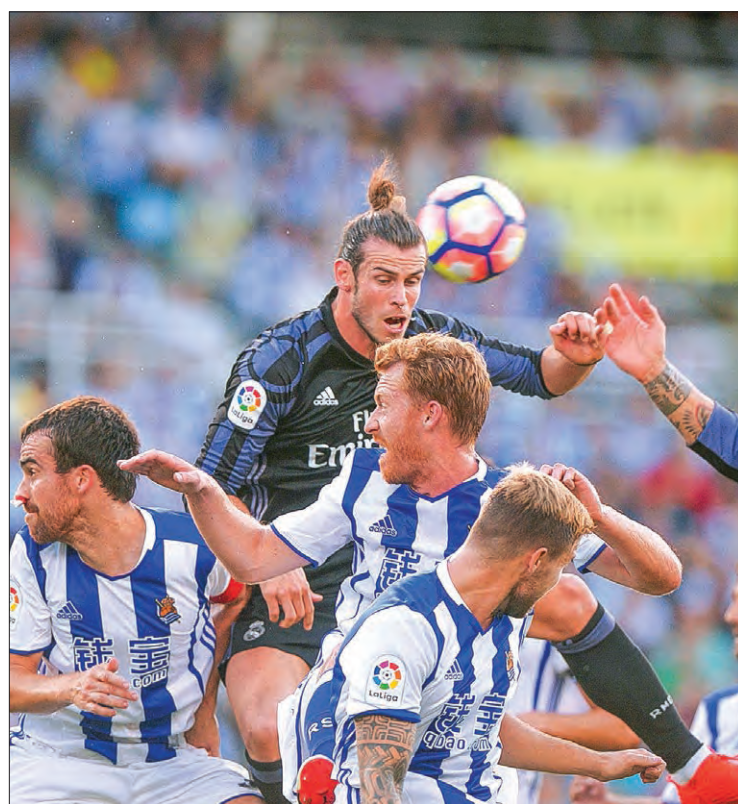
Real Real Madrid's Gareth Bale heads the ball during Spanish Liga Santander at Anoeta, San Sebastian, Spain, on 21 August 2016.

But he was also beatable, as Singapore's Joseph Schooling showed in touching out the legend who had inspired him with a historic victory in the 100m butterfly. Phelps finished in a three-way tie for silver.—Reuters