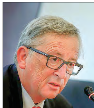
European Commission President Jean-Claude Juncker.

BRUSSELS — European Commission President Jean-Claude Juncker said on Sunday Turks would only be granted visa-free travel to EU countries from October if Ankara meets all the requirements, including reforming anti-terror laws.