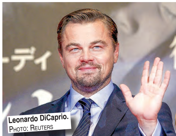
Leonardo DiCaprio.

NEW YORK — "The Revenant" actor Leonardo DiCaprio and his model girlfriend Nina Agdal were reportedly involved in a car crash.