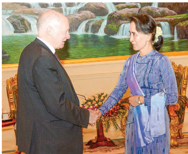
State Counsellor Daw Aung San Suu Kyi shakes hands with Lord Neuberger, the President of the UK Supreme Court.

dential Palace in Nay Pyi Taw at 15:45 hrs on 22 August, 2016, and exchanged views on the promotion of bilateral relations and cooperation between Myanmar and the UK.— Ministry of Foreign Affairs