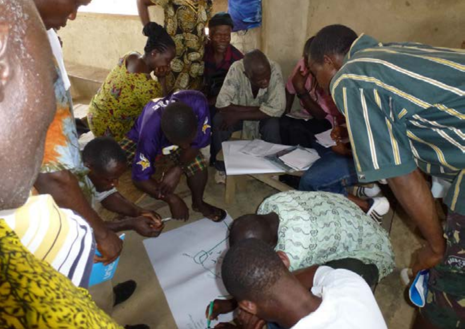
Community members contribute to the development of a preliminary map of village boundaries and resources as part of the process to recognize community rights to forestlands in Liberia.

to legal entities representing the community (LRP, §6.3.1), although the types of legal entities involved are not clear. As in Mozambique, it is proposed that management authority will rest in community representatives that must be selected in a way to ensure equitable representation of all community members (LRP, §6.4.1). Similarly, it is proposed that the community's representatives' decision-making be conducted in a way that ensures equitable representation and accountability to all community members (LRP, §6.4.1). The policy recognizes that this is an ambitious agenda and proposes that the government assist communities to self-define, obtain deeds, establish the community as a legal entity, demarcate boundaries, and put in place required governance and management procedures (LRP, §6.6.1). This will prove to be a challenge in a country with very limited resources.