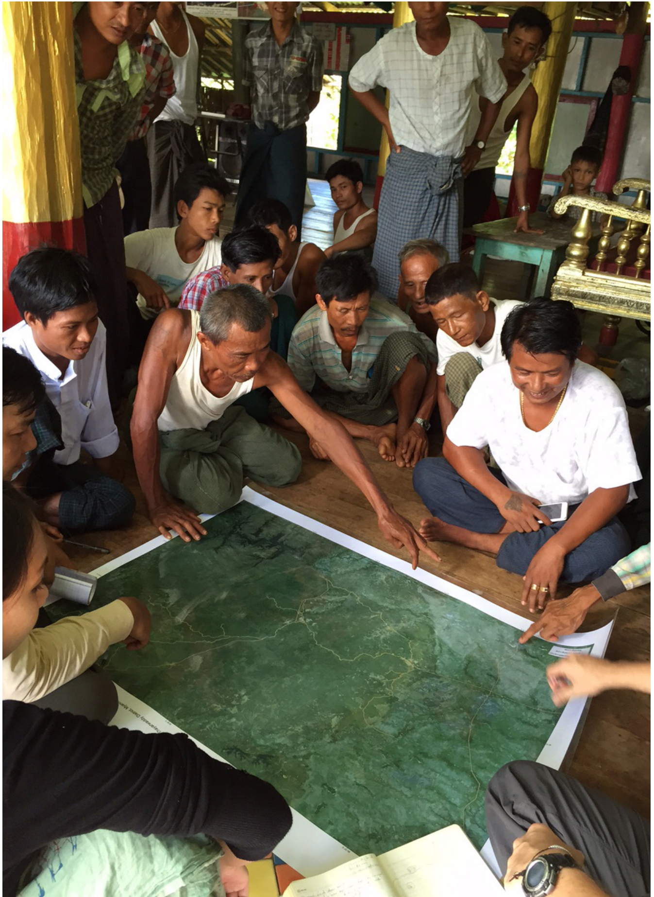
Villagers in Myanmar's Bago region consider for the first time an aerial photograph of their land area.