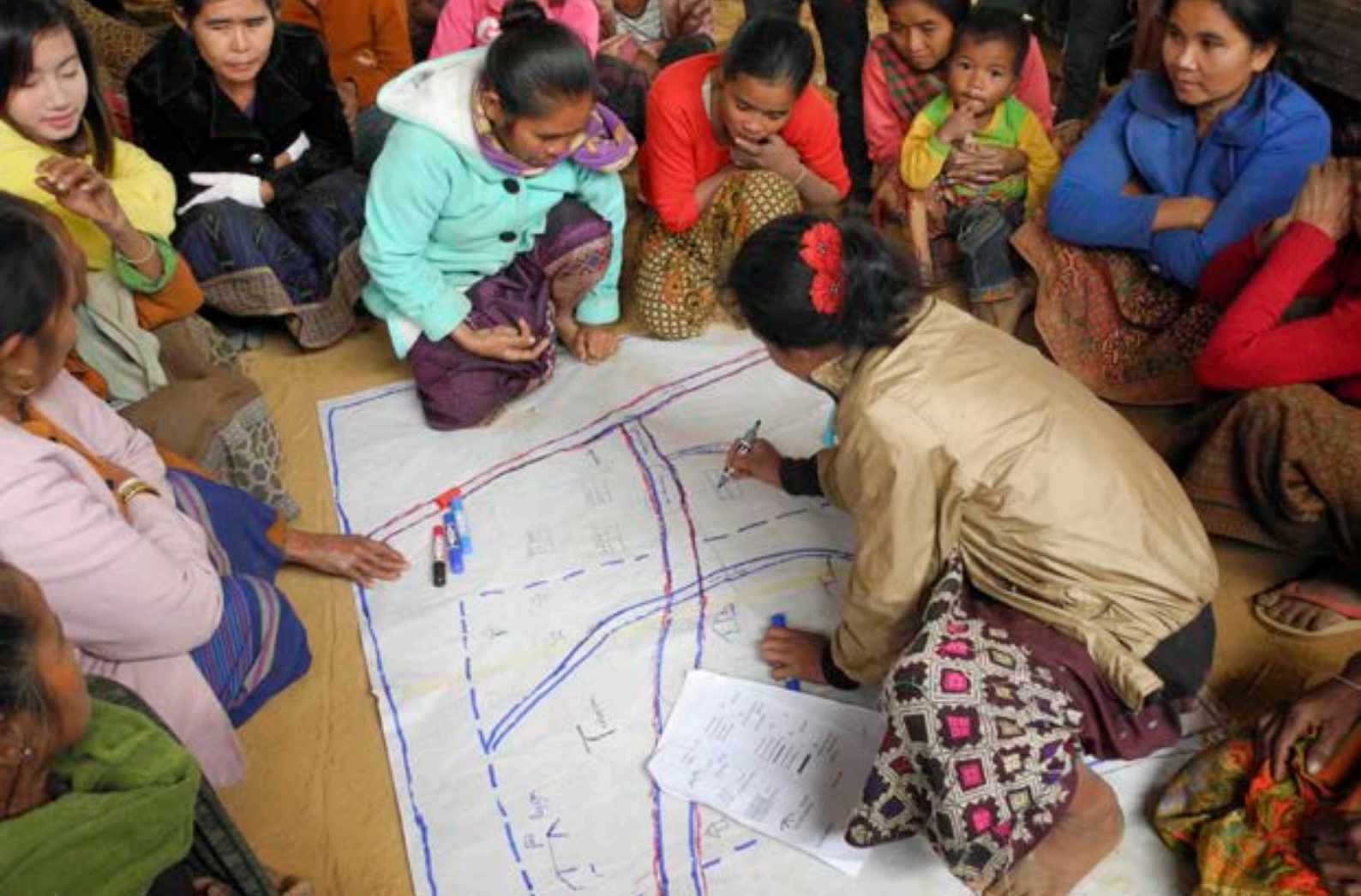
Local land governance in action in Lao PDR: Women develop a village map.