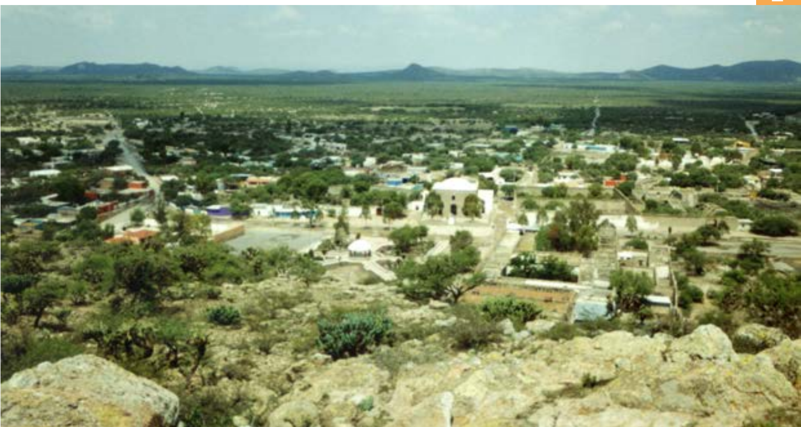
A view of a Mexican ejido in San Luis Potosi shows the large commons land in the background.

The land reform process granted land to communities of 20 or more members. Ejido land tenure typically comprises three jurisdictional land categories: communal lands (typically forests, pastures, and water resources), individual use parcels (for family farming and animal husbandry), and individual use urban housing lots known as solares . All ejidos (as well as indigenous lands) have the same governance structures composed of three bodies: