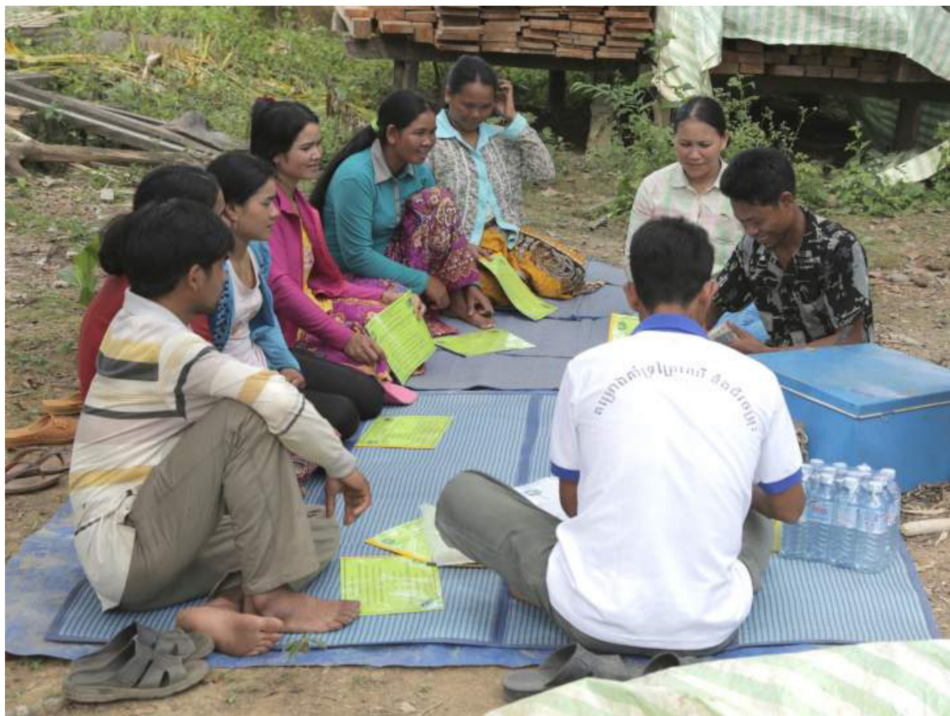
Indigenous people in Cambodia's O'Rona village discuss community land use planning and how to use and manage their resources sustainably.