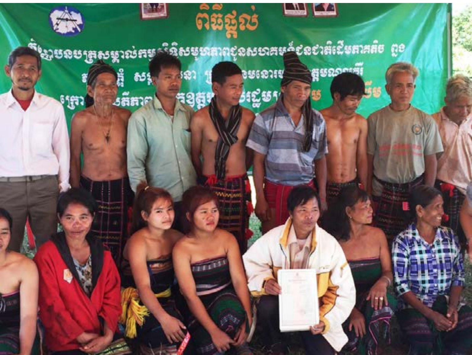
A community from the ethnic Bunong group in Monduliri Province receive their collective land title.

While IP communities may hold title to land once granted by the state, the land is still considered