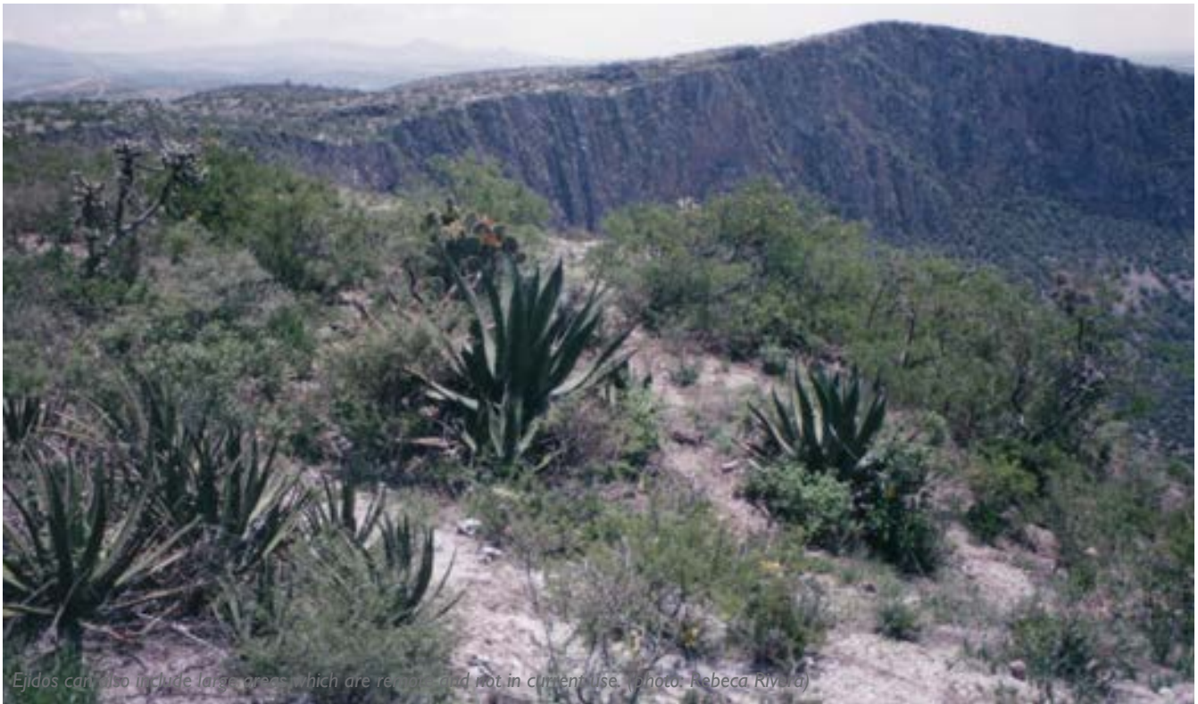
Ejidos can also include large areas, which are remote and not in current use.

In sum, ejidos have demonstrated that communal and individual land rights can effectively coexist within the same system while also successfully managing natural resources, particularly forests. Creating a special registry (RAN) for ejido lands, separate from the private land registry, and making its transactions free of charge ensured an effective “pro-poor” land reform process. Increasing access (through Internet and mobile transactions) to registry services will further incentivize investment in rural Mexican ejido lands. Additional effort is needed to ensure gender and intergenerational equity in conveying ejido property rights, to improve both the land registration and title systems, as well as community-level awareness of land rights (USAID, 2011c).