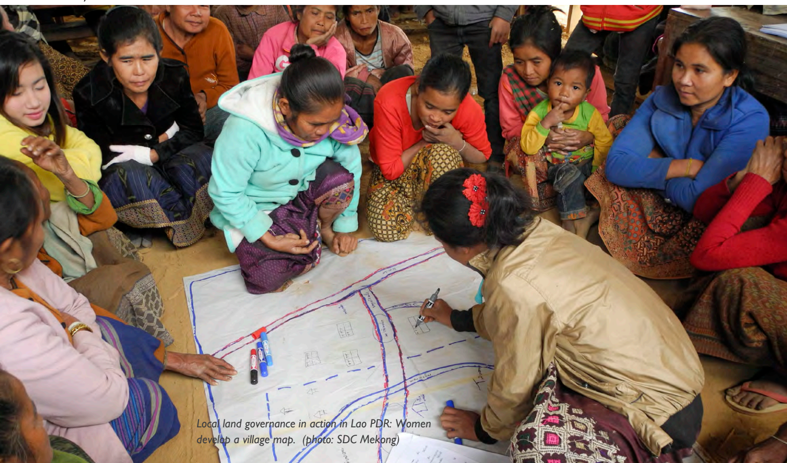
Local land governance in action in Lao PDR: Women develop a village map.

The Voluntary Guidelines on the Responsible Governance of Tenure of Land, Fisheries, and Forests in the Context of