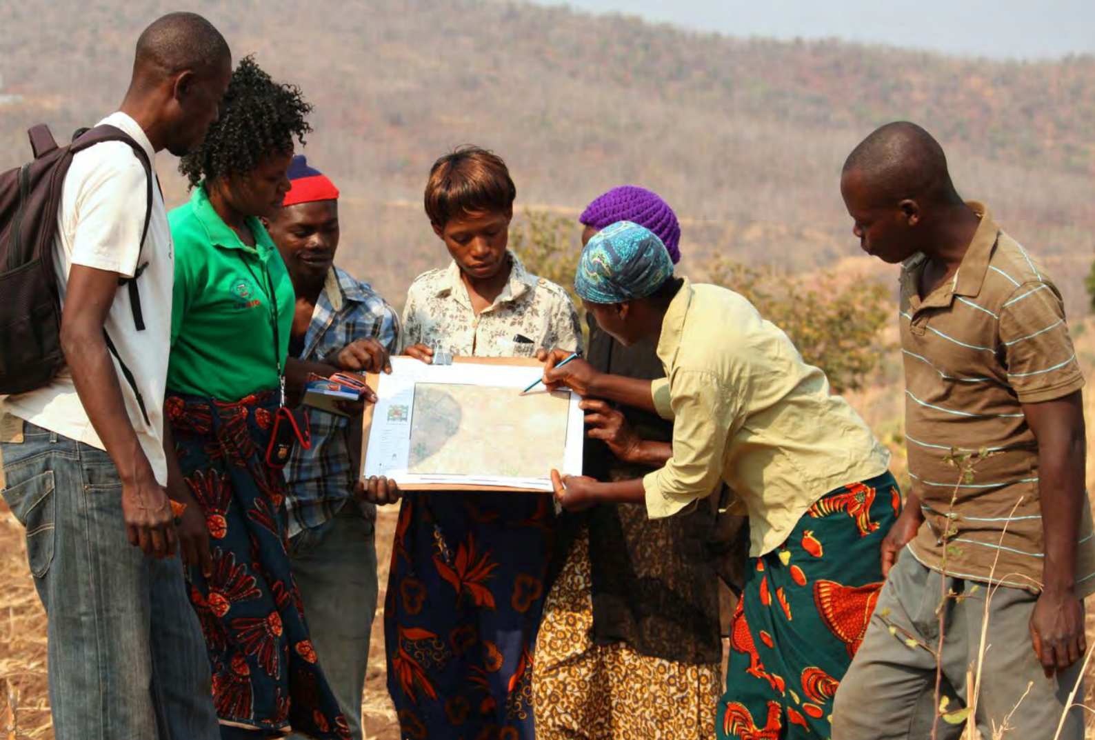
Community members of Faisako Village in Zambia's Maguya Chiefdom discuss field demarcations during community agricultural parcel mapping.