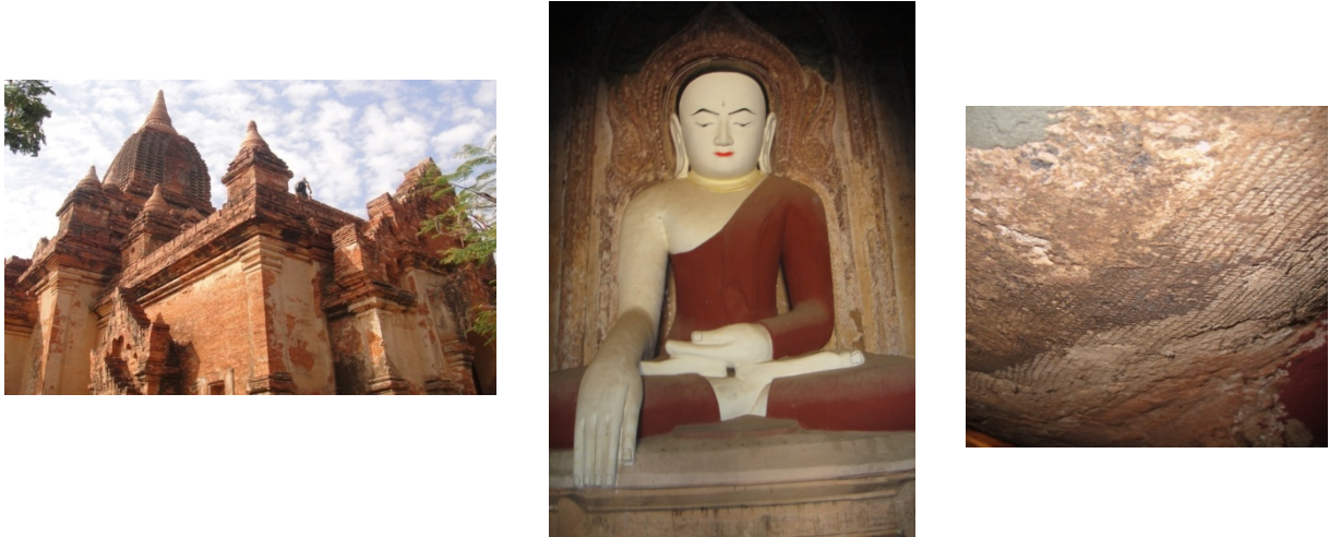
Fig. 3 Cloth paintings behind and on the left thigh of the Buddha Image at Pagoda No. 1391

Temple No. 320/204 (The group of Sule Kone Phaya Su) was likely to be built in 13 th century CE. It is situated south-eastern side of Alo Taw Pyae temple near the old road of Bagan –Nyaung U. Its vestibule faces to the east. There are 3 sitting Buddha images in central hall. Among them, the middle one is a crowned Buddha. Actually cloth paintings were applied to the Buddha image before renovation on 30, January, 1998. Some small fragments from right thigh, knee, arm and at the back of the body give evidence for the traces of cloth paintings. (See fig. 4)