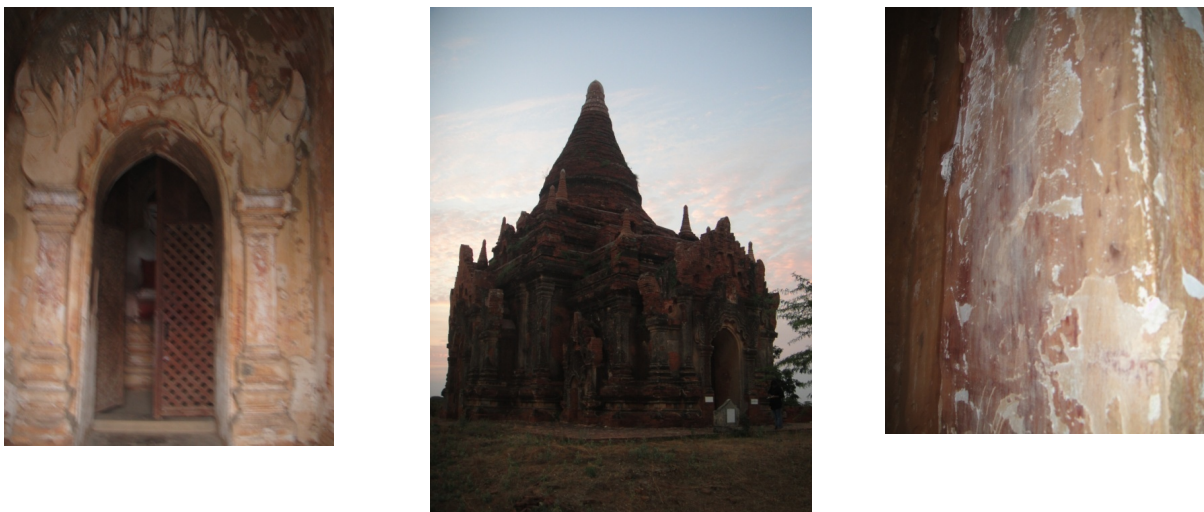
Fig. 10 temple No. 151 where traces of cloth painting was detected at the porch

Temple No. 15, also known as Kone Taw Gyi, is a single storey temple built in 13 th century CE. It is located at the southern part of That Kya Muni monastery, one mile away from the Bagan-Nyaung U motorway. The vestibule orients to the east. The porch at the lotus plinth pillar at the entrance of the ventral hall was decorated with cloth painting pieces with colour such as red, yellow and brown. (See fig. 10)