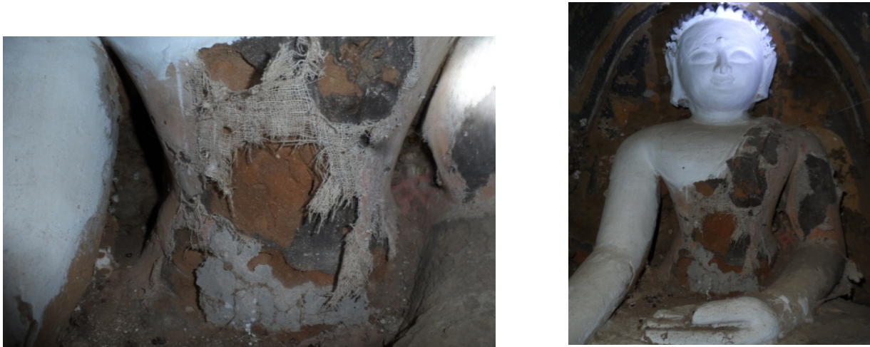
Fig. 1 Mud Buddha image covering with cloth paintings in Temple No. 1686

images were sculptured with mud motor. Such kind of mud images can be found in Myin Pyu Gu temple situated at old city of Bagan. It indicates this kind of making Buddha images were the 11 th century artcraft in Early Bagan period. Therefore, we can suppose that the cloth painting from these images had been created since 11 th century CE (Aung Kyaing, 2014). (See Fig. 1)