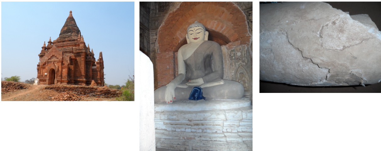
Fig. 8 The traces of cloth painting was found on the left arm of the Buddha in temple No. 600

Temple No. 600, also known as Maung Yone Gu, appears to have been built in 13 th century CE. It is situated in Minanthu village and very near to Shin Itza Gowna temple. The original Buddha image was decorated with cloth painting in ancient times, but only a few fragments can be seen due to renovation works. (See fig. 8)