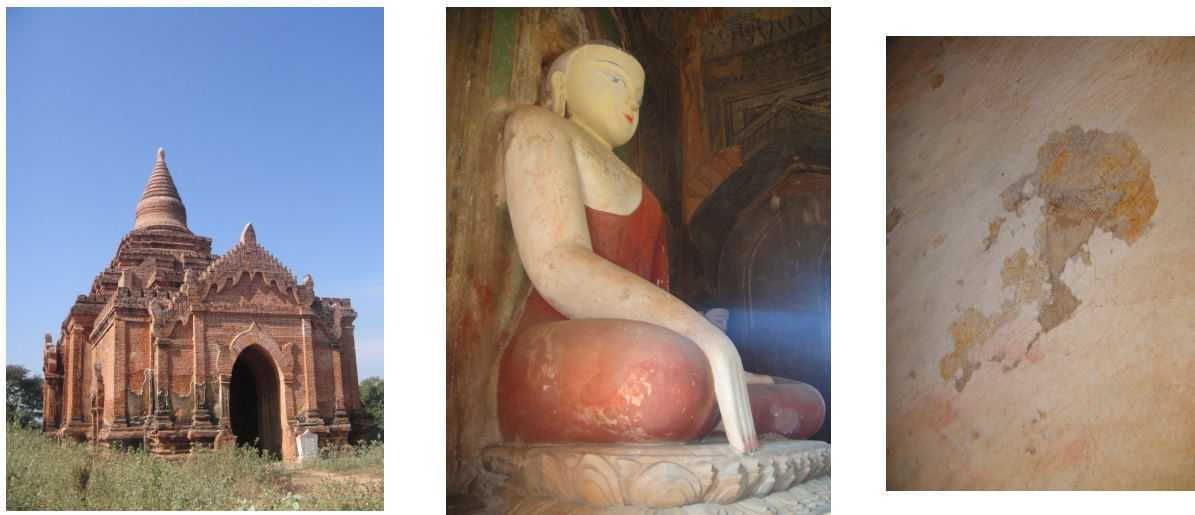
Fig. 4 showing the traces of cloth painting at temple No. 320/204

Temple No. 320/204 (The group of Sule Kone Phaya Su) was likely to be built in 13 th century CE. It is situated south-eastern side of Alo Taw Pyae temple near the old road of Bagan –Nyaung U. Its vestibule faces to the east. There are 3 sitting Buddha images in central hall. Among them, the middle one is a crowned Buddha. Actually cloth paintings were applied to the Buddha image before renovation on 30, January, 1998. Some small fragments from right thigh, knee, arm and at the back of the body give evidence for the traces of cloth paintings. (See fig. 4)