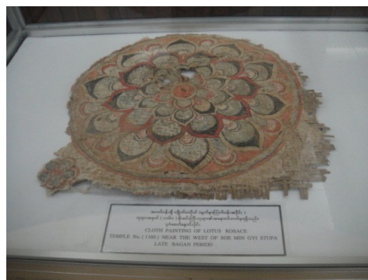
Fig. 15 cloth painting fallen from the ceiling of the temple No. 1160

Temple No. 1160 was built in 13 th century CE. It is situated at north of Soe Min Gyi temple and south of Myinkaabar village. The vestibule is facing to the east and has a square shaped tower. After the earthquake disaster in 1975, the large rosette hanging at the ceiling of temple 1160, was broken and fell down. The fragment of the cloth painting was found accidentally mixed with brick debris. This cloth painting was actually designating as a container for the rosette. On the cloth, lotus flower design was depicted. This rosette design was kept in the Archaeological Museum. The dyes used in the cloth painting are red, black yellow and dark green. (See fig. 15)