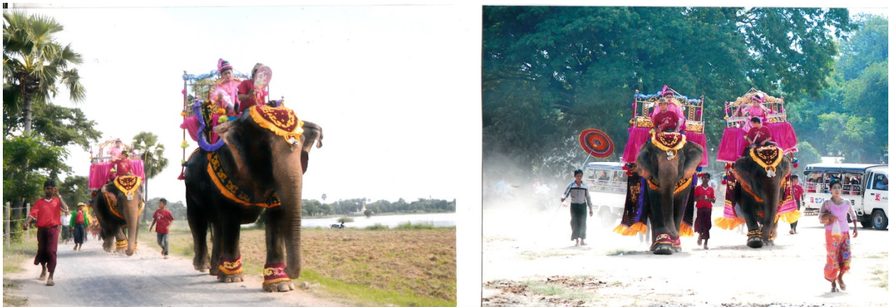
Figure 6- Shin-pyu-pwe procession with elephants

In Nataw 11 month the Sungyi-laun-pwe is to celebrate. It is a communal offering of provisions and various articles to monks on the second day after full-moon day. Before that day, the chair of the Lumuye Committee arranges the numbers of monks and serial numbers of households who will provide the offerings to the monks. Then the serial numbers offering for the monks, by all households are decided by drawing lots. On the ceremonial day, the monks invited by the Lumuye Committee draw lots for serial numbers of households that will provide the offerings for the monks. Then every monk gets an offering from the household according to the serial number they got. The members of Ahmyotha–Aphwe help the monks in receiving their offerings.