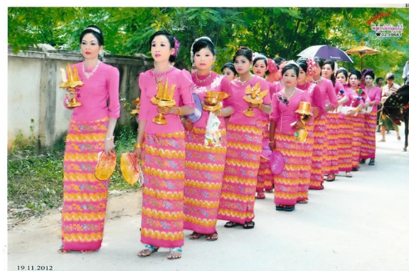
Figure 4 -The ladies holding some offerings and traditional stuff

Ahmyothame –Aphwe has been organized for a long time. The leader of Ahmyothame-Aphwe is called Ahpyo-Gaung . The Ahpyo-Gaung is also selected by the members of this organization. She is usually a married woman. There are 50 members in Ahmyothame-Aphwe and two Ahpyo-Gaungs in Simihtun village. Both are over 60 years old. For both, their duties were transmitted by senior Ahpyo-Gaungs . The criteria of Ahpyo-Gaungs are being able to manage, having the courage to speak and perform, being able to exert authority and to make sacrifices for the village. The girls who are 18 years old have to enter the Ahmyothame-Aphwe . After entering into the Ahmyothame-Aphwe , they have to participate in social activities of the village. But if they are students, they can stay away from the social activities. Usually, during holidays, they may participate in village activities.