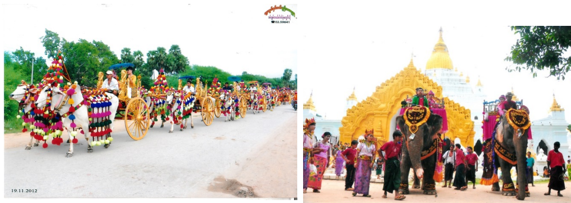
Figure 5- Shin-pyu-pwe procession with elephants and golden bullock cart

Most of the people uphold the Shin-pyu-pwe tradition magnificently. The main task of the Lumuye Committee is to arrange the Shin-pyu-pwe neatly and successfully. One month in advance, the donor has to conduct a meeting in his house with all of the villagers and ask for their help. Every villager, Lumuye Committee and the leaders of the social groups come and discuss that ceremony. In Shin-pyu-pwe , every household head gives labor by serving meals to the guests. The expense of the Shin-pyu-pwe is over ten thousand US dollars, the numbers of guests are over one thousand and all of the people from neighboring villages and the relatives of the donor come and enjoy the meals. The donor hires elephants and golden bullock carts for the procession to show his prestige and his friendship (see figure 5, 6 ).