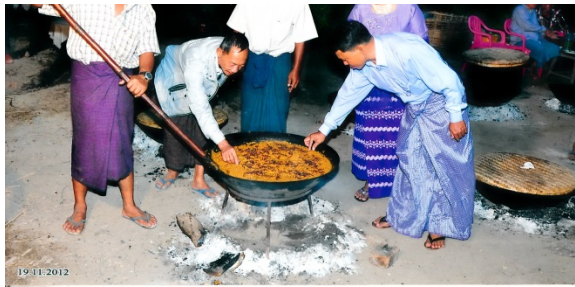
Figure 2 – Cooking meals and serving the guests at a religious ceremony

The linkages occur when individuals, families or groups become involved in the above groups. Those groups are under the management of a Lumuye Committee or the village social committee.