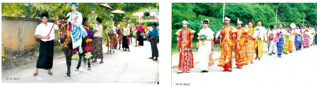
Figure 3 - Ahmyotha –Aphwe participating in village activities

The Ahmyotha -Aphwe has been organized for a long time. There are 35 members in this group. The leader of Ahmyotha-Aphwe is called Lupyo-Gaung . He is selected by the members of Ahmyotha-Aphwe and he must be a bachelor. At present, the village Lupyo-Gaung is 46 years old and he has two assistants. He has been Lupyo-Gaung since he was 30 years old. The members are 18 years old and above. When the boys are 18 years old they have to enter the Ahmyotha–Aphwe to participate in village activities. But if there are three adolescent boys in a family, only one can enter and help with village activities. The members make a ceremonial round of visits with the Shin-Loung , novice-to-be prominently ensconced in the procession, and they are responsible for taking care of the novice-to-be (see figure 3). They have to manage the offering ceremonies so there is not a weakness. They also take responsibility for the wedding reception by gathering the presents of guests for the new couple. If they are students they will participate in village activities during their holidays.