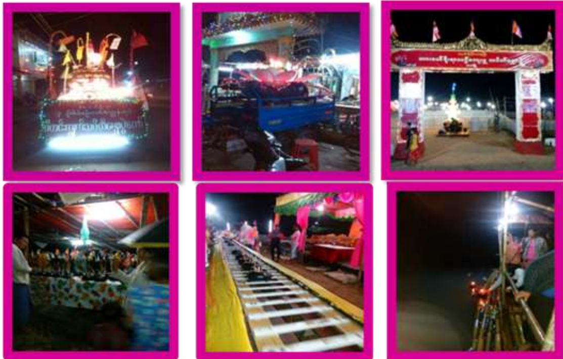
Figure (4) : Float Down Alms Bowls Festival ( Dawei Tha Beik Hmyaw Pwe )