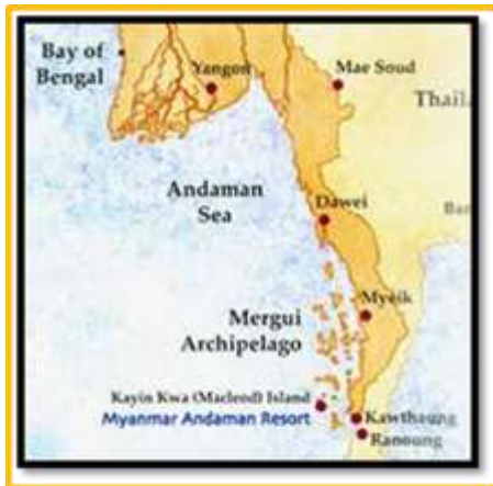
Figure (1) : Map of Tanintharyi Region