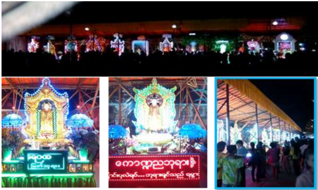
Figure (5) : The Procession of 28 Buddha images festival of Dawei