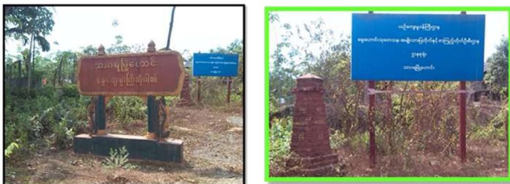
Figure (7) : Thagara is recognized as Ancient Site Zone and Protected and Preserved Zone