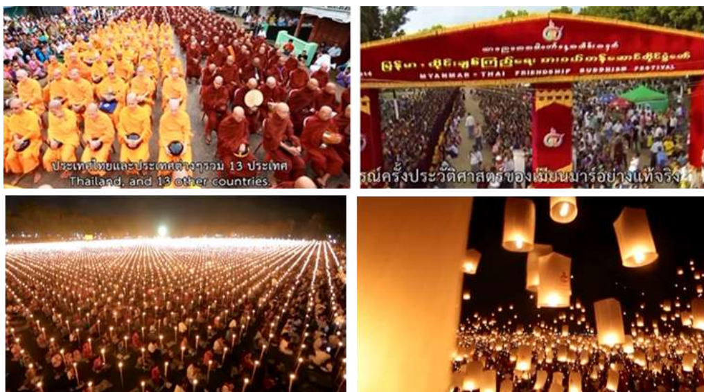
Figure (6) : Tazaung Dine Festival of Dawei in 2014