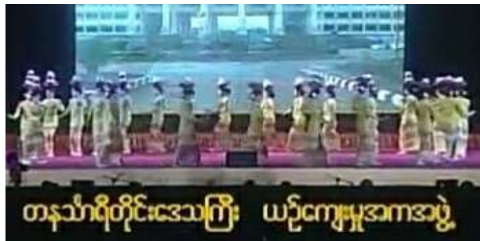
Figure (3) : The famous Dawei dance in which pots are put on the head