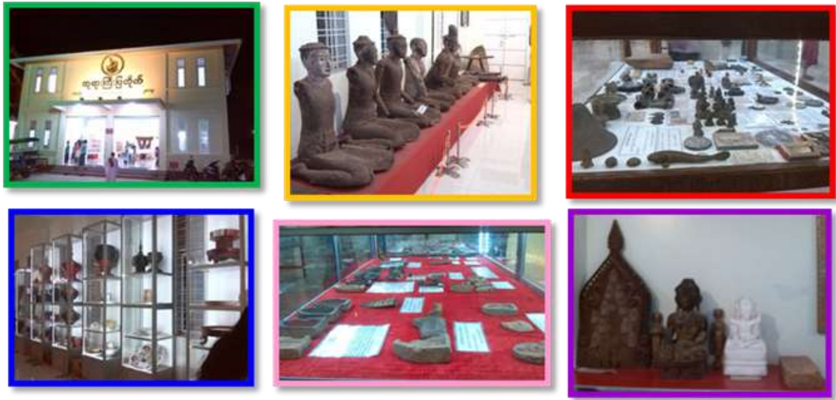
Figure (8): Pharagyi Museum at the compound yard of Lokamarazein Pagoda