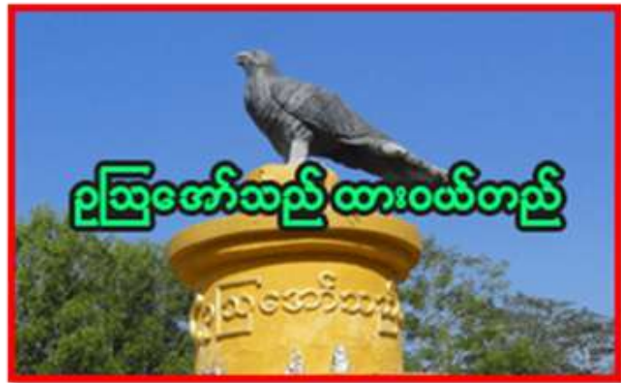
Figure (2) : Dawei was founded at the crow shouting