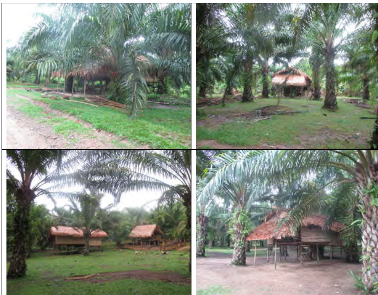
These photos were taken on May 18 th 2015 in Nge Yan Eaing village, Ma Saw village tract, Ler Mu Lah Township, Mergui-Tavoy District. These photos show the houses that the villagers constructed under palm oil trees planted by the Asian World Company in 2015. This land belonged to villagers and was confiscated in 1997. The Asian World Company has not paid any compensation to the villagers.