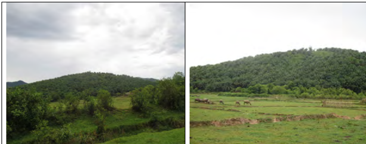
The above photos were taken on May 18 th 2015 in Thu Pyaw village, Ma Saw village tract, Ler Mu Lah Township, Mergui-Tavoy District. The photos show where Malaysian company, the Myanmar Stark Prestige Plantation (MSPP), has planted palm oil trees on the villagers' lands.

of villagers which have been confiscated. The villagers submitted the case [as a petition] to the [local] KNU leaders and requested the KNU bring the issue to the [KNU] congress [in Law Khee La]. [During the congress], they [KNU] leaders decided they would take the car keys from [MSPP Company employees] [if they did not stop working on the villagers' lands], but they are still working [on the villagers' lands]. 8