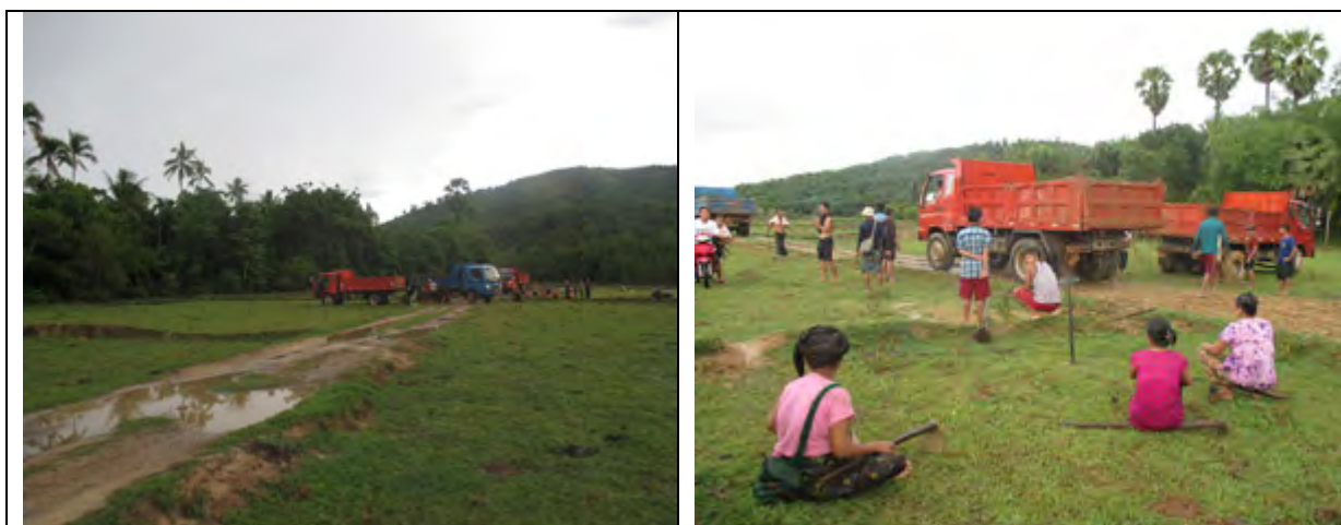
The above photos were taken on May 18 th 2015 in Thu Pyaw village, Ma Saw village tract, Ler Mu Lah Township, Mergui-Tavoy District. These photos show the villagers participating in road construction, led by the Asian World Company.

The wealthy business people [Myeik Public Corporation] are planning a [biofuels] project in the low part of Thin Baw Oo area [village tract], Ta Naw Th'Ree Township. It will cover [an area from] Toh Tee Hta to K'Wer Hta River. The project will operate on both sides of that river. They