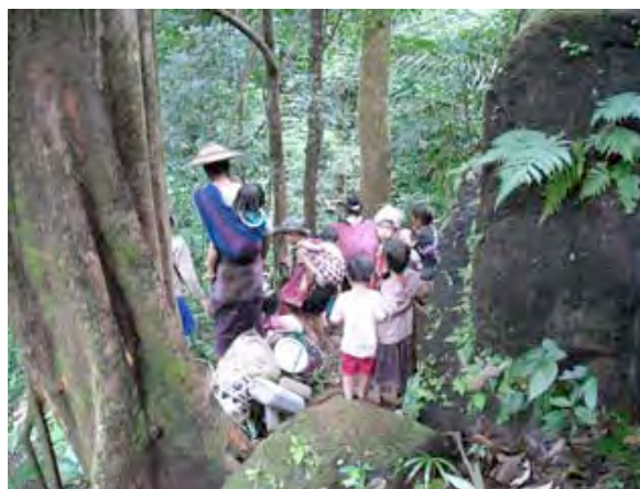
These photos, taken during October 2009, show villagers from Nyaunglebin District as they flee following SPDC activity near their village.

It is not clear if the SPDC Army presence in Kheh Der village tract is permanent. Though SPDC Army activity in Nyaunglebin District was intense from early 2006 until the end of 2008, troops withdrew from some frontline positions in December 2008. Troops continued patrols and harassment of villagers in hiding during 2009, but more established positions were confined to lowland areas and locations near permanent roads. Kheh Der village tract is well south of a major east-west road crossing central Nyaunglebin, which links Pegu Division to Kyauk Kyi Town and on into Papun District. Notably, LIB #367 is controlled by Military Operations Command (MOC) 3 #10. KHRG has most recently documented activities by battalions from MOC #10 to the north in Toungoo District, 4 to where it was deployed in November 2007. 5 KHRG has also documented battalions from MOC #10 committing abuses in Nyaunglebin 6 and Papun 7 districts.