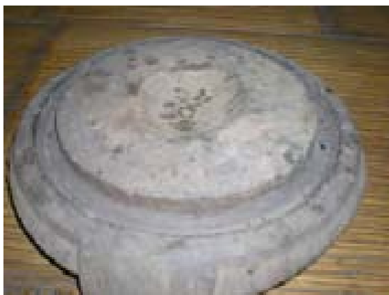
This photo, taken on June 4 th 2008 in Zu--- village, Lu Thaw Township, shows a stone on which villagers pound herbs to make traditional medicine. Many communities in hiding treat illnesses and injuries with locally-available medicines due to SPDC restrictions on humanitarian access to Lu Thaw.

Finally, limited medical services are provided by a handful of clinics and mobile medical teams from local organisations operating in the area as well as with administrative support in Thailand, including the BPHWT and the Karen Department of Health and Welfare (KDHW). Clinics and mobile medical teams serve approximately three quarters (21,026 people) of the population in Lu Thaw. However, health workers that spoke to KHRG noted significant obstacles related to security and ease of movement, which restricted health providers and patients' access to one another, as well as limited resources, that continue to restrict their ability to access target populations. While these programmes face significant obstacles and cannot be overstated as a viable substitute for adequate and widely accessible health care, villagers have nonetheless described them as providing crucial support that enables them to survive in non-state spaces for sustained periods of time in spite of attacks by the SPDC Army. 105