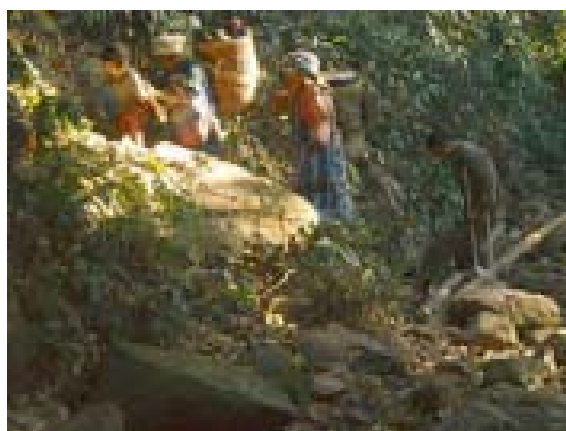
This photo, taken on February 8 th 2010, shows a villager with an amputated leg, presumably due to a landmine injury, attempting to flee up a mountain following attacks in Kyaukkyi Township, Nyaunglebin District. Poor health and physical injuries make flight through rugged terrain more difficult.

“When I moved to Ze---, I had to sell all my buffalos to buy food and medicine for my family. Now I have no buffalos left. I used to have seven, but now they’re gone.”