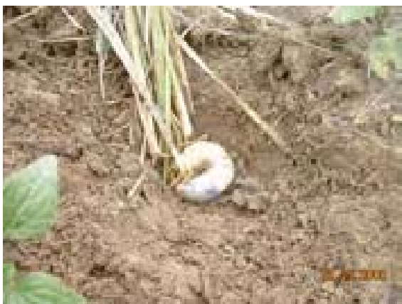
This photo, taken on September 13 th 2008, shows a white grub the size of a child’s thumb in a hill field in Ler Muh Bplaw village tract. Villagers have reported that damage from insects has severely undermined the productivity of their crops, particularly in places where SPDC Army activity has prevented them from accessing their fields.

- Saw Fi--- (male, 34), Ca--- village, Lu Thaw Township (April 2009)