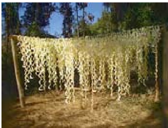
This photo, taken on December 4 th 2006, shows cucumber peels that have been hung to dry in the sun, in No--- village, Lu Thaw Township. Villagers told a KHRG researcher they planned to ferment the peels and apply the solution to their paddy plants to prevent insects from destroying their crop.

These highly-constrained farming operations are further endangered by regular SPDC offensive operations targeting both displaced villagers and food resources in non-state spaces. SPDC patrols authorised to shoot villagers on sight and burn crops under cultivation constitute a serious physical security threat that necessarily limits the amount of time villagers can spend tending fields and plantations, thus increasing the chances that wild animals and weeds will damage unattended crops. This is especially damaging when SPDC operations coincide with key points in the agricultural cycle: for example, SPDC units in northern Lu Thaw Township frequently step up offensive activities after the rainy season in September and October, the months when paddy and hill fields must be harvested. Sustained SPDC operations or the deployment of landmines in non-state spaces may trigger re-displacement, forcing villagers once again to begin agricultural activities from scratch.