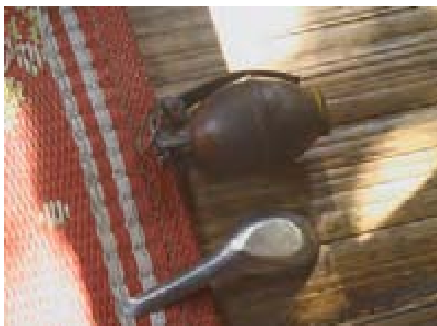
This photo, taken on December 21 st 2009, shows a hand grenade belonging to a displaced villager in Toungoo District. The villager told a KHRG researcher that he carried this grenade for protection while working his hill field, in case of an SPDC attack.

landmines as essential to protecting against SPDC attacks and creating the minimum security required for villagers to carry out livelihoods activities; however, the increased use of inherently indiscriminate weapons, ipso facto threatens the physical security and livelihoods of civilian members of displaced communities, regardless of precautions taken to inform civilians of the location of mines or policies dictating that mines only be deployed defensively.