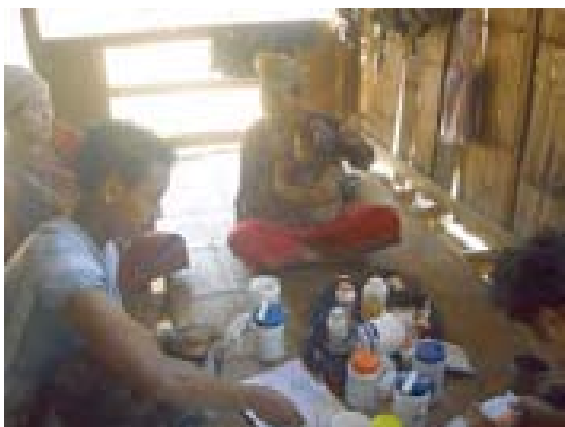
This photo, taken on March 4 th 2009, shows a villager from the Co--- hiding site receiving medicine during a visit by a mobile health unit from a local health organisation.