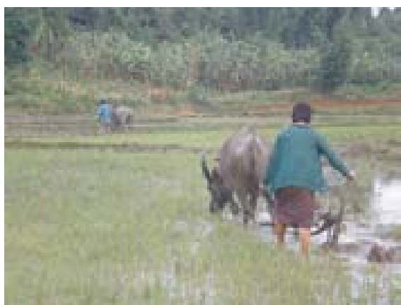
This photo, taken on June 2 nd 2008, shows a woman ploughing a flat rice field in Go---village, Lu Thaw Township. Due to widespread food insecurity, all family members of households in Lu Thaw often must contribute to daily livelihoods activities.

- Saw Bo--- (male, 33), Xa--- village, Lu Thaw Township (December 2009)