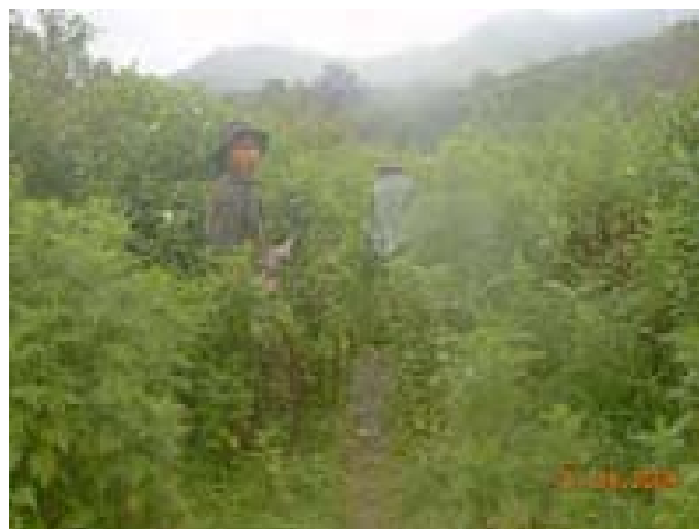
This photo, taken on August 7 th 2008, shows members of a gher der home guard group providing security along the overgrown Pwa Ghaw to Kler La road as villagers from Bo--- village in Kay Bpoo village tract cross the road in an attempt to procure food.

Interviews conducted by KHRG with gher der members as well as regular villagers indicate that gher der units are organised at the village tract level and consist of civilian community members 127 that perform a number of tasks to promote security at the village level, especially in villages threatened by their proximity to SPDC forces. These individuals monitor and share radio communications with nearby villages and the KNLA to keep informed about SPDC movements;