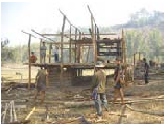
This photo, taken on March 1 st 2009, shows villagers from the Do--- village returning from their hiding site to finish disassembling their huts. Building materials are often removed for use in hiding sites, and to prevent destruction by SPDC patrols, by villagers who become strategically displaced.

- Naw Ci--- (female, 46), Xa--- village, Lu Thaw Township (December 2009)