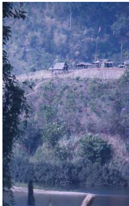
This photo, taken April 25 th 2010, shows a DKBA army camp located on the Burma side of the Moei River, north of Mae Ta Ree village in Tha Song Yang District.

Despite, or perhaps due to, the failure of these visits to yield any information, on April 21 st 2010 Bpweh Kih ordered Officer Moe Aung and soldiers from Battalion #7 to again go to the Thai side of the river and burn down the huts of three Hsoe Hta villagers whom the commander