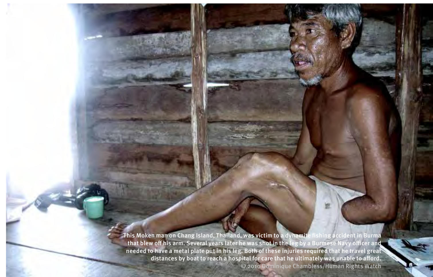
This Moken man on Chang Island, Thailand, was victim to a dynamite fishing accident in Burma that blew off his arm. Several years later he was shot in the leg by a Burmese Navy officer and needed to have a metal plate put in his leg. Both of these injuries required that he travel great distances by boat to reach a hospital for care that he ultimately was unable to afford.

I was fishing on a boat with other Moken; there were three of us on the boat. At that time I was