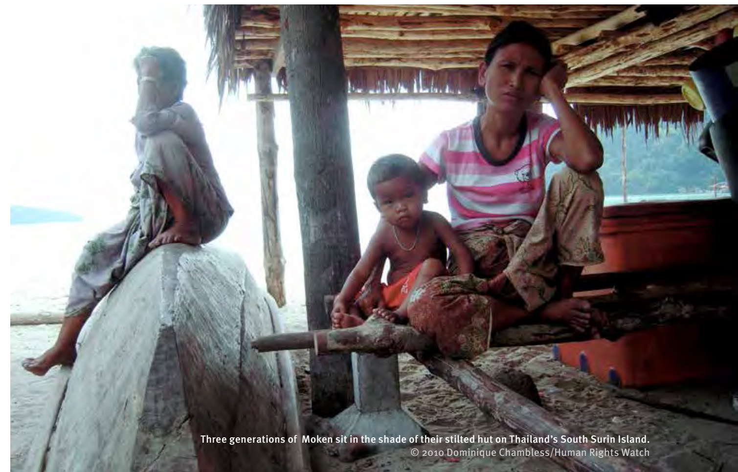
Three generations of Moken sit in the shade of their stilted hut on Thailand's South Surin Island.

Perhaps because other tribes have given up their nomadic lifestyle while the Moken remain relatively mobile, the Moken have the most difficulty among Thailand's three “Sea Gypsy” tribes in obtaining citizenship or Thai government ID cards providing them access to government welfare, labor, and education services. 19