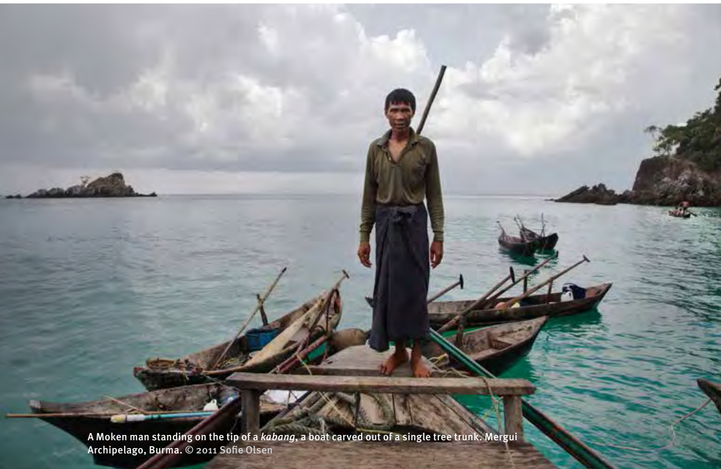
A Moken man standing on the tip of a kabang , a boat carved out of a single tree trunk. Mergui Archipelago, Burma.

Moken say they no longer travel the length of the archipelago. Tok, a Moken man, said: