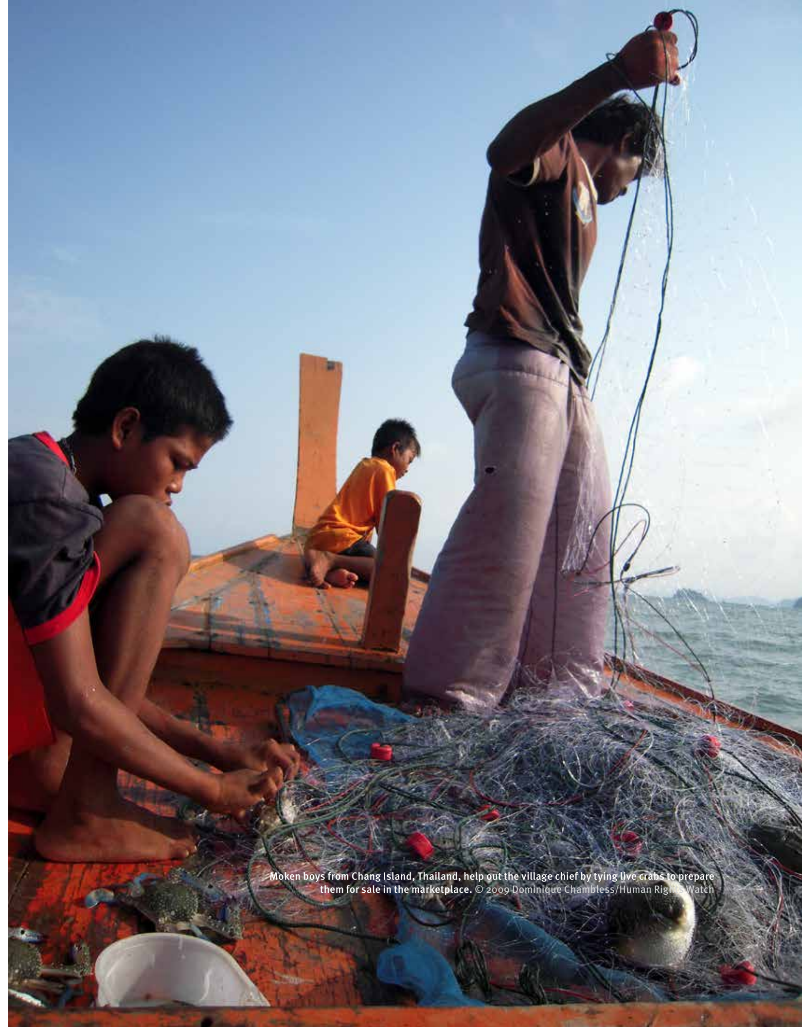
Moken boys from Chang Island, Thailand, help out the village chief by tying live crabs to prepare them for sale in the marketplace.

The Moken face deepening poverty, marginalization, and discrimination. Most are stateless, making them more vulnerable to human rights abuses and depriving them of access to other rights, including the medical care, education, and employment opportunities that Thai and Burmese nationals enjoy. Tightening immigration and maritime conservation laws restrict the Moken's freedom of movement, threatening their traditional lifestyle. In addition to government distrust and discrimination, the Moken often face exploitation from land-based communities, but are unable to seek redress through national laws and policies. In recent years, more Moken have decided to reside permanently in Thailand and Burma. Both governments should act to protect and promote the Moken's basic rights, including taking steps to provide them with citizenship. 5