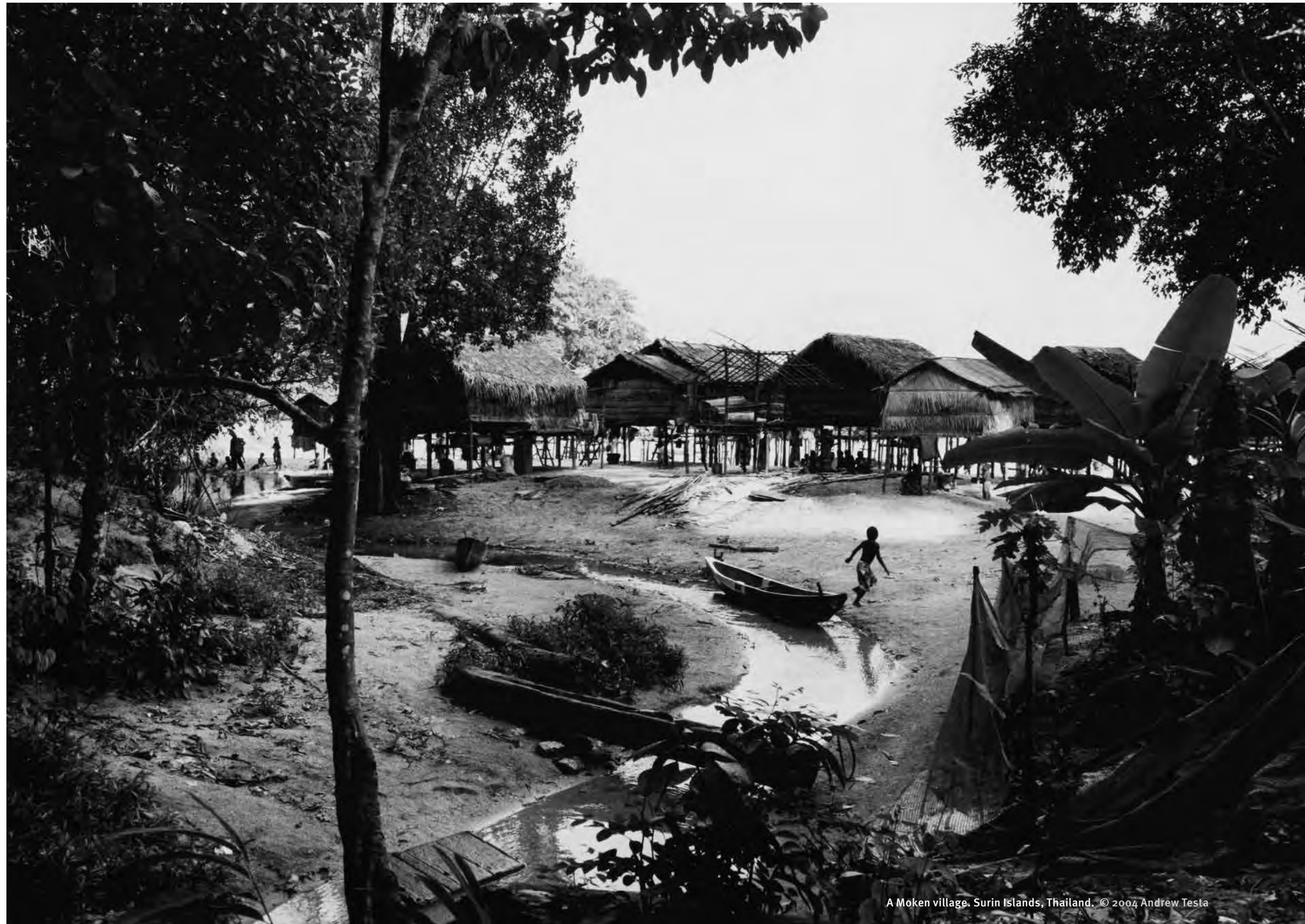
A Moken village, Surin Islands, Thailand.

I used to be a diver. When I was a teenager, there was no limit for Moken fishermen. We could go anywhere from Phuket to Surin Islands, and beyond to catch fish, shrimps, lobsters, and shellfish. We brought our catch ashore to the middlemen, who would sell them in downtown markets or to beachside restaurants. I only