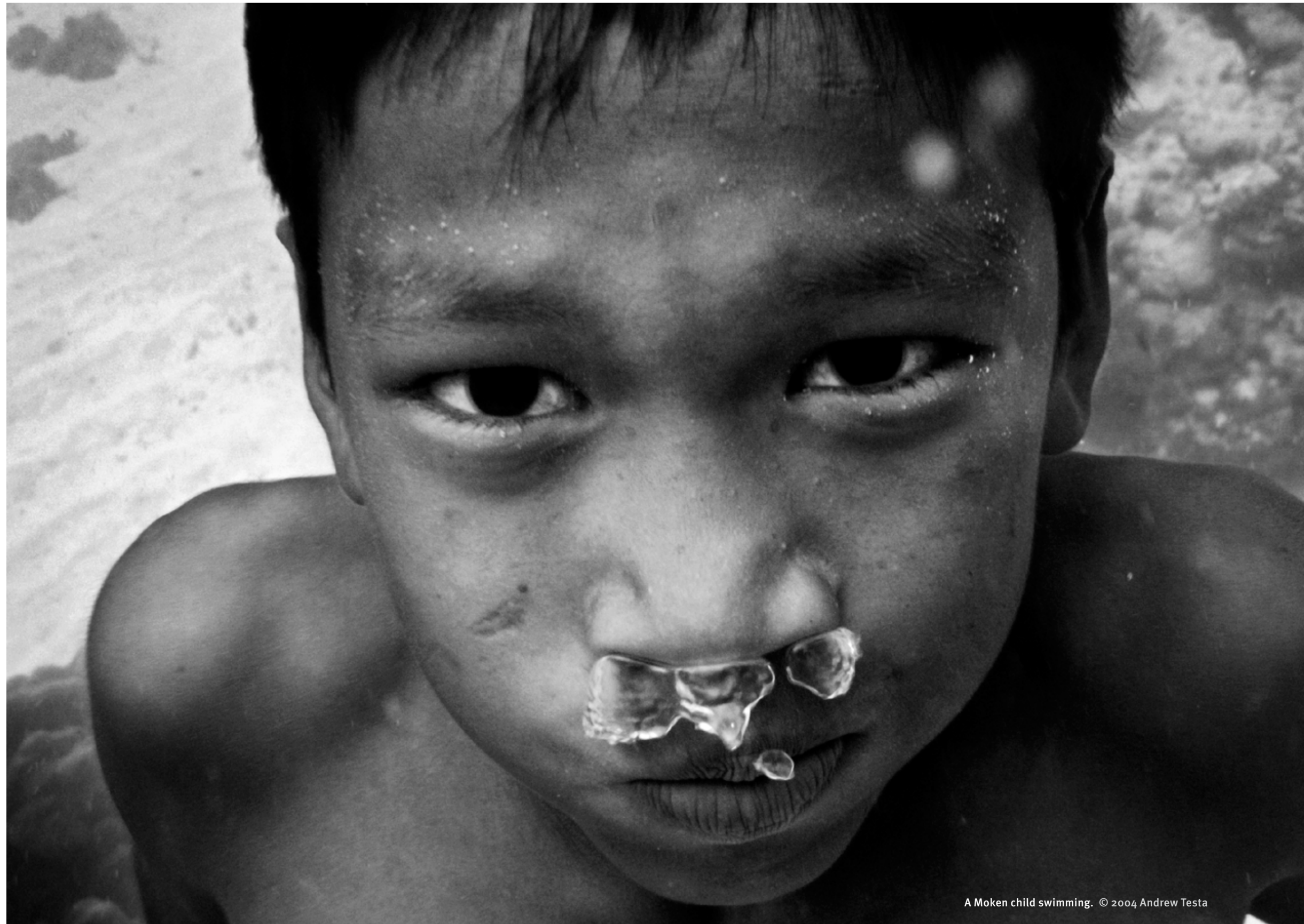
A Moken child swimming.

There is currently one informal, Moken-only school, where children study Moken culture. Although the United Nations Educational, Scientific and Cultural Organization (UNESCO) designed the curriculum, Thailand's Ministry of Education has yet to formally recognize the school, therefore denying children who attend formal certificates verifying completion of primary school and leaving them ineligible to continue on to secondary school. 34