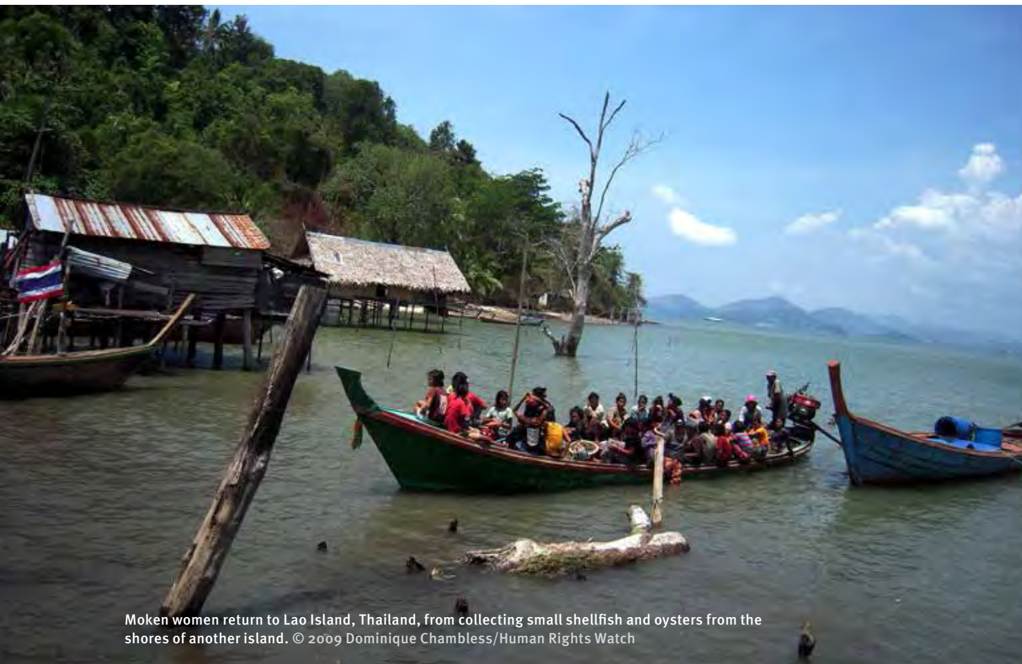
Moken women return to Lao Island, Thailand, from collecting small shellfish and oysters from the shores of another island.

Approximately 3,000 Moken live around and on the 800 islands of the Mergui Archipelago along Burma's southern coast, while an estimated 800 Moken are currently settled in Thailand.