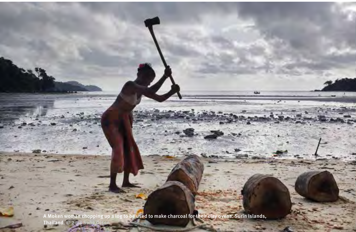
A Moken woman chopping up a log to be used to make charcoal for their clay ovens. Surin Islands, Thailand.

received a small amount of money from those middlemen. Life was not comfortable, but we had freedom to go wherever we wanted to go.