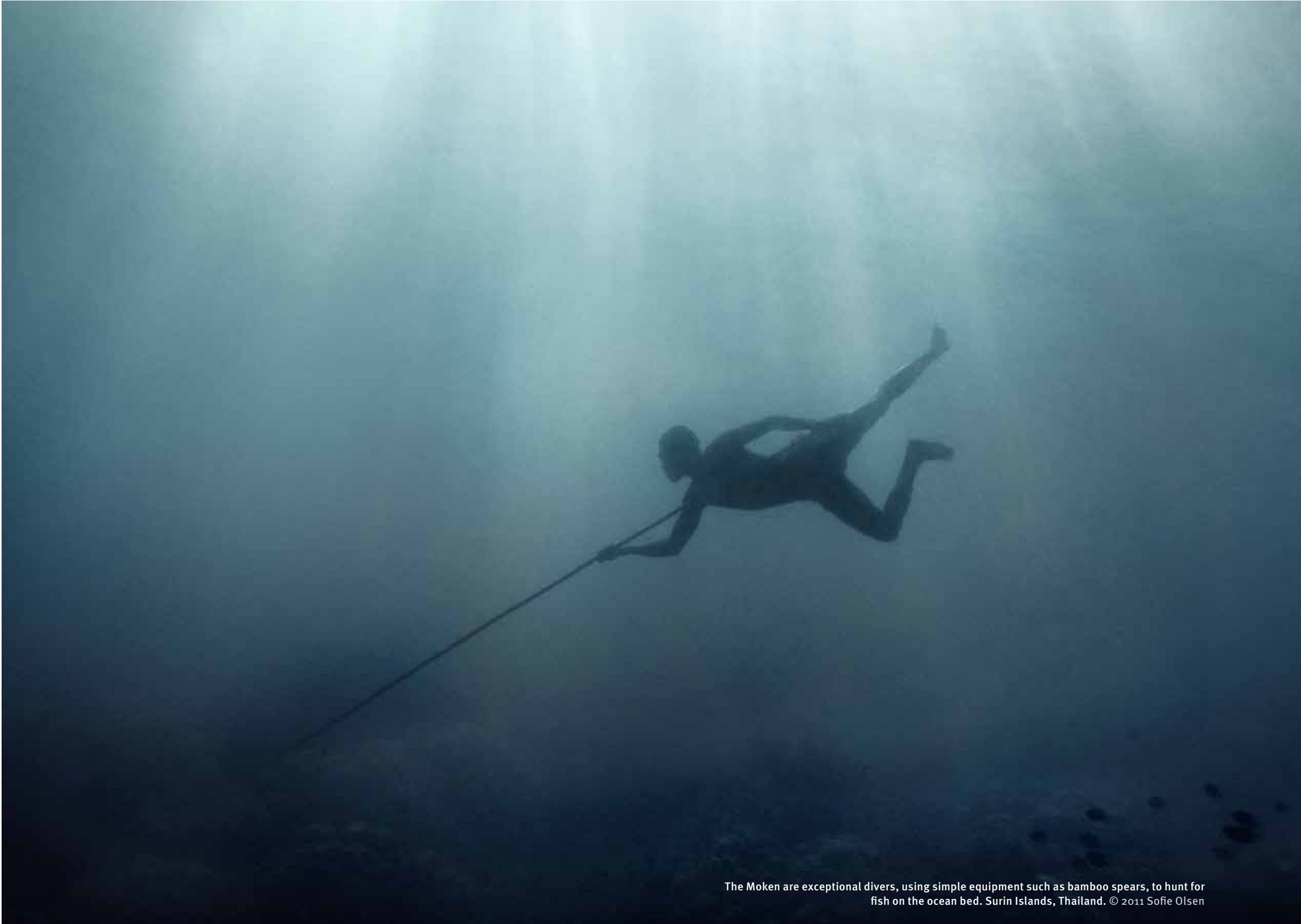
The Moken are exceptional divers, using simple equipment such as bamboo spears, to hunt for fish on the ocean bed. Surin Islands, Thailand.

Moken told Human Rights Watch that they dislike this type of work, but many feel they lack alternative labor opportunities to support themselves and their families.