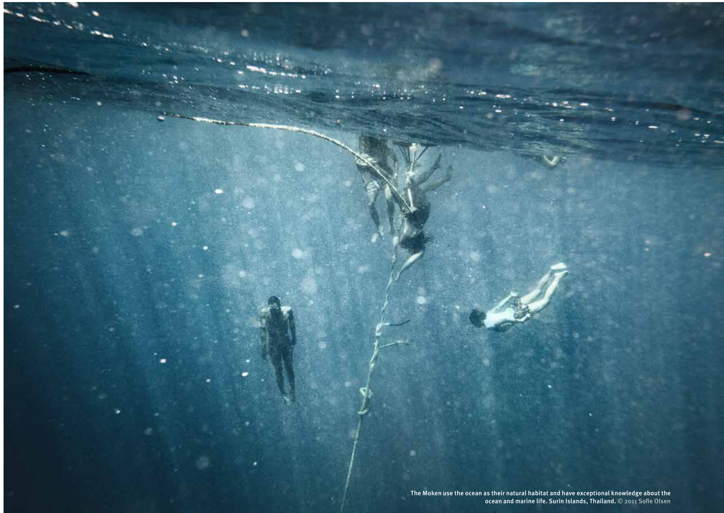
The Moken use the ocean as their natural habitat and have exceptional knowledge about the ocean and marine life. Surin Islands, Thailand.

One of the few remaining hunter-gatherer populations in Southeast Asia, the Moken have made the sea their home. Foraging food from oceans and forests, trading fish and shells for other necessities, and traveling by boat across the waters of southern Burma and Thailand, the Moken have maintained a self-sufficient, nomadic way of life along the Andaman coast for hundreds of years. 1