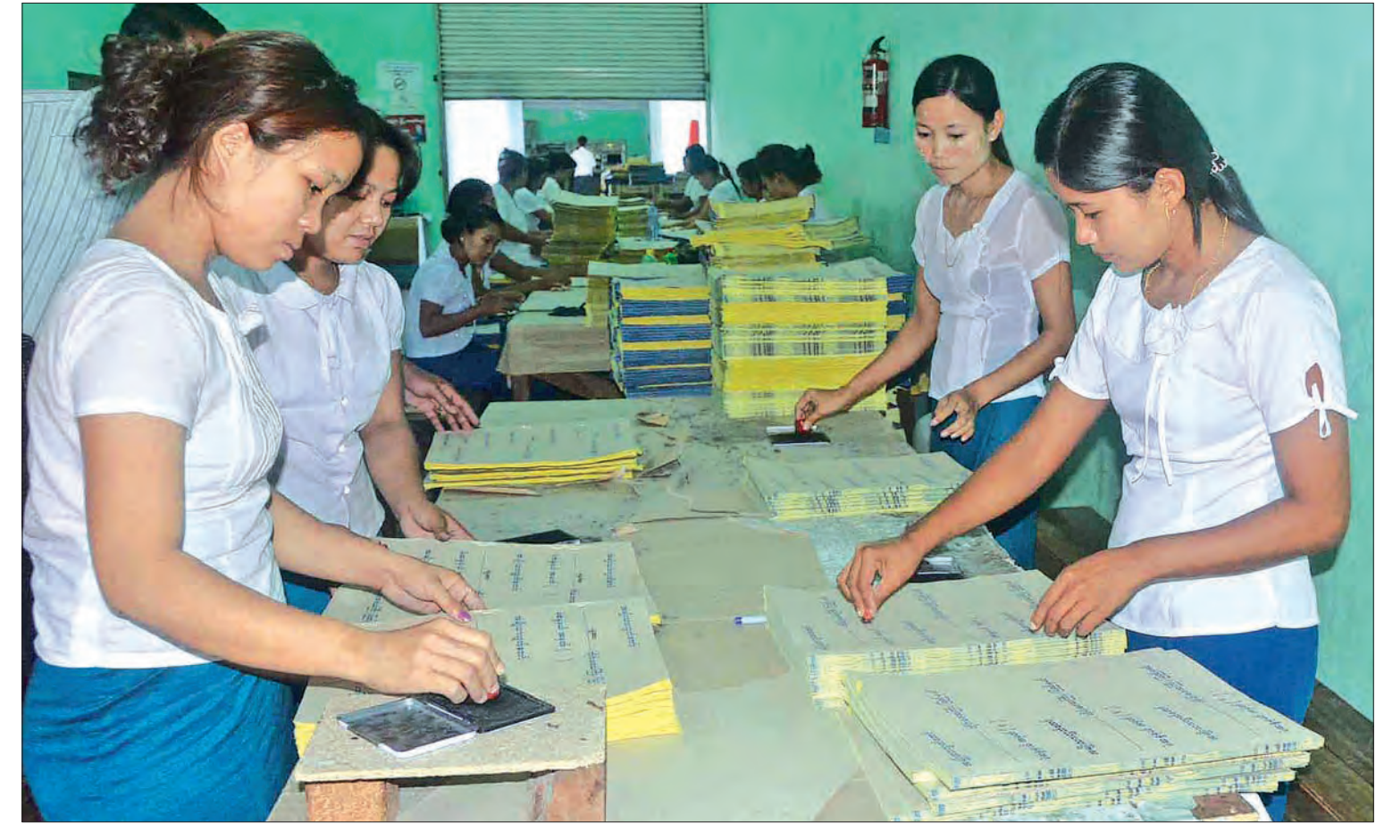
Government completed printing ballots for the November-8 election by 21 October.

Meanwhile, the UEC announced Tuesday that it would allow civil service personnel, who will be working on the day of the election, to cast advanced votes as of this Thursday if they apply to do