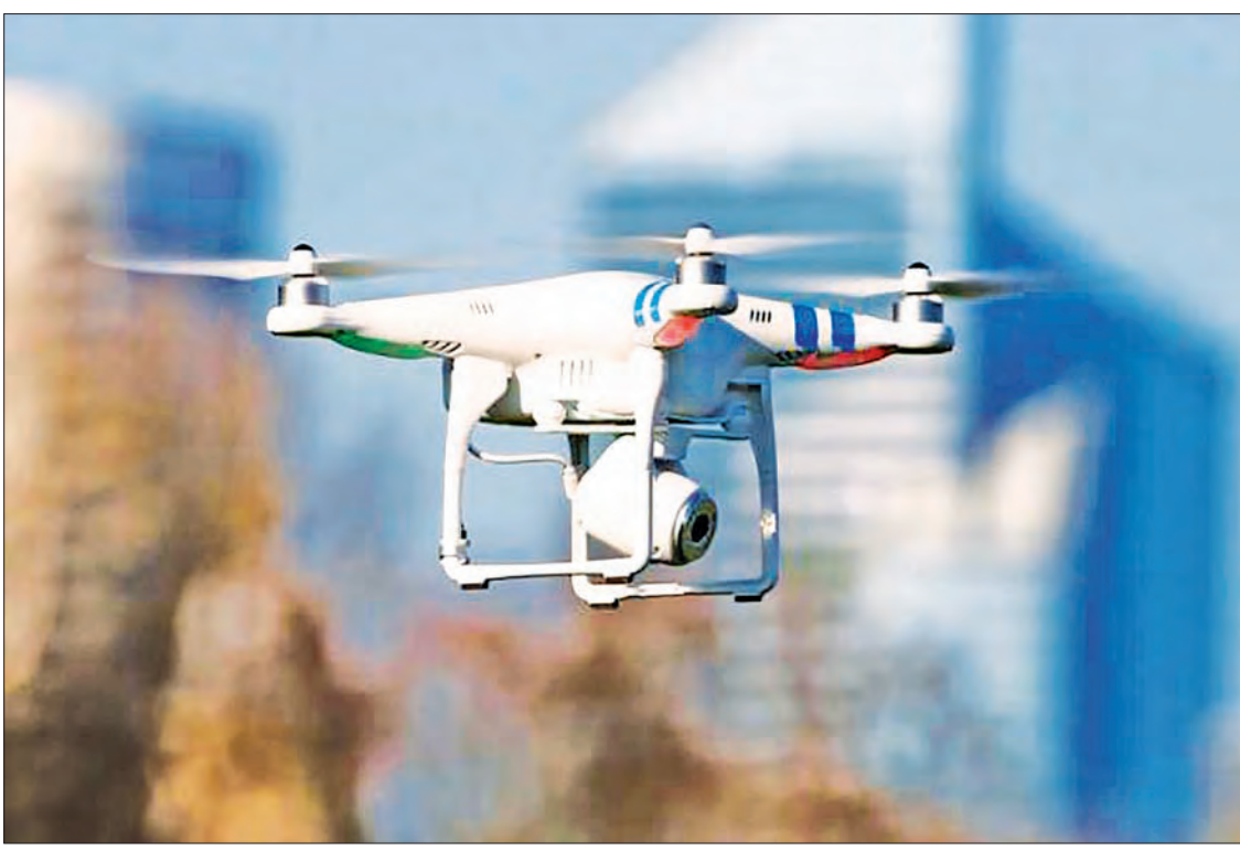
A 'Phantom 2' drone by DJI company flies during the 4th Intergalactic Meeting of Phantom's Pilots (MIPP) in an open secure area in the Bois de Boulogne, Paris on 16 March 2014.