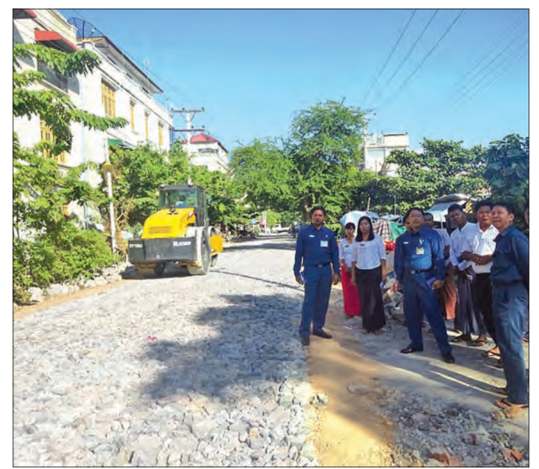
Officials of MCDC inspect progress in construction of road in Chanayethazan Township. Photo: Thiha Ko Ko

The drains on the roadsides are also being cleared. -Thiha Ko Ko-Mandalay