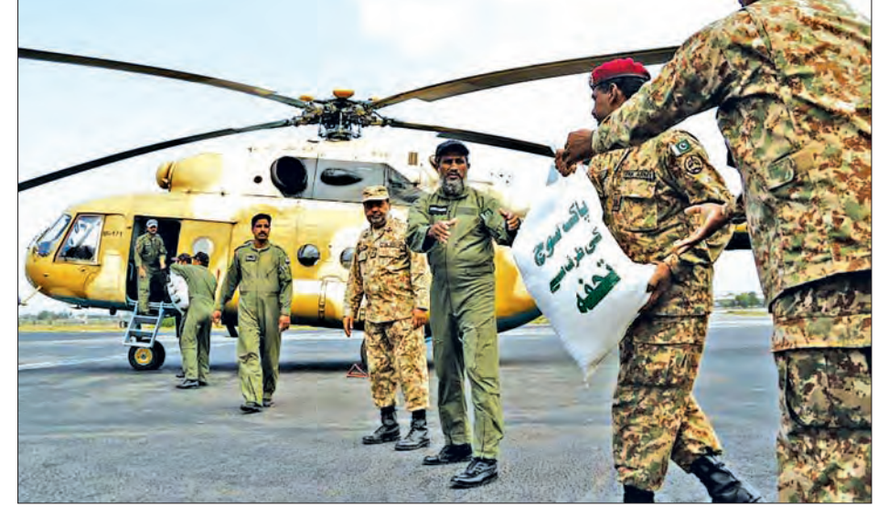
Army soldiers load sacks of food aid on a helicopter, to distribute in earthquake stricken areas in Peshawar, Pakistan on 27 October 2015.

The earthquake struck almost exactly six months after Nepal suffered its worst quake on record on 25 April.