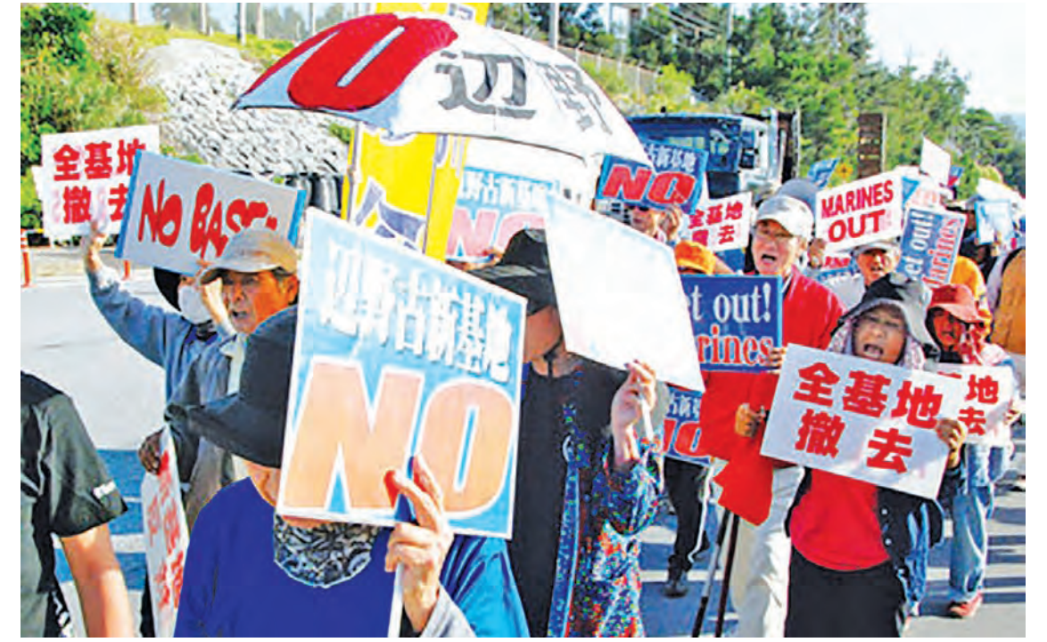
People stage a protest outside the US Marine Corps' Camp Schwab in Nago in Japan's southernmost island prefecture of Okinawa, on 27 October 2015.

On Tuesday, the land, infrastructure, transport and tourism minister told a press conference that he will suspend the governor's decision because not doing so would make it "impossible to continue the relocation project" and continue to pose "risks" to