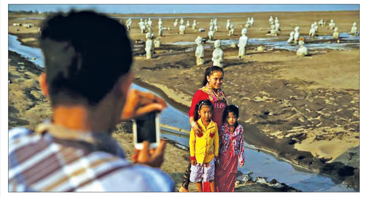
A man takes a picture of his family near stone sculptures of half-buried people at the Lapindo mud field in Sidoarjo.

The government had agreed to foot part of the compensation costs and, to date, around 90 percent of the victims had received payments, said Wahyu Sutopo, an official at the Sidoarjo Mudflow Mitigation Agency.-Reuters