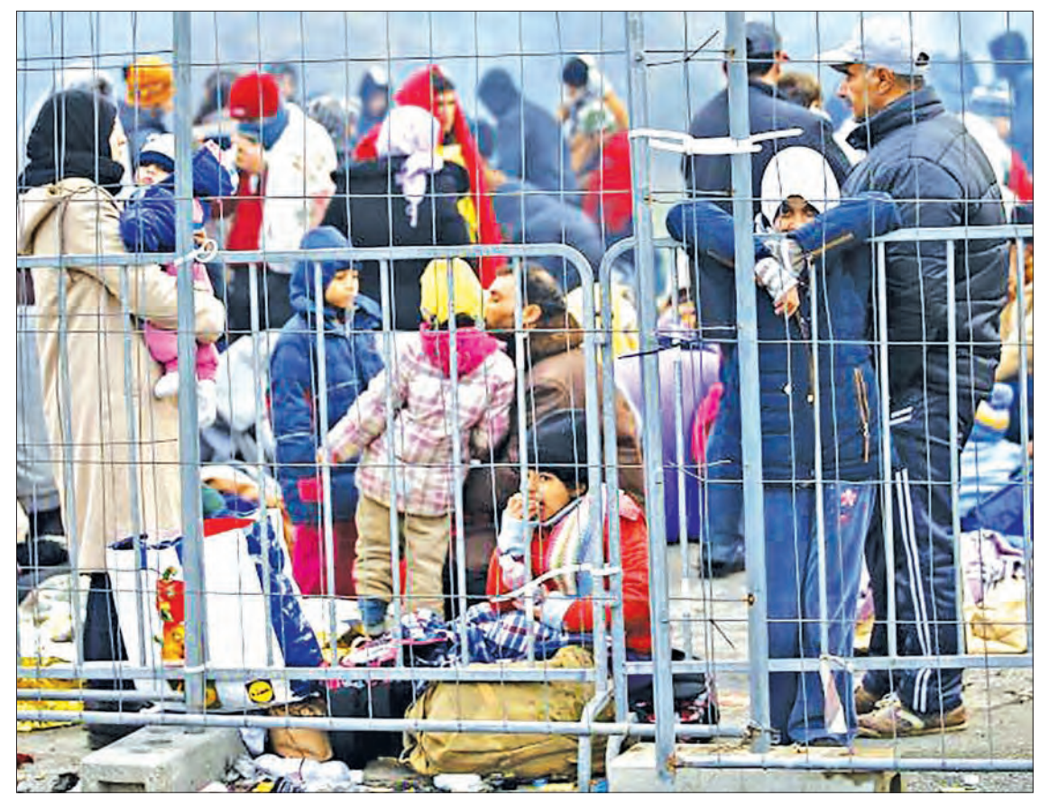
A group of migrants wait to enter a makeshift camp at the Austrian Slovenian border near the village of Sentilj, Slovenia on 26 October 2015.

BRUSSELS — The European Union plans to persuade refugees to wait in Greece for paid flights to other countries offering asylum rather than risk dangerous winter treks through the Balkans, EU officials said on Monday.