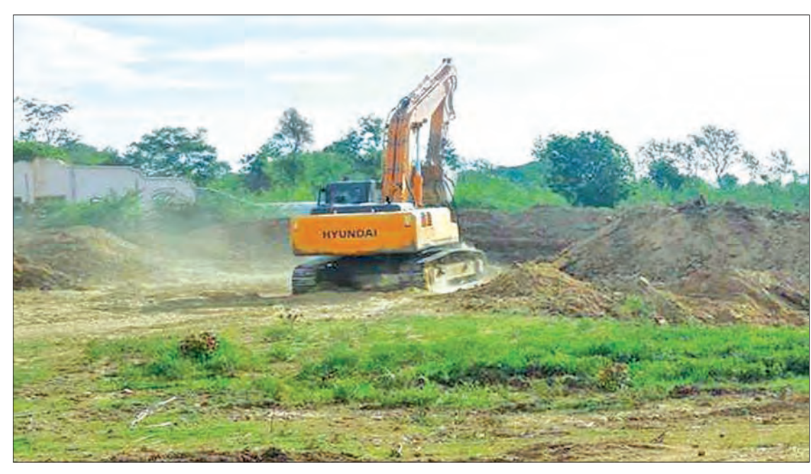
A worksite seen with heavy machinery to dredge earthen lake.

THAYETPIN Dam in Ywapalaegyi village and Phonegyi Lake in Yinmabin village are being built in Thazi Township, Mandalay Region, for local water sufficiency.