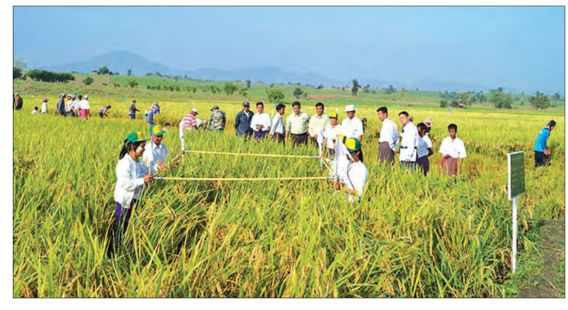
Volunteers participate in measuring the plot before harvesting Palethwe paddy on model plot in Myawady Township.