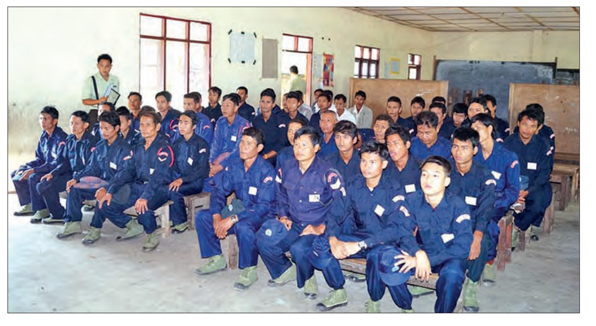
Auxiliary fire fignters attending refresher course in Myawady Township.