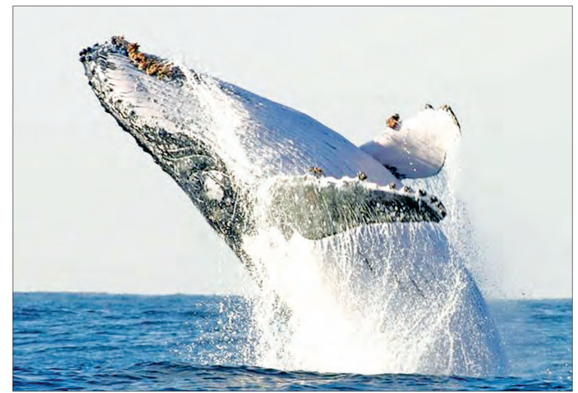
A humpback whale breaches off South Africa's Kwa-Zulu Natal South Coast.

By traveling long distances, these large mammals transported and recycled nutrients like phosphorous and nitrogen to far-flung