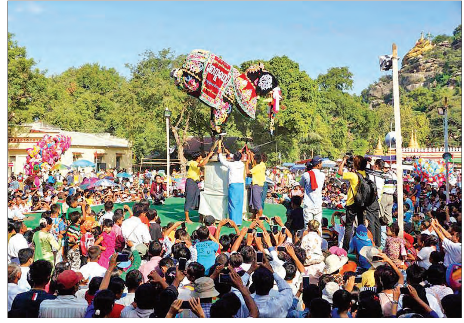
Local people enjoy opening ceremony of traditional elephant dance festival in Kyaukse. PHOTO: TUN TUN NAING

The festival, held in Mandalay Region, attracts spectators from across the country.-Tun Tun Naing- Kyaukse