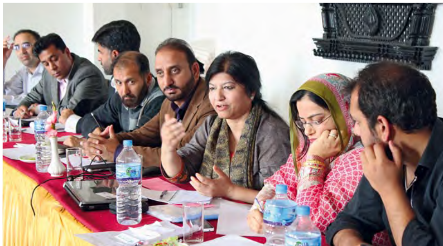
Conciliation Resources' partners from both India and Pakistan administered Kashmir meet to share analysis, lessons and insights from their work.