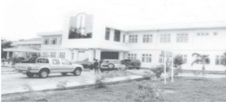
New 200-bed general hospital in Myeik, Taninthayi Division.