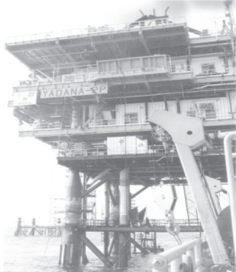
The rig at block No-1 of Yadana gas field seen offshore Taninthayi coast.

Oil palm plantations are established in Kawthoung Township, Taninthayi Division for ensuring local edible oil sufficiency.