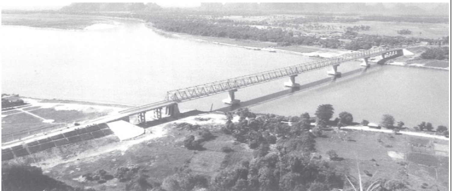
Thanlwin Bridge (Hpa-an) linking Myainggalay and Hpa-an in Kayin State was commissioned into service on 3 August, 1997.