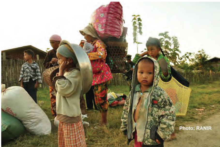
“Families fleeing ongoing fighting in Kachin State, 2013

For these reasons, most of the rapes documented by WLB member organizations over the past three years may be qualified as war crimes.