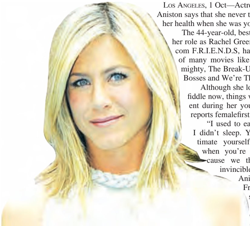
The actress is best known for her role as Rachel Green in the sitcom F.R.I.E.N.D.S.

LOS ANGELES, 1 Oct—Actress Jennifer Aniston says that she never took care of her health when she was young.