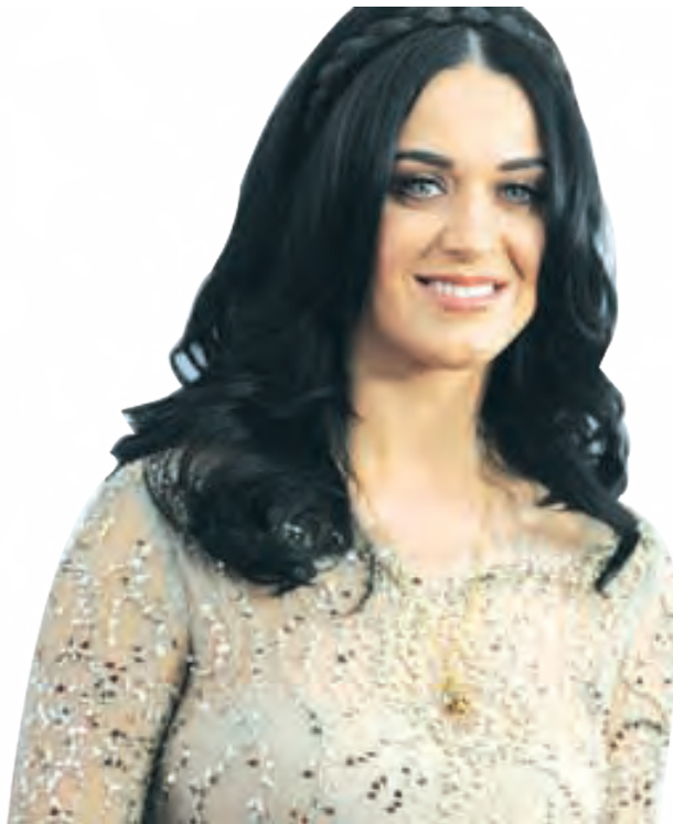
The singer is ready with the release of her track Grace of God, which she wrote during the tough time of her marriage.

LOS ANGELES, 1 Oct—Singer Katy Perry says she experienced suicidal tendencies during her marriage crisis with now ex-husband Russell Brand.