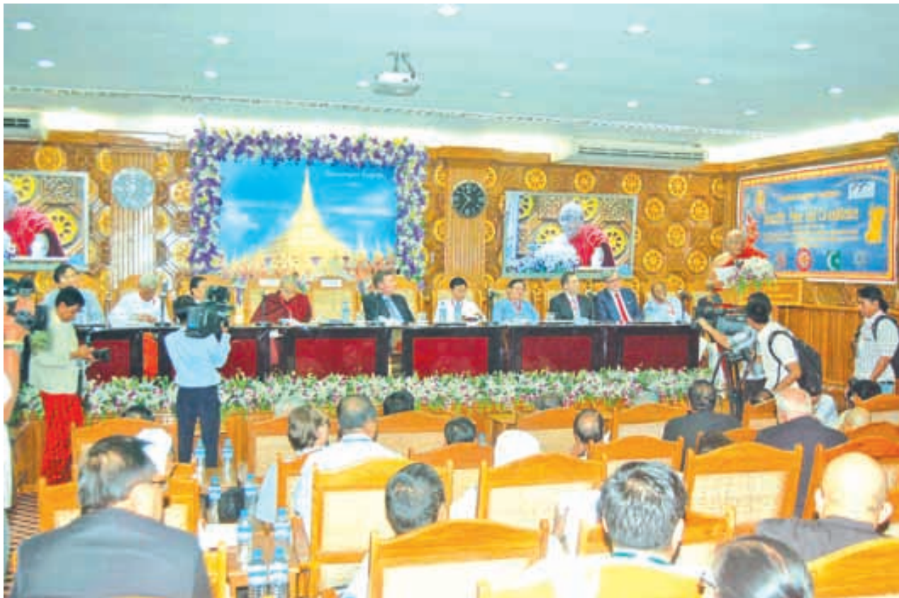
The Academic Conference on Security, Peace and Co-existence in progress.

YANGON, 1 Oct—The Academic Conference on Security, Peace and Co-existence jointly organized by Institute for Global Engagement (IGE) and Sitagu World Buddhist Academy (Yangon) took place at Sitagu International Buddhist Academy, here, this morning.