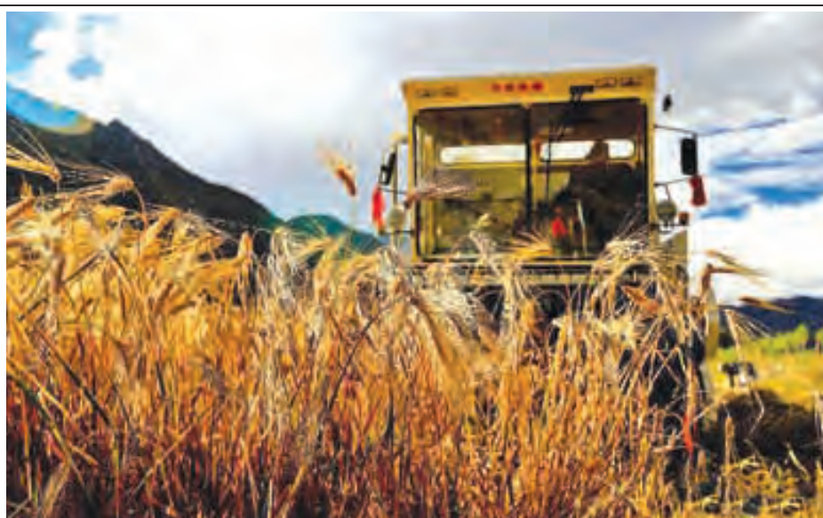
A harvester reaps highland barley in Doilungdeqen County of Lhasa, capital of southwest China's Tibet Autonomous Region, on 30 Sept, 2013. Tibet is expected to witness a bumper harvest this year.

Myanma Oil and Gas Enterprise Ph: +95 67 - 411097/411206