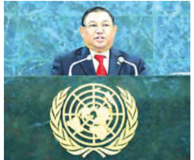
Union Minister for Foreign Affairs U Wunna Maung Lwin addressing the General Debate at the 68 th United Nations General Assembly in New York.

The first component of the reform was on political transformation. The objective was to bring about peace and stability, national unity and reconciliation. Now, we have been able to establish a firm foundation for building democratic society. Political space has been created for