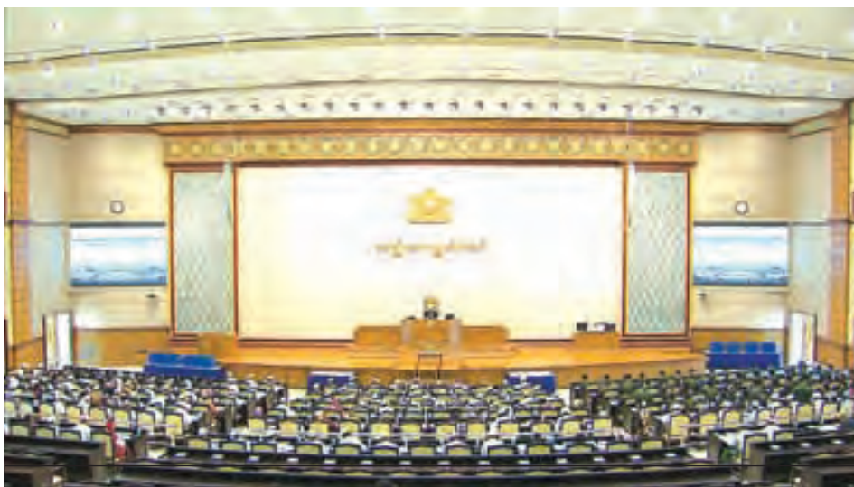
Representatives at Amyotha Hluttaw first-day session.