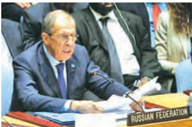
Russian Foreign Minister Sergei Lavrov speaks to the United Nations Security Council after it unanimously voted in favour of a resolution eradicating Syria's chemical arsenal during a Security Council meeting at the 68th United Nations General Assembly in New York on 27 Sept, 2013.

MOSCOW, 1 Oct — Russia wants to revive plans for a conference on ridding the Middle East of weapons of mass destruction now that Syria has pledged to abandon its chemical arms, Foreign Minister Sergei Lavrov said in comments