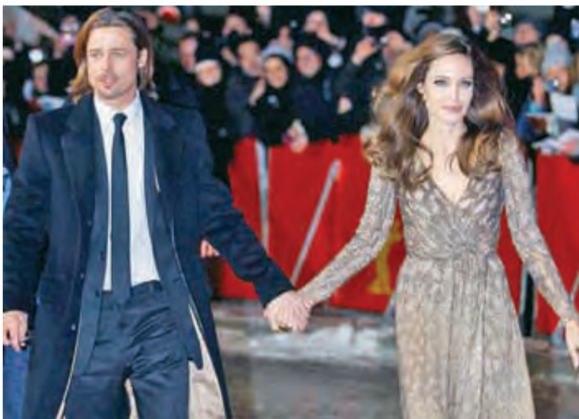
Brad Pitt buys Angelina Jolie USD 300,000 diamond necklace.

LONDON, 1 Oct—Brad and Angelina reunited after spending several weeks apart