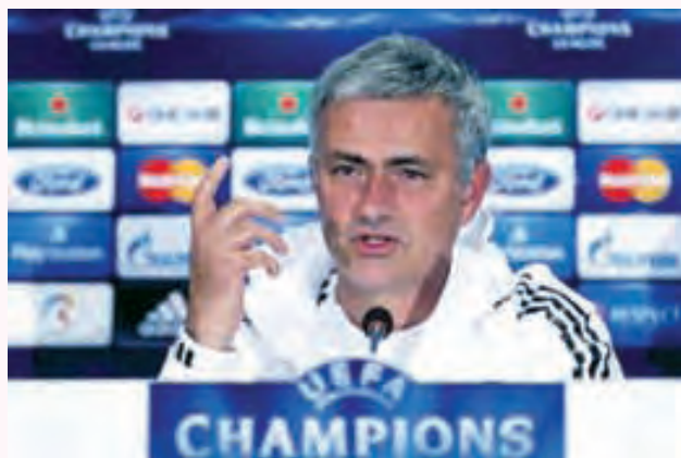
Chelsea's manager Jose Mourinho speaks during a news conference in Bucharest on 30 Sept, 2013.

The Chelsea coach said he was not impressed with the way the Belgian played last week against Swindon Town in the Capital One (League) Cup, nor with his recent perfor-