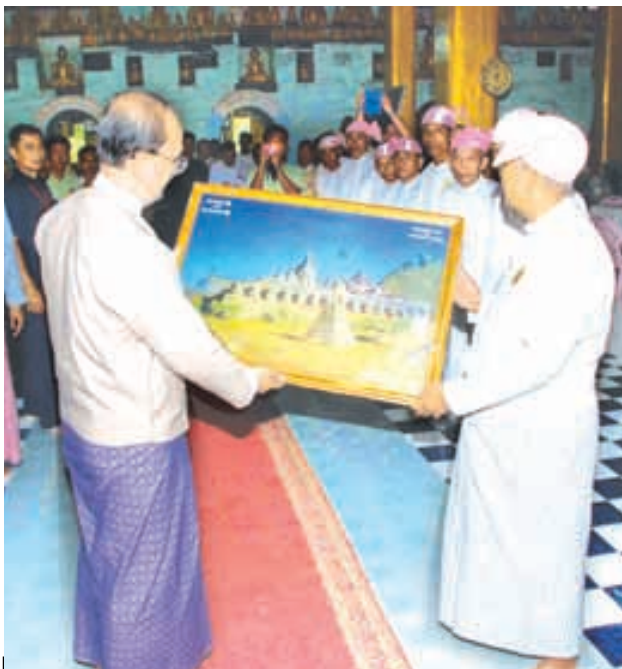
President U Thein Sein accepts a photo of historic Shitthaung (a) Yanaung Zeya Pagoda.