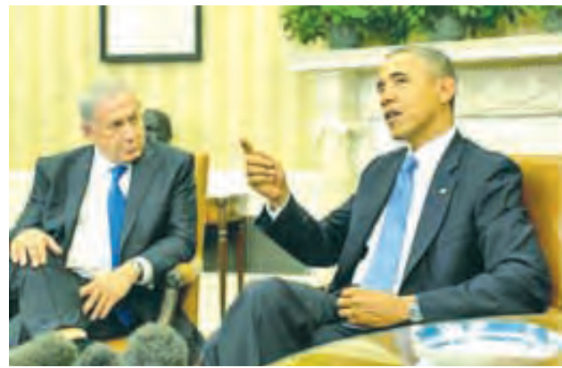
US President Barack Obama speaks alongside Israeli Prime Minister Benjamin Netanyahu in the Oval Office of the White House in Washington, on 30 Sept, 2013.

Netanyahu brandished a cartoon time-bomb in his UN speech last year to