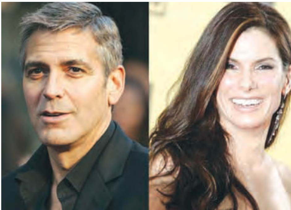
Sandra Bullock: George Clooney and I are too similar to date each other.

“I think it’s probably because we’re a little too similar, in all the disturbing ways,” she added. Bullock and Clooney recently acted in Gravity.