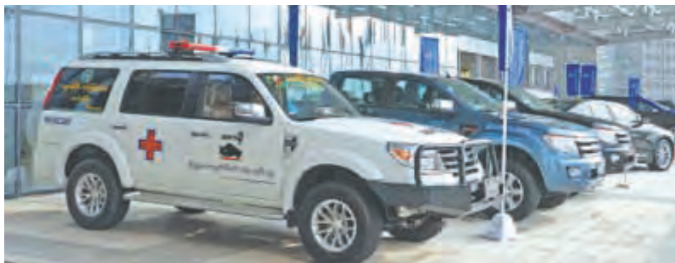
Ford cars seen in auto showroom of the Ford Motor Company at MICC.