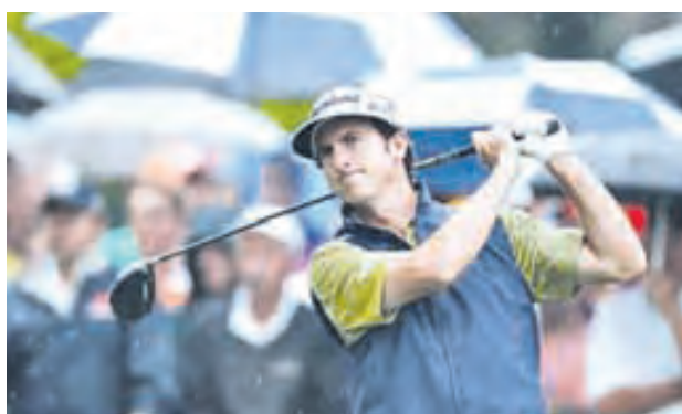
Spain's Gonzalo Fernandez-Castano tees off on the 10th hole during the second round of the 2013 PGA Championship golf tournament at Oak Hill Country Club in Rochester, New York on 9 Aug, 2013.

PARIS, 1 Oct — Spaniard Gonzalo Fernandez-Castano will replace the injured Peter Hanson in the Continental Europe team for this week's Seve Trophy near Paris, the European Tour announced on Monday.