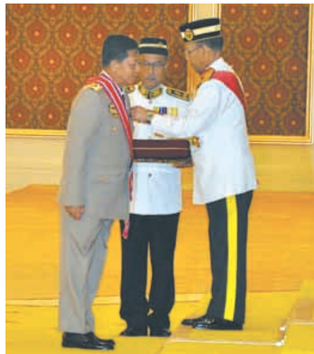
Senior General Min Aung Hlaing being conferred the Honorary Malaysian Armed Forces Order for Valour (First Degree) Gallant Commander of Malaysian Armed Forces from Malaysia.