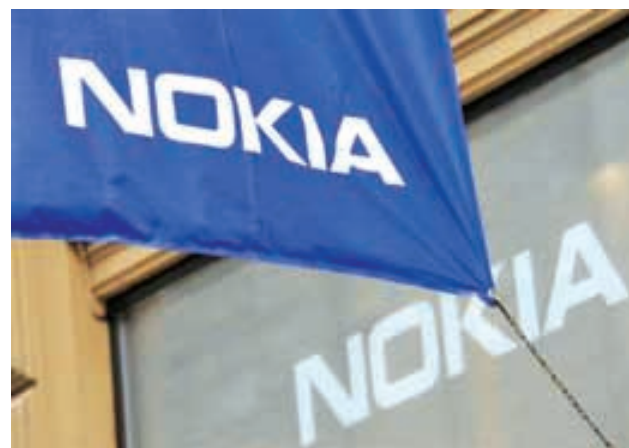
The flagship store of Finnish mobile phone manufacturer Nokia is pictured in Helsinki on 7 Sept, 2012.

"We are now talking to the authorities to clear up any lingering concerns," said the executive, declining to give details of the assets.