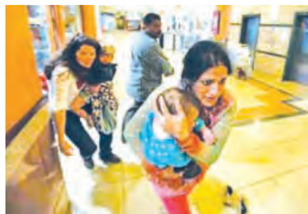
Women carrying children run for safety as armed police hunt gunmen who went on a shooting spree in Westgate shopping centre in Nairobi in this 21 Sept, 2013 file photo.

petition, sometimes caused by government efforts to curb militants, is only just beginning to be understood.