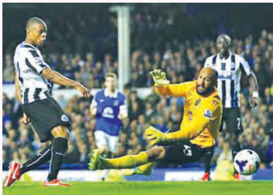
Newcastle United's Loic Remy (L) scores past Everton's Tim Howard during their English Premier League match at Goodison Park in Liverpool, northern England, on 30 Sept, 2013.