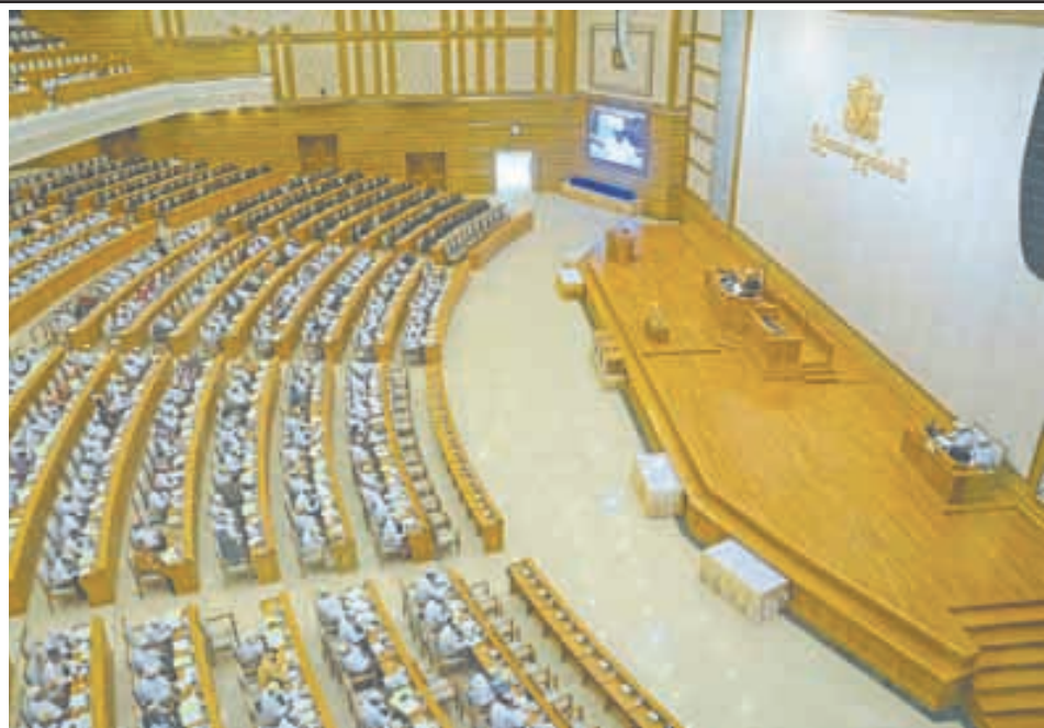
Today's session of Pyidaungsu Hluttaw in progress.