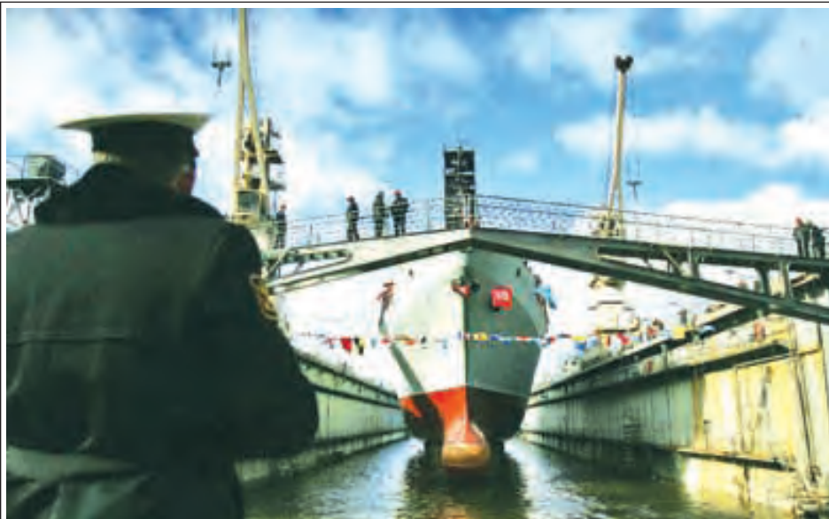
"Yuri Ivanov", the lead communications ship of Project 18280 for the Russian Navy, is seen during a launching ceremony at Severnaya Verf Shipyard in St Petersburg, Russia, on 30 Sept, 2013. The Yuri Ivanov, a Project 18280 communication ship built at the Severnaya Verf shipyard, was launched here on Monday. The ship is 95 m long and has a displacement of about 4,000 tons, and will be assigned to the Russian Navy in 2014.