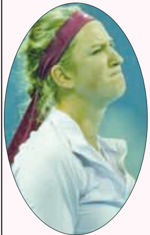
Victoria Azarenka of Belarus reacts after losing a point against Andrea Petkovic of Germany at the China Open tennis tournament in Beijing on 30 Sept, 2013.

BEIJING, 1 Oct—A deluge of double faults coupled with bad time management left Victoria