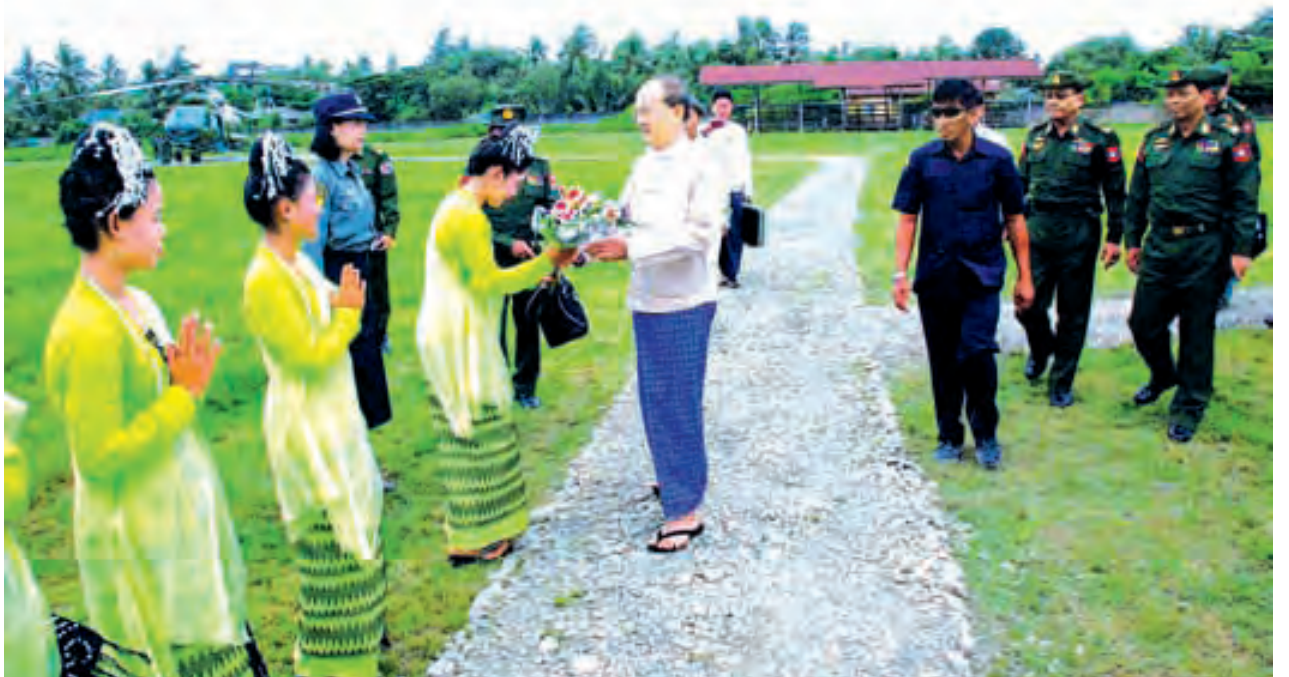
President U Thein Sein being welcomed on arrival of Maungtaung.