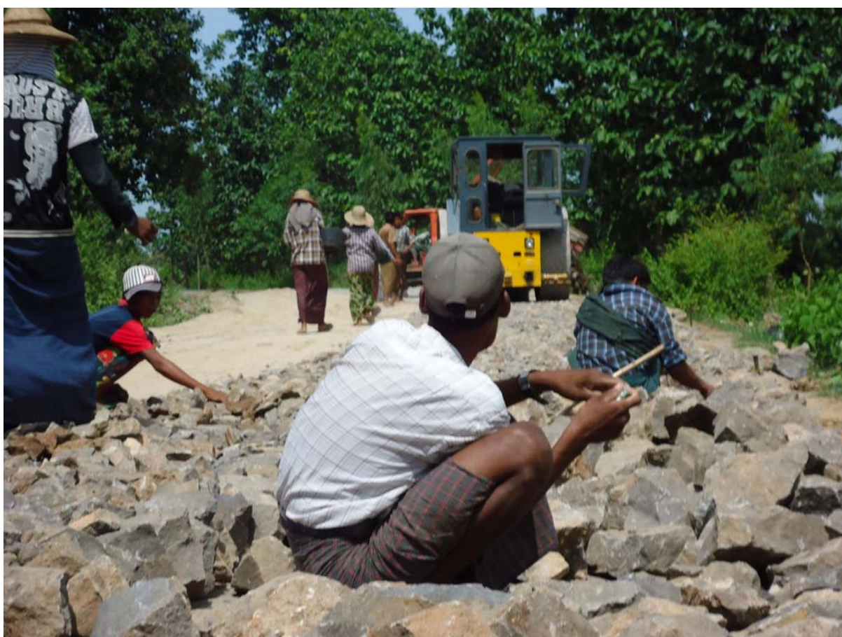
A road under construction near Alaungthaw Kathapha National Park, near Kani, Monywa. This particular road was built through a formerly protected area and will link India's Imphal City and China's Kunming.

throughout the 90s. Under the guidance of the ICC, the Cambodian-run body for developing the Angkor region—the Authority for the Protection and Safeguarding of the Angkor Region (APSARA)—secured the necessary legal framework for the hotel zone, in the form of a sub-decree in 1995, and set about purchasing the land. However, 12 years after the initial ZEMP recommendations, the project has failed to materialize. In early 2005, rather than being a space of luxury hotels and landscaped gardens, the zone is little more than a grid of roads and kilometers of wire fencing. 88