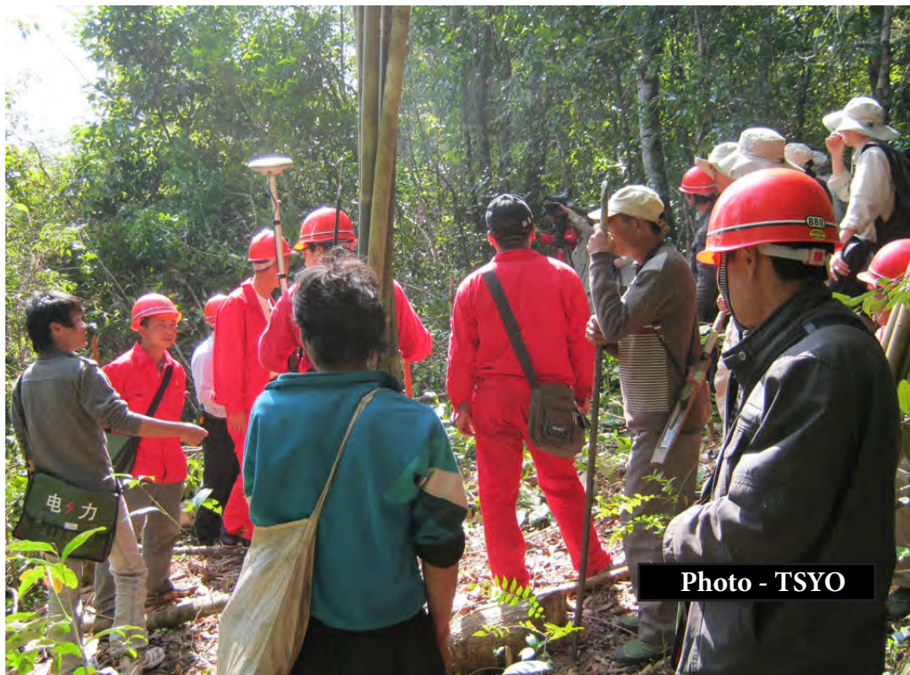
Chinese Surveyors take measurements for the pipeline project