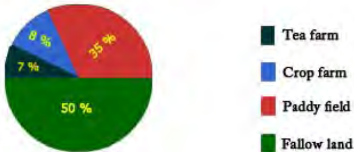
Percentages of the different types of confiscated lands

The Burmese and Chinese governments are discriminating against people in the distribution of compensation to the affected people on the China-Burma Border and in the central part of northern Shan State. Affected people such as Shan, Burmese, Kachin, and others including Chinese people in the Chinese village Nongdao across the Burma-China border are getting ¥ 50,000 per Mu and new land to work on from the Chinese government while those affected local people in northern Shan State only received about 4,461,794 Kyats for the same amount of land. 1 These payments are completely unjust as both sets of affected peoples are suffering from the same projects and the same losses but one is deemed to be more deserving of compensation than the other which is completely unjust and discriminatory.