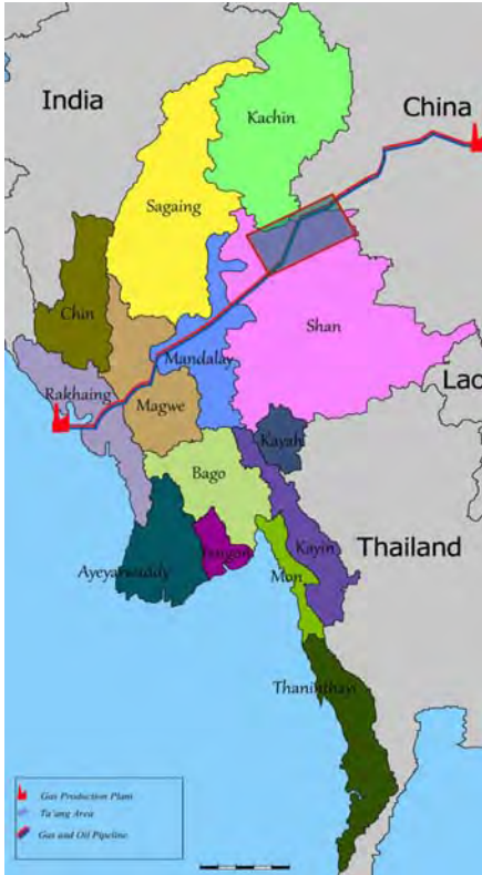
Map of Burma

The Shwe Gas and Oil Pipeline project is a large scale energy project that will span the breadth of the country as the two parallel pipelines transport natural gas and crude oil from Burma's western coast on the Bay of Bengal to Ruili in China's Yunnan Province. The massive pipelines will pass through Burma's Arakan State, Magway and Mandalay Divisions, Shan State; crossing vast mountain ranges, arid plains, rivers, jungle and many towns and villages populated by a variety of ethnic groups, like the Ta'ang people located in northern Shan State. 1