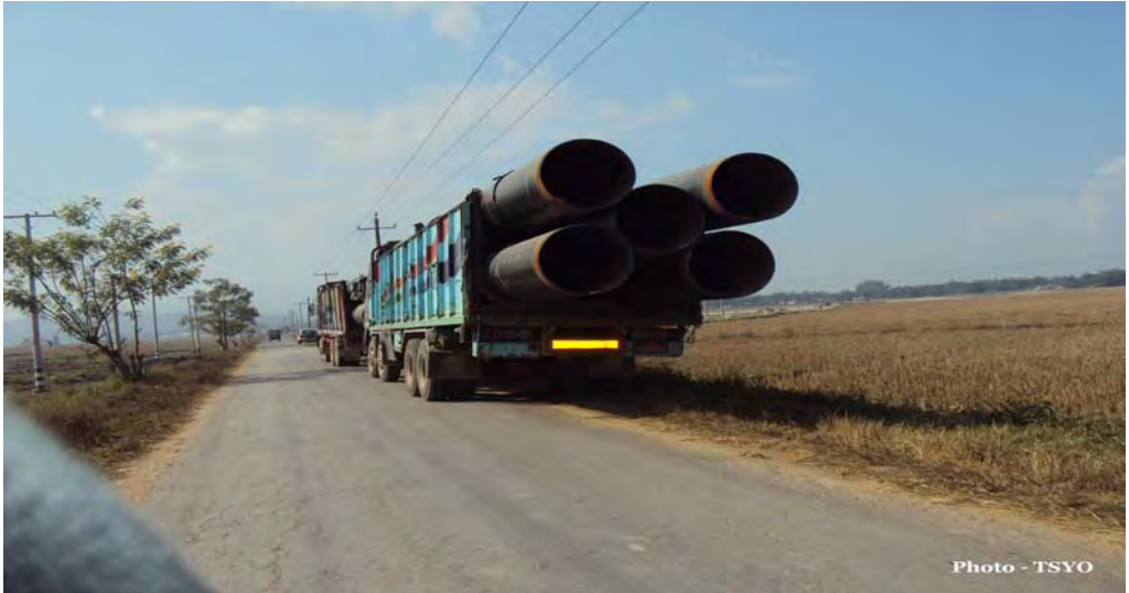
A truck carrying pipelines to the oil and gas pump installation in Nam Kham town

His body wasn't found until three days after the accident occurred. There are soldiers that are supposed to be taking security around that area but they didn't make any response to this case or even come to check out the place where the events took place. I think both the companies and the local authorities should take action for what happened to this boy but they have not, they have not even made any effort to cover the drain, it still remains open and dangerous for others. It means that they don't enact any clear rules or safety standards at their project to protect the lives of local people.” 6