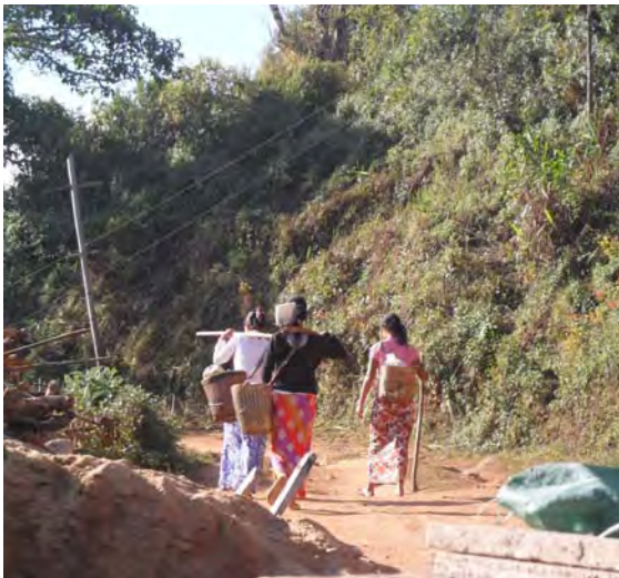
Ta'ang women going to farms

Many local women need to work for their livelihoods but the increase in military soldiers and so many instances of land being confiscated by the Chinese companies makes this very difficult. The behavior of the Chinese construction workers shows a clear disrespect for local culture and traditions and has left many Ta'ang women in fear for their safety.