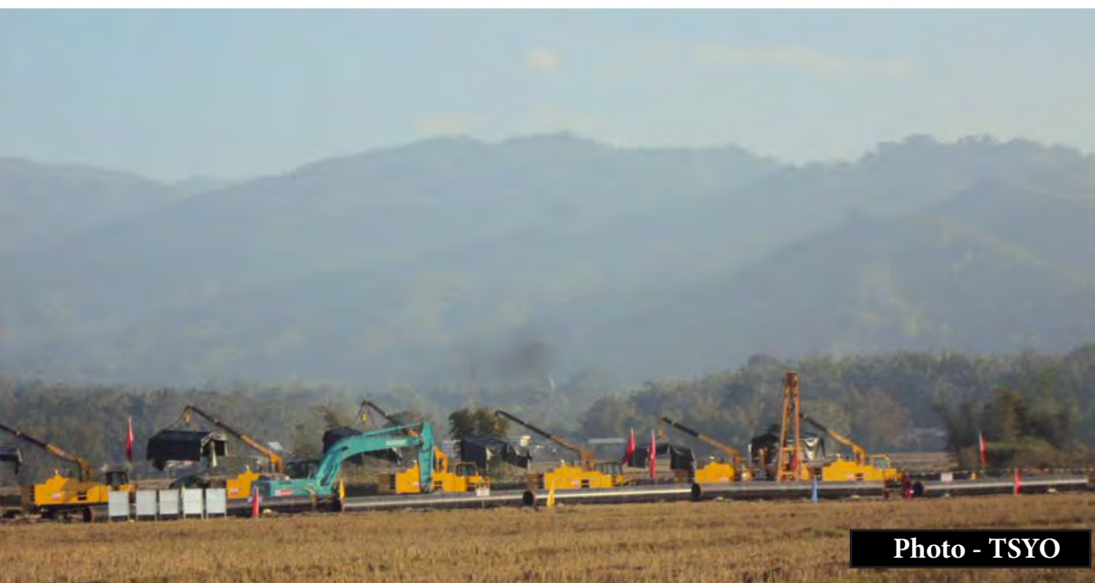
Pipeline projects visibly transects vast areas valuable agricultural land in the Ta'ang region