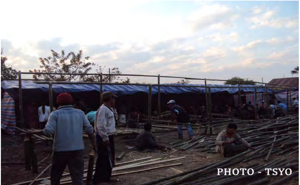
IDPs in Namkham building temporary shelters for themselves and their families

The Ta'ang National Liberation Army (TNLA) started to act in January 2011 under the PSLF in order to protect the Ta'ang people against the Burmese military as fighting encroached into Ta'ang areas leaving many people defenseless. The TNLA has been cooperating with the KIA in fighting against the Burmese Army. Fighting has been particularly intense in northern Shan State along the proposed route of the Shwe Gas Pipeline project, which cuts directly through the Ta'ang area, as the Burmese military deploys more troops to the region to take security of the pipeline sites. The fighting in this area has resulted in a dramatic increase in the amount of IDPs fleeing conflict and widespread human rights abuses in the region perpetrated by Burmese military forces especially around villages near Mantong and Namkham.