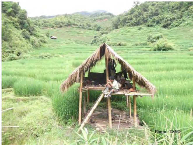
Drug addicts using narcotics in the morning on 16 September 2012 in Nam Kham town, Northern Shan state

Some people in Pan Ta Pyae village, Namtu Township can freely sell heroin and have seized the opportunity to make money due to the fact that the Chinese men have come to work there. In those areas, where the police and soldiers take responsibility for the security of pipeline, they just turn a blind eye to the open sale and use of drugs.