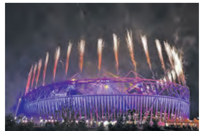
Fireworks explode over the Olympic Stadium during the closing ceremony of the London 2012 Paralympic Games on 9 Sept, 2012.

surprise and delight, British teams and athletes surpassed themselves across a range of sports, including third place in the Olympic medals' table behind the world's two great economic powers the United States and China.