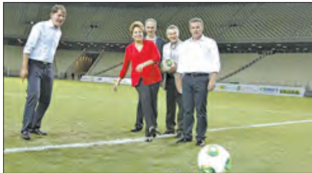
Brazil's President Dilma Rousseff (in red) kicks a soccer ball during the inauguration of the Arena Castelao in Fortaleza on 16 Dec, 2012.

opened on 21 December, they are the only stadiums to meet the December 2012 deadline set originally for next year's Confederations Cup, a World Cup finals dress rehearsal.