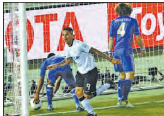
Paulo Guerrero (C) of Brazil's Corinthians celebrates after scoring a goal, past Ashley Cole and David Luiz (R) of Britain's Chelsea, during the FIFA Club World Cup final soccer match in Yokohama, south of Tokyo on 16 Dec, 2012.