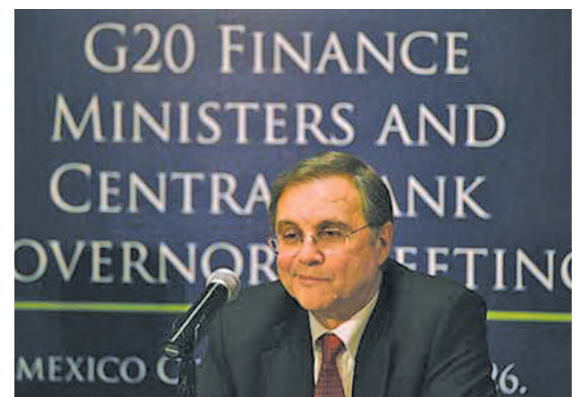
Bank of Italy Governor Ignazio Visco attends a news conference as part of Group of Twenty (G20) leading economies' finance ministers and central bankers in Mexico City on 26 Feb, 2012.