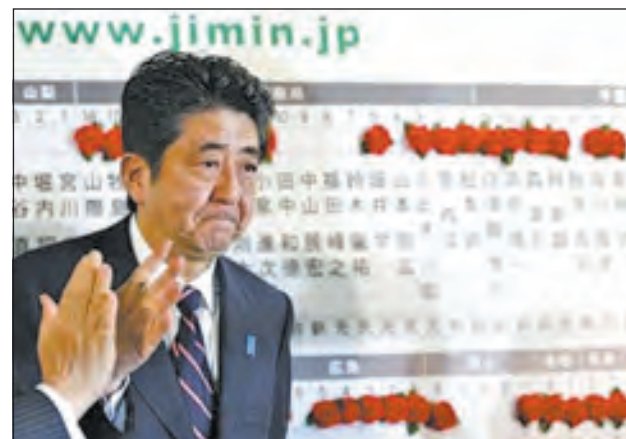
Japan's main opposition Liberal Democratic Party's (LDP) leader and former Prime Minister Shinzo Abe is applauded as he arrives at the LDP headquarters in Tokyo on 16 Dec, 2012.—XINHUA