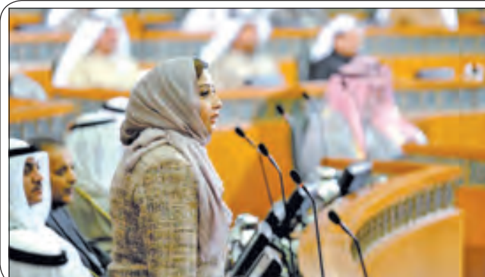
Kuwaiti Minister of Social Affairs and Labour Thekra al-Rashidi speaks at the opening of the 14th session of National Assembly (Parliament) in Kuwait City, Kuwait, on 16 Dec, 2012.

Although the White House has not accepted Boehner’s gambit, it could push negotiations away from entrenched, ideological positions.—Reuters