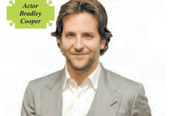
Actor Bradley Cooper

"He's been getting a cutting-edge hair-loss treatment and taking a battery of natural supplements—and he's only washing his hair every three days, with expensive organic shampoos," the source added.—PTI