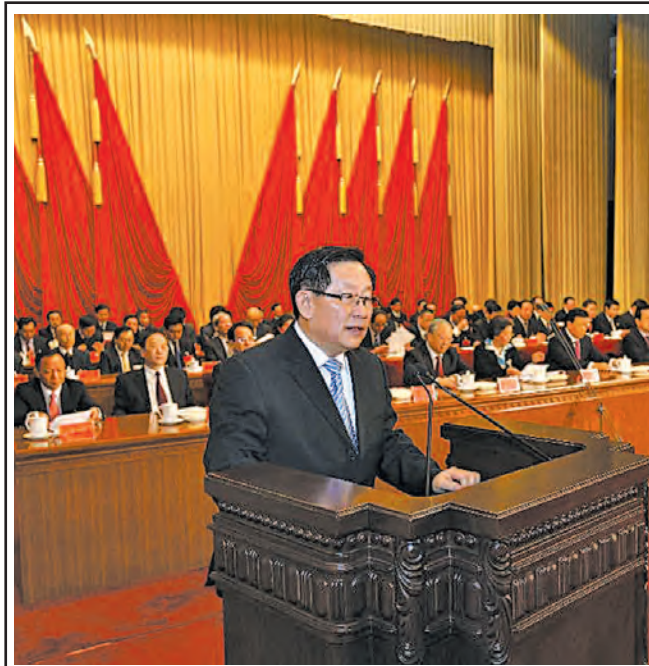
Wan Gang, vice chairman of the National Committee of the Chinese People's Political Consultative Conference and chairman of the China Zhi Gong Party, delivers a congratulatory speech on behalf of China's non-Communist political parties and the All-China Federation of Industry and Commerce at the opening ceremony of the 10th National Congress of the China National Democratic Construction Association (CNDCA) in Beijing, capital of China, on 16 Dec, 2012.