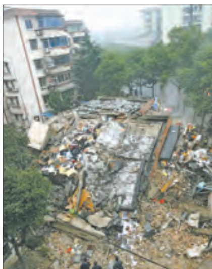
NINGBO, 17 Dec—One has been confirmed dead and