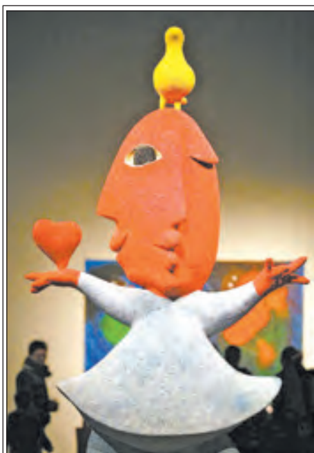
Photo taken on 16 Dec, 2012 shows a piece of sculpture of Juan Ripolles, a well-known Spanish painter and sculptor, at his exhibition “Universe Ripolles” in the Jiangsu Provincial Art Museum in Nanjing, capital of east China’s Jiangsu Province. A total of 86 artworks of Juan Ripolles were displayed at the exhibition, which kicked off on Tuesday.