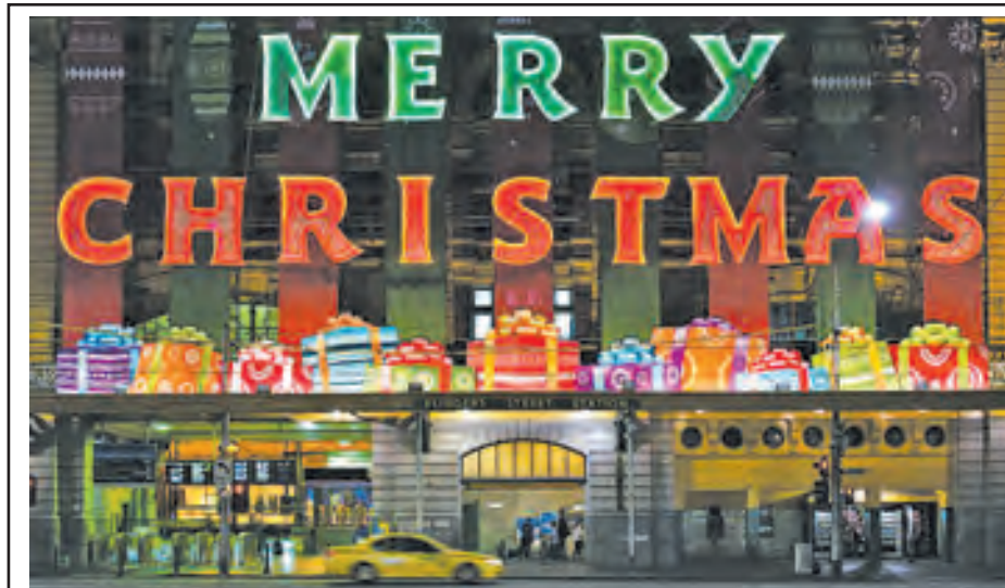
A taxi drives past the Flinders Street Station in Melbourne, Australia, on 16 Dec, 2012. Christmas Decorations are installed across the city of Melbourne to celebrate the upcoming Christmas Festival.