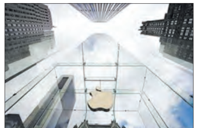
The Apple logo hangs in a glass enclosure above the 5th Ave Apple Store in New York, on 20 Sept, 2012.