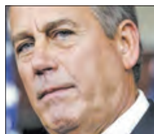
US House Speaker John Boehner (R-OH) listens to a question while speaking with reporters in the Capitol in Washington on 13 Dec, 2012.

Some lawmakers and congressional aides had