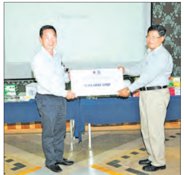
Union Minister U Soe Thein accepts cash donations.—MNA

Next, the President arrived back Dawei by helicopter.—MNA