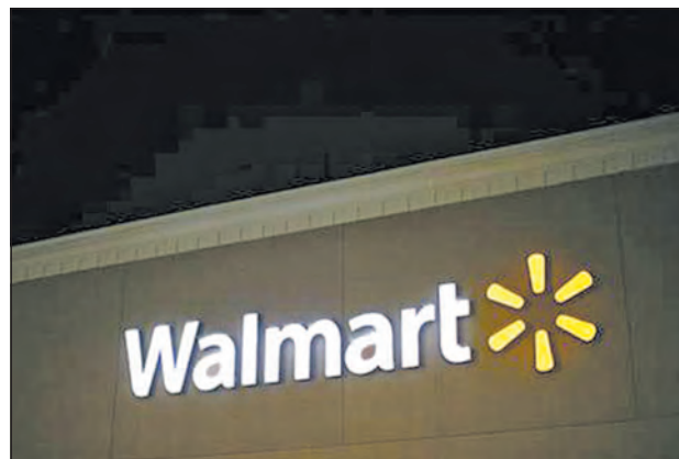
A view shows the Walmart logo at an opened Walmart store on Thanksgiving day in North Bergen, New Jersey on 22 Nov, 2012.

SAN FRANCISCO, 17 Dec—Wal-Mart Stores Inc said on Friday that it began selling Apple Inc's flagship iPhone 5 smartphone at a big discount in thousands of its stores.