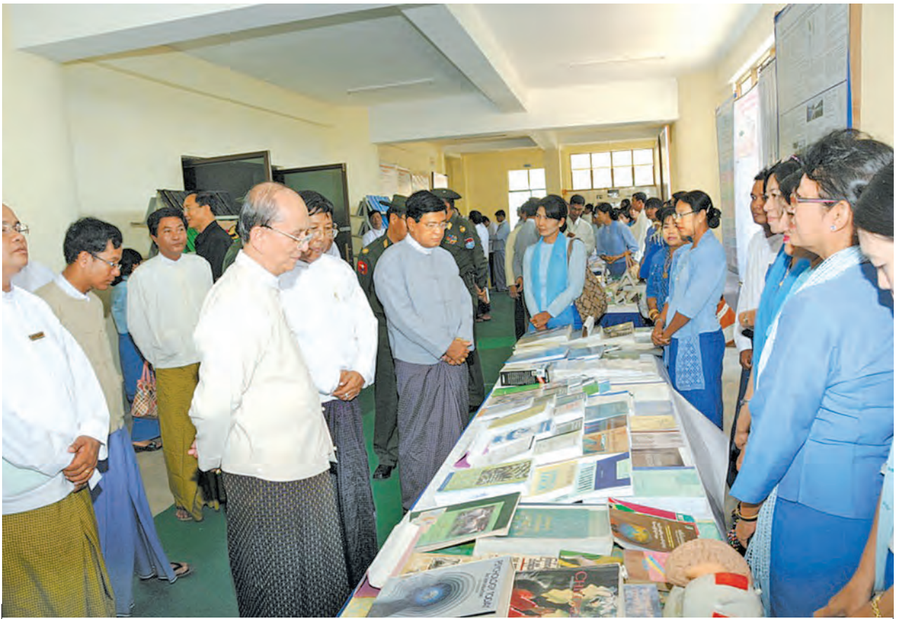
President U Thein Sein views subject-wise theses and reference books displayed at Dawei University.