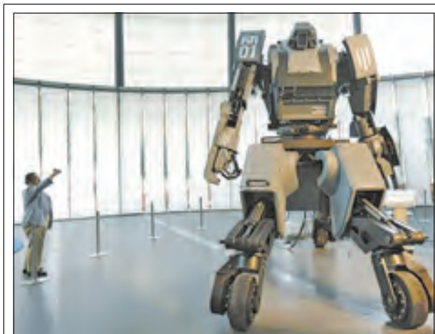
A man takes a picture of a giant 'Kuratas' robot at an exhibition in Tokyo, on 28 Nov, 2012.

The four-metre-high, limited edition, made-to-order robot is controlled through a pilot in its cockpit, or via a smartphone.