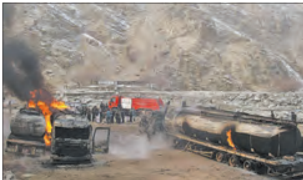
Smokes rise from burned oil tankers in Baghlan Province in the north of Afghanistan on 16 Dec, 2012.