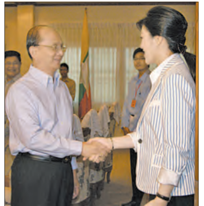
President U Thein Sein shakes hands with Prime Minister Ms Yingluck Shinawatra.—MNA

Thai Prime Minister Ms Yingluck Shinawatra and party were accompanied by the Thai ambassador to Myanmar.—MNA