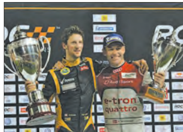
Driver Romain Grosjean (L) from Team France who won the Race of Champions (ROC) holds his trophy next to Tom Kristensen from Team All Stars, who came in second place, during the awards ceremony at the Rajamangala National Stadium in Bangkok on 16 Dec, 2012.

The annual event pits winners and champions from various motorsport series against each other over several rounds in identical machinery.