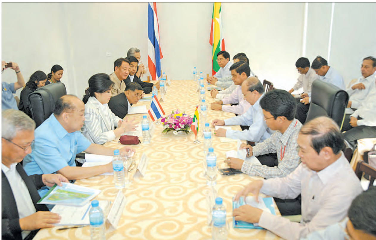
President U Thein Sein and party hold talks with Thai Prime Minister Ms Yingluck Shinawatra and party.