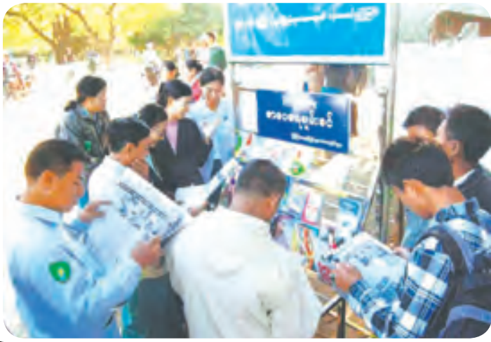
Visitors, readers and workers of bus lines reading at public service book corner opened on 3 December led by NyaungU District Information and Public Relations Department at Shwezigon bus terminal. MYANMA ALINN