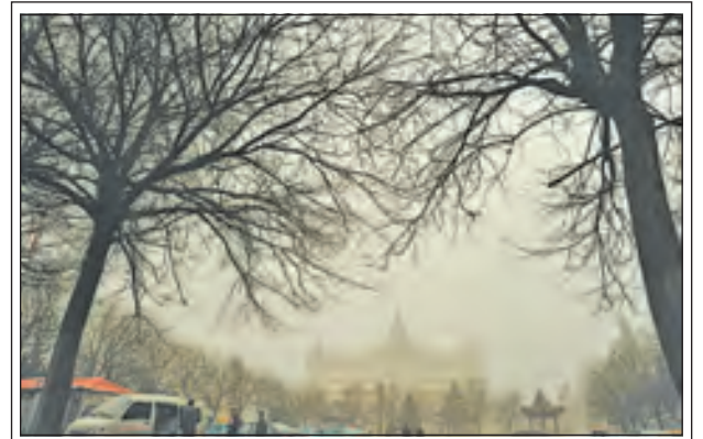
Photo taken on 16 Dec, 2012 shows the fog-enveloped Houma Railway Station in Houma City of Linfen, north China's Shanxi Province. A heavy fog hit Shanxi on Sunday.