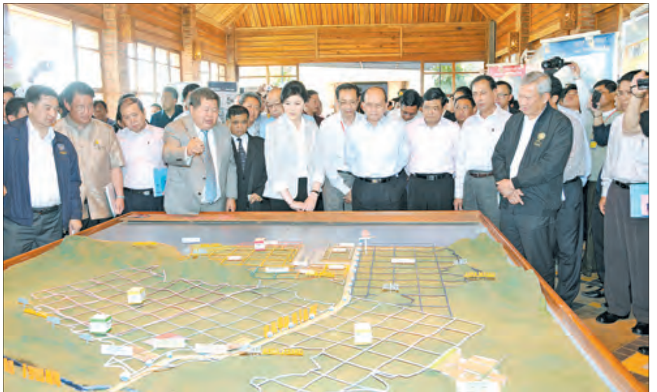
President U Thein Sein, Thai Prime Minister Ms Yingluck Shinawatra and party view scale model of Dawei Special Economic Zone Project and its related areas.

The investment of a third country must be invited in the areas as the two countries could not implement it, he said. He tipped Japan as the