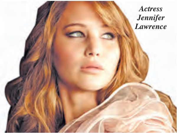
Actress Jennifer Lawrence