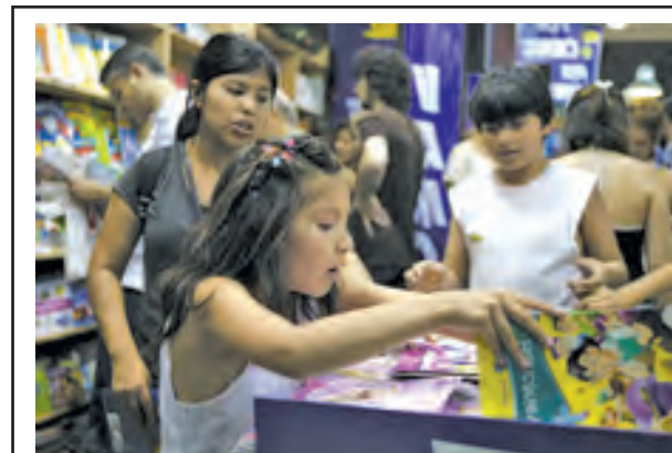
Residents visit a bookstore during the 6th Night of the Libraries event, in Buenos Aires, capital of Argentina, on 15 Dec, 2012. During the event, the city's most emblematic bars and libraries are open to the public, offering many cultural activities.