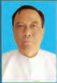
H. E. U. Htay Aung, Union Minister, Ministry of Hotels and Tourism

The Ministry of Hotels and Tourism of the Government of the Republic of the Union of Myanmar has embarked on its initial reform strategies for the tourism sector since March 2011, which included smooth entry of foreign visitors to Myanmar, enhancement towards quality service in hospitality, enhancement of standards in service providers and promotion of all year round tourism destinations.