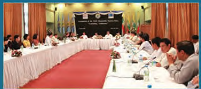
Stakeholders formulating the Responsible Tourism Policy in Nay Pyi Taw.

“Building a viable and sustainable tourism industry in Myanmar requires strong public and private sector partnerships”